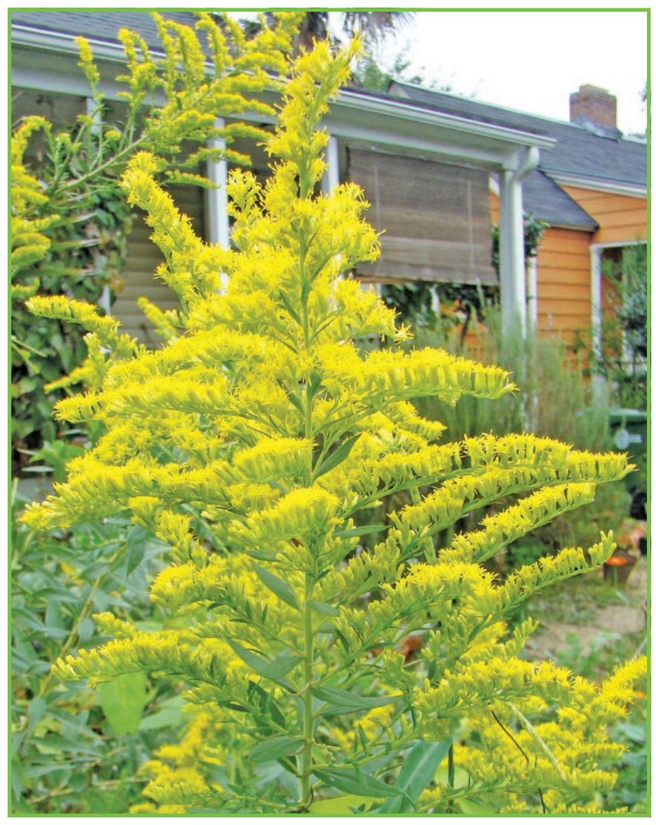
Goldenrod does not cause hay fever. Numerous species are native to Georgia and are good choices