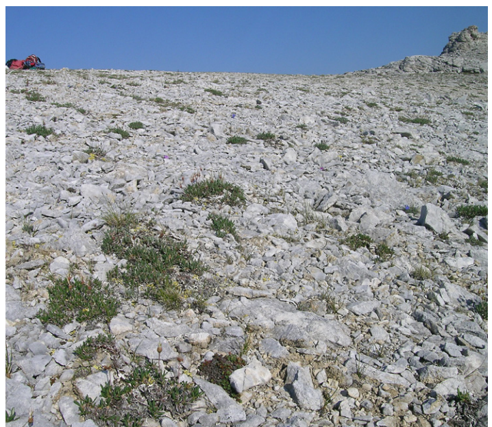
B. Bennett - YG