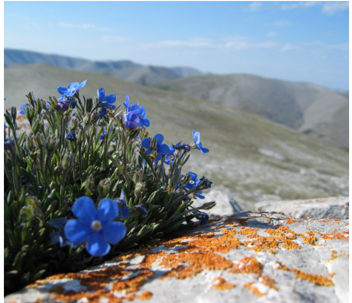
J. Line - YG

Distinguishing features: Eritrichium splendens can be distinguished from E. aretioides by its leaves with appressed hairs and larger corollas (10mm). E. aretioides has spreading hairs and smaller flowers (to 6mm). Note: this species has recently been split into 2 species E. boreale , and E. grandiflorum .