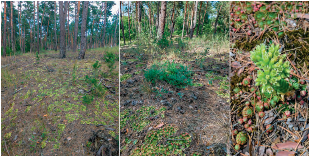
Figure 4. Ecotope and flowering of Jovibarba globifera (Khodosivka village, reserve 'Cherneckyi lis', Kyiv region).

In Latvia, Jovibarba globifera is listed as a rare species for habitats such as: 6110 (E.1.3) Rupicolous calcareous or basophilic grasslands of the Alyso-Sedion albi (all. SED-04A Alyso alyssoidis-Sedion ); 6120 (E.1.1, E.1.2) Xeric sand calcareous grasslands (all. COR-01B Koelerion glaucae , all. COR-01D Armerion elongatae Pötsch 1962, cl. COR Koelerio-Corynephoretea canescentis ) (AUNIŅŠ 2013). So, in the above-mentioned works, Sempervivum globiferum was presented in 2 classes of psammophytic vegetation, and we studied its habitat as a part of forest vegetation, although it also grows on sands.