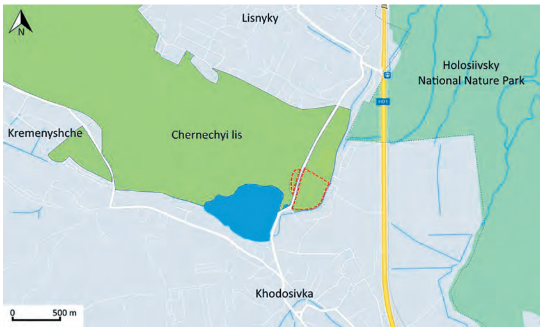
Figure 1. Location of the population Jovibarba globifera (landscape reserve 'Cherneckyi lis').

According to the materials of forest management, the identified habitats of the studied species are located within the quarter 237 of the Boyarka Forest of the SS NUBiP of Ukraine ('Boyarka Forest