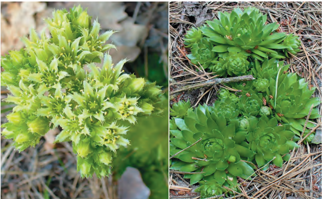
Figure 3. Jovibarba globifera in light pine forests of Polissya, Volyn.

In the southern and central part of the study area (plot 1, area 9.0 ha), a plantation of Pinus sylvestris grows (about 80 years old, average diameter 28 cm, average height within the site 22–24 m). The forest area is characterized by thinned forest stands with a density of 0.4–0.5 and by uneven location of trees in the area. The plantation showed signs of lowland forest fires of previous years (traces of burning on the bark of tree trunks) mainly in the southern, central and eastern parts of the site. Dead pine wood is available on the site. In the southern part, one dead, broken tree and a lying fragment of this tree of class II destruction were found. In the central part of the site, there are several dead trees of class I destruction. In the western part we found single dead and felled trees of Pinus sylvestris (classes I–II of destruction) with an approximate stock of 5–7 m 3 /ha; in the eastern part, the stock of dead wood is large and up to 10 m 3 /ha, formed mainly by dead trees of class I destruction. In the area we recognized natural regeneration of tree