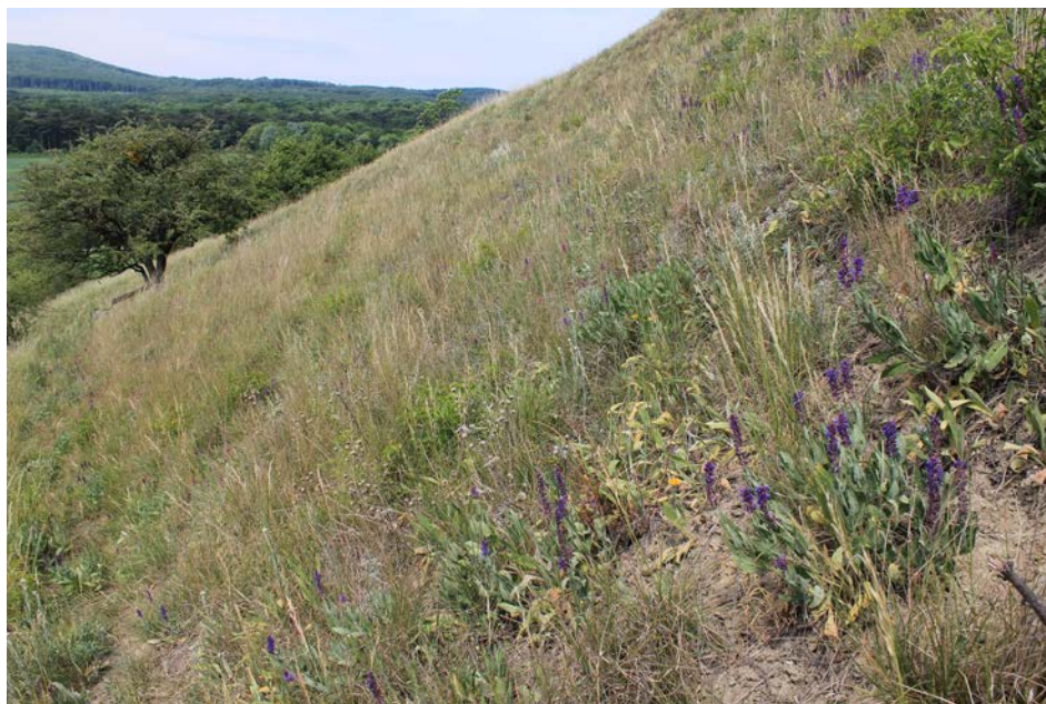
Fig. 4. Stand of the Salvio nemorosae-Festucetum rupicolae on the hill Eichkogel near Mödling (Photo: N. Sauberer, 21 May 2012).

a synonym of the latter by MUCINA & KOLBEK (1993). However, they do not mention the locality Eichkogel in their description of Astragalo exscapi-Crambetum . The numerical classification of a large supra-national data set suggested that these two communities should be treated as separate associations (DÚBRAVKOVÁ et al. 2010). Although we were not able to reproduce this result in our own TWINSpan classification (both types were mixed together in TPA clusters 23f–g, see WILLNER et al. 2013), we accept the Salvio nemorosae-Festucetum rupicolae as a separate unit because Astragalus exscapus and Crambe tataria are both indicators of disturbed sites (CHYTRÝ 2007: 425) and are absent from the majority of Pannonian loess grasslands. However, a definite solution to this question remains a task for