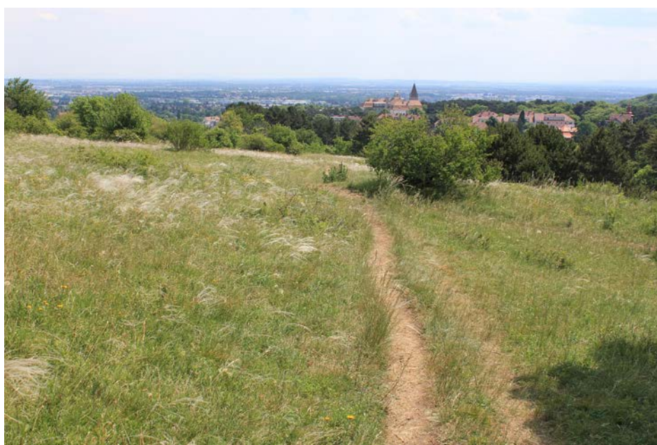
Fig. 3. Stand of the Scorzonero austriacae-Caricetum humilis near Perchtoldsdorf (Photo: N. Sauberer, 28 May 2012).

Bromus erectus 3, Carex humilis 3, Anthyllis vulneraria 2, Dorycnium germanicum 2, Galium austriacum 2, Inula hirta 2, Sesleria caerulea 2, Anthericum ramosum 1, Bupleurum falcatum 1, Genista pilosa 1, Inula ensifolia 1, Leontodon incanus 1, Phyteuma orbiculare 1, Polygala amara 1, Rhytidium rugosum 1, Scabiosa canescens 1, Thesium linophyllum 1, Abietinella abietina +, Asperula cynanchica +, Asperula tinctoria +, Avenula pubescens +, Briza media +, Campanula glomerata +, Campylium stellatum +, Centaurea scabiosa +, Chamaecytisus ratisbonensis +, Daphne cneorum +, Epipactis helleborine +, Euphorbia cyparissias +, Festuca stricta +, Gentianella austriaca +, Globularia cordifolia +, Helianthemum canum +, Helianthemum nummularium subsp. obscurum +, Hieracium pilosella +, Hippocrepis comosa +, Homalothecium lutescens +, Hypnum cupressiforme +, Linum flavum +, Linum tenuifolium +, Pimpinella saxifraga +, Plantago media +, Polygala chamaebuxus +, Potentilla incana +, Prunella grandiflora +, Pulsatilla grandis +, Sanguisorba minor +, Scabiosa ochroleuca +, Scorzonera austriaca +, Scorzonera purpurea +, Senecio jacobaea +, Seseli annuum +, Seseli hippomarathrum +, Teucrium montanum +, Thymus praecox +, Tortella tortuosa +, Vincetoxicum hirsutinaria +.