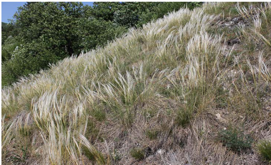
Fig. 2. Stand of the Fumano-Stipetum eriocaulis in the nature reserve “Glaslauerriegel-Heferlberg” near Gumpoldskirchen (Photo: N. Sauberer, 20 May 2012).

On south-facing rocky outcrops, pioneer grasslands can be found, which were described as subassociation (1.2a) Fumano-Stipetum minuartietosum setaceae by KARRER (1985a). This unit, which is only known from two localities (Mödlinger Klause, Hauerberg near Bad Vöslau), was included in TPA cluster 7. Differential species against the typical subassociation (1.2b) are: Seseli austriacum , Hieracium glaucum , Euphorbia saxatilis , Minuartia setacea , Cardaminopsis petraea , Aethionema saxatile , Biscutella laevigata , Erysimum sylvestre .