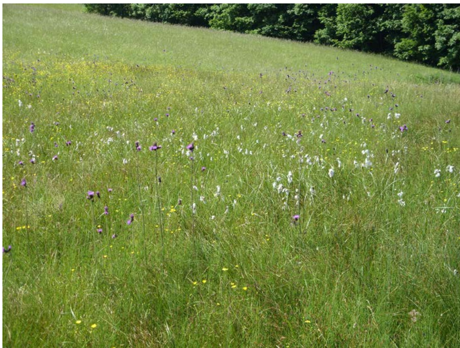
Fig. 10. Meadow with a strong moisture gradient and three different associations: Caricetum davallianae (in the foreground, with the hairy inflorescences of Eriophorum angustifolium ), Cirsietum rivularis (the narrow strip with the yellow flowers of Ranunculus acris ) and Filipendulo vulgaris-Brometum (on the slope behind) (near Wolfsgraben, Photo: W. Willner, 6 June 2010).

In contrast to the previous association, nutrient-rich wet meadows of the Calthion are still relatively widespread in the Vienna Woods. The most characteristic species of these meadows is Cirsium rivulare (total cover 13%). The soil has a good water supply throughout the year, without pronounced phases of drought. Other conspicuous plants of this grassland type are Trollius europaeus and Dactylorhiza majalis , which make the stands very attractive during flowering time. The Cirsietum rivularis corresponds to the TPA clusters 35 p.p. and 54.