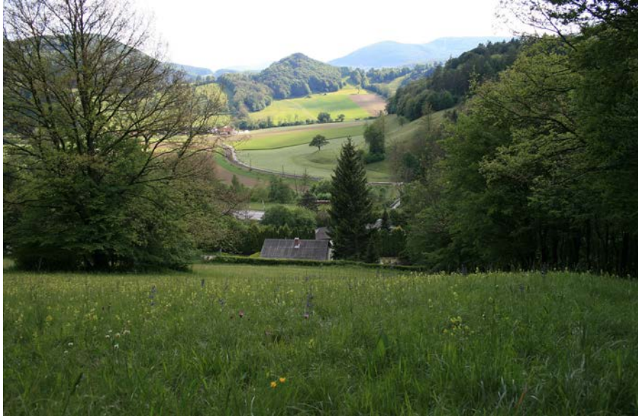
Fig. 7. Stand of the Euphorbio verrucosae-Caricetum montanae in Altenmarkt an der Triesting (Photo: N. Sauberer, 18 May 2012).