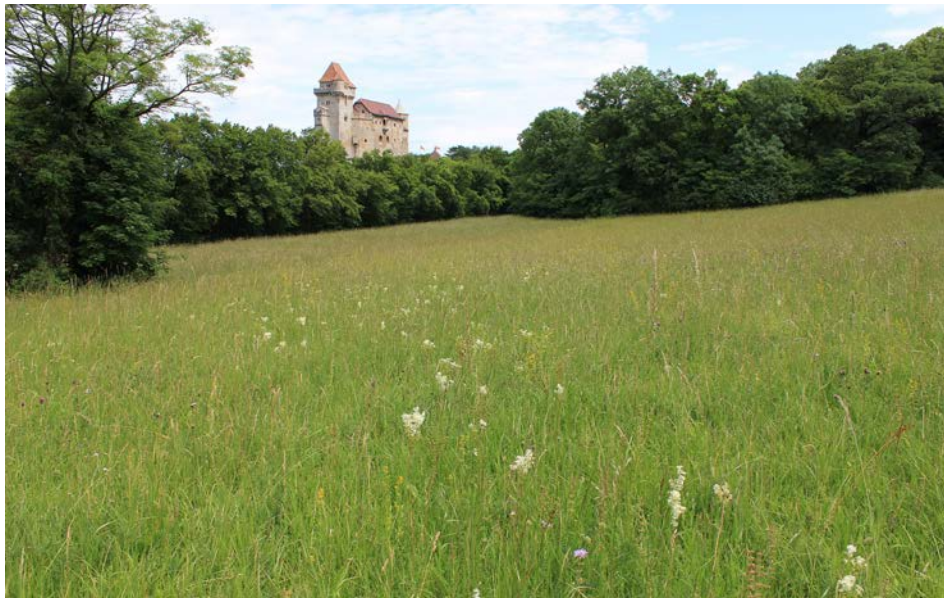
Fig. 6. Stand of the Filipendulo vulgaris-Brometum in Maria Enzersdorf (Photo: N. Sauberer, 8 June 2012).