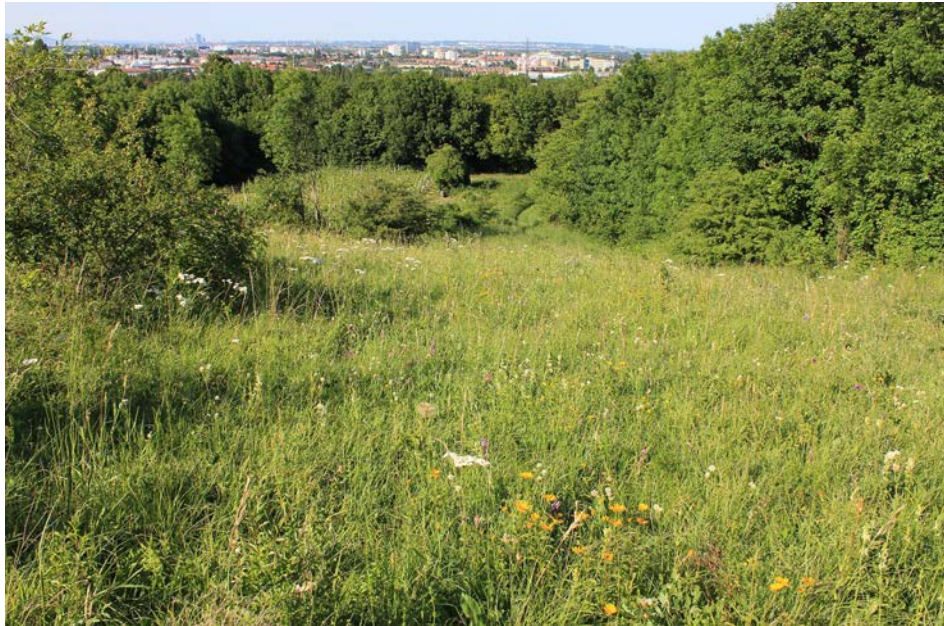
Fig. 5. Stand of the Polygalo-Brachypodietum on the hill Eichkogel near Mödling (Photo: N. Sauberer, 7 June 2012).