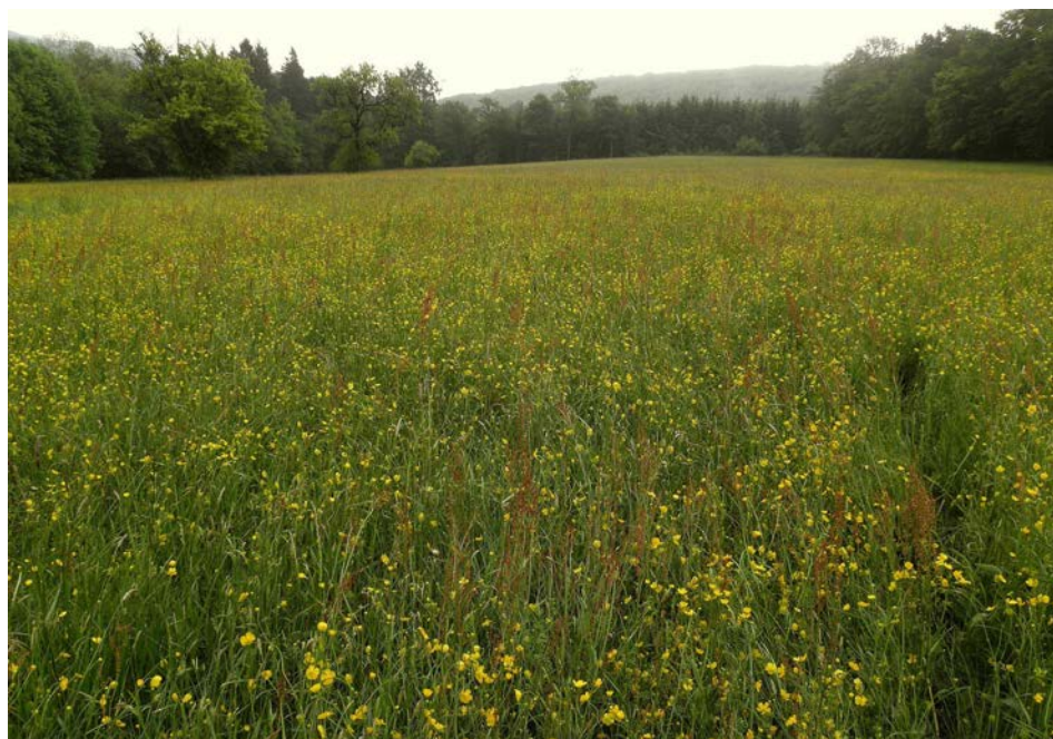
Fig. 9. Stand of the Ranunculo repentis-Alopecuretum pratensis near Mauerbach (Photo: M. Staudinger, 22 May 2010).

In meadows on intermittently wet soils (i.e., with longer wet and short dry phases), Arrhenatherum elatius is usually absent, and Alopecurus pratensis is the dominant grass species (total cover: 20%). Occasionally, Poa trivialis (total cover: 8%) or Holcus lanatus (total