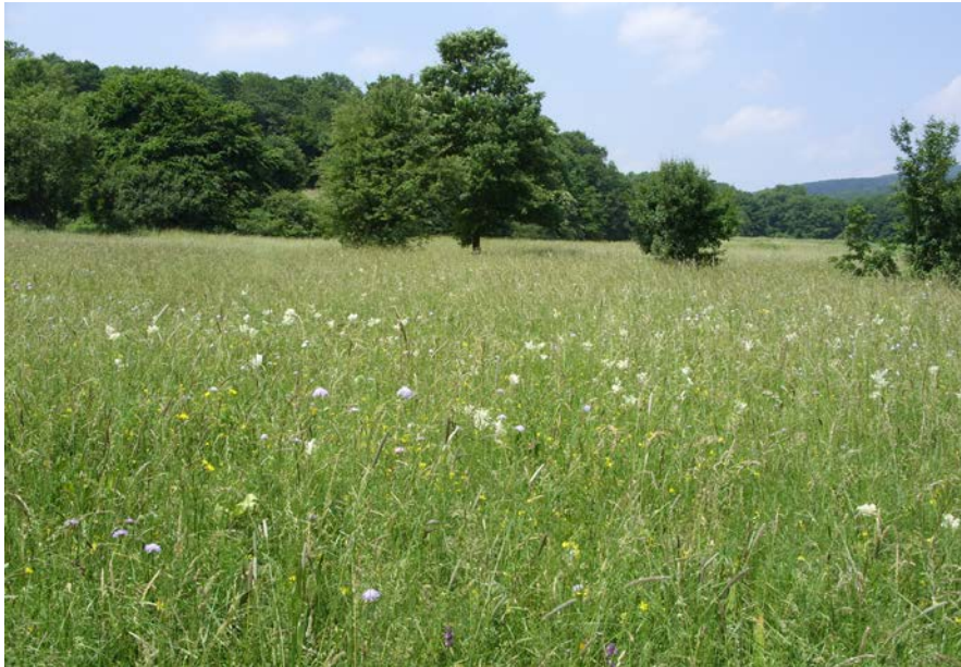
Fig. 8. Stand of the Filipendulo vulgaris-Arrhenatheretum in the Gutenbach valley, Vienna (Photo: W. Willner, 12 June 2010).