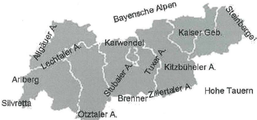
Fig. 4. Important mountain ranges in the North Tyrol and neighboring regions. The Steinberge (1) comprise the Loferer (Northern range) and the Leoganger Steinberge (Southern range).

In the context at hand it is of special interest to focus on the 94 taxa currently listed as regionally extinct (RE) in North Tyrol. At least seven of these taxa [ Alopecurus myosuroides HUDS., Bupleurum rotundifolium L., Galega officinalis L., Rosa majalis J. HERRM., Silene armeria L., Vicia casubica L., and Vulpia bromoides (L.) GRAY] have been reported only as rare casuals or garden escapes for North Tyrol and should therefore be completely removed from the Red List. From the remaining 87 taxa listed as extinct in the North Tyrol, 28 are belonging to the notoriously difficult (and therefore generally data deficient) apomictic genera Hieracium (20 taxa) and Rubus (8 Taxa), thus leaving 55 non-apomictic taxa currently listed as extinct for North Tyrol.