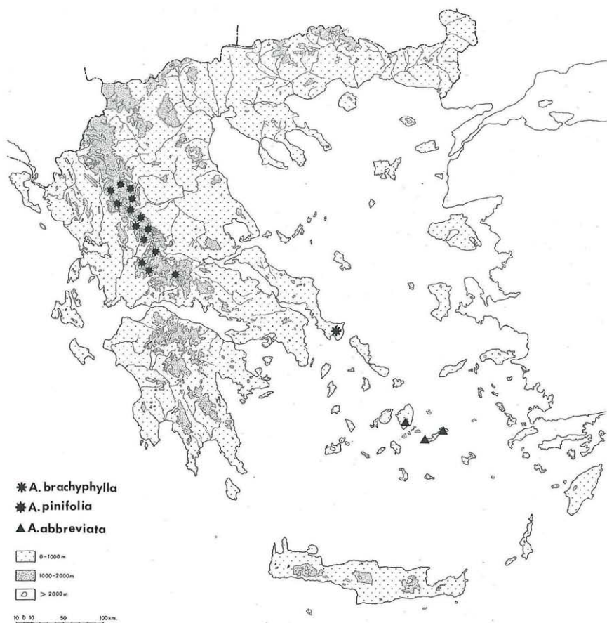
Fig. 3. Total geographical distribution of Asperula brachyphylla , A. abbreviata and A. pinifolia .

erature. However, A. pinifolia can easily be distinguished from A. brachyphylla as it has a more robust habit, glabrous or very shortly scabrid stems, with densely crowded whorls of relatively long (9–14 mm), shining leaves, longer corollas (6–10 mm long) and fruits (2.0–2.5 mm long) (see Table 1).