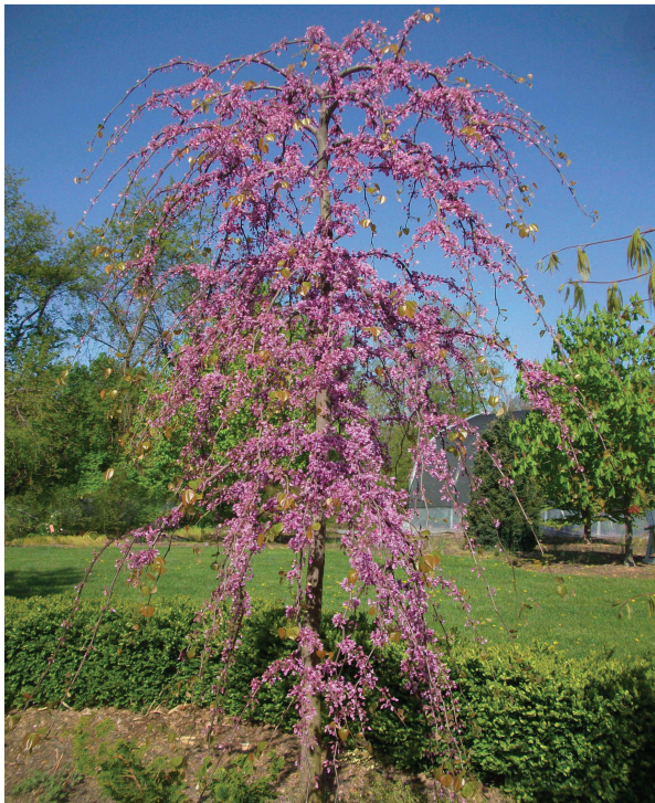
CERCIS CANADENSIS 'PINK HEARTBREAKER'® SEE PAGE 4