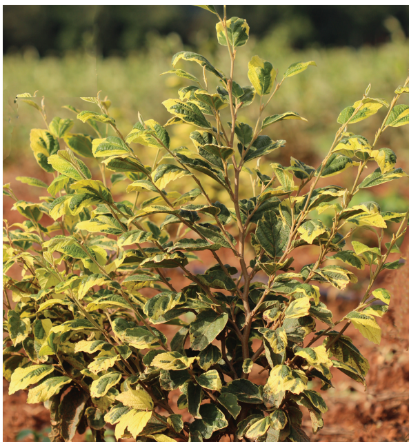
Little Prospect Witch Hazel Our own introduction selected for its outstanding variegated foliage. Dark green leaves margined with a vivid lemon-yellow. Foliage is about half the size of the species. Short internodes allow for dense branching on this distinctly upright pyramidal grower. Faintly scented yellow flowers in abundance. Foliage holds up well in our heat.

“Because of your regret and pity for My suffering, never again shall the dogwood tree grow large enough to be used as a cross. Henceforth it shall be slender and bent and twisted and its blossoms shall be in the form of a cross . . . two long and two short petals. And in the center of the outer edge of each petal there will be nail prints, brown with rust and stained with red, and in the center of the flower will be a crown of thorns, and all who see it will remember . . . that it was upon a dogwood tree I was crucified and this tree shall not be mutilated or destroyed, but cherished as a reminder of My death upon the cross.”