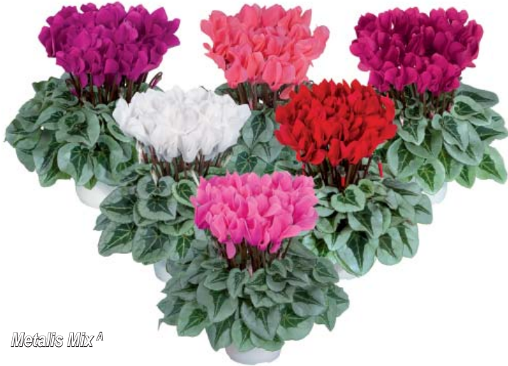
Metalis Mix A