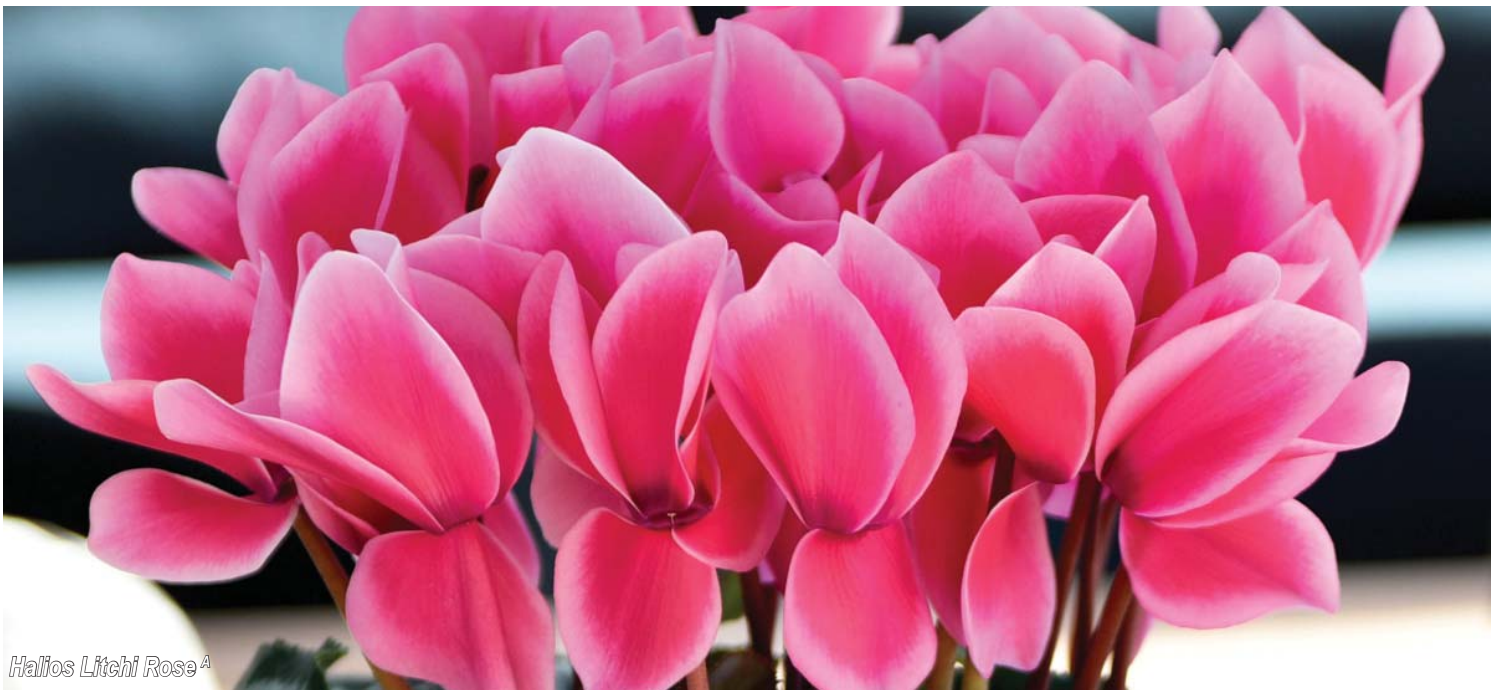
Halios Litchi Rose A