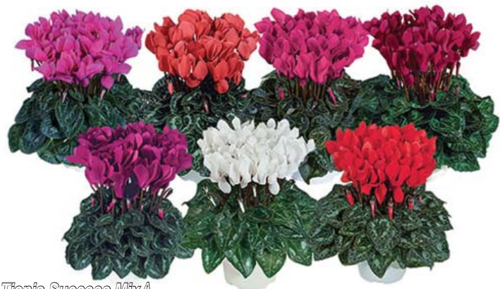
Tianis Success Mix A

Tianis produces an abundance of long-lasting flowers on compact, uniform plants. Great for outdoor plantings. The new Success Mix provides synchronized flowering across all 7 colors: Deep Magenta, Deep Rose, Deep Salmon, Purple, Rose, Scarlet Red and White. Nice in 4-5" pots. Finish 4" pots from our 72s in 12-14 weeks. (105, 72)