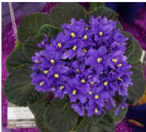
Narelle Queen of the Show and Princess of Standards (J. Bateman)