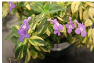
Streptocarpella 'Lime and Lemon'

Streptocarpella saxorum has wonderful cultivars and is one of my favorite plants. It has cute, velvety, deep-green leaves, and dainty flowers that hang from long stems and almost look like a cloud of butterflies flocking around the plant. There are many cultivars, one of the most common of which is Concord Blue. The different varieties available vary in the size of the flowers and the shade of blue from violet to deeper blue, light and darker blue. There are also white cultivars. Some are purely white, others are very pale blue or are white with fringes of blue. There are also variegated forms, like 'Lemon and Lime'. The wild form is somewhat smaller leaved, more of a lavender flower colour, and I am still waiting to see how well it blooms (it's almost blooming size). So far it seems to me to be a shy bloomer. The commonly sold cultivars are heavy bloomers and put on a wonderful display.