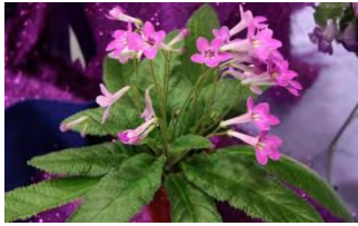
Mini Strep x Crimson Rouge