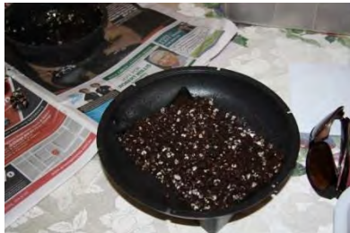
Pre filling the larger Shum Bowl