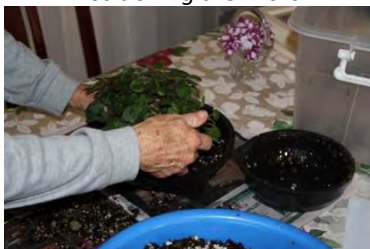
Placing the plant