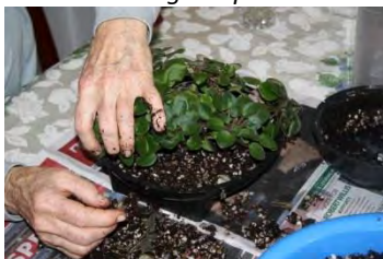
Topping with new potting mix