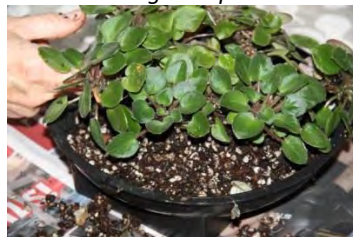
Ready to grow into a beauty