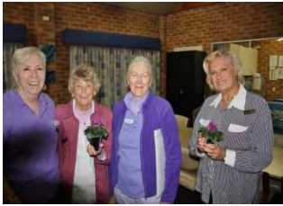
President and Secretary presenting special guests with a gift each