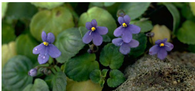
Saintpaulia Magungensis var Minima

In 1954, the following Trailers were exhibited: 'Sky Trailer', was a soft pale gray-blue plant with double flowers. 'Royal Blue Trailer' had deep purple flowers and attractive green foliage with red reverse. It had single to semi- double blossoms with a bright yellow eye. 'Snow Trailer' had glistening white blossoms of good form and size, sometimes lightly tinged in blue. 'Star Trailer,' had blue two-tone blossoms. Some of these varieties are still available today. The Trailers had been overlooked and with the lack of public response they decided to "scrap" the idea of a Trailer and to move on to other hybridising pursuits.