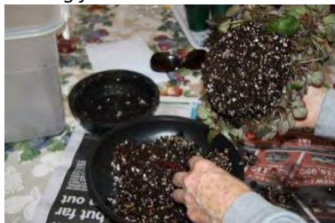
Positioning the wicks