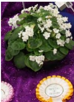
Princess of Trailers 2017 Jay's Icecastle (A. LaRosa)