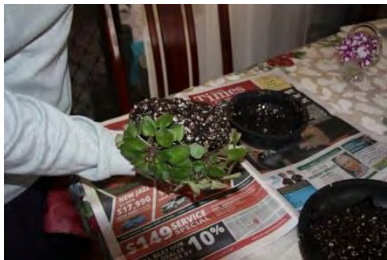
Removing from the medium Shum Bowl

Potting on a Trailer is no different to potting on an African violet except for using a Shum Bowl. There are several size Shum bowls, small, medium and large. There is no real standard size of pot however, it is the rule of thumb that when starting off the normal progress from a leaf or plantlet is to use a small container.