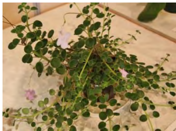
Streptocarpella 'Pee Wee'

Streptocarpella saxorum has wonderful cultivars and is one of my favorite plants. It has cute, velvety, deep-green leaves, and dainty flowers that hang from long stems and almost look like a cloud of butterflies flocking around the plant. There are many cultivars, one of the most common of which is Concord Blue. The different varieties available vary in the size of the flowers and the shade of blue from violet to deeper blue, light and darker blue. There are also white cultivars. Some are purely white, others are very pale blue or are white with fringes of blue. There are also variegated forms, like 'Lemon and Lime'. The wild form is somewhat smaller leaved, more of a lavender flower colour, and I am still waiting to see how well it blooms (it's almost blooming size). So far it seems to me to be a shy bloomer. The commonly sold cultivars are heavy bloomers and put on a wonderful display.