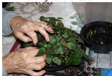
Filling the space