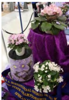
African Violet Championship Group Star Turn, Little Pro & Jay's Icecastle