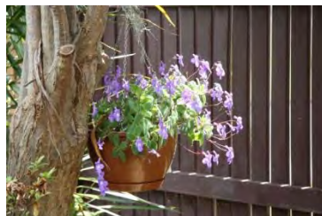
Growing under a Yucca in the Northern facing side of our property

To keep flowering well indoors, it should have bright light away from direct sunlight. Outdoors, morning sun is fine. It's great in a pot or hanging basket on a patio and does best in an area that's frost-free. It likes humus-rich, moist soil and can be propagated by tip cuttings in spring and summer.