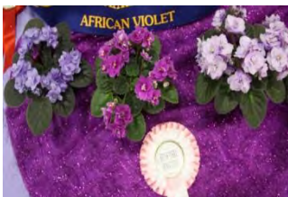
Colleen M c Cormick Trophy