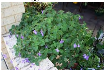
Growing in a medium tub on the Patio

In the same family as the African violet, the Streptocarpella is a perennial evergreen with lots of showy hanging flowers, hence the common name Nodding Violet. The leaves are small, dark green and fleshy. The flowers are clusters of small, tubular, soft mauve blooms. The Streptocarpella grows to 30cm although in the right conditions it can be a lot bigger.