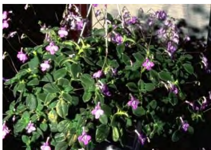
Streptocarpella Concord Blue

Streptocarpella saxorum originates from Tanzania and Kenya. It is a tropical plant though it seems to enjoy cooler environment around 18° Celsius. This plant is frost sensitive. It belongs to the Gesneriad family and is an African violet relative, even called false African violet. The growing conditions are almost the same as for African violets. This plant grows to about 30cms in and makes a wonderful hanging basket plant. Once it reaches a decent size this plant is ever blooming. Streptocarpellas seem to do better kept in a cooler place. From my personal observations it seems to flower better when the temperatures are a bit on the low side. Pruning disrupts the flowering, but sometimes it's needed.