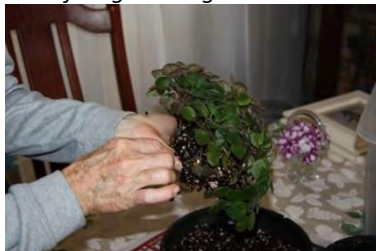
Teasing out the roots