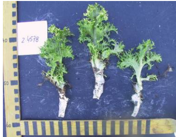
2 semi flabellate