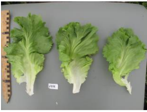
1 absent or very shallow