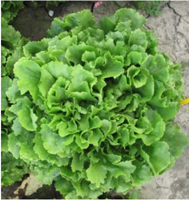
1 absent or very weak