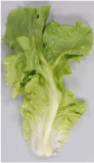
1 absent or weak