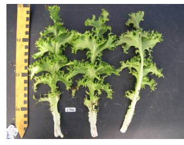
9 very broad