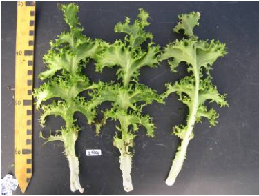
1 not flabellate