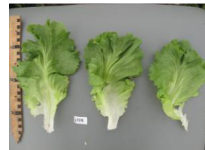
5 broad obovate