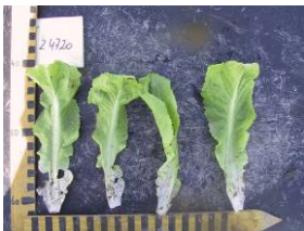
1 narrow obovate