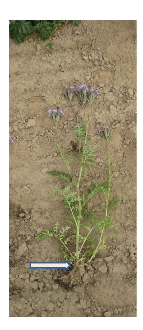
1 absent or weak