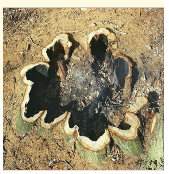
Stump of an oak pollard showing 10 natural columns

At a Royal Forestry Society meeting, somewhere in Hampshire, the group stood at the junction of several rides beneath an incredibly large, multi-stemmed sweet chestnut at its centre. Much discussion focused on whether the tree was a coppice or a bundle plant? Looking at the surrounding extensive coppice stands, it was thought by many that it must be a lapsed coppice until an old forester spoke up and said it WAS a bundle, planted with the aim of drawing in the deer when it produced fruits. If anybody knows this tree, I would love to visit it again.