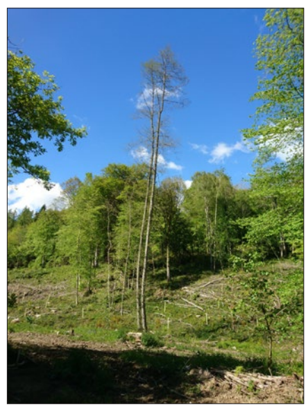
The rather vulnerable looking new champion alder ( Alnus glutinosa ) at Croft Castle

exceptionally tall native trees had never been measured but has recently been drastically thinned by the National Trust. Rob's finds included a new champion Alder (Alnus glutinosa), 34m tall but now left very exposed. A rarer record of Rob's was an 18.4m Sorbus croceocarpa in Darlington's East Cemetery; this service crops up now and again both in urban parks and as a selfsown 'wild' tree, though no-one has ever worked out where it originated.