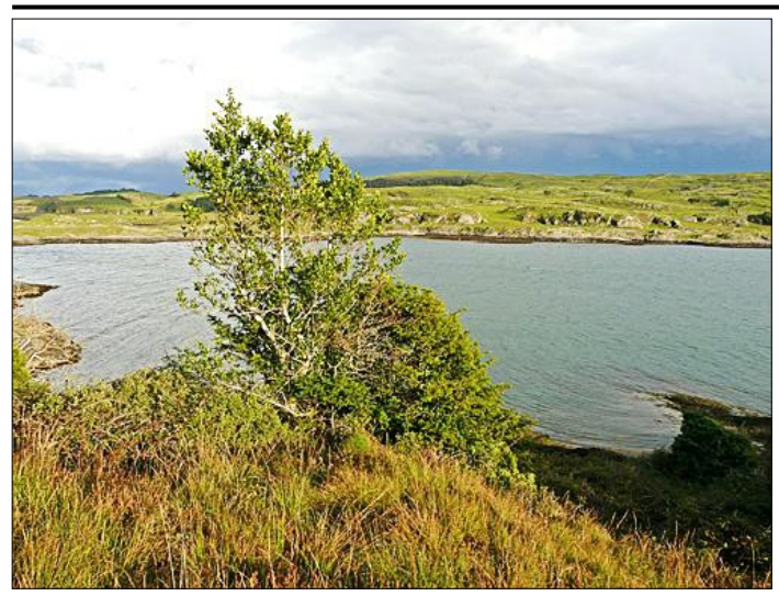
Second section of yew, showing the beach below the cliff on Bernera

As time was at a premium, both to recross the tidal narrows and then drive to reach the ferry back to the mainland, Bob had suggested he left to retrace our steps and then divert to reach the shoreline beneath the cliff, so we could obtain an assessment of the site from below as well as above. Although the area at the base of the cliff is surrounded to some distance by thick undergrowth, he could confirm what looked like a trunk was growing from the cliff and the bushes were the tops of stems and not separate trees. The yew is historically described as growing from a cliff overhanging a level area leading to the shoreline. Nearby was a shingle beach where boats could be easily drawn up and the topography of the site fits this description exactly. The fact that both stems are female, suggesting they are the same tree, is more supporting evidence that this was what we were looking for - St Columba's Yew but also the Holy and Noble Yew of Bernera.