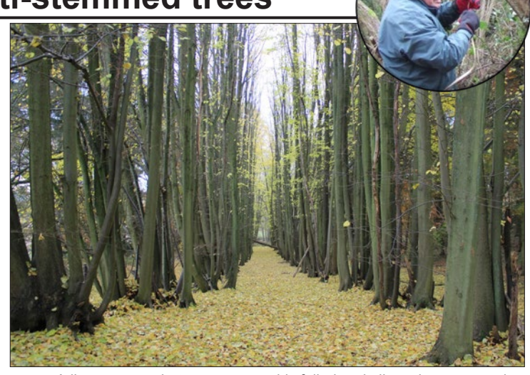
A lime avenue that was presumably felled and allowed to re-grow, in Sunninghill Park, Berkshire.

As with apples and other fruits, we have varieties of sweet chestnut with different qualities such as sweetness, storage or cooking, which may have influenced the type of tree that was planted. Later this would have included grafting scions of a different variety or varieties onto a single stock tree.