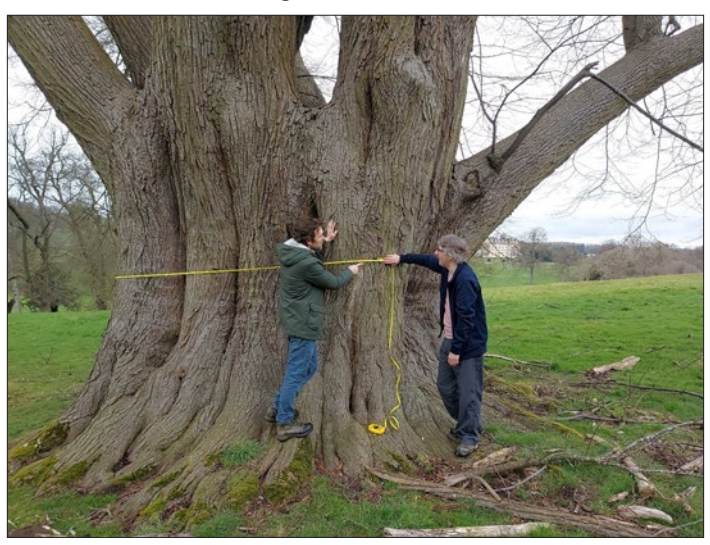
Kevin Stanley (right) and Oliver Newham with the 9.5m Broad-leaved lime ( Tilia platyphyllos ) in the park at Stoke Rochford

Gold' in the middle of Tattershall, for the unusual poplar Populus x jackii in a line near the Castle at Bourne, and to be confirmed when it flowers – for the Double-flowered Wild Cherry ( Prunus avium 'Plena') on a verge in Bottesford, 370cm girth at 1m.