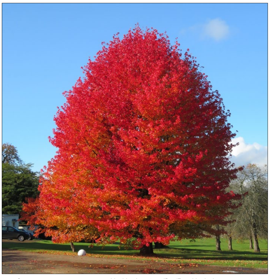
Liquidambar styraciflua 'Royal Lodge'