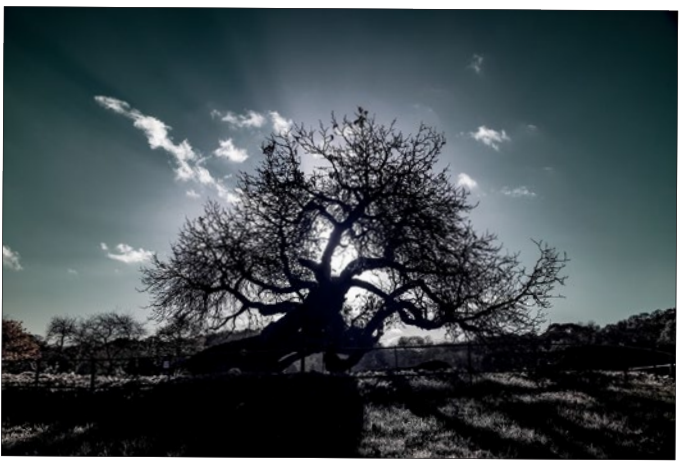
The mulberry in 2021