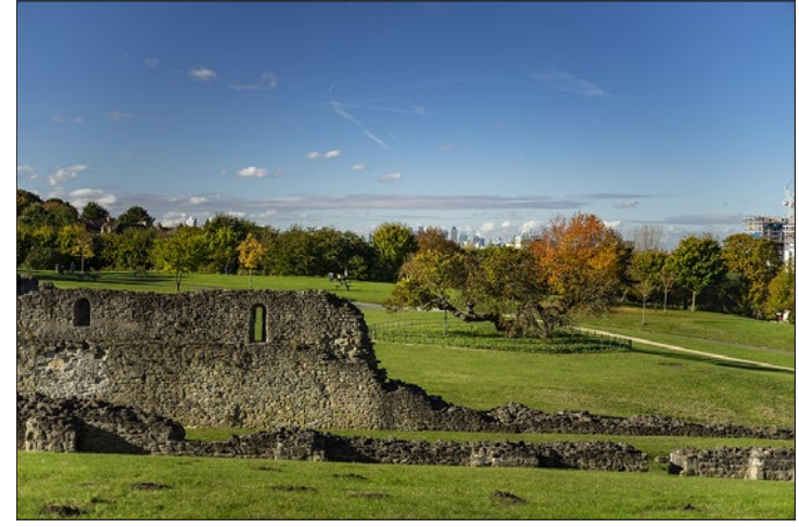
Looking north-west, with remains of the dormitory walls

The Lesnes Abbey mulberry has inherited an enviable pedigree, simply by its location. Standing in the shadows of what remains of the dormitory and refectory walls of a ruined 12th century Augustinian abbey, one would be forgiven for thinking this impressive old black mulberry has the credentials of a really ancient tree.