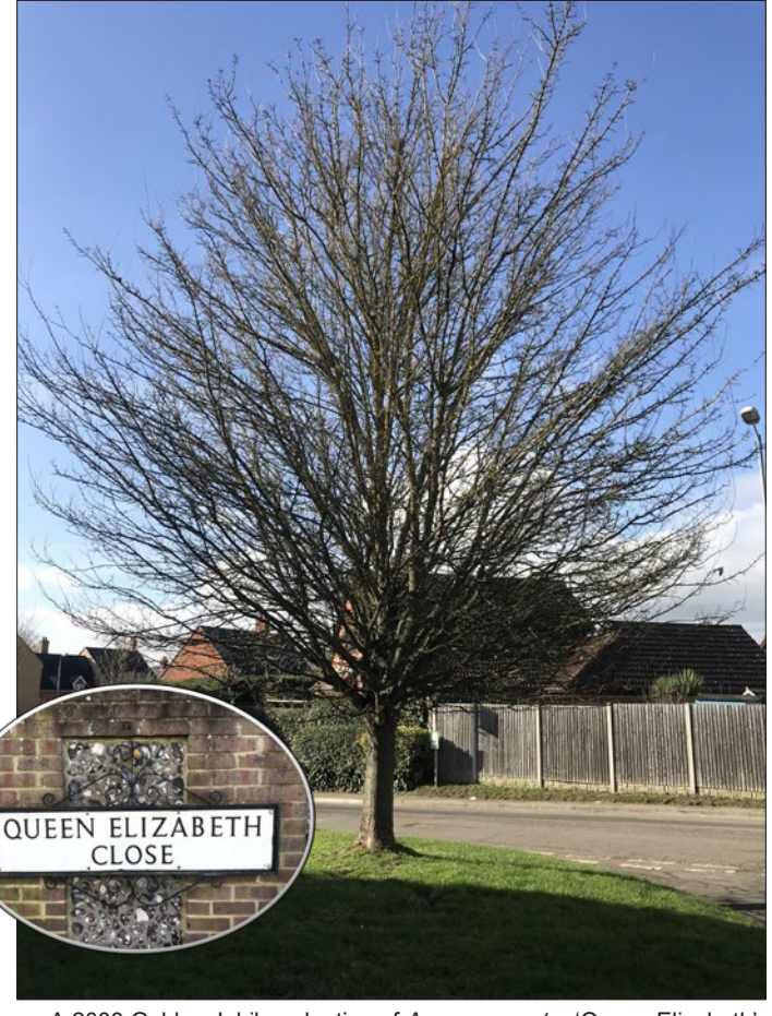
A 2003 Golden Jubilee planting of Acer campestre 'Queen Elizabeth' at the entrance to a new development in the south-east of England.

and oldest grow at the Savill Garden at Windsor and in the garden of Buckingham Palace, and were gifts to Her Majesty.