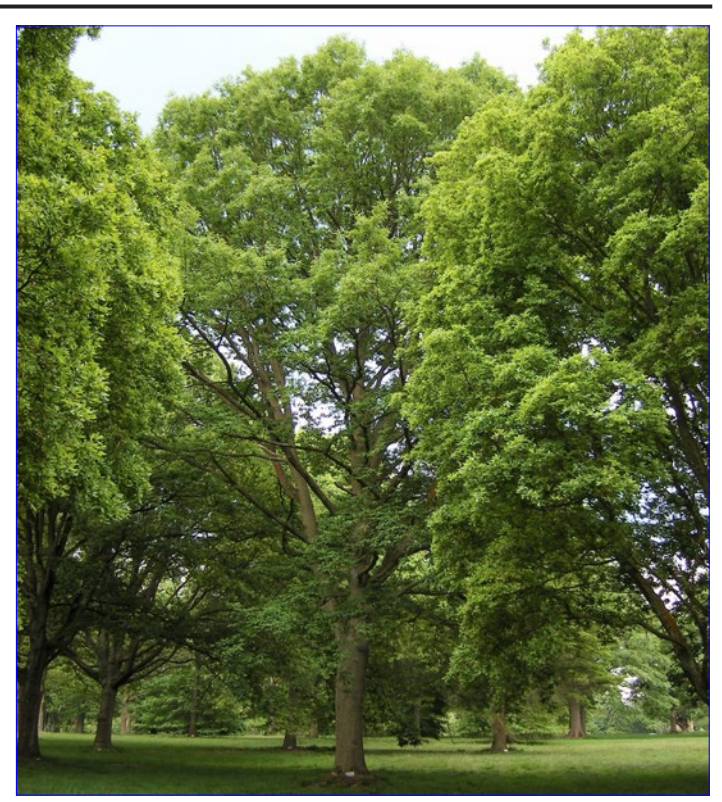
The champion Quercus petraea 'Muscaviensis', representing Zanzibar in the 'Empire Grove', Windsor Great Park.