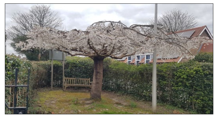
Champion Prunus x yedoensis 'Tsubame' at Ashurst Wood Primary School, West Sussex