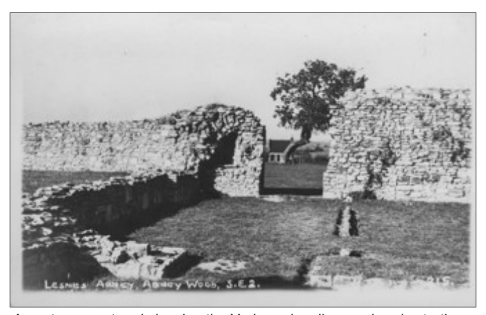
A post-war postcard showing the Y-shaped mulberry, already starting to lean

age' measuring 6'6" (198 cm) around the trunk, with two stems and having a crown circumference of 60 feet (18.2 metres). It's not easy to confuse a thorn with a mulberry, but who knows?