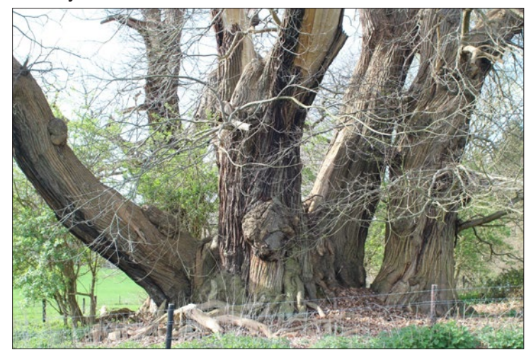
Research of Sweet chestnut in the UK by Rob Jarman found that most multi-stemmed trees were bundle planted clones.

Recent research by Rob Jarman of very large girthed sweet chestnut in the UK found that most multi-stemmed trees were bundle planted clones. Presumably, these bundles were originally planted not only for landscape impact but also for food - either for man or animals, especially deer or pigs or both. There are similar examples of landscape mixtures of oak with beech and sweet chestnut, possibly as insurance for at least one of the species to provide autumn and winter food each year.