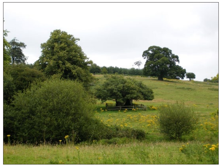
Queen Elizabeth Oak in Cowdray Park, West Sussex

The Thorp Perrow Arboretum in North Yorkshire contains potentially the oldest royal tree: the Catherine Parr Oak is supposed to have been planted here in 1535 by Henry VIII's Queen. Many surviving oaks, like the Queen Elizabeth Oak (Sessile) at Cowdray in West Sussex, are claimed to survive as landmarks from Elizabeth's progresses around her kingdom, during which she stayed at innumerable grand estates to test the incumbent's loyalty. Much more convincingly, the garden at Longleat in Wiltshire retains an oak planted by George III, the 'Farmer King', in 1789.