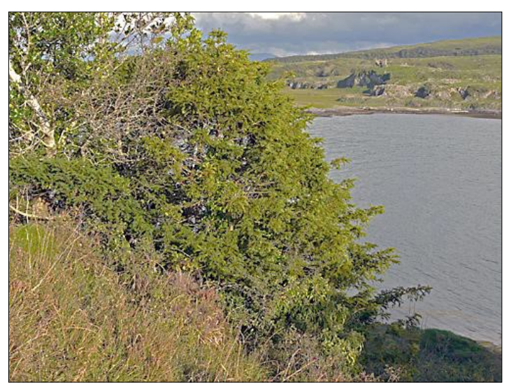
A section of yew on the cliffs of Bernera

On reaching the spot we found two female bushes of yew growing about 10 metres apart poking through a tangle of thick vegetation including brambles and young trees which mostly appeared to be ash (Fraxinus excelsior). It is not possible to get very close as the surrounding vegetation on the clifftop overhangs the sheer drop and is dangerous to explore. It is obvious that these two bushes are not creepers and have distinctive stems although these were not fully visible from the viewpoint. Given that previous searches in the 1990's found this yew growth impossible to find is understandable as it may not have been as visible then as it is now.