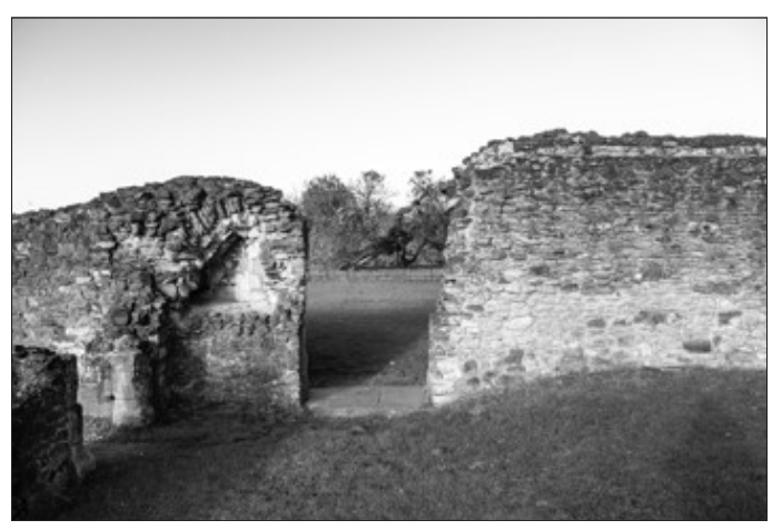
The mulberry in 2021