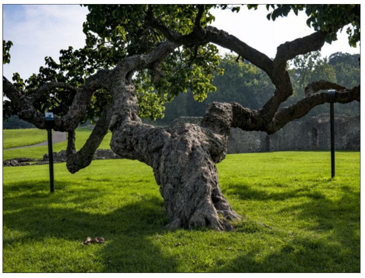
The Lesnes Abbey mulberry

The veteran Lesnes Abbey mulberry has to be one of the Capital's most photogenic trees, standing on a mound, flanked by the ruins of a 12th century monastery and nestled beneath ancient woodland. But the old farmhouse it probably belonged to has disappeared without trace.