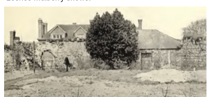
North wall of the 'frater' (refectory) showing the rebuilt farmhouse. The mulberry is beyond the wall to the left of the house.

The formulae for calculating the age of a veteran tree are quite complex, as trees grow quickly when young and more slowly with age, depending on soil and sunlight. Black mulberries are particularly difficult to age, not least because they typically have many burrs, which make it hard to get a true measurement of girth. However, after studying scores of old mulberries with approximately known planting dates, I've found that an increase in girth of about 1 cm per year, averaged over several decades, gives a reasonable 'ball-park' estimate. Signs of hollowing and dropped branches are other clues to a veteran tree – both of which the leaning Lesnes mulberry shows.