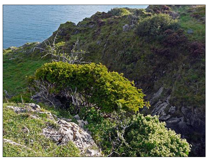
Yew bush growing on a cliff top, Bernera

On our return from the site we were excited to find another yew on Bernera, a tiny bush growing atop a steep cliff a few hundred metres to the north-west of the main site. Given the other yew is female, evidence suggests this bush is a direct progeny of the other and a result of avian seed dispersal.