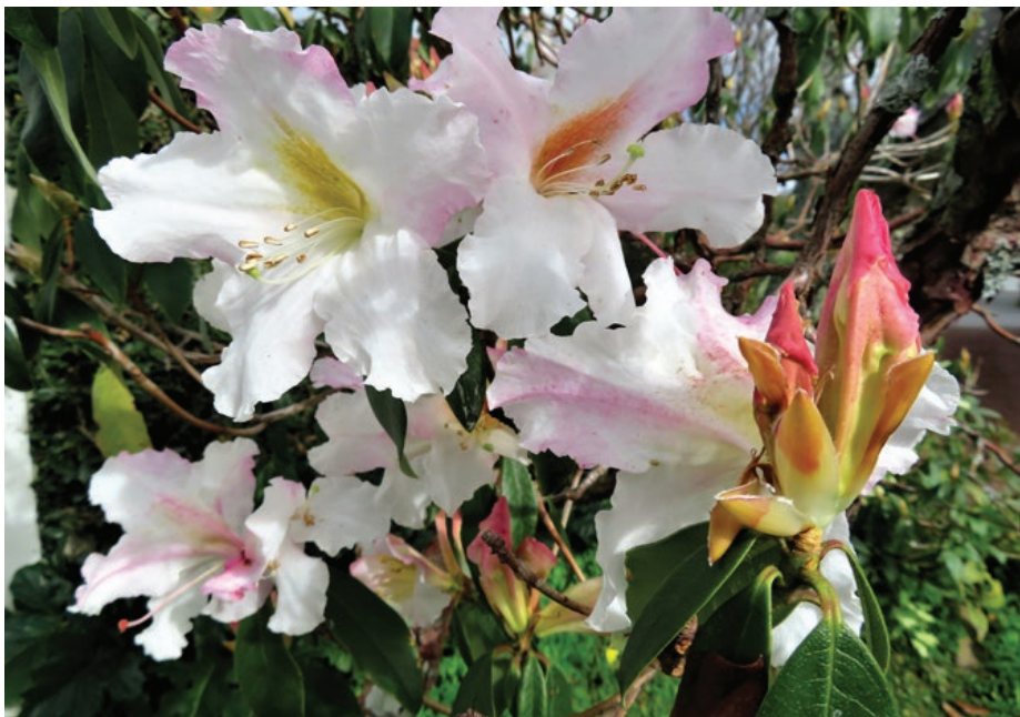
R. cubittii now reclassified as a form of R. veitchianum