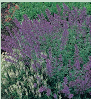
Nepeta racemosa 'Walker's Low' AGM ☼

A distinct improvement on N.'Six Hills Giant', with a lower, more compact habit. Aromatic, grey foliage with blue flowers. Most soils but best in well drained. H50cm F6-8 D3-5