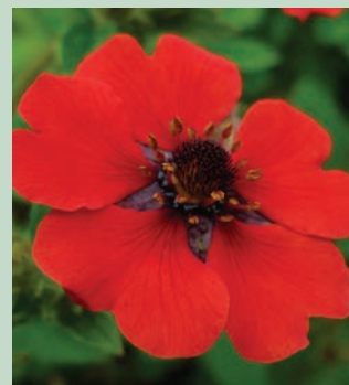
Potentilla 'Gibson's Scarlet' AGM

A valuable and easy perennial. Forms a spreading clump of mid green, ribbed, typical potentilla leaves with a stunning display of bright scarlet flowers in summer. H25cm F6-7 D3