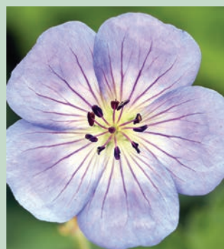
Geranium 'Azure Rush'

Very much like it's sister G. Rozanne but much lower growing making it ideal for the front of the border. Mounds of luxuriant foliage are covered with large, blue, white centred flowers all summer. H40-50cm F6-11 D3