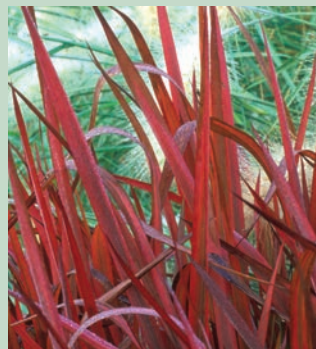
Imperata cylindrica 'Rubra'

A stunning and much sought after grass forming a slowly spreading clump of delicate, mid green leaves turning a deep red halfway up the leaf blades. Ideal for the garden or patio.