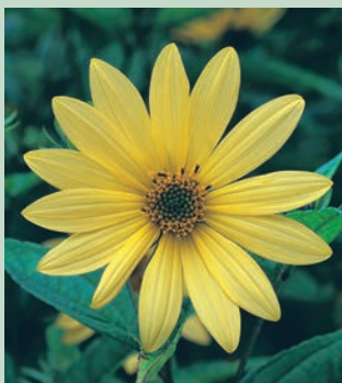
Helianthus 'Lemon Queen' AGM

Producing magnificent heads on the new years growth. Produces stems bearing lime-green, serrated leaves topped with huge umbels of apple-green florets opening to pure white in summer. They also look great in winter. Supplied in a 3 litre pot. H100cm F7-9 D1 81920 1 for £9.95 3 for £24.95