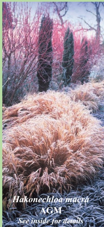
Hakonechloa macra AGM See inside for details