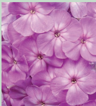
Phlox paniculata 'David's Lavender' ⌘

This sport of Phlox p. 'David', has the same outstanding mildew resistance as its parent. Taller and larger in stature with huge, fragrant, lilac blooms that appear in mid to late summer.