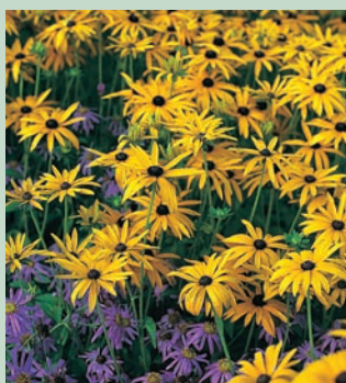
Rudbeckia fulgida var. s. 'Goldsturm' AGM

An outstanding perennial for late summer and autumn colour. Forming a spreading mat of green, lance shaped foliage with a succession of deep yellow flowers with a black eye. Easy and effective. H60-75cm F7-10 D1-3