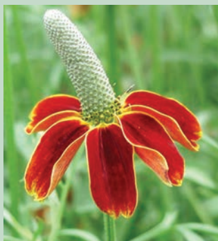
Ratibida columnifera 'Red Midget'

A dwarf variety of ratibida that is about half the size of the native. With a well branched, compact habit with long, black cone heads and dark red, reflexed petals that are trimmed in yellow above grey-green, fern like foliage. Well drained soil. H50cm F7-9 D3-5 90896 1 for £5.95 3 for £14.95