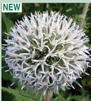
NEW Echinops sphaerocephalus 'Arctic Glow'

Robust and vigorous forming a dense, large clump of silvery-green, spiky foliage on red stems topped with large, white, ball flowers in summer.