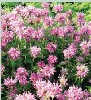
Monarda 'Marshall's Delight' AGM ☼

This has to be the best pink so far. Mid green leaves from slender stems topped with clear pink, crown like flowers. Most garden soils. H80cm F6-8 D3