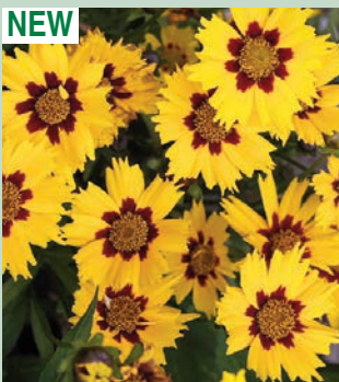
NEW Coreopsis 'Sterntaler'

This fantastic selection just doesn't stop flowering! Forming a neat, evergreen mound of green leaves, an abundance of bright golden maroon-bronze centred flowers that are held for months on upright stems. Fully hardy and easy to grow. H40cm F6-9 D3-5