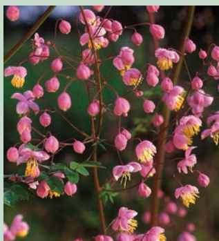
Thalictrum delavayi AGM

A truly beautiful perennial with stems bearing deeply dissected, glaucous, blue leaves forming a lattice work of foliage followed by huge, airy panicles of lavender-pink flowers in summer.