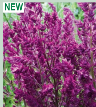
Salvia nemorosa 'Schwellenburg' ☼

A beautiful selection forming an irregular, bushy mound of aromatic, mid green foliage with fat, dense spikes of rose-purple flowers in mid to late summer