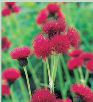
Cirsium rivulare 'Atropurpureum'

Much sought after Cottage Garden perennial this relative of the thistle forms a clump of serrated, bristly foliage with tall stems terminating in deep blood-red, thistle like flowers. H120-140cm F6-7 D3