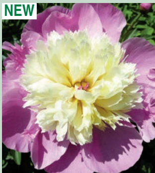
Paeonia lactiflora 'Bowl of Beauty' AGM

A simply sumptuous selection that should grace all gardens. This perfectly named variety has large, deep pink, highly scented flowers that open to form a bowl within which, creamy lemon-yellow petaloids are cupped perfectly. H90cm F5-6 D1