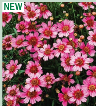
NEW Coreopsis 'Garnet'

A bold and colourful selection from this series of new Coreopsis. Forms a dense, neat mound of slender leaves with a summer long display of intense pink flowers with a deep maroon centre.