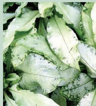
Pulmonaria 'Diana Clare' AGM

A striking introduction noted for it's outstanding foliage and free flowering nature. Forms a clump of bold, long, lance shaped, silver leaves topped with sprays of blue flowers in early spring. Unlike many other silver selections no mildew problems.