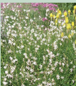
Gaura lindheimeri 'Summer Breeze'

Selected for it's sturdy habit and increased winter hardiness this variety forms a vigorous clump of stems with a mass of pure white flowers with lovely pink filaments all summer long.