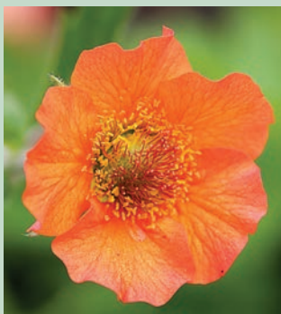
Geum 'Totally Tangerine'

A recent introduction noted for it's long flowering period. Forming a vigorous clump of lush green, ruffled leaves with sprays of bright tangerine, semi double flowers. H50cm F6-9 D3