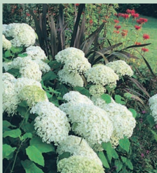
Hydrangea arborescens 'Annabelle'

Producing magnificent heads on the new years growth. Produces stems bearing lime-green, serrated leaves topped with huge umbels of apple-green florets opening to pure white in summer. They also look great in winter. Supplied in a 3 litre pot. H100cm F7-9 D1 81920 1 for £9.95 3 for £24.95