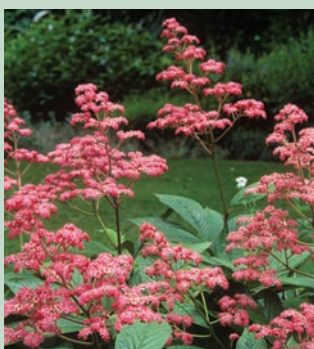
Rodgersia pinnata 'Buckland Beauty' AGM

A simply stunning variety forming an attractive, layered mound of tough, mid green, palm like leaves with strong stems that branch to hold pyramidal plumes of bright pink flowers. A wonderful contrast against the foliage.