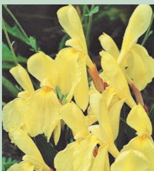
Roscoea cauleyoides 'Kew Beauty' AGM

A dwarf variety of ratibida that is about half the size of the native. With a well branched, compact habit with long, black cone heads and dark red, reflexed petals that are trimmed in yellow above grey-green, fern like foliage. Well drained soil. H50cm F7-9 D3-5 90896 1 for £5.95 3 for £14.95