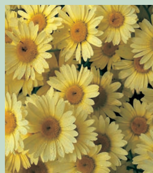
Anthemis tinctoria 'E.C.Buxton'

An everpopular plant forming a clump of deeply dissected foliage with branched stems carrying a succession of lemon-yellow flower heads throughout the summer. Well drained soil, full sun. H60cm F5-9 D1-3