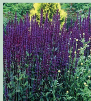
Salvia nemorosa 'Caradonna' AGM ☼

'Caradonna' is one of the best and most distinctive Salvia introductions. Forming a clump of stiffly upright, dark purple stems clothed with felty, green leaves topped with dramatic spikes of vivid blue through the summer.