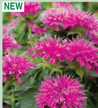
Monarda didyma 'Purple Lace' ☼

A compact, dwarf selection ideal for the front of the border or patio container. Forms a dense low mound of aromatic foliage with mid to deep purple, crown like flowers in summer. A bee and butterfly favourite H30cm F7-9 D3-5