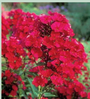
Phlox paniculata 'Othello'

Outstanding selection, vigorous and robust in habit with dark leaves and incredibly vibrant red flowers in late summer. Most garden soils, best in a sunny position. H75cm F7-9 D3