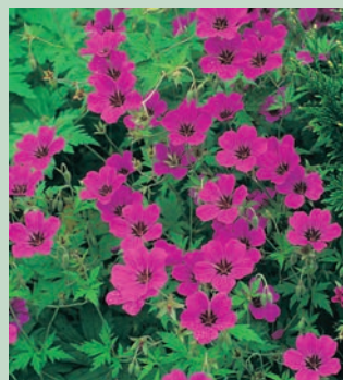
Geranium 'Patricia' AGM

A few hardy Geraniums stand out above the multitudes of recent introductions and 'Patricia' is one of them. Healthy, vigorous and stunning with bright magenta flowers up to 4cm in diameter over a long period.