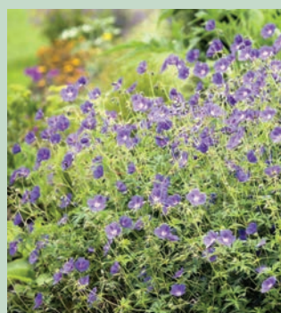
Geranium 'Eureka Blue'

Strong, robust and tolerant of dry conditions. Forms dense mounds of leaves with abundant, large, deep blue flowers all summer. Good autumn foliage and performing like this at Bressingham year after year. H30cm F6-9 D3