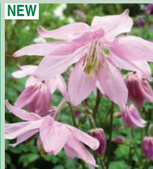
Aquilegia clematiflora 'Rosea'

A beautiful and gracefully elegant Columbine, forming a neat hummock of light green, deeply lobed foliage above which stiffly upright stems bear clusters of pendant, saucer shaped, shell pink flowers in late spring to early summer. H60-75cm F-7 D3