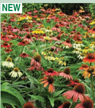
NEW Echinacea 'Cheyenne Spirit'

A fantastically colourful strain of coneflower. With a mixture of vibrant pink, orange, red and yellow flowers held over a neat mound of elliptical leaves. Reliably hardy and fully perennial unlike many of the new hybrids from the U.S.A. H60-75cm F7-9 D3