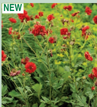
Geum 'Blazing Sunset'

A robust and showy recent introduction. This variety of Avens forms a neat mound of toothed foliage with stems carrying sprays of large, bright scarlet, double flowers in summer.