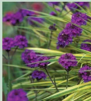
Verbena rigida AGM

This attractive, mid summer to autumn flowerer forms a bushy plant with an abundance of branched stems terminating in bright purple flowers. H60cm F7-10 D3