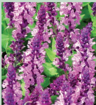
Salvia nemorosa 'Pink Beauty' ☼

Selected for its compact and abundant flower spikes. Forms a low, dense mound of aromatic, mid green foliage with many, deep mauve-pink spikes held aloft. Will reflower if cut back after first flush. H30-45cm F6-8 D3