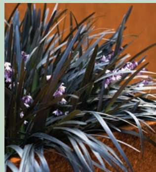
Ophiopogon planiscapus 'Nigrescens' AGM

Commonly known as "Black Mondo Grass", this low growing grass forms a spreading clump of totally black foliage with short stems bearing white flowers. A marvellous plant for associations both in the garden and patio container. See back page for association with Hakonechloa macra . H10-15cm F7-8 D3-5