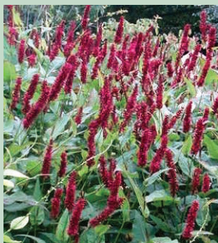
Persicaria amplexicaulis 'Blackfield'

Distinctive new selection with a long period of interest. Forms a clump of green, lance shaped leaves with spikes of black-red flower buds that open to deep blood-red flowers.