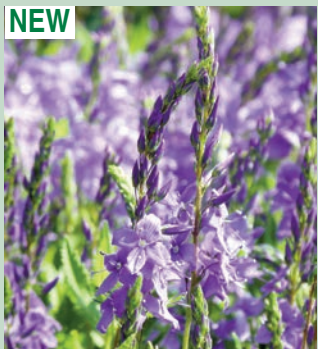
Veronica a. ssp. t. 'Crater Lake Blue' AGM

This front of border selection forms a spreading mound of delicate stems with small, serrated leaves with an abundance of deep sky blue spikes held over the foliage. H30cm F4-6 D3