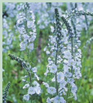
Veronica g. 'Barbara Sherwood' AGM Ⓜ

An outstanding selection forming a neat clump of glossy green leaves at the base with tall stems bearing beautiful, delicately perfumed spikes of powder-blue flowers. Easy and trouble free. H90cm F6-7 D3-5