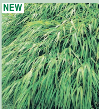
Hakonechloa macra AGM

A beautiful yet little used grass from Japan. Forming a dense clump of slender stems and wide, lush green leaf blades arching to create a marvellous effect. See back page for seasonal association at Bressingham Gardens.