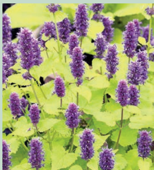
Agastache rugosa 'Golden Jubilee'

An incredibly bright selection forming a dense, upright bush of bright yellow foliage on slender stems topped with long lasting, lavender-purple flowers in summer. One for the bees H100cm F6-9 D3