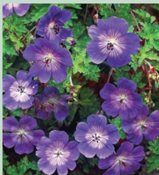
Geranium 'Rozanne' AGM

No garden should be without the best hardy geranium around. Vigorous with beautiful, large, open, sky blue, white centred flowers from June to November in all but the driest soils. Deservedly awarded the RHS. Plant of the Centenary. H90cm F6-11 D1