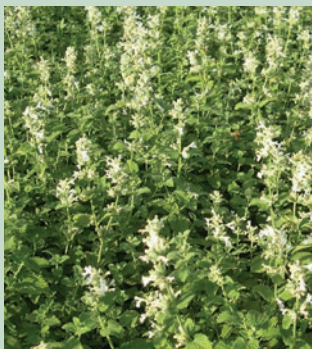
Nepeta racemosa 'Snowflake' ☼

Ideal for the front of the border this low growing selection forms a dense, neat, spreading clump of green, aromatic foliage with masses of pure white spikes held all summer. H30cm F6-8 D3