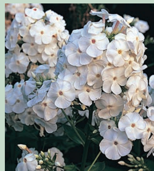
Phlox paniculata 'David' ⌘

An introduction from the USA noted for it's neat, bushy habit and it's resistance to mildew. Forms a clump of deep green leaves followed by large, rounded heads of pure white, scented flowers in late summer. H70cm F7-9 D3