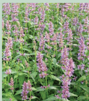
Agastache 'Purple Haze' ♂

A bushy, sun lover this recent introduction forms a dense, branched, upright bush of highly aromatic leaves with long lasting spikes of violet-blue flowers through summer, that bees find irresistible. H60-90cm F7-9 D1-3