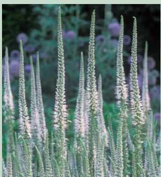
Veronicastrum v. f. roseum 'Pink Glow'

This imposing and easy to grow 'Culvers Root' has deep purple, unbranched stems turning greeny-erect as it matures with lovely, erect, pink flower spikes in summer. H90-120cm F7-8 D1-3