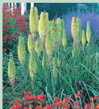
Kniphofia 'Percy's Pride'

Named after a long standing Bressingham hybridizer Percy Piper. Forms a clump of broad, blue-green, grassy leaves and stout spikes of green tinted, canary-yellow flowers.