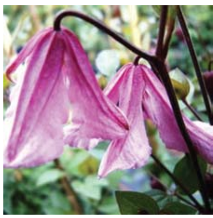
Clematis 'Hendryetta' Hanging bell shaped flowers of a deep rose-pink with light pink edges are produced in abundance from July to September on this clematis. Use to scramble up and through nearby plants for added color.