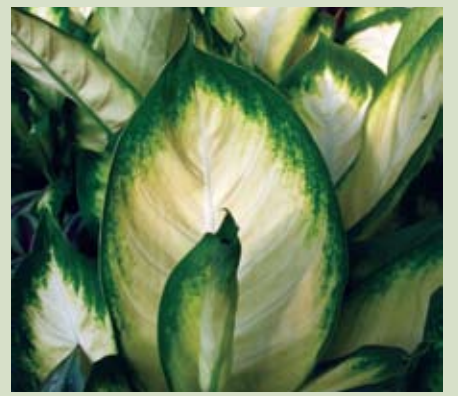
nbachia 'Tropic Camile