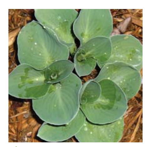
Blue Mouse Ears Hosta of the Year 2008. A wonderful mini with a great name. Forms perfectly round mounds of thick, rubbery leaves. Ideal hosta for troughs. 8" tall by 12" wide.