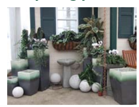
Planters & containers help complete the garden experience. Choose from over 90 different colors.