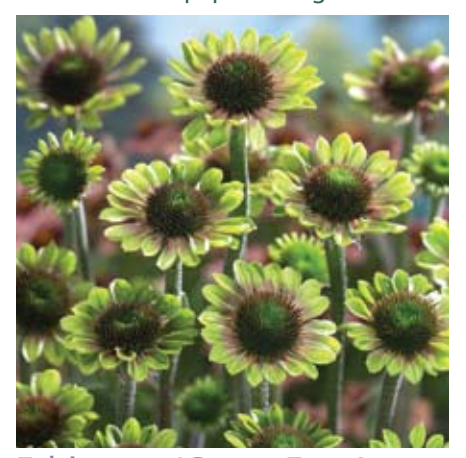
Echinacea 'Green Envy' We had to think twice about featuring yet another coneflower, but this is truly unique. Cone and petals open light green, over several days pink suffuses the petals and the cone darkens to dark brown.