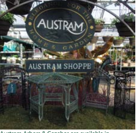
Austram Arbors & Gazebos are available in miniature or full size for the garden