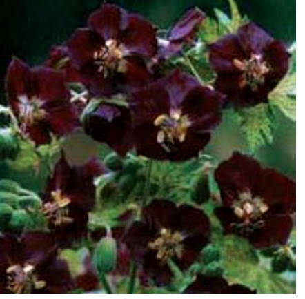
Geranium phaeum 'Springtime' Vigorous, easy plant forms mounds of densely packed, white marbled leaves with dark purple spots. Spikes of dark maroon flowers rise up above the foliage for several weeks in mid-spring.