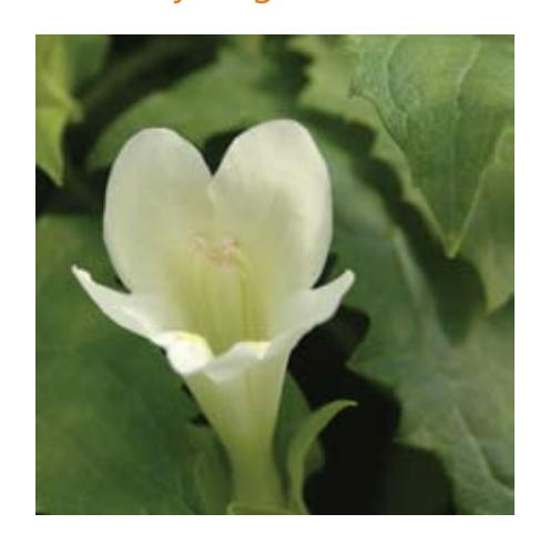
Lophospermum 'White Suntory' This is the new white version of the popular 'Red Wine'. Flowers all summer in hanging baskets or climbing your favorite trellis. Height: 4-6'.

Annual Vines Ask us to guide you through the many new and interesting plants we have available to climb up or spill down in your garden.