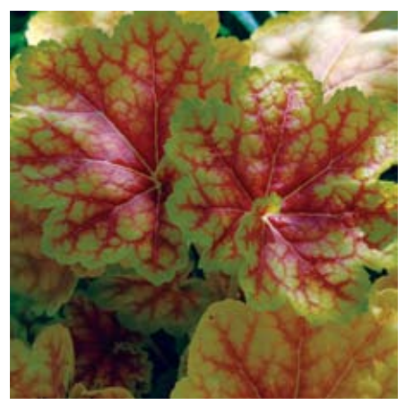
Heuchera 'Tiramisu' This new coral bell inherits tolerance of intense heat and humidity from its H. villosa parent. Exceptional vigor and winter hardiness. Bright charteuse leaves have red markings in spring and fall.