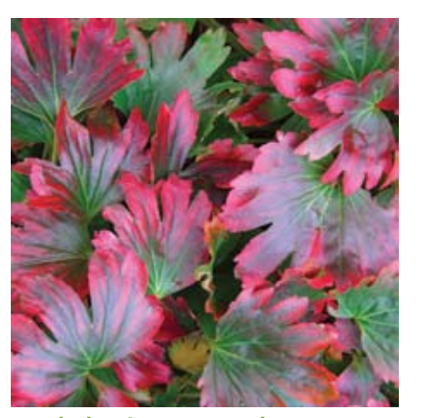
Mukdenia 'Karasuba' Creeping Heuchera relative with large, dark green, fan-shaped leaves with purple-red edges. During summer the color spreads to entire leaf.