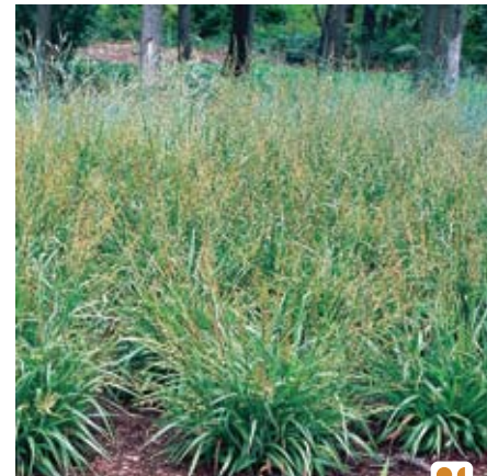
Calamagrostis 'Cheju-Do' Feather reed grass has always been popular for its strongly vertical habit and early opening, long-lasting flowers. This variety, similar to Karl Foerster, bears the same, large flowers on plants that are a foot shorter.