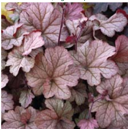
Epimedium 'Fire Dragon' Popular for their dense clumps of evergreen foliage that thrive in dry shade, these bishop's caps have larger, showler long lasting yellow flowers with purplish bracts. A welcome addition to the shade garden.