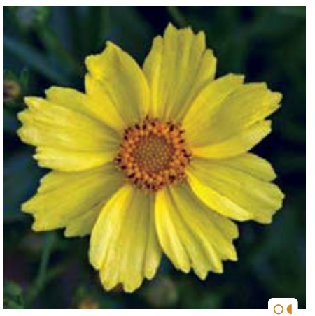
Coreopsis 'Full Moon' Fresh from an 8 year intensive breeding program the Big Bang™ series introduces this new mid-border coreopsis with 3" diameter yellow flowers all summer long. This one will be popular. Height: 24-30".