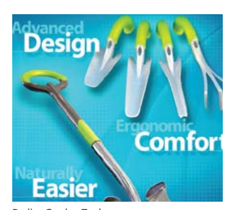
Radius Garden Tools