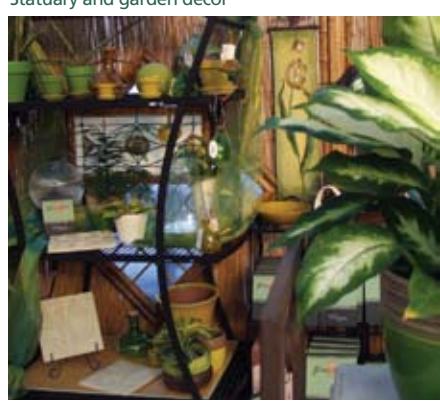
Garden gifts and accents