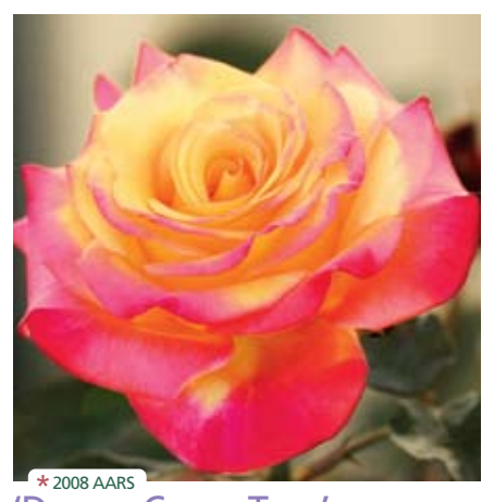
'Dream Come True' This big. clean, vigorously bushy plant pumps out loads of long-stemmed, scrumptiously shaped yellow blooms edged in ruby red. Each eye-catching flower blushes to an all-ruby finish, giving a multi-colored display that's truly dreamy in every way. Tall, upright and bushy.