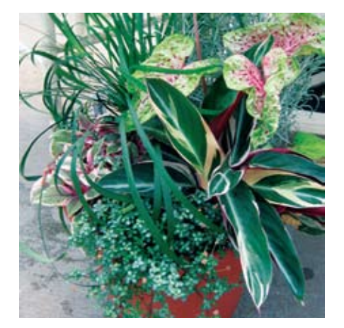
Our container gardening department is second to none. There are two things here that separate Telly's from all the others. 1) Our plant selection allows for an endless array of unique combinations that simply can't be found elsewhere, and 2) Telly's container gardening expert, Sara, creates unparalleled container gardening beauty whenever she is given the opportunity. This gives our customers a myriad of ideas for their own