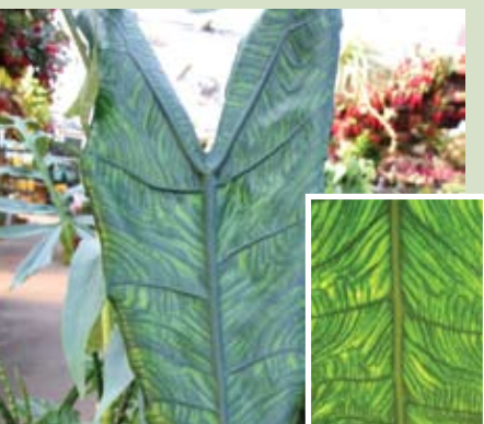
Alocasia zebrina var. 'Reticulata'