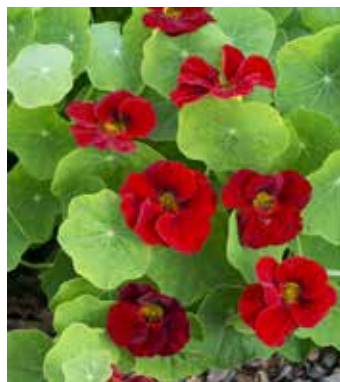
TR8775 TROPAEOLUM minus 'Tip Top Mahogany'

(SAHIN 1991) deep golden orange flowers, bright and showy