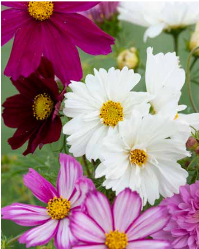
COMIX01 COSMOS bipinnatus 'Sahin's Choice Formula Mix'

(SAHIN 2021) large red & white flowers on bushy plants of intermediate height