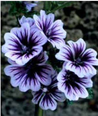
MA4525 MALVA sylvestris 'Zebrina'

(SAHIN 1999) exhibition quality lupins in rich colours and many striking bicolours