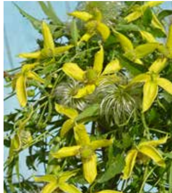
CL3070 CLEMATIS 'Helios'

A mixture of separate colours, compact, base-branching, large spider-type flowers, early