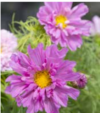
CO9230 COSMOS bipinnatus 'Double Dutch Rose'

(SAHIN 2020) perky picotee flowers growing well above the foliage creating a lovely airy effect, good cut flower