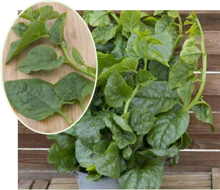
BA7500 BASELLA alba 'Select Green'

Virtually sterile thus long lasting as cut flower, excellent for pots, harvest 06-10