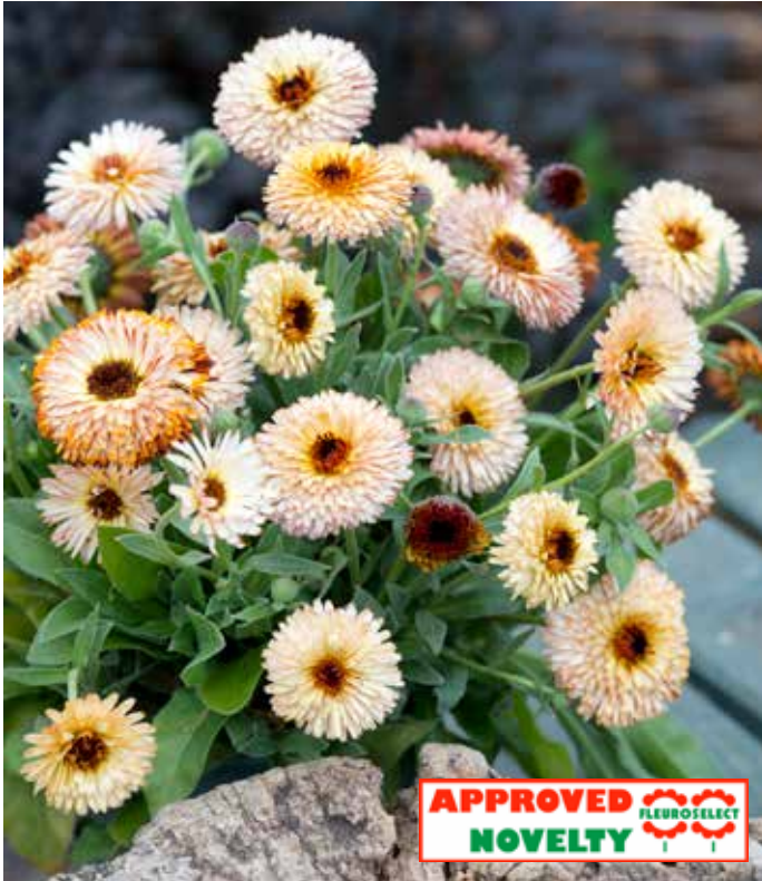
CA0803 CALENDULA officinalis 'Pygmy Buff'

(SAHIN 2021) FS-N 2020 unique buff reverse petals on apricot, double flowers