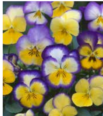
VI4025 VIOLA xwittrockiana 'Floral Days Cool Summer Breeze'

Snailflower, curiously spiralled white and mauve flowers look like snails