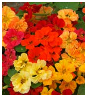
TR8399 TROPAEOLUM minus 'Whirlybird Formula Mixture'

Propeller-like, semi-double reddish orange flowers, bushy plants