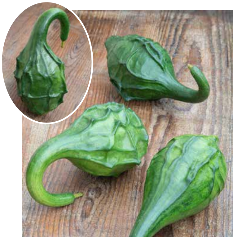
LA1917 LAGENARIA siceraria 'Dinosaur' Green fruits with wing-link projections, curved necks, swan-like appearance