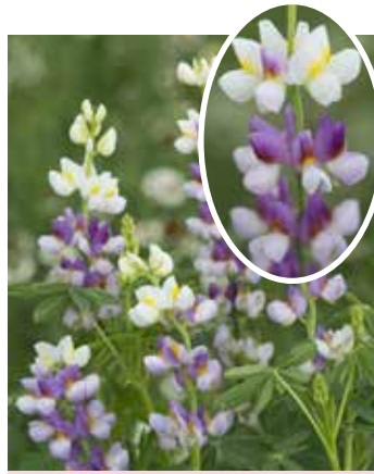
LU4585 LUPINUS mutabilis var. cruckshankii 'Javelin Lilac'

(SAHIN 1996) elegant long spikes of blue scented flowers with white and yellow keels