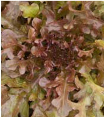
LA1575 LACTUCA sativa 'Mascara'

(Sahin 2016) true heirloom from the Dutch Isles, extremely tender butterhead lettuce