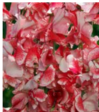
LA7200 LATHYRUS odoratus 'Spencer Mars'

Brilliant scarlet speckles and wired on a white background