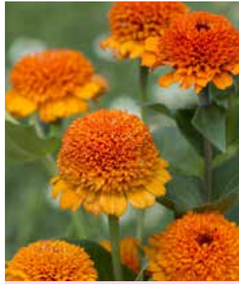
ZI4705 ZINNIA elegans 'Cresto! Orange'

(SAHIN 2019) Cresto! represents high percentage of crested flowers, very good selection