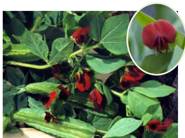
TE7500 TETRAGONOLOBUS purpureus Mostly trifoliate leaves, maroon-red flowers followed by winged pods edible when young