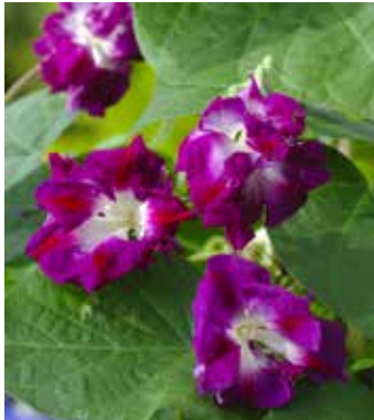
IP6000 IPOMOEA x imperialis 'Sunrise Serenade'

Red flowers, divided leaves, very attractive climber, suitable for pots