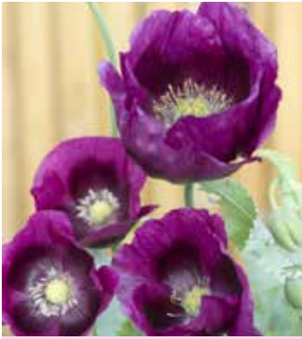
PA2905 PAPAVER somniferum 'Lauren's Grape'

Much sought after poppy, extraordinary plum purple flowers with deep purple spots