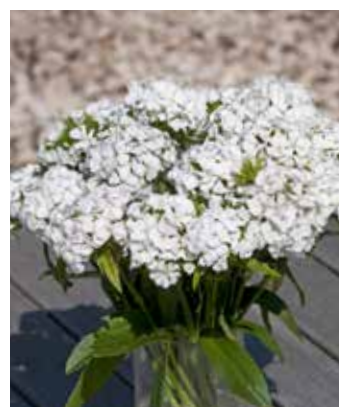
DI0470 DIANTHUS barbatus 'Hollandia White'

(SAHIN 2010) stunning bi-colour blue with white bee