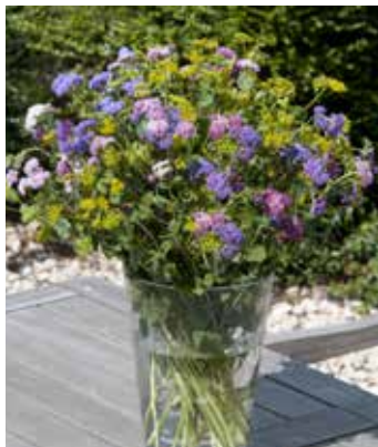
AG4300 AGERATUM houstonianum 'Timeless Mixture'

(SAHIN 2003) long stems bear large flowers in purple, pink, blue and white