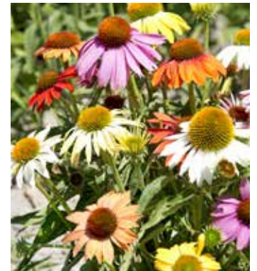
EC6498 ECHINACEA purpurea 'Paradiso Dwarf Fieldgrown Mix'

(SAHIN 2019) earlier than Paradiso Tall, with many different colours, first year flowering