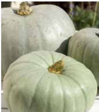
CU2890 CUCURBITA maxima 'Bush Baby'

Well known herb, superb for cress production, fresh cucumberlike taste, combines well with shellfish