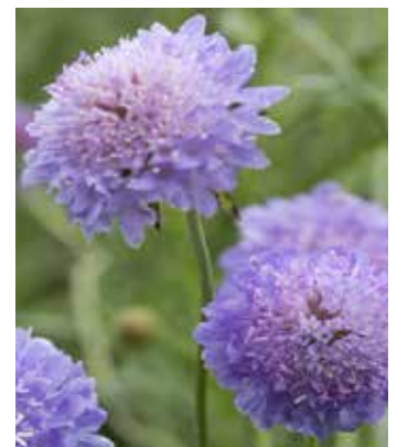
SC0379 SCABIOSA atropurpurea 'Blue Cockade'

(SAHIN 1992) deepest maroon, nearly black flowers with contrasting white stigmas