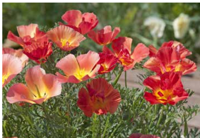
ES4398 ESCHSCHOLZIA californica 'Thai Silk Strawberry Fields'

(SAHIN 2008) wonderful, rose-cream, semi-double flowers