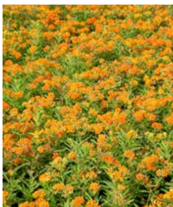
AS1940 ASCLEPIA tuberosa

(SAHIN 1995) bright orange-scarlet flowers, adaptable