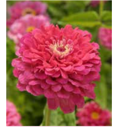
ZI4230 ZINNIA elegans 'Exquisite'

Unusual green colour, vigorous plants with large rounded fully double flowers