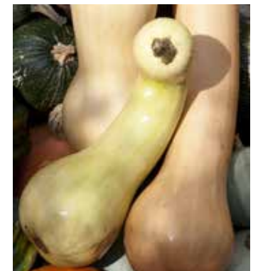
CU4010 CUCURBITA moschata 'Tahiti Melon'

Developed by the Lakota Indians, delicious sweet and nutty taste, good storage 2-3 kgs