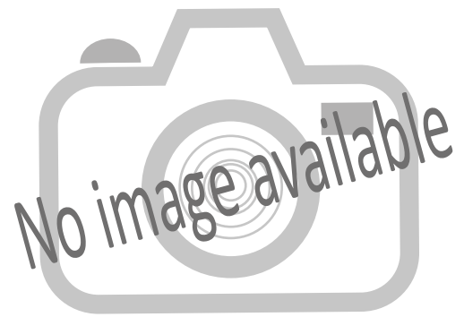
MA8588 MATTHIOLA incana 'Anytime Sea Blue'

(SAHIN 1999) tall stems for cut flower use, flowers well in summer