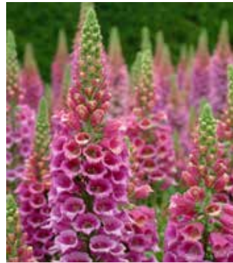
DI7230 DIGITALIS purpurea 'Candy Mountain Rose'

(SAHIN 2010) unique hybrid selection from Pam's Choice with split lower petals