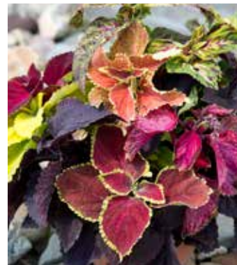
CO1900 PLECTRANTHUS scutellarioides 'Pinto Fieldgrown Mix'

(SAHIN 1992) fluffy balls of deeply lacinated snow-white petals