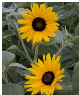
HE2610 HELIANTHUS argophyllus 'Gold & Silver'

(SAHIN 2005) unique mixture of all pollenfree bicolours, branched, long flowering