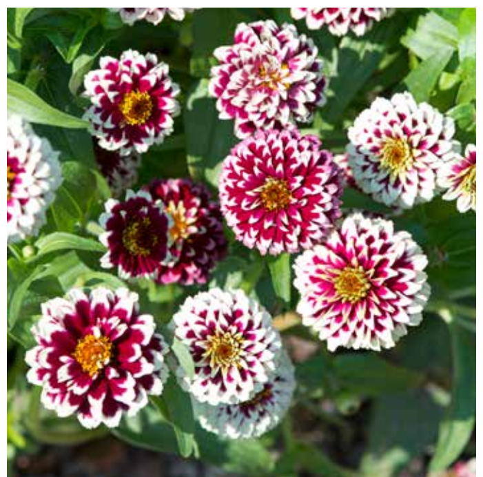
ZI8580 ZINNIA haageana 'Jazzy Red'

(SAHIN 2021) selection of our finest nasturtiums, flowers and foliage edible, unripe green seeds can be eaten raw or pickled