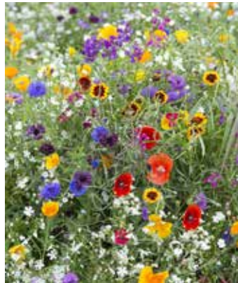
ZZ0250 MIXTURE , 'Primavera Mixture'

(SAHIN 2017) quality bee mix consisting of annual and first year perennials, supplying bee food from June - October