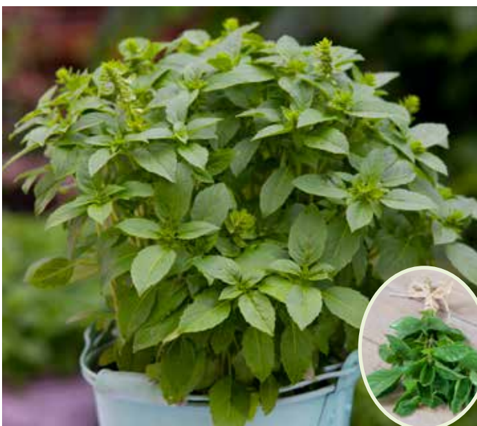
OC6700 OCIMUM basilicum 'Spice Boys Spicy Globe'

(SAHIN 2005) intense purple flowers over nice green foliage, strong scent. Harvest 09-11.