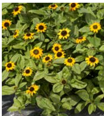
SA6280 SANVITALIA procumbens 'Mandarin Orange'

AGM, large flowers of pure gentianblue colour, of great beauty and distinction