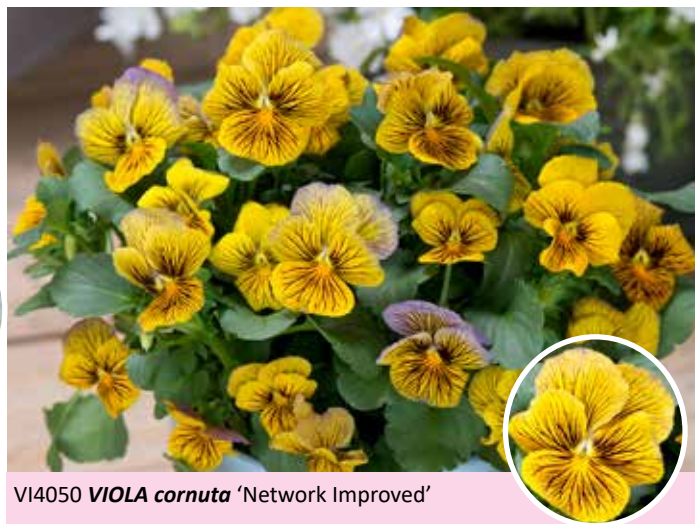
VI4050 VIOLA cornuta 'Network Improved'

(SAHIN 2018) now this is a truly black viola, ideal for mix containers