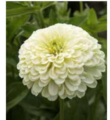
ZI4250 ZINNIA elegans 'Isabellina'

Deep rose, vigorous plants with large rounded fully double flowers