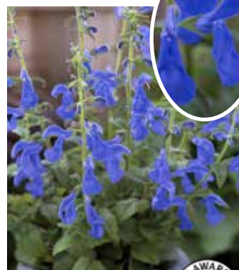
SA2675 SALVIA patens 'Oxford Blue'

(SAHIN 2004) pink-white flowers in branched inflorescences, fleshy, silvery lanate rosettes