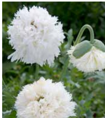
PA3183 PAPAVER laciniatum 'Swansdown'

(SAHIN 2019) reselected from our original stock, deeply lacinated scarlet flowers