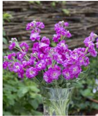
MA8555 MATTHIOLA incana 'Anytime Hot Pink'

Tall stems for cut flower use, flowers well in summer