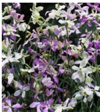
MA9425 MATTHIOLA longipetala subsp. bicornis 'Starlight Scentsation'

The deep purple-flowered form with dark veining, large-flowered, tetraploid