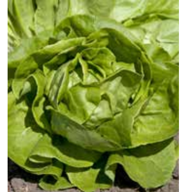
LA1570 LACTUCA sativa 'Gustav's Salad'

Austrian heirloom, romaine lettuce, does well in the heat, 55 days