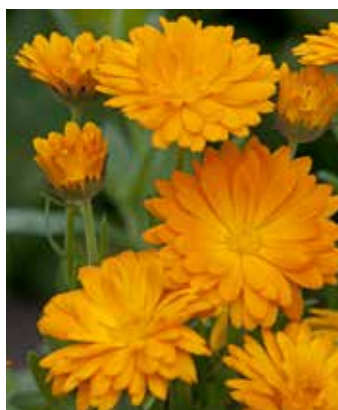
CA0960 CALENDULA officinalis 'Funky Stuff'

(SAHIN 2017) best selection with high percentage of crested flowers, balanced mix