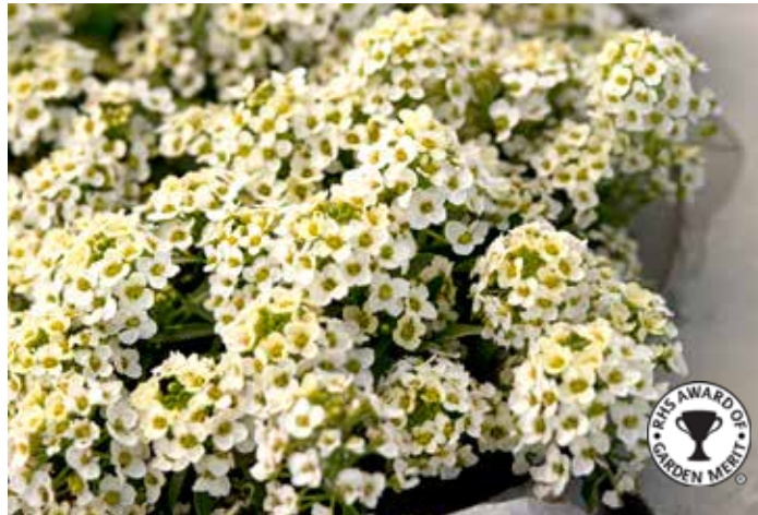
LO2750 LOBULARIA maritima 'Aphrodite Lemon'

(SAHIN 1993) FS-N exciting colour, buff apricot, modern compact habit