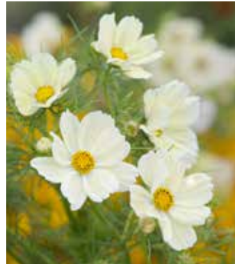
CO9210 COSMOS bipinnatus 'Kiiro'

(SAHIN 1986) our unique mixture with trumpet-like rays, very attractive