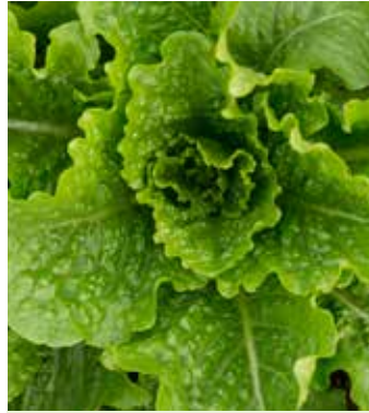
LA1560 LACTUCA sativa 'Crisp Mint'

Compact version of the oakleaf type, slow to bolt, very tender and tasty lettuce, 50 days