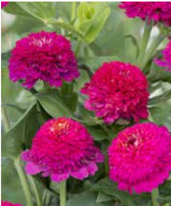
ZI4720 ZINNIA elegans 'Cresto! Violet'

(SAHIN 2019) Cresto! represents high percentage of crested flowers, very good selection