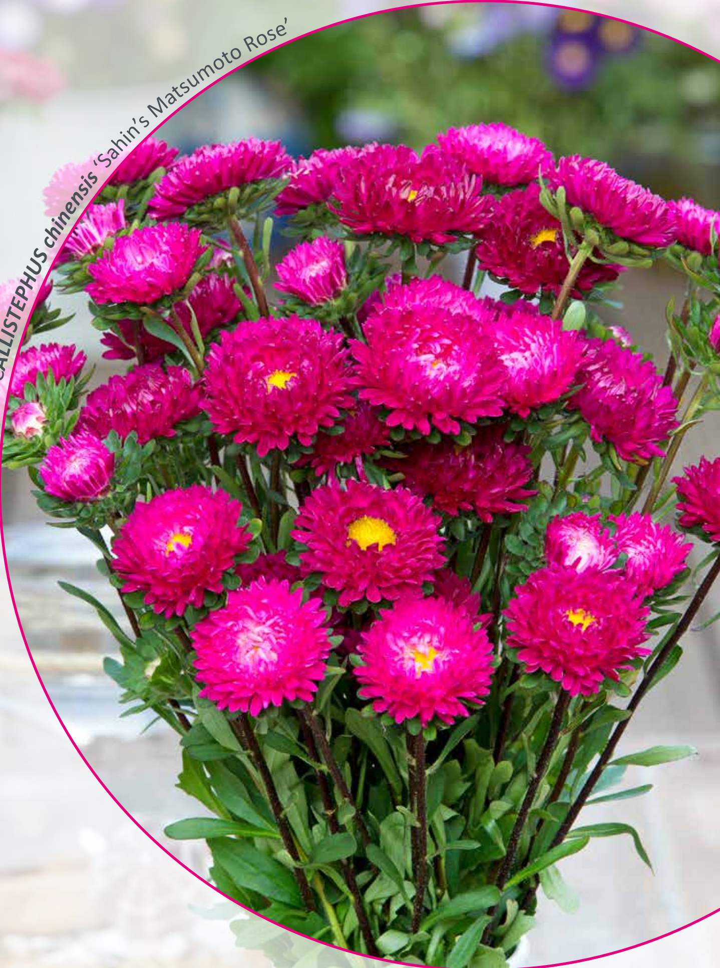
CALLISTEPHUS chinensis 'Sahin's Matsumoto Rose'