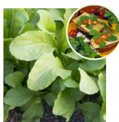
ER6510 ERUCA sativa 'Apollo'

Uniquely coloured carrot, deep purple skin with orange to yellow flesh