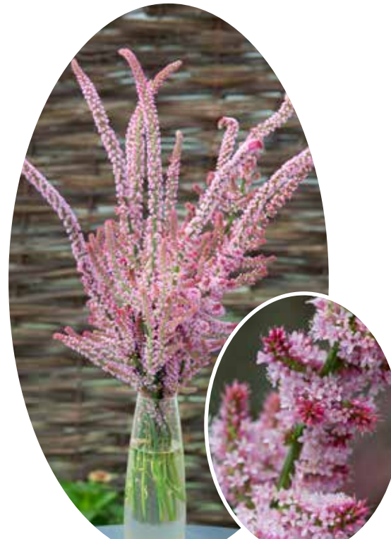
LI4012 LIMONIUM suworowii 'Pink Pokers'

(SAHIN 1995) shades of cream, lemon and yellows