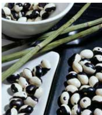
PH1380 PHASEOLUS vulgaris 'Ying Yang'

Heirloom stringless snap bean, good producer with rich flavour, beans turn bright green when cooked, maturity 50-60 days