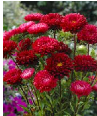
CA2187 CALLISTEPHUS chinensis 'Sahin's Matsumoto Scarlet'