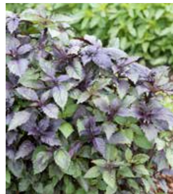
OC6010 OCIMUM basilicum 'Spice Boys Ararat'

Bluish flowers, ornamental pods, shiny black seeds edible