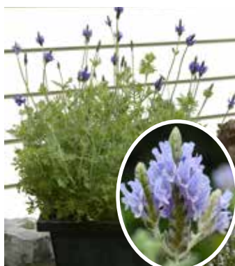
LA8150 LAVANDULA multifida 'Origano'

A superb blend of striped, mottled, veined flake-type Spencer varieties