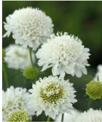
SC0394 SCABIOSA atropurpurea 'Snowmaiden'

Mixture of the above colours, finest and brightest mixture