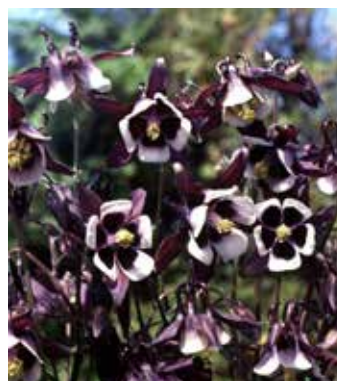
AQ8480 AQUILEGIA vulgaris 'William Guinness'

(SAHIN 2004) striking lime-green, double spurless flowers, most fashionable