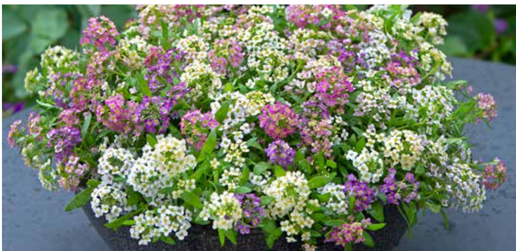
LO2799 LOBULARIA maritima 'Aphrodite Formula Mix'

(SAHIN 2002) clear wine red, excellent contrast