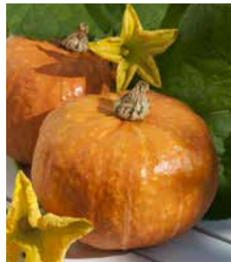
CU2898 CUCURBITA maxima 'Mooregold'

Uniform round fruits but of different sizes ranging from 2 - 5 kgs.