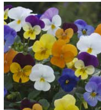
VI8399 VIOLA cornuta 'Floral Power® Formula Mixture'

(SAHIN 2005) unique mixture of small, bicoulored flowers on compact plants