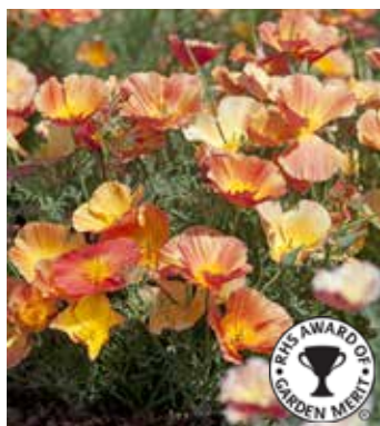
ES3910 ESCHSCHOLZIA californica , 'Thai Silk Apricot Chiffon'

(SAHIN 1994) FS-Q 1994, AGM, cream-yellow base with intense coral edging