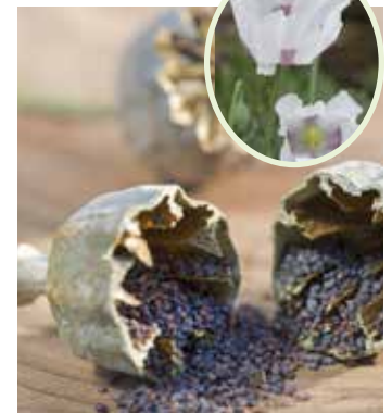
PA3500 PAPAVER somniferum var. alba , 'Bread Seed Poppy'

(SAHIN 1999) metallic grey-purple foliage, darker purple at flowering, liquorice taste