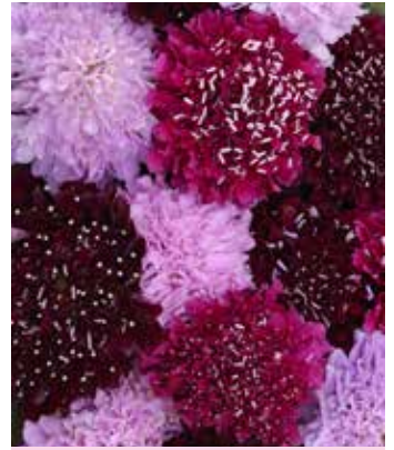
SC0398 SCABIOSA atropurpurea 'Summer Fruits'

(SAHIN 1990) reselected stock, pure white medium-sized flowers, long strong stems