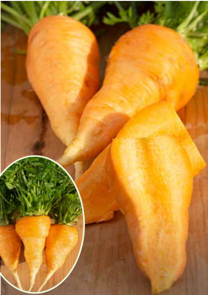
DA7750 DAUCUS carota 'Oxheart'

Heirloom chantenay carrot with very distinct heart shape, can weigh upto 500 gram, good for heavy soils and containers