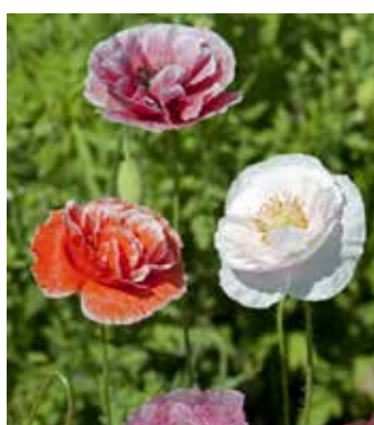
PA2770 PAPAVER rhoeas 'Dawn Chorus'

(SAHIN 2000) double and semi-double form of 'Angel Wings', mostly pastels and picotees