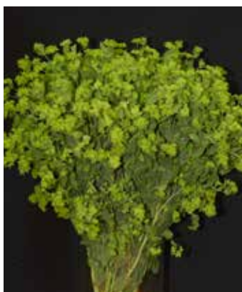
BU5700 BUPLEURUM rotundifolium 'Garibaldi'

(SAHIN 1993) strong and tall stems, excellent yellow and green filler