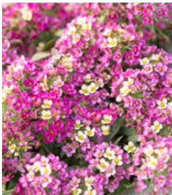
LO2755 LOBULARIA maritima 'Aphrodite Red'

(SAHIN 2002) rich purple flowers on compact plants