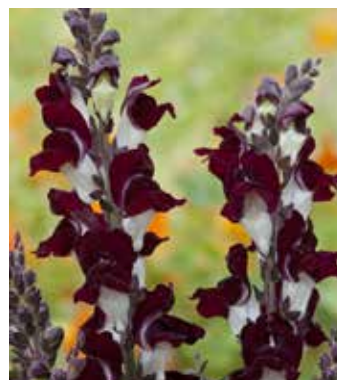
AN6950 ANTIRRHINUM majus 'Night & Day'

(SAHIN 2008) freely branching, bright lavender-rose, scented flowers produced continuously