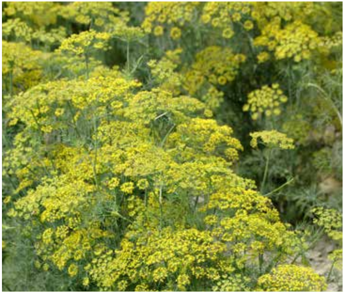
AN2545 ANETHUM graveolens 'Hedger'

Virtually sterile thus long lasting as cut flower, excellent for pots, harvest 06-10