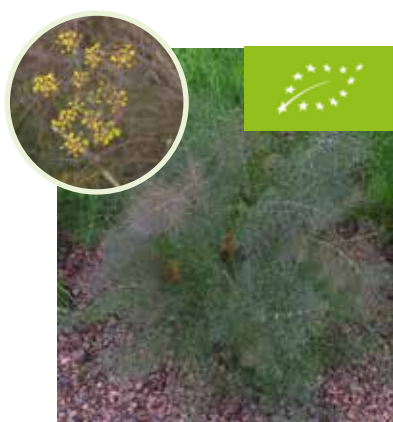
FO5000 FOENICULUM vulgare 'Smokey' ORG

(Sahin 2002) rounded leaves, excellent for salads, high in vitamin C