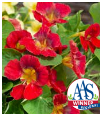
TR8780 TROPAEOLUM minus 'Tip Top Rose'

(SAHIN 1991) deep mahogany-red flowers over golden green foliage, distinct