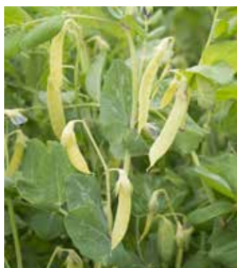
PI2200 PISUM sativum 'Golden Sweet' Heirloom sugar pea from 1860, eaten as golden yellow pods, attractive purple flowers are also edible and useful as a colourful garnish