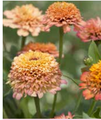
ZI4710 ZINNIA elegans 'Cresto! Peachy Pink'

(SAHIN 2019) Cresto! represents high percentage of crested flowers, very good selection