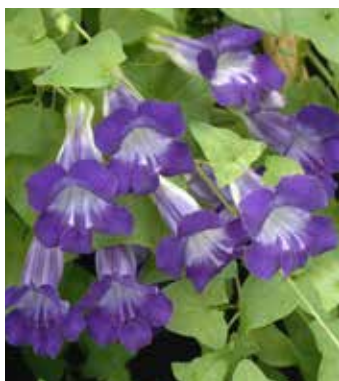
AS0710 ASARINA scandens 'Joan Loraine'

(SAHIN 1990) deep violet-blue, showy and useful, easy climber