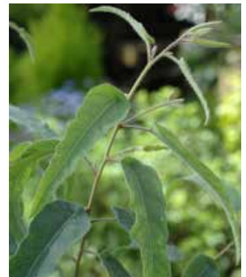
EU0700 EUCALYPTUS citriodora 'Lemon Bush'

(Mauser 1981) AGM, amongst the hardiest, one of the standards in the industry, coppice