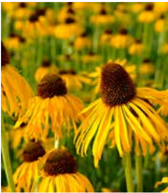
EC6248 ECHINACEA paradoxa

(SAHIN 2010) wonderful mixture, upfacing flowers around the stem, compact plants