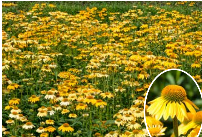
EC6495 ECHINACEA purpurea 'Paradiso Yellow'

Flowers with bright yellow hanging petals, around brown cones, popular perennial