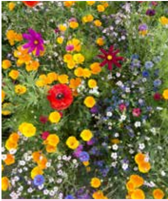
ZZ0220 MIXTURE , 'Bee Mixture'

(SAHIN 2017) quality bee mix consisting of annual and first year perennials, supplying bee food from June - October