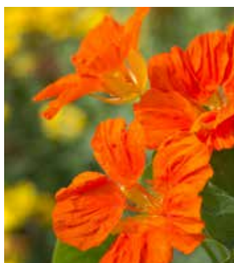
TR8380 TROPAEOLUM minus 'Whirlybird Tangerine'

Propeller-like, semi-double scarlet flowers, bushy plants