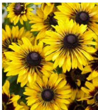
RU1970 RUDBECKIA hirta 'Sputnik'

AGM, golden yellow flowers with dark centres, adaptable, long flowering