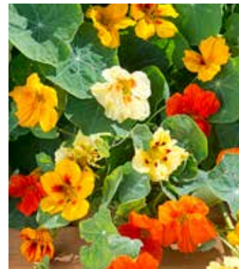
TR8300 TROPAEOLUM majus 'Gleam Field Grown Mixture'

(SAHIN 2019) typical ladybird flowers on variegated foliage