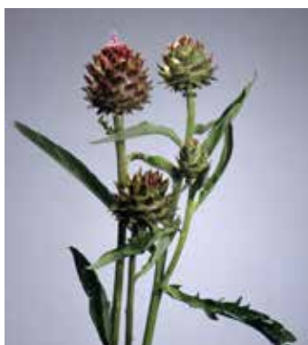
CY7150 CYNARA cardunculus 'Porto Spineless'

Much used in oriental cooking, rubbed seeds for packet trade Also available as Clean seed for professional trade