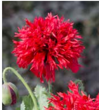
PA3125 PAPAVER laciniatum 'Crimson Feathers'

(SAHIN 1983) violet-purple, good contrast with the lighter colours, reselected