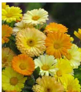
CA0880 CALENDULA officinalis 'Formula Mixture Daisy'

(SAHIN 1986) excellent all-colour progeny-tested mixture