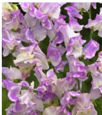
LA7329 LATHYRUS odoratus 'Spencer Pulsar'

Wonderful lime-cream flowers with a blue tinge and veins, strongly scented