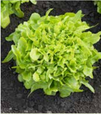
LA1555 LACTUCA sativa 'Baby Oakleaf'

Compact version of the oakleaf type, slow to bolt, very tender and tasty lettuce, 50 days