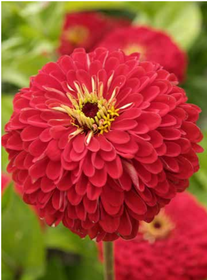
ZI4285 ZINNIA elegans 'Scarlet Flame'

Deep purple, vigorous plants with large rounded fully double flowers