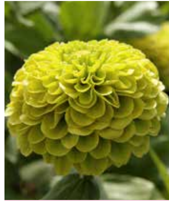
ZI4225 ZINNIA elegans 'Envy'

Coral-rose, vigorous plants with large rounded fully double flowers