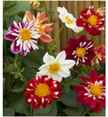
DA0875 DAHLIA variabilis 'Dandy Improved Mix'

(SAHIN 2016) first semi-dwarf cactus flowered dahlia, full colour range