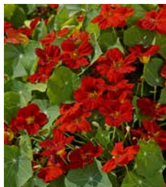
TR8350 TROPAEOLUM minus 'Whirlybird Mahogany'

Propeller-like, semi-double golden yellow flowers, bushy plants