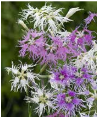
DI3300 DIANTHUS x hybridus 'Rainbow Loveliness'

(SAHIN 1994) mixed colours, heavenly fragrant, elegantly fringed flowers