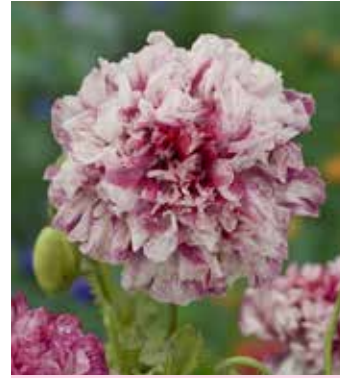
PA2938 PAPAVER somniferum 'Flemish Antique'

(SAHIN 1983) deepest purple, special effect, fully double, true stock