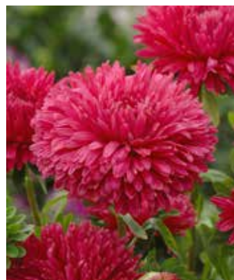
CA2989 CALLISTEPHUS chinensis 'King Size Red'