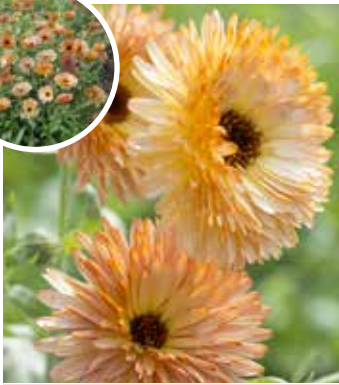
CA0973 CALENDULA officinalis 'Orange Flash'

(SAHIN 2017) very large buff flowers, impressive garden performance