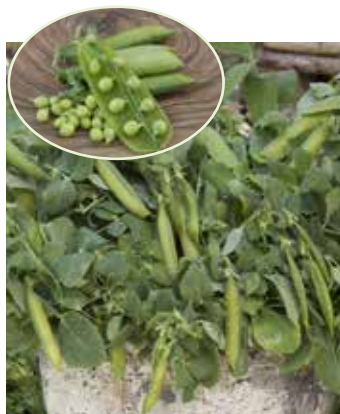
PI2230 PISUM sativum 'Half Pint' Heirloom from 1850, ideal for pots and small beds, compact, well yielding, sweet flavour