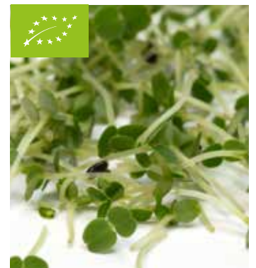
ME6000 MELISSA officinalis 'Lemon Balm ORG '

ORGANIC eat as cress, firm and crispy bite, umami taste, known for cross reactivity with peanut allergy