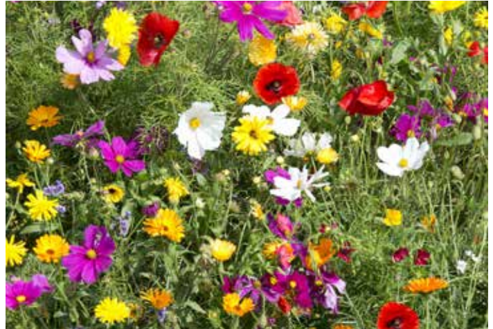
ZZ0255 MIXTURE , 'Verano Mixture'

(SAHIN 2018) very early flowering mix of high quality