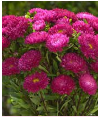
CA2182 CALLISTEPHUS chinensis 'Sahin's Matsumoto Rose'

White petals tipped pink, semi-double flowers, upright habit