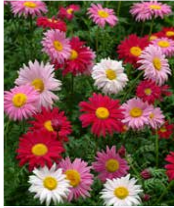
TA8250 TANACETUM coccineum 'Robinson's Giant Mixture'

(SAHIN 2011) Kees Sahin's selection for deepest orange marigold