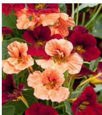
TRMIX01 TROPAEOLUM minus 'Sahin's Rumba'

(SAHIN 2007) superb compact plants with dark foliage, brilliant scarlet flowers