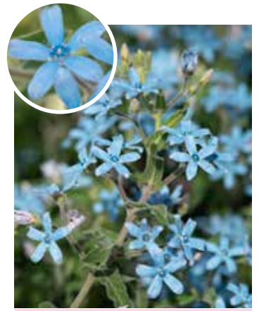
TW5000 TWEEDIA coerulea 'Heavenly Blue'

(SAHIN 1982) tumble-weed, outstanding as everlasting and filler, good autumn colour