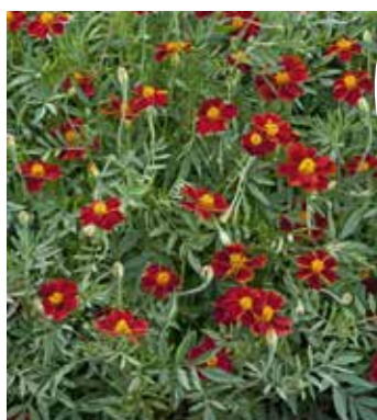
TA4040 TAGETES patula 'Burning Embers'

(SAHIN 2017) fully double chrysanthemum-flowered, formula mixture