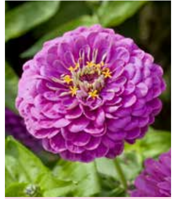
ZI4275 ZINNIA elegans 'Purple Prince'

Orange and gold bicolor, vigorous plants with large rounded fully double flowers