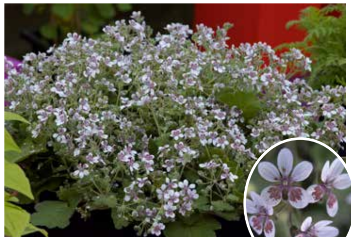
ER6200 ERODIUM pelargoniflorum 'Sweetheart'

(SAHIN 2004) impressive spikes of soft red flowers on compact plants, leaves hairy