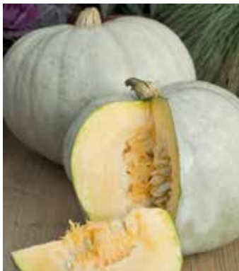
CU2895 CUCURBITA maxima 'Krupnoplodnaya'

Small, light grey fruits, varying from 1 - 4 kgs,