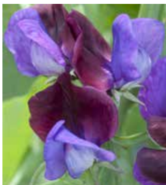
LA6551 LATHYRUS odoratus 'Grandiflora Matucana'

Deep purple standard with bluish-mauve wings, very fragrant