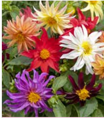
DA0450 DAHLIA variabilis 'Dwarf Cactus Flowered Mix'

Mixed fruits, different colours, mostly pear shaped, most fruits have wings