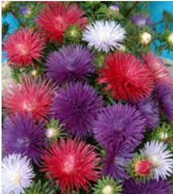
CA1749 CALLISTEPHUS chinensis 'Starlight Formula Mixture'

A mixture of separate colours, compact, base-branching, large spider-type flowers, early