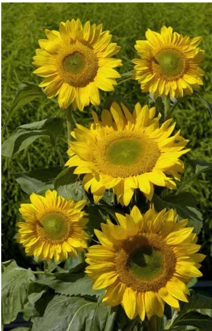
HE2149 HELIANTHUS annuus 'Summer Breeze' F1

(SAHIN 2009) early, single stem, flowers golden-yellow with green discs