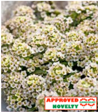
LO2745 LOBULARIA maritima 'Aphrodite Apricot'

(SAHIN 1993) FS-N exciting colour, buff apricot, modern compact habit