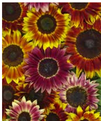
HE2450 HELIANTHUS annuus 'Harlequin' F1

Mixture of all colours and forms, pollenfree, single stemmed and branched