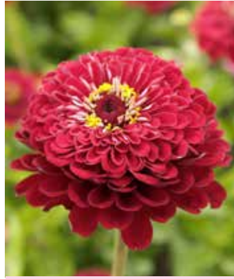
ZI4260 ZINNIA elegans 'Meteor'

Bright pink, vigorous plants with large rounded fully double flowers