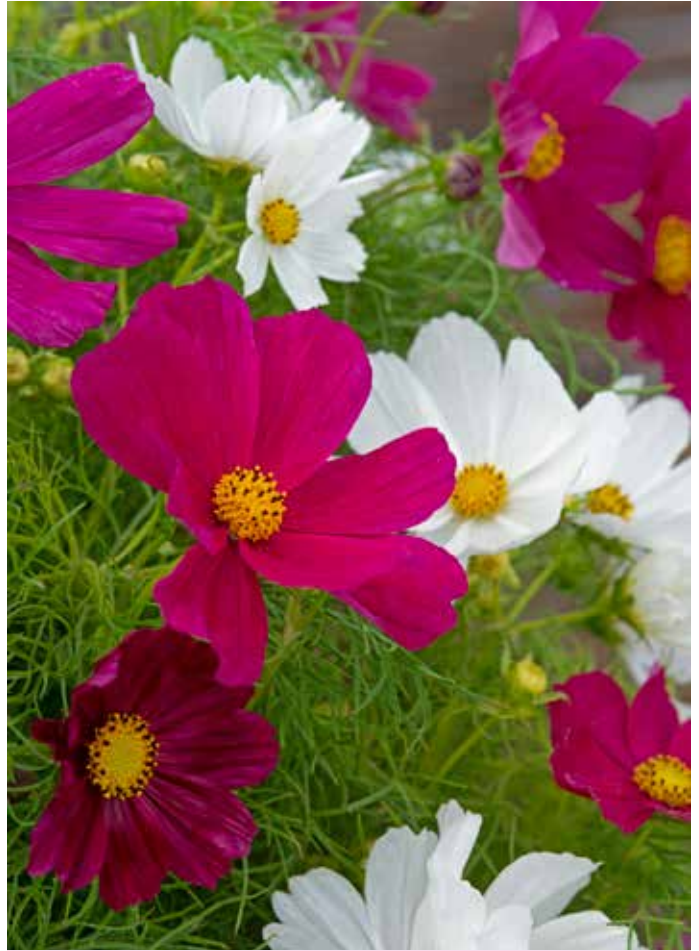
CO9023 COSMOS bipinnatus 'Gazebo Red & White Formula Mix'

(SAHIN 2021) FS-N 2020 unique buff reverse petals on apricot, double flowers