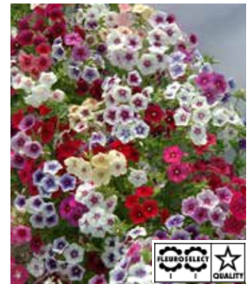
PH3297 PHLOX drummondii 'Grandiflora Tapestry Mixture'

(SAHIN 2002) a mixture of pastel colours with a star-shaped contrast, mouthwatering