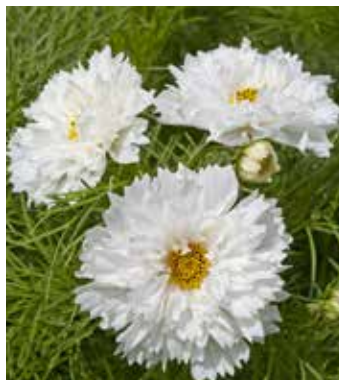
CO9350 COSMOS bipinnatus 'Double Dutch White'

(SAHIN 2020) semi-double and double flowers, even including some double seashell flowers