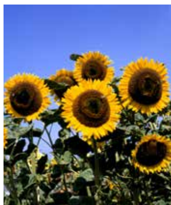
HE2375 HELIANTHUS annuus 'Taiyo'

Golden yellow flowers with dark centres on tall branched stems, unique uniformity