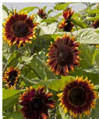
HE2147 HELIANTHUS annuus 'Shock-o-Lat' F1

(SAHIN 2001) striking bicolour in orange-yellow with dark central ring