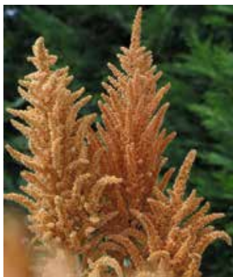
AM1215 AMARANTHUS cruentus 'Hot Biscuits'

(SAHIN 2001) erect spikes of pistachio-green tipped with bronze, autumn cut flower