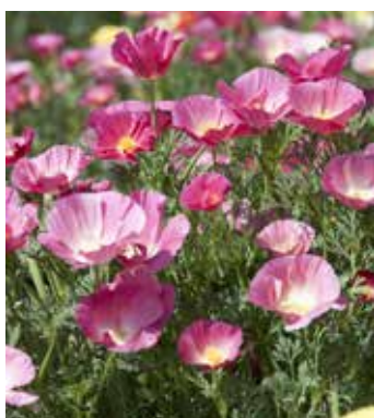
ES4385 ESCHSCHOLZIA californica 'Rose Bush'

(SAHIN 1982) bright carmine-rose, abundant bloomer, tufted habit