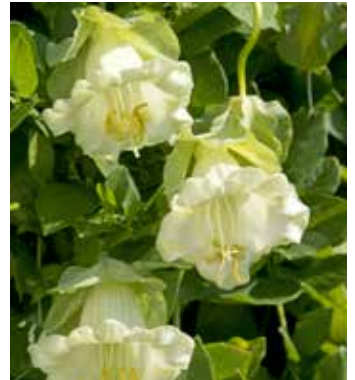
CO0110 COBAEA scandens 'Alba'

AGM, showy climber with many large pure white flowers