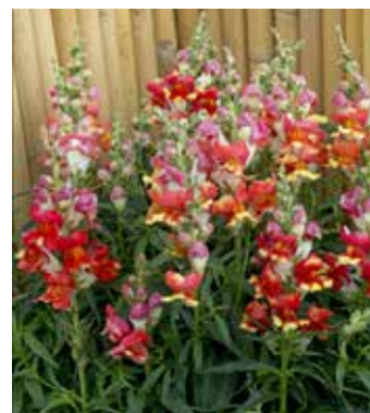
AN6965 ANTIRRHINUM majus 'Rembrandt'

(SAHIN 1992) near black, velvety crimson with silvery throat, dark foliage