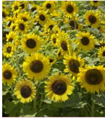
HE1970 HELIANTHUS annuus 'Sunspot'

(SAHIN 1998) branched stems, small leaves, yellow petals with green heart, good for pots