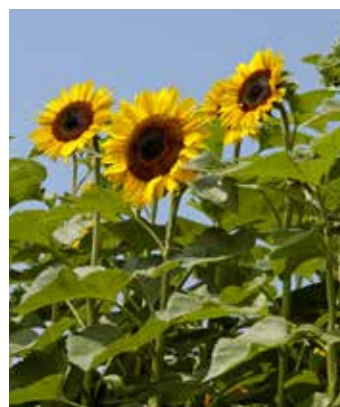
HE2377 HELIANTHUS annuus 'Titan'

Special single stem cut flower strain, golden yellow with black centres, superb