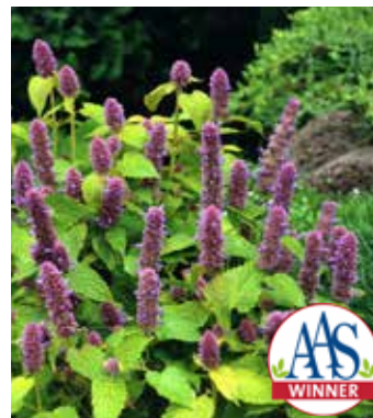
AG2075 AGASTACHE rugosa , 'Golden Jubilee'

(SAHIN 1989) fashionable heather-lilac colour, very showy, aromatic