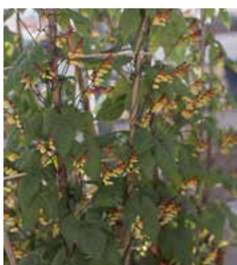
MI6025 MINA lobata 'Jungle Queen'

(SAHIN 2009) hardy strain of the sensitive plant with fluffy pink flowers, prostrate habit