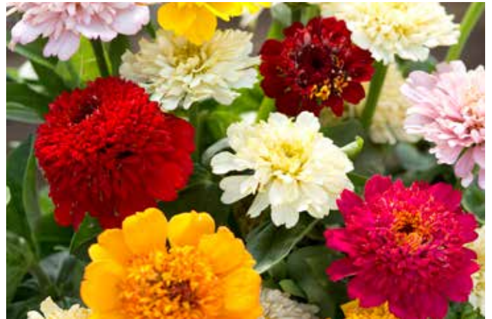
ZI4725 ZINNIA elegans 'Cresto! Formula Mix'

(SAHIN 2019) Cresto! represents high percentage of crested flowers, very good selection