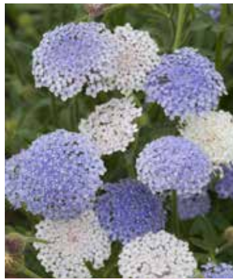
DI6350 DIDISCUS caeruleus 'Lace Mixture'

(SAHIN 1994) mixed colours, heavenly fragrant, elegantly fringed flowers