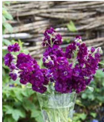
MA8553 MATTHIOLA incana 'Anytime Deep Purple'

Striking bicolour, white with narrow violet stripes, uniform, very popular