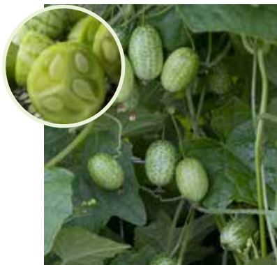
ME6600 MELOTHRIA scabra 'Mouse Melon'

ORGANIC excellent for cress: minty taste, lemon scent when crushed