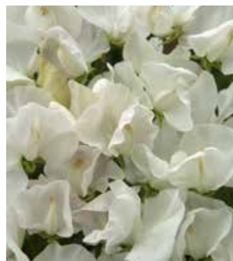
LA7369 LATHYRUS odoratus 'Spencer Royal Wedding'

Lilac speckled and wired on a cream background