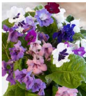
ST6000 STREPTOCARPUS hybrids 'Wiesmoor Hybrids'

(SAHIN 1987) AAS-1987 unique single orange flowers, good in packs