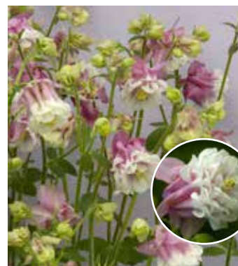
AQ8650 AQUILEGIA vulgaris 'Pink Petticoat'

(SAHIN 1992) petals almost black, contrasting white corollas