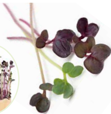
RA6250 RAPHANUS sativus , Radish 'Sango Radish' ORG Original variety with high % of anthocyanin levels, grow for cress, deep red colour, purple stems, pungent taste