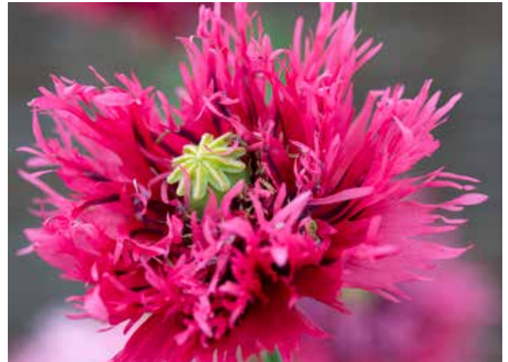
PA3175 PAPAVER laciniatum 'Rose Feathers'

(SAHIN 1993) fluffy balls of deeply lacinated crimson petals