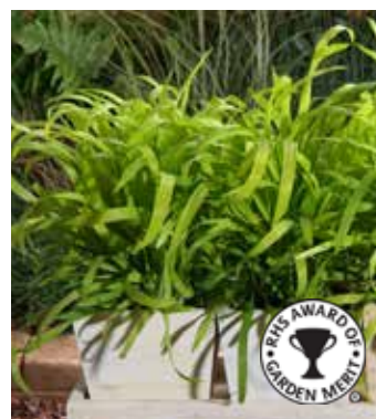
MI2020 MILIUM effusum 'Aureum'

(SAHIN 1996) exciting mixture of pastel colours, sweet evening fragrance