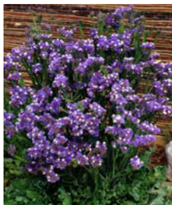
LI3655 LIMONIUM sinuatum 'Forever Blue'

(SAHIN 2010) unique dwarf variety, large white flowers with pink striations