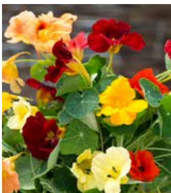
TR8799 TROPAEOLUM minus 'Tip Top Formula Mixture'

(SAHIN 1990) mixture of separate colours