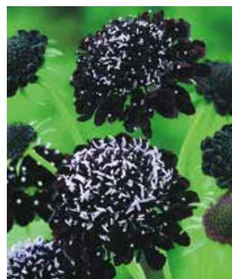
SC0377 SCABIOSA atropurpurea 'Black Knight'

(SAHIN 1985) deep blue flowers with dark central blotches, stunning effect