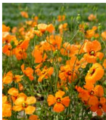
ST9000 STYLOMECON heterophyllum 'Copper Queen'

Complete colour range, large flowers, reselected for compact foliage