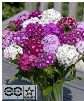
DI0500 DIANTHUS barbatus 'Hollandia Complete Mixture'

(SAHIN 1990) FS-Q 1991, a superb colour range of Sweet Williams, flowers first year