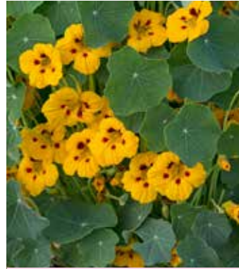
TR8770 TROPAEOLUM minus 'Ladybird'

(SAHIN 2010) mix of the separate Ladybird colours