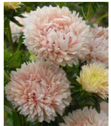
CA2979 CALLISTEPHUS chinensis 'King Size Apricot'

Upright tall stems, fully double large flowers