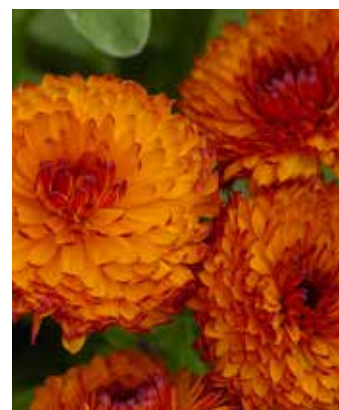
CA0972 CALENDULA officinalis 'Neon'

(SAHIN 2014) close to original marigolds and a funky habit, adds interest to the garden