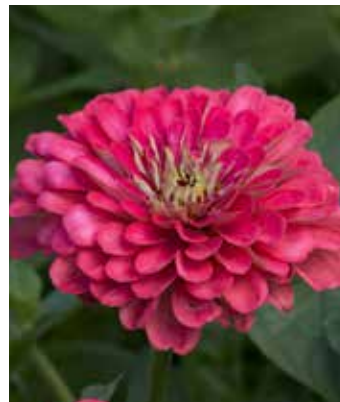
ZI4245 ZINNIA elegans 'Illumination'

Golden orange in bud, changing to deep orange, large rounded fully double flowers