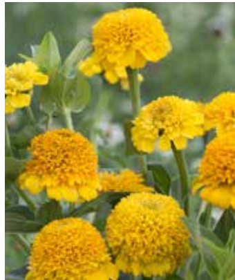
ZI4724 ZINNIA elegans 'Cresto! Yellow'

(SAHIN 2019) Cresto! represents high percentage of crested flowers, very good selection