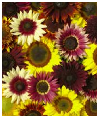
HE2400 HELIANTHUS annuus 'Summertime Mixture' F1

Mixture of all colours and forms, pollenfree, single stemmed and branched