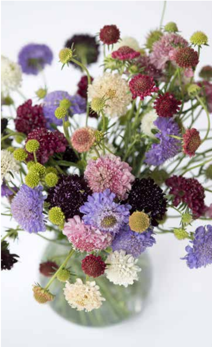
SC0399 SCABIOSA atropurpurea 'Formula Mixture'

(SAHIN 1990) reselected, salmon-rose medium-sized flowers, long strong stems