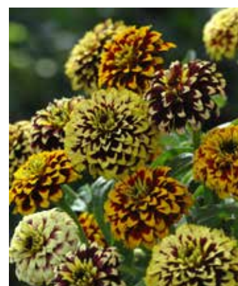
ZI8585 ZINNIA haagena , 'Jazzy Mixture'

Extra-select, large semi-cactus flowers, petal ends in contrasting colours