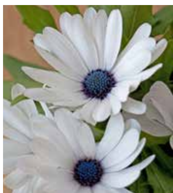
OS6000 OSTEOSPERMUM ecklonis 'Sky and Ice'

(SAHIN 2015) charming plant with scented white flowers, silvery foliage, very easy