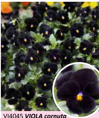
VI4045 VIOLA cornuta 'Back to Black'

(SAHIN 2018) now this is a truly black viola, ideal for mix containers