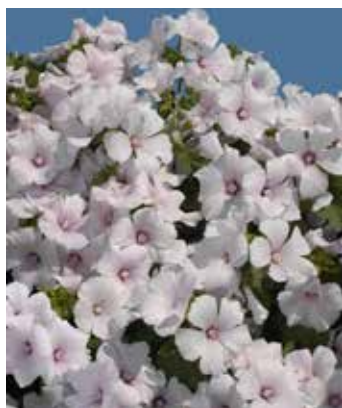
LA8410 LAVATERA trimestris 'New Dwarf Pink Blush'

(SAHIN 2010) floriferous perennial, golden-yellow blooms, luminous against the variegated foliage