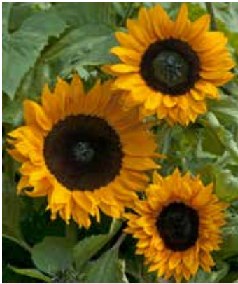
HE2116 HELIANTHUS annuus 'Copper Queen' F1