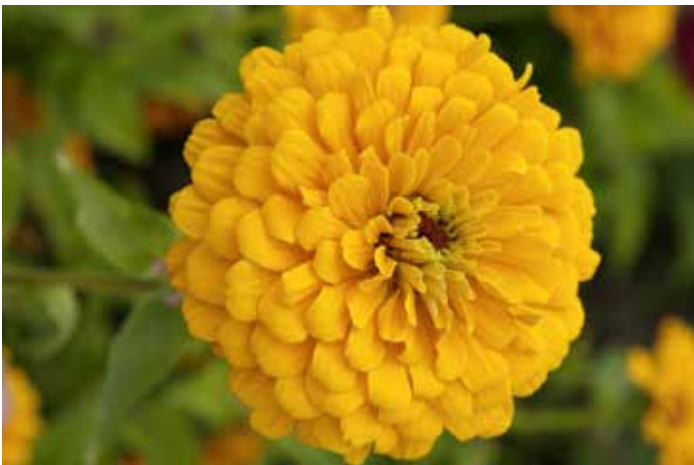
ZI4235 ZINNIA elegans 'Golden State'

Light rose with deeper rose centre, vigorous plants with large rounded fully double flowers