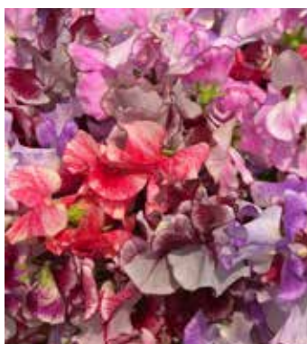
LA7498 LATHYRUS odoratus 'Spencer Ripple Formula Mixture'

Burgundy coloured swirls on a cream background