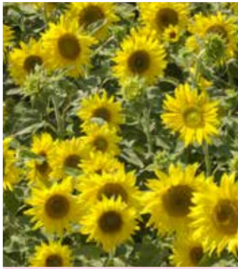
HE1950 HELIANTHUS annuus 'Irish Eyes'

(SAHIN 1998) branched stems, small leaves, yellow petals with green heart, good for pots