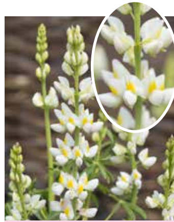
LU4595 LUPINUS mutabilis var. cruckshankii 'Javelin White'

(SAHIN 1996) elegant long spikes of lilac scented flowers with white and yellow keels