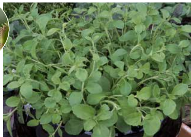
ST2100 STEVIA rebaudiana 'Sweet Herb' (Sahin 1999) extremely sweet leaves, natural sweetener with low calorific value, used fresh or dried to sweeten food and beverages