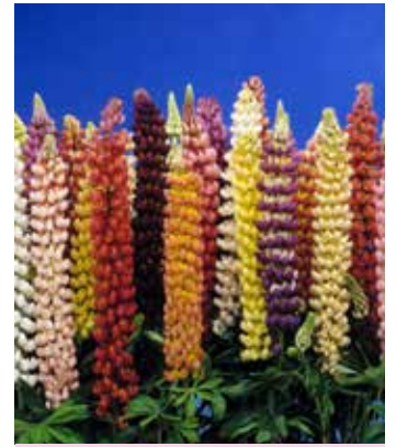
LU6000 LUPINUS polyphyllus 'New Millennium Mixed'

(SAHIN 1996) elegant long spikes of white scented flowers with white and yellow keels