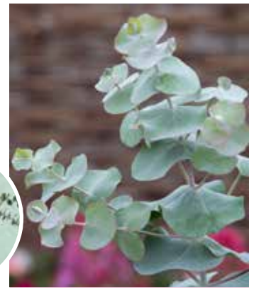
EU0560 EUCALYPTUS pulverulenta 'Silver-leaved mountain gum'

(SAHIN 1982) standard in quality foliage, round blue leaves, coppice, mostly juvenile