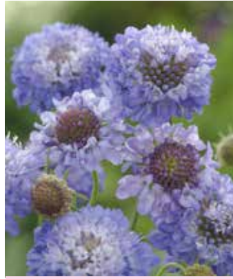
SC0387 SCABIOSA atropurpurea 'Oxford Blue'

(SAHIN 1990) our reselected stock, bright red medium-sized flowers, long strong stems