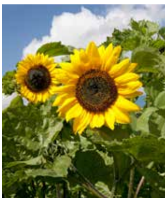
HE2367 HELIANTHUS annuus 'Sunshine'

Golden yellow flowers with dark centres on tall branched stems, unique uniformity