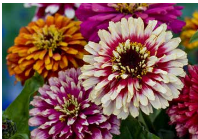
ZI5850 ZINNIA elegans , 'Whirlygig Improved Mixture'

(SAHIN 1990) white flowers, powerfully fragrant at night, charming along paths