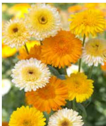
CA0599 CALENDULA officinalis 'Kinglet Formula Mixture'

(SAHIN 1993) strong and tall stems, excellent yellow and green filler