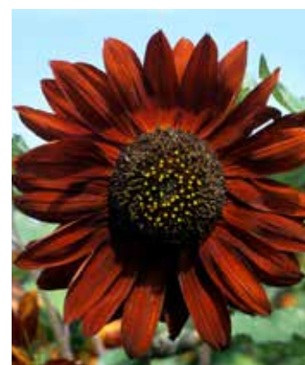
HE2385 HELIANTHUS annuus 'Velvet Queen'

(SAHIN 1996) uniform and much improved 'Uniflorus Giganteus', largest seed of all