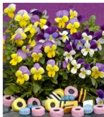
VI8250 VIOLA cornuta 'Sweeties'

(SAHIN 2008) mix of all xwill. hybrids incl. bicoulores and unusual colours, striking contrast