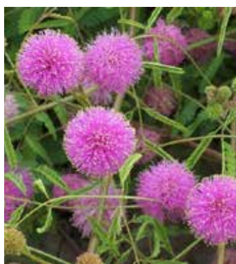
MI4040 MIMOSA 'Pink Sparkles'

(SAHIN 2006) AGM, elegant, arching, bright golden yellow leaves for semishade