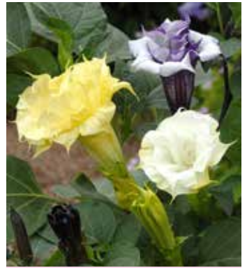
DA7249 DATURA metel 'Ballerina Formula Mixture'

(SAHIN 1998) magnificent double, upfacing, soft yellow trumpets, fragrant, superb pot plant