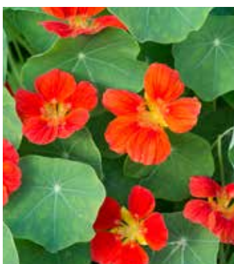
TR8370 TROPAEOLUM minus 'Whirlybird Scarlet'

Propeller-like, semi-double rosy brown flowers, bushy plants