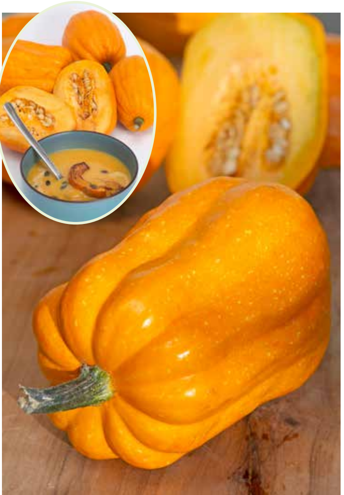
CU4017 CUCURBITA pepo 'Gill's Golden Pippin'

Insignificant flowers, deep green leaves, white stems, harvest 08-10