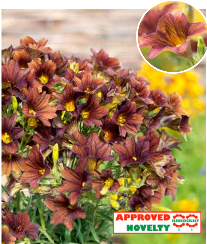
SA1140 SALPIGLOSSIS sinuata 'Cafe au Lait'

(SAHIN 2021) unusual colour for flowers: petals of coffee-colour with deep purple veins, golden yellow centres