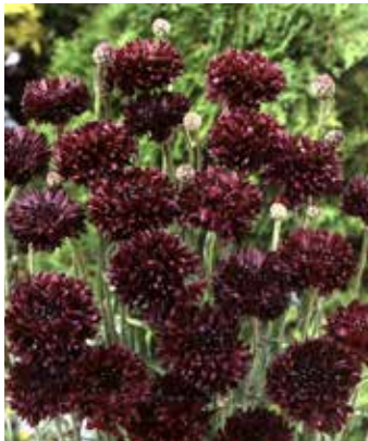
CE4977 CENTAUREA cyanus 'Black Boy'

Mixture of all colours, superb strain, fully double large flowers