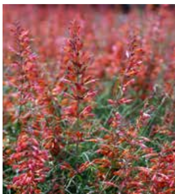
AG2090 AGASTACHE rupestris 'Apache Sunset'

(SAHIN 2000) deep orange flowers over aromatic grey foliage