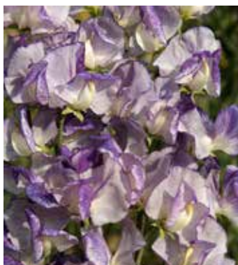
LA7255 LATHYRUS odoratus 'Spencer Nimbus'

Brilliant scarlet speckles and wired on a white background