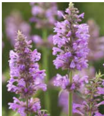
AG2177 AGASTACHE pallidiflora subsp. neomexicana 'Rose Mint'

(SAHIN 2000) deep orange flowers over aromatic grey foliage