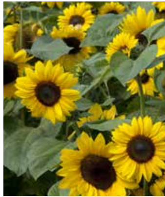
HE2125 HELIANTHUS annuus 'Soleo' F1

(SAHIN 1996) flowers with long yellow petals and dark discs, the earliest of all