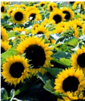
HE2138 HELIANTHUS annuus 'Mezzulah' F1

(SAHIN 2000) delightful pastel mixture of small multicoloured flowers, branched