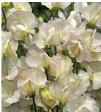
LA7271 LATHYRUS odoratus 'Spencer Old Times'

Greyish white flowers with streaks of inky blue-black