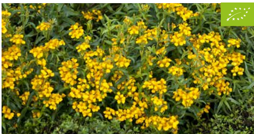
TA0750 TAGETES lucida 'Sweet Mace' (Sahin 2000) glossy leaves with small orange flowers, ornamental, medicinal and culinary use, anise-flavoured