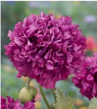
PA2965 PAPAVER somniferum 'Purple'

(SAHIN 1993) salmon-rose, edges fading with age, wonderful effect