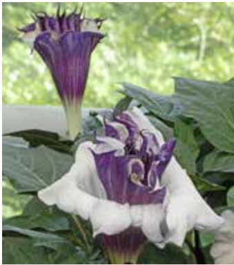
DA7235 DATURA metel 'Ballerina Purple'

(SAHIN 2014) re-selected stock resulting in nearly 100% collarette-type flowers