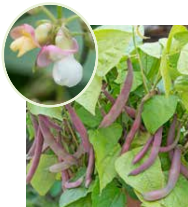
PH1290 PHASEOLUS vulgaris 'Red Swan'

Eat as snap at 60 days, shell bean at 80 days or as dry bean when left to mature, pole bean