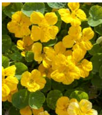
TR8340 TROPAEOLUM minus 'Whirlybird Gold'

Propeller-like, semi-double cream flowers, bushy plants