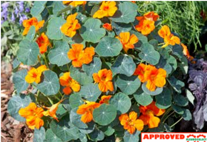
TR8410 TROPAEOLUM minus 'Baby Orange'