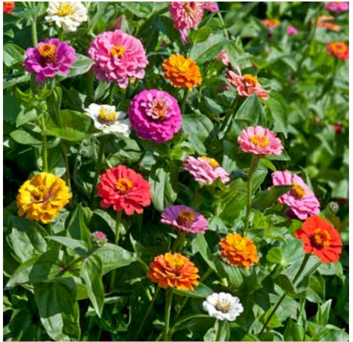
ZI5250 ZINNIA elegans 'Cut & Come Again Fieldgrown Mix'

Good colour range, high percentage of striped and mottled flowers