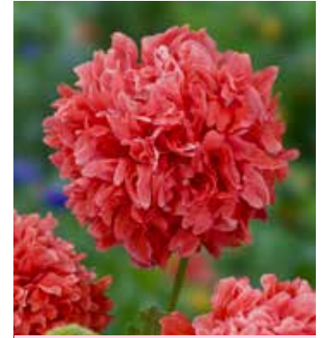
PA2940 PAPAVER somniferum 'Frosted Salmon'

(SAHIN 1996) fully double flowers in shades of red and rose, striped creamy white