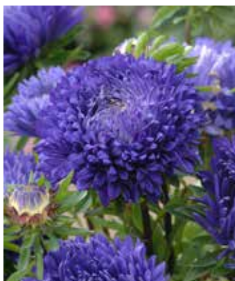
CA2983 CALLISTEPHUS chinensis 'King Size Mid Blue'

Unusual orange-apricot colour, fully double large flowers