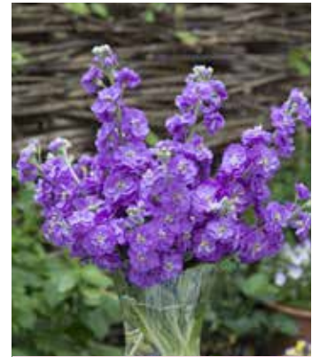
MA8560 MATTHIOLA incana 'Anytime Lavender'

(SAHIN 2017) tall cut flower for summer, 100% selectable for double