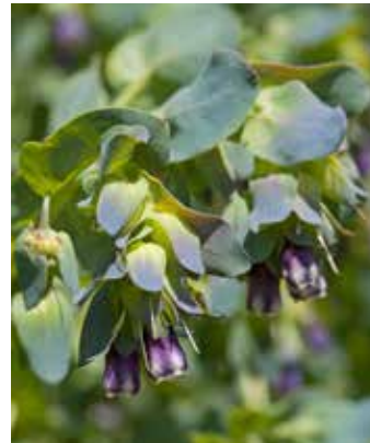
CE9770 CERINTHE major 'Purpurascens Pride of Gibraltar'

(SAHIN 1998) brilliant blue-tinged bracts and stems, purple flowers