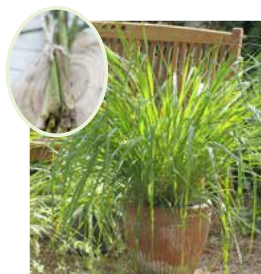
CY7020 CYMOPOGON flexuosus 'Lemon Grass'

Long pie pumpkin of Maine origin, best pie flavour, fruits ripen from green to orange in storage, somewhat variable in shape and size, 30-60 cms, 2,5-4 kgs, 95 days