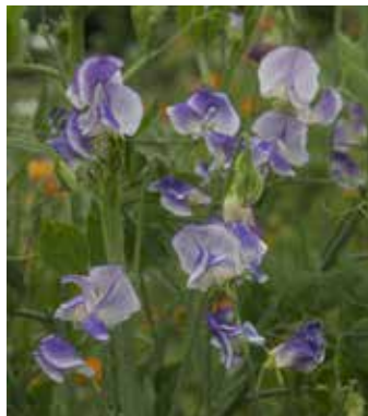
LA6929 LATHYRUS odoratus 'Spencer Blue Ripple'

Lavender-blue, frilly blooms, strong stems, very fragrant