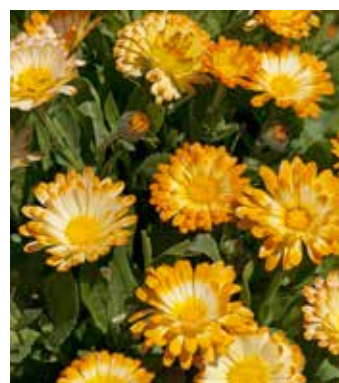
CA0927 CALENDULA officinalis 'Oopsy Daisy'

Large, fully double, deep orange flowers, impressive garden performance