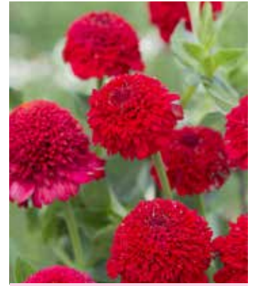
ZI4715 ZINNIA elegans 'Cresto! Red'

(SAHIN 2019) Cresto! represents high percentage of crested flowers, very good selection