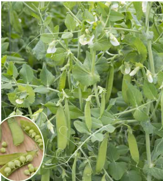
PI2160 PISUM sativum 'British Wonder'

Dutch heirloom, purple pods and flowers, can be eaten fresh or dried, 85 days