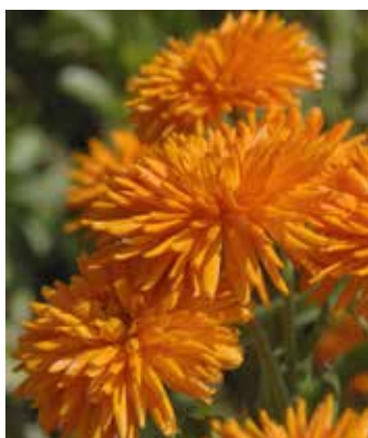
CA0976 CALENDULA officinalis 'Porcupine Orange'

(SAHIN 2005) ultra double flowers with densely set deep orange petals edged in burgundy