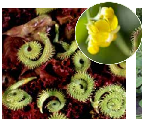
SC9060 SCORPIUS muricatus 'Prickly Caterpillar' Curious coiled pods which look like caterpillars, to enliven salads