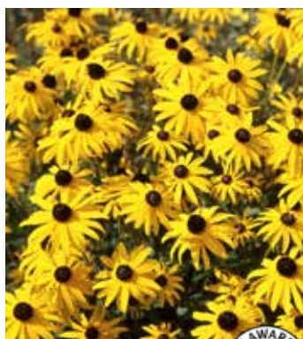
RU1300 RUDBECKIA fulgida 'Goldsturm'