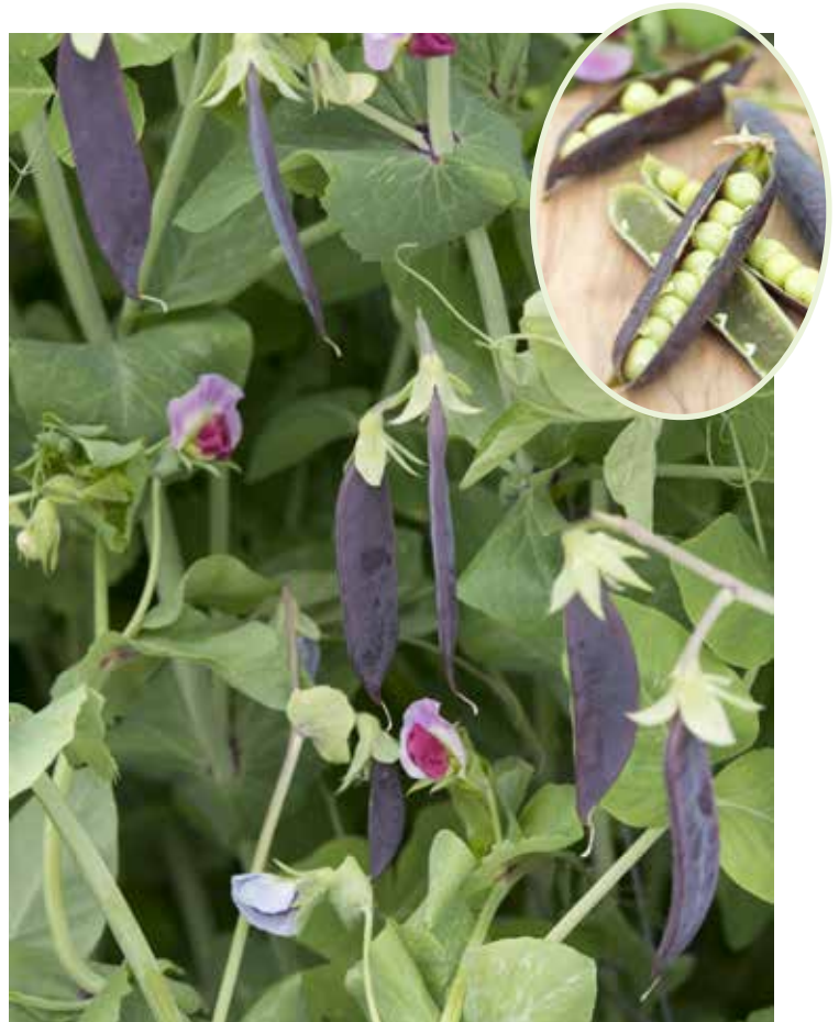
PI2150 PISUM sativum 'Blauwschokkers'

Small purple-tinged fruits, sharp flavour. Harvest 08-09