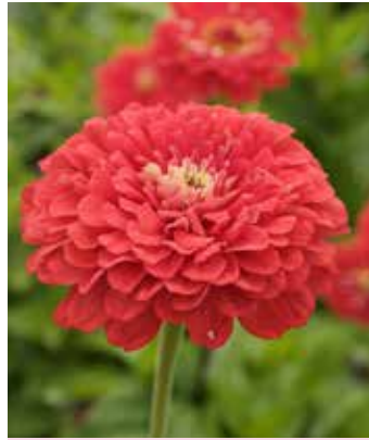
ZI4217 ZINNIA elegans 'Coral Beauty'

Canary-yellow, vigorous plants with large rounded fully double flowers