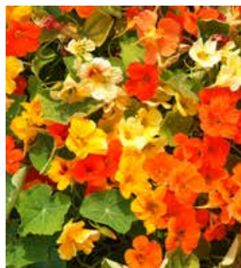
TR8800 TROPAEOLUM minus 'Tip Top Mixed Colours'

(SAHIN 1990) mixture of separate colours