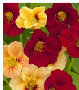
TRMIX02 TROPAEOLUM minus 'Sahin's Paso Doble'

(SAHIN 2012) Mixture of wonderful colours over dark foliage