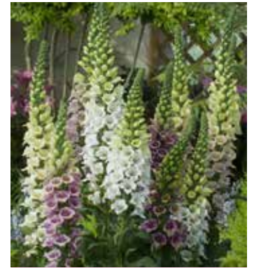
DI7237 DIGITALIS purpurea 'Candy Mountain Mixed'

(SAHIN 2005) unique, compact plants, upfacing flowers around the spike in rose shades