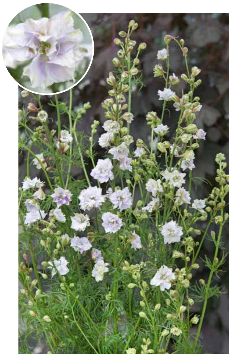
DE5095 DELPHINIUM consolida 'Fancy Smokey Eyes'

(SAHIN 2011) wonderful double flower with fancy picotee effect