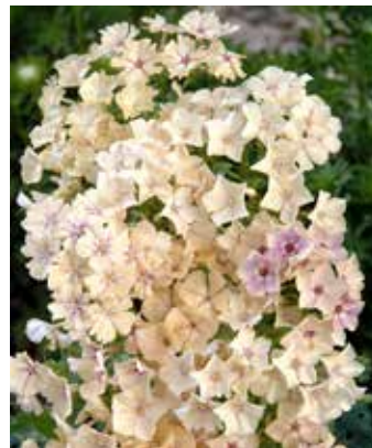
PH3227 PHLOX drummondii 'Grandiflora Creme Brulee'

(SAHIN 1999) beautiful umbels of large white, lace-like flowers, good new filler