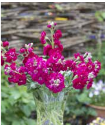
MA8580 MATTHIOLA incana 'Anytime Red'

(SAHIN 2017) tall cut flower for summer, 100% selectable for double