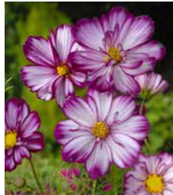
CO9125 COSMOS bipinnatus 'Fizzy Rose Picotee'

(SAHIN 2009) exciting new Cosmos with semi-double, rosy white flowers with ruby edge