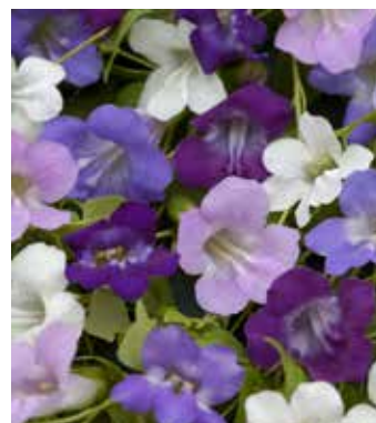
AS0750 ASARINA scandens 'Formula Mix'

(SAHIN 1989) charming sky-blue, large flowers, free flowering