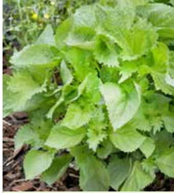
ATY132 PERILLA frutescens 'Perilla Green'

Dark, wine red leaves, delicate texture and unique taste, for salads and cress