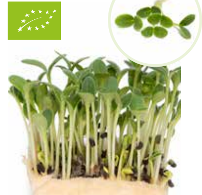
BO2550 BORAGO officinalis ORG

Sweet baby beet with excellent taste when lifted young or leave to mature for full beetroot flavour