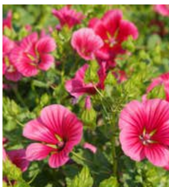
MA3675 MALOPE trifida 'Vulcan'

(SAHIN 2000) erect spikes of fragrant soft pink flowers changing to rose with age