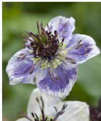
NI7110 NIGELLA papillosa 'Delft Blue'

(SAHIN 2004) FS-Q 2004, large pure white flowers with contrasting almost black seed pods