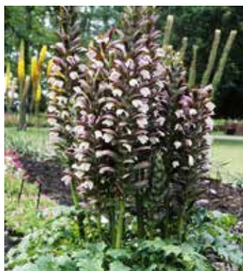
AC3250 ACANTHUS mollis

White flowers tinged with pink on stout spikes, highly ornamental foliage, excellent for landscaping