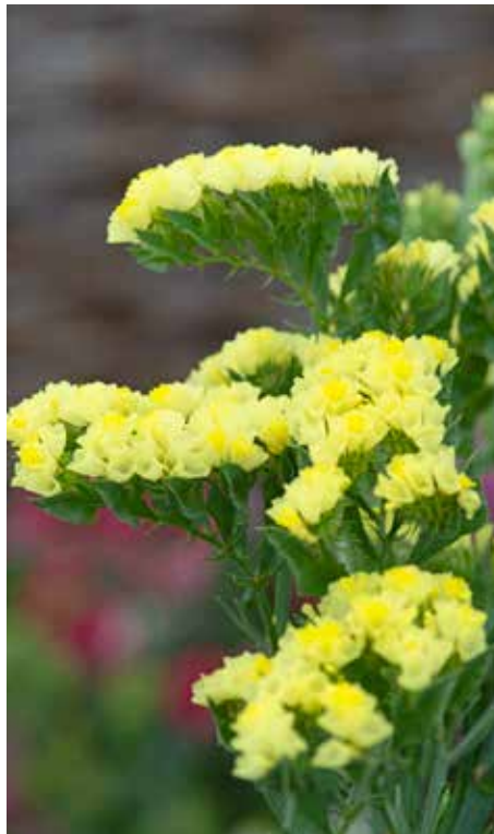
LI3679 LIMONIUM sinuatum 'Forever Moonlight'

(SAHIN 1993) shades of pink, salmon and apricot