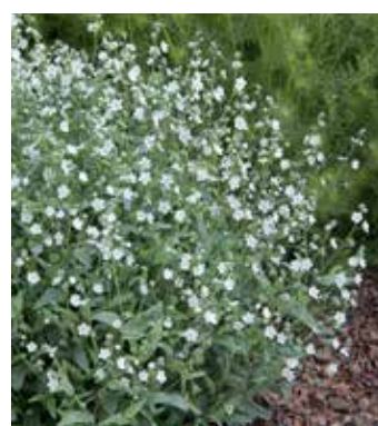
OM5000 OMPHALODES linifolia 'Little Snow White'

Flowering tobacco, hot chocolate coloured flowers, good contrast with green calyx