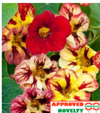
TR9112 TROPAEOLUM minus , 'Bloody Mary'

(SAHIN 2002) velvety-black flowers, unique colour in Nasturtium