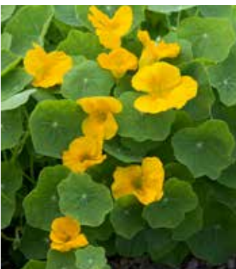
TR8765 TROPAEOLUM minus 'Tip Top Gold'

(SAHIN 1991) FS-Q 1992, fashionable apricot flowers with deeper markings