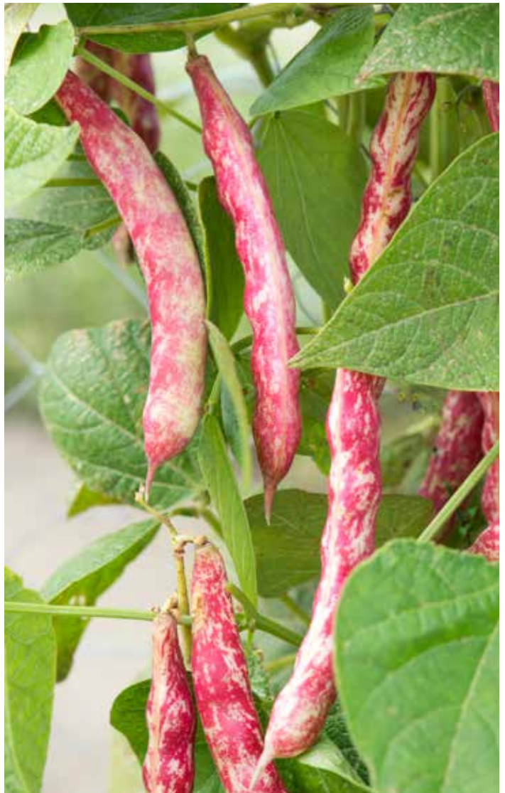
PH1295 PHASEOLUS vulgaris 'Speckled Cranberry'

First stringless polebean, originally introduced by W. Atlee Burpee in 1855, 80 - 100 days