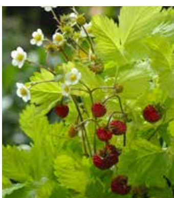
FR0560 FRAGARIA vesca 'Red Wonder'

(Sahin 1982) red-leaved fennel, bronze-tinged flowers, used as herb and for landscaping