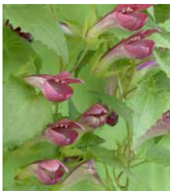
AS0775 ASARINA wislizensis 'Red Dragon'

(SAHIN 1999) impressive large crimson-red flowers on pendulous shoots, superb for baskets