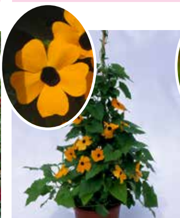
TH7430 THUNBERGIA alata 'Aurantiaca Oculata'

Originating from the Swedish Linnaeus Gardens in Uppsala, Sweden