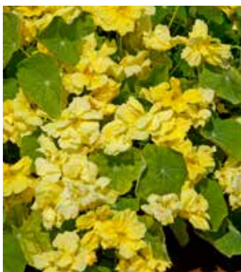
TR8315 TROPAEOLUM minus 'Whirlybird Cream'

Mixture of the separate colours, fewer doubles