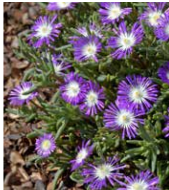
DE3200 DELOSPERMA floribundum 'Stardust'

(SAHIN 2005) purple-red Mesembrianthemum-like flowers on flat growing plants