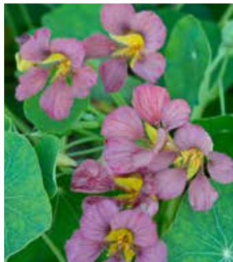
TR7960 TROPAEOLUM majus 'Purple Emperor'

(SAHIN 2002) nearest to white, unique within the genus