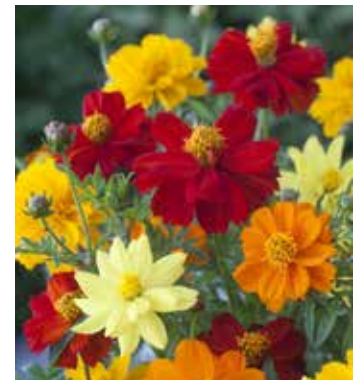
CO9699 COSMOS sulphureus 'Brightness Formula Mixture'

(SAHIN 2020) very compact, healthy and bushy plant, red flowers