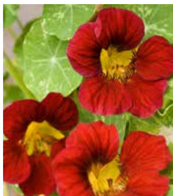
TR8968 TROPAEOLUM minus 'Tip Top Alaska Red Shades'

(SAHIN 2014) deep red flowers against marbled foliage, sometimes throws a rose flower