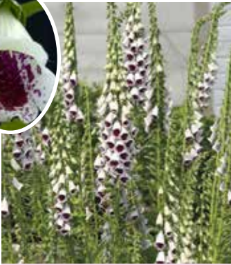
DI7165 DIGITALIS purpurea 'Pam's Choice'

White with solid dark red blotch in throat, an impressive stature