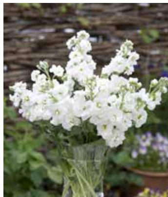
MA8590 MATTHIOLA incana 'Anytime White'

(SAHIN 1999) tall stems for cut flower use, flowers well in summer