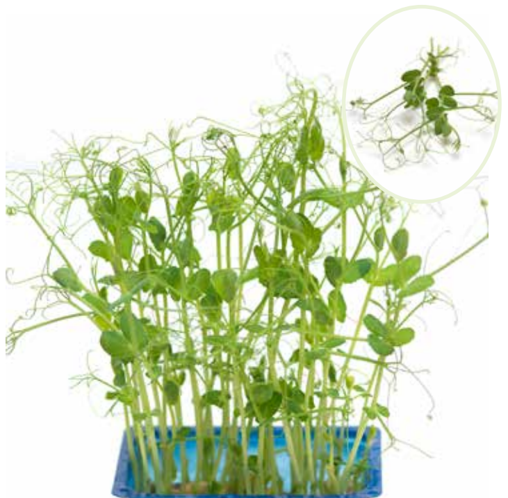
PI2240 PISUM sativum 'Zefier'

Dwarf shelling pea, high yield, 55-60 days