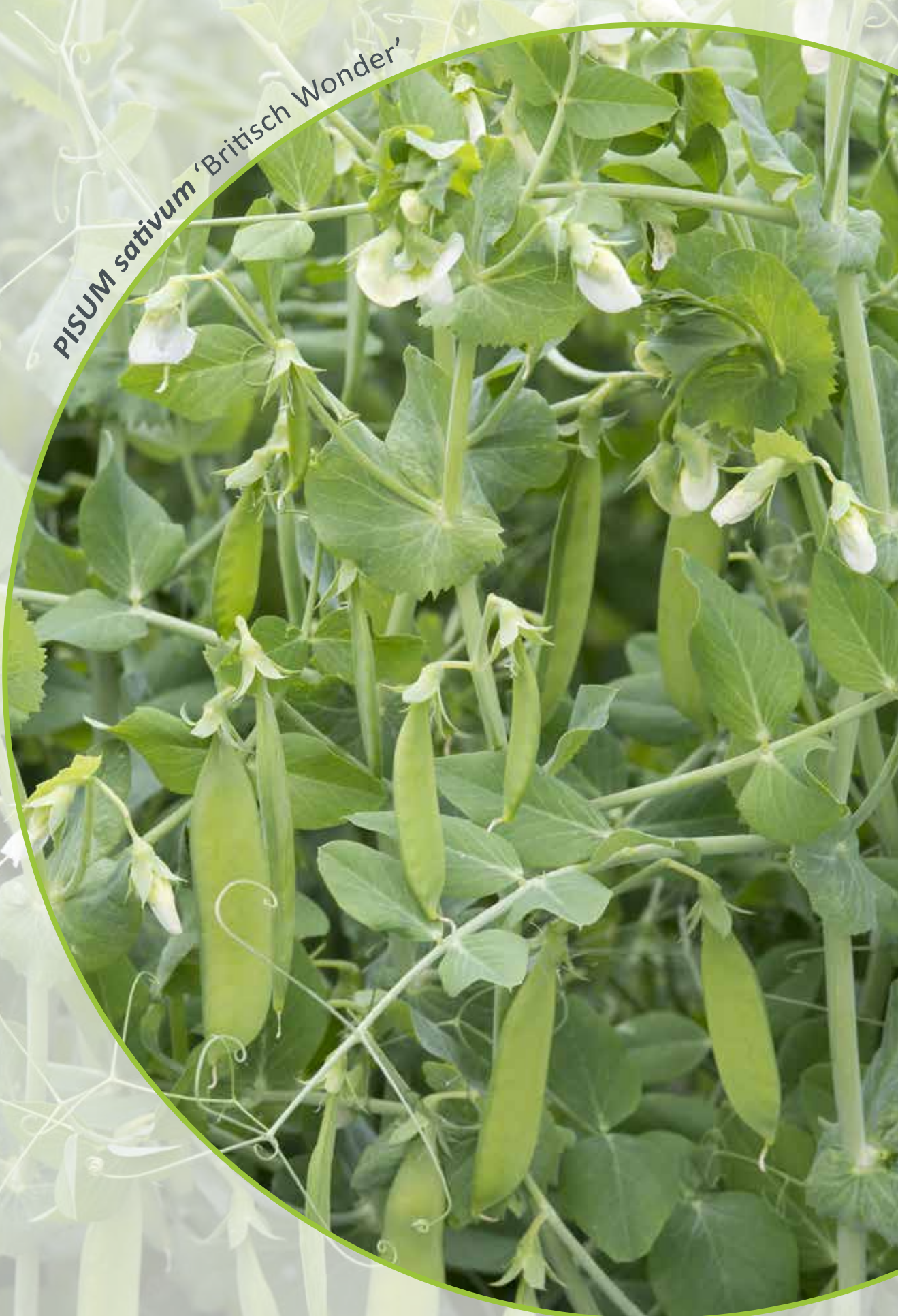
PISUM sativum 'Britisch Wonder'