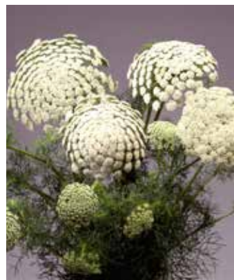
AM5950 AMMI visnaga 'Green Mist'

(SAHIN 2004) intense crimson foliage and inflorescence