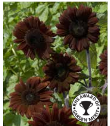
HE2113 HELIANTHUS annuus 'Claret' F1

(SAHIN 2008) AGM, new colour in spray-type pollenfree, sunflower, very early