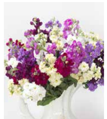
MA8599 MATTHIOLA incana 'Anytime Formula Mix'

(SAHIN 2017) tall cut flower for summer, 100% selectable for double