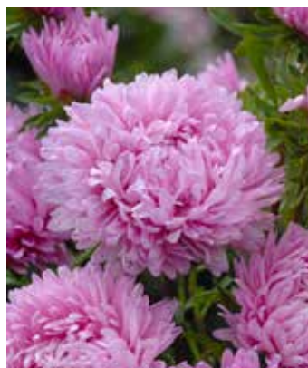
CA2987 CALLISTEPHUS chinensis 'King Size Pink'

Medium depth, true blue, fully double large flowers