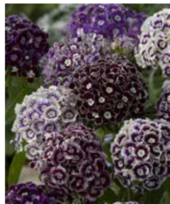
DI0530 DIANTHUS barbatus 'Hollandia Purple Crown'

(SAHIN 1990) FS-Q 1991, a superb colour range of Sweet Williams, flowers first year