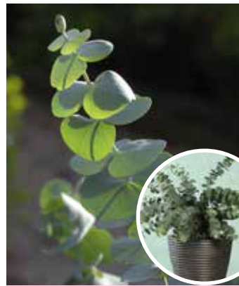
EU0555 EUCALYPTUS pulverulenta 'Baby Blue Spiral'

Creates a wonderful soft and gentle effect in the garden and in bouquets