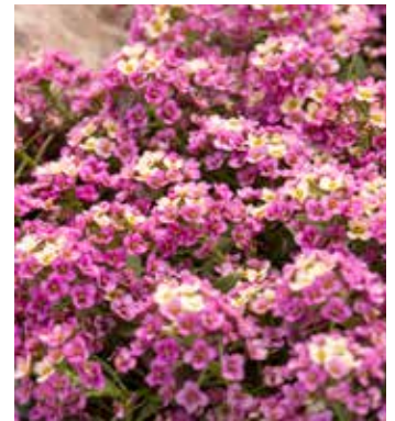
LO2790 LOBULARIA maritima 'Aphrodite Wine Red'

(SAHIN 2000) compact plants with silvery white flowers