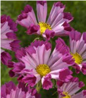
CO9180 COSMOS bipinnatus 'Sea Shells Red'

(SAHIN 2007) wonderful, clear white, semi-double flowers