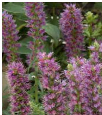
EC8500 ECHIUM amoenum 'Eclat'

(SAHIN 2008) improved stock with better ratio of first year flowering colours