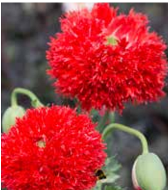
PA3182 PAPAVER laciniatum 'Scarlet'

(SAHIN 1993) fluffy balls of deeply lacinated rose petals, elegant