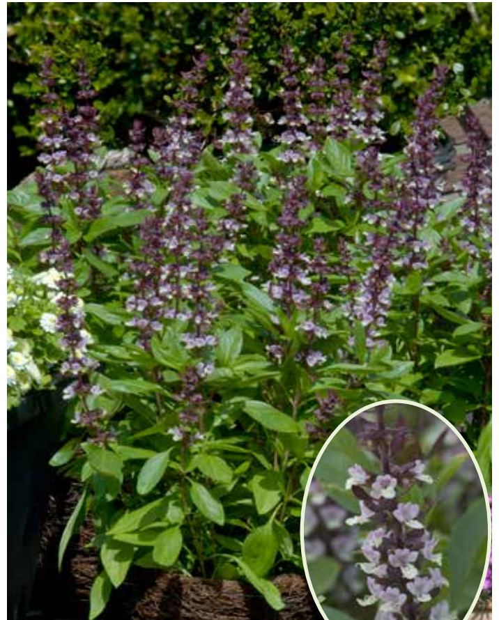
OC6020 OCIMUM basilicum 'Spice Boys Queen of Sheba'

Heirloom chantenay carrot with very distinct heart shape, can weigh upto 500 gram, good for heavy soils and containers