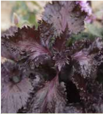
ATY131 PERILLA frutescens 'Perilla Red'

Dark, wine red leaves, delicate texture and unique taste, for salads and cress