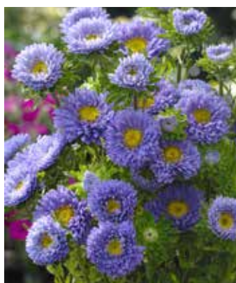
CA2172 CALLISTEPHUS chinensis 'Sahin's Matsumoto Light Blue'

A lavender-blue colour, semi-double flowers, upright habit