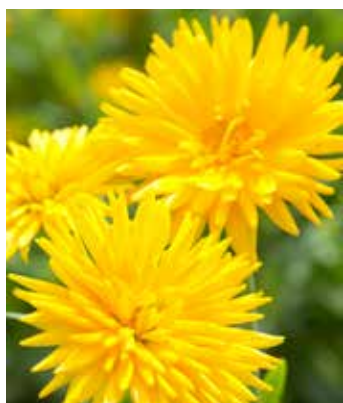
CA0977 CALENDULA officinalis 'Porcupine Yellow'

(SAHIN 2001) quilled petals forming spiky flowers, bright orange flowers