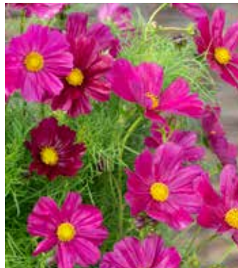
CO9020 COSMOS bipinnatus 'Gazebo Red'

(SAHIN 2012) dwarfest variety within 'Incredible!' series, contains wide range of colours