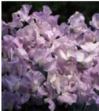
LA6887 LATHYRUS odoratus 'Spencer Arthur Hellyer'

Deep purple standard with bluish-mauve wings, very fragrant