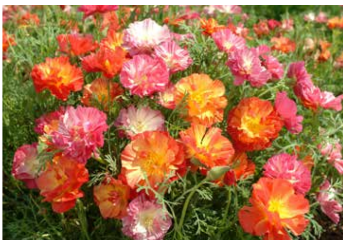
ES4500 ESCHSCHOLZIA californica 'XL Jelly Beans'

(SAHIN 1982) bright carmine-rose, abundant bloomer, tufted habit