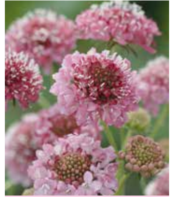
SC0392 SCABIOSA atropurpurea 'Salmon Queen'

(SAHIN 1990) reselected, deep blue medium-sized flowers