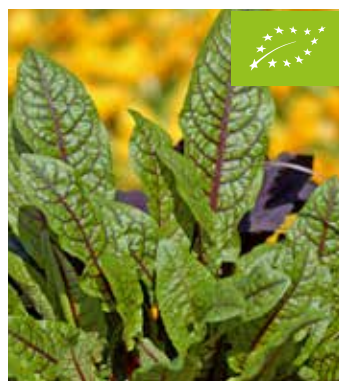
RU6025 RUMEX sanguineus , 'Bloody Dock' Long green leaves with brilliant red veining, superb contrast even in early stages, ideal for baby leaf and salads