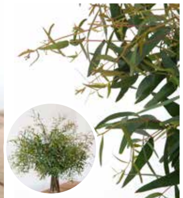
EU0910 EUCALYPTUS nicholii 'Willow Peppermint'

For container growing, strong lemon fragrance, insect repellent