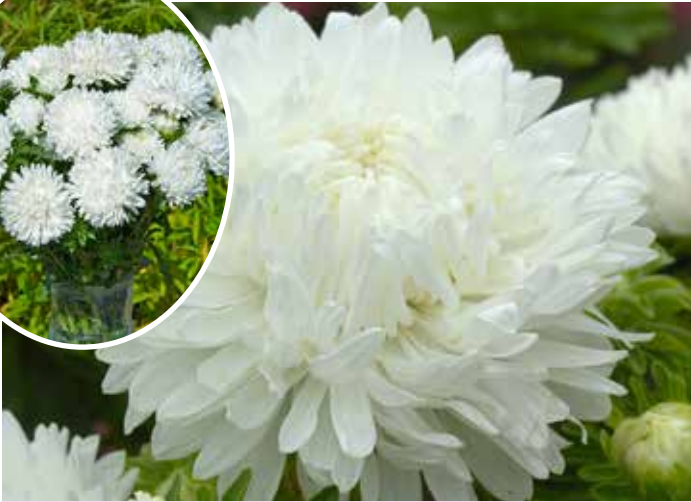
CA2995 CALLISTEPHUS chinensis 'King Size White'