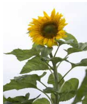
HE2310 HELIANTHUS annuus 'Mongolian Giant'

(SAHIN 2001) abundant deep ruby flowers, very attractive for the border or cutting