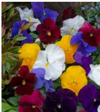
VI5450 VIOLA xwittrockiana 'Ariana Formula Mix'

(SAHIN 2020) formula mix of large flowered pansies, most colours are blotchless