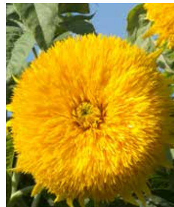
HE2366 HELIANTHUS annuus 'Double Sunking' (SAHIN 2017) re-selected, fully double flowers, on strong tall stems, extremely uniform, golden-yellow

(SAHIN 1987) high percentage of double golden-orange flowers, single stem