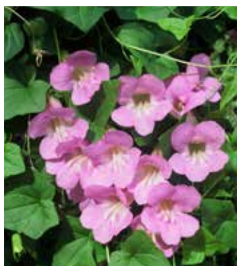
AS0720 ASARINA scandens 'Mystic Rose'

(SAHIN 1990) deep violet-blue, showy and useful, easy climber