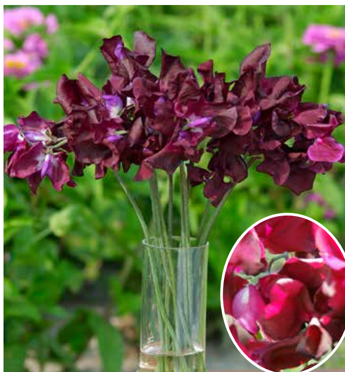
LA7211 LATHYRUS odoratus 'Spencer Midnight' Dark chocolate with a bright purple flash at the base, wonderful deep dark colour