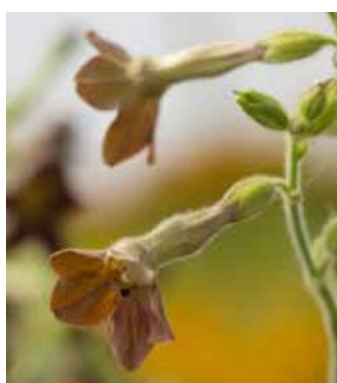
NI1780 NICOTIANA langsdorfii 'Bronze Queen'

(SAHIN 1998) robust selection, crimson-orange to yellow flowers, short-day plant