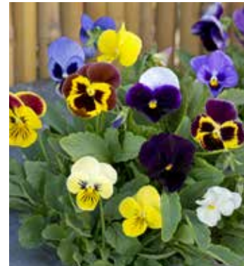
VI5300 VIOLA xwittrockiana 'Swiss Giant Field Grown Mix'

(SAHIN 2020) rich yellow flowers with dark veins, striking appearance