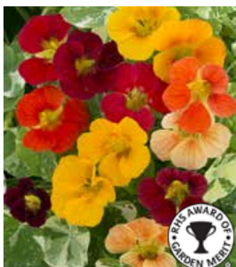
TR8999 TROPAEOLUM minus 'Tip Top Alaska Mixture'

(SAHIN 1997) soft salmon flowers above variegated leaves