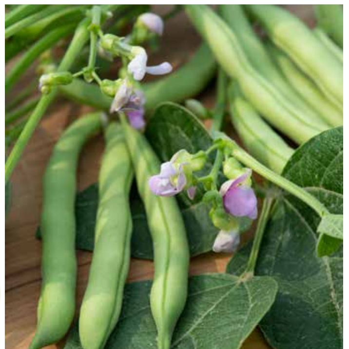
PH1180 PHASEOLUS vulgaris 'Provider'

Very small-leaved, bright green, compact, hardly flowers, excellent selection. Harvest 10-11