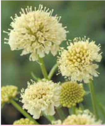
SC0381 SCABIOSA atropurpurea 'Fata Morgana'

(SAHIN 1995) unusual yellowish pink colour