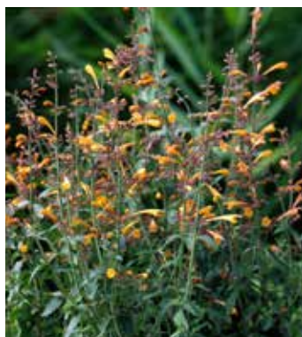
AG2010 AGASTACHE aurantiaca 'Navajo Sunset'

White flowers tinged with pink on stout spikes, highly ornamental foliage, excellent for landscaping