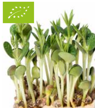
LU4900 LUPINUS luteus 'Sweet Lupin ORG '

Mild tasting iceberg lettuce with darker red leaves, tight heads hold well before bolting, 50 days