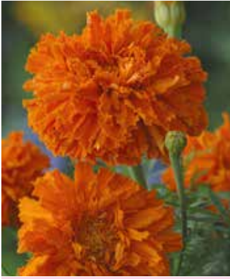
TA2740 TAGETES erecta 'Kees' Orange'

(SAHIN 2011) Kees Sahin's selection for deepest orange marigold