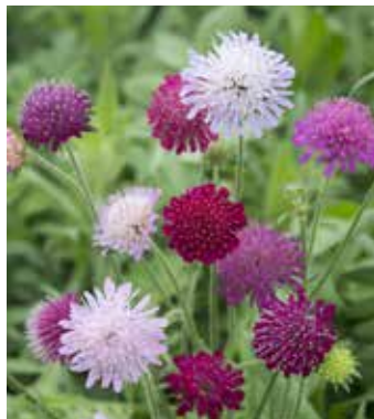
KN2990 KNAUTIA macedonica 'Watercolours'

(SAHIN 2003) showy deep red-purple, a classic border plant, flowers throughout Summer