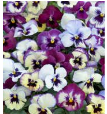
VI4040 VIOLA xwittrockiana 'Floral Days Raspberry'

(SAHIN 2014) cool mix with mainly yellow, cream and blue, very attractive