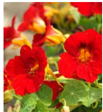
TR8785 TROPAEOLUM minus 'Tip Top Scarlet'

(SAHIN 2020) FS-N 2021, AAS-R 2020 bright rose colour, top flowering over green foliage