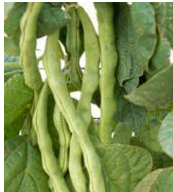
PH1175 PHASEOLUS vulgaris 'Lazy Housewife'

Bush bean, good yielder, stringless pods 10-15 cms long, easy to grow, 55 days