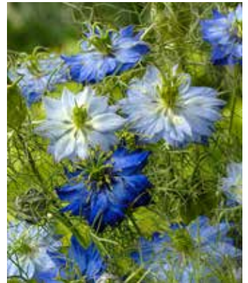
NI6692 NIGELLA damascena 'Moody Blues'

(SAHIN 1998) long-stemmed selection for cutting, white flowers, large green pods