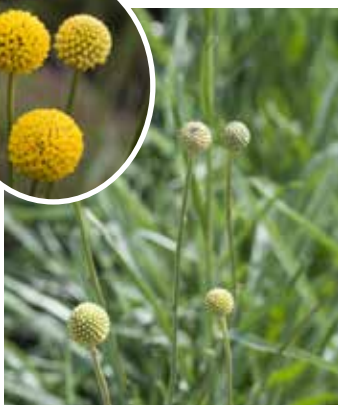
CR2000 CRASPEDIA globosa 'Drumstick'

(SAHIN 1983) tall stems with terminal golden spherical flower heads