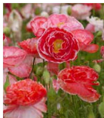
PA2780 PAPAVER rhoeas 'Falling in Love'

(SAHIN 2000) double and semi-double form of 'Angel Wings', mostly pastels and picotees