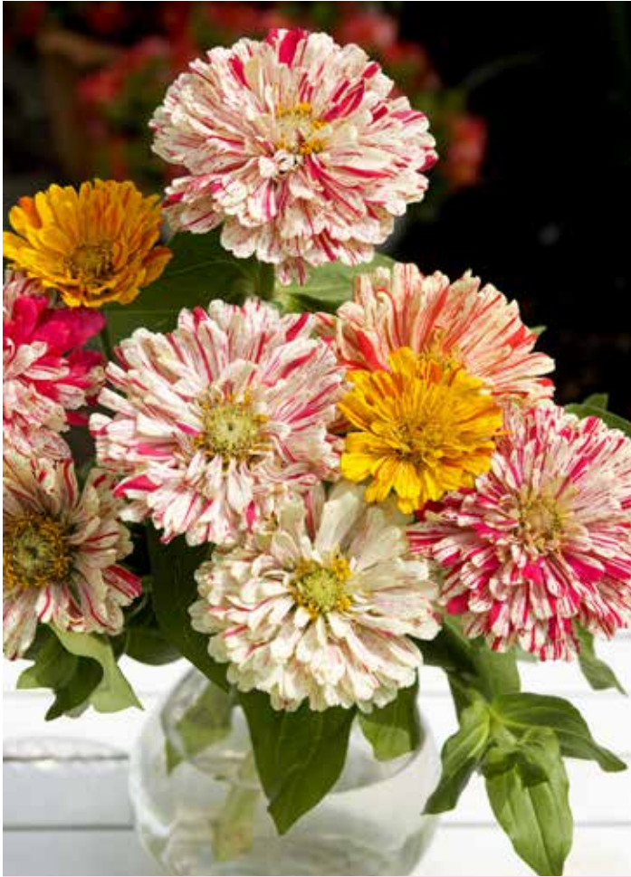
ZI5099 ZINNIA elegans 'Candy Cane Reselected Mixture'

Good colour range, high percentage of striped and mottled flowers