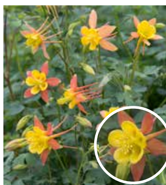
AQ6660 AQUILEGIA skinneri 'Tequila Sunrise'

Heirloom variety in gold and orange with white throat, extra-select