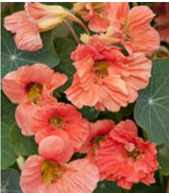
TR8585 TROPAEOLUM minus 'Salmon Baby'

(SAHIN 2019) AAS-R 2019, FS-GM 2020, FS-N 2020 compact, small dark leaves, suitable for pot plant production