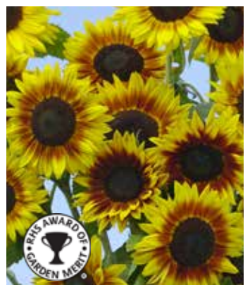
HE2148 HELIANTHUS annuus 'Solar Power' F1

(SAHIN 2013) pollenfree, flower petals of a deep chocolate colour with bright yellow tips