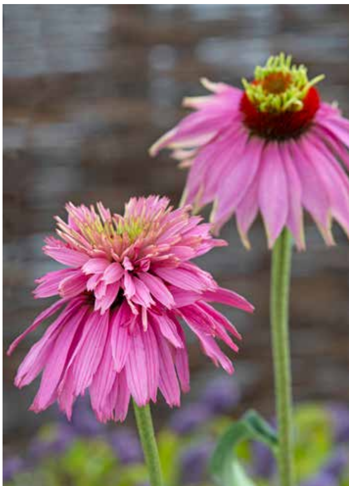
EC6400 ECHINACEA purpurea 'Paradiso Super-Duper' (SAHIN 2021) first year flowering, doubleness increases as flowers mature