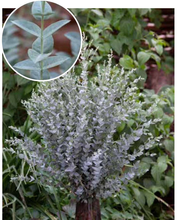
EU0850 EUCALYPTUS latens 'Moon Lagoon'

New type cut-foliage, grey round leaves with a red edge