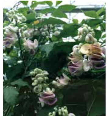
VI0500 VIGNA caracalla

Scented mixture of blue, pink, red, purple and white, from seed!