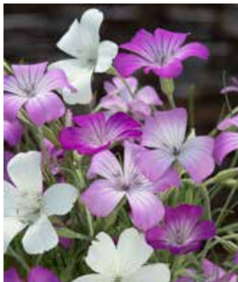
AG7078 AGROSTEMMA gracilis 'Queen Formula Mix'

(SAHIN 2003) long stems bear large flowers in purple, pink, blue and white