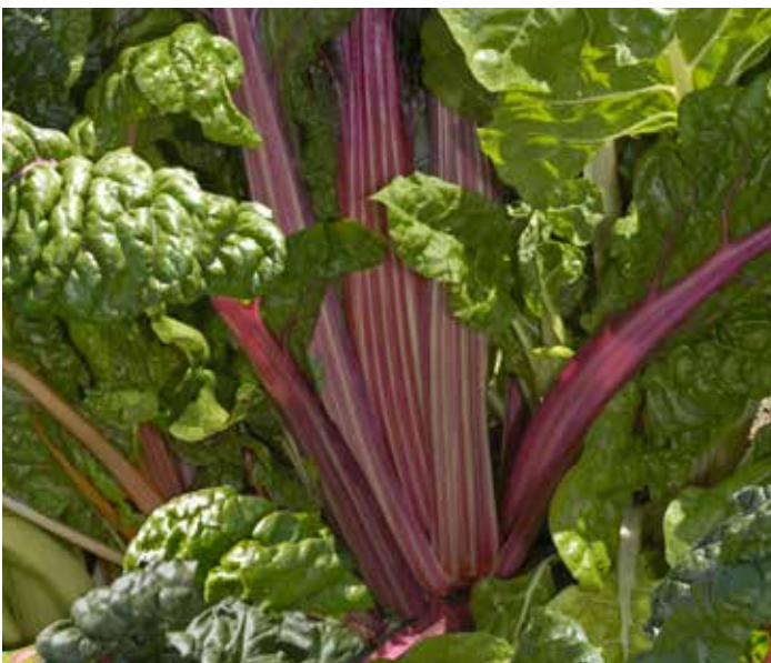
BE9550 BETA vulgaris v. cicla 'Rainbow Chard Mixed Colours'

Heirloom from Oregon, acorn type, winter squash, good keeper, fruit size 500 – 1000 grams