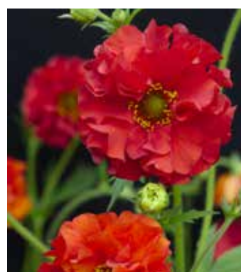
GE8995 GEUM chiloense 'Red Dragon'

(SAHIN 2008) brightest mix of large, double flowers in shades of orange, rose, salmon and gold