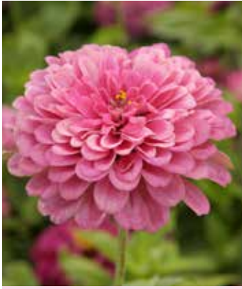
ZI4255 ZINNIA elegans 'Luminosa'

Bright pink, vigorous plants with large rounded fully double flowers