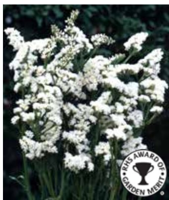
LI3692 LIMONIUM sinuatum 'Forever Silver'

(SAHIN 1993) large flower heads, clear carmine-rose