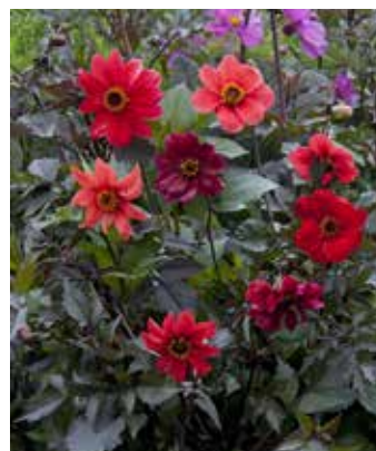
DA1200 DAHLIA variabilis 'Bishop's Children'

(SAHIN 1997) single flowers in rich colours, best seed strain in 2005 BBC Trials