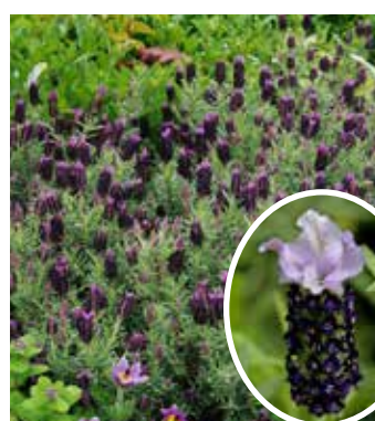
LA8250 LAVANDULA stoechas 'Sancho Panza'

(SAHIN 2004) flowers with showy purple corollas with 'Origano' scented foliage, long season