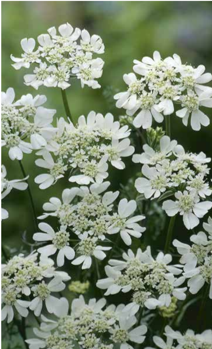
OR2450 ORLAYA grandiflora 'White Lace'

(SAHIN 1999) beautiful umbels of large white, lace-like flowers, good new filler