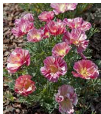
ES4388 ESCHSCHOLZIA californica 'Thai Silk Rose Chiffon'

(SAHIN 2008) unique soft champagne-pink on a cream base, extra double flowers