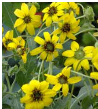
BE9450 BERLANDIERA lyrata 'Chocolate Daisy'

(SAHIN 2000) glossy foliage chocolate-coloured in winter, rose-red flowers