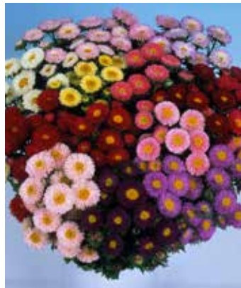
CA2199 CALLISTEPHUS chinensis 'Sahin's Matsumoto Formula Mixture'

Blue petals tipped white, semi-double flowers, upright habit