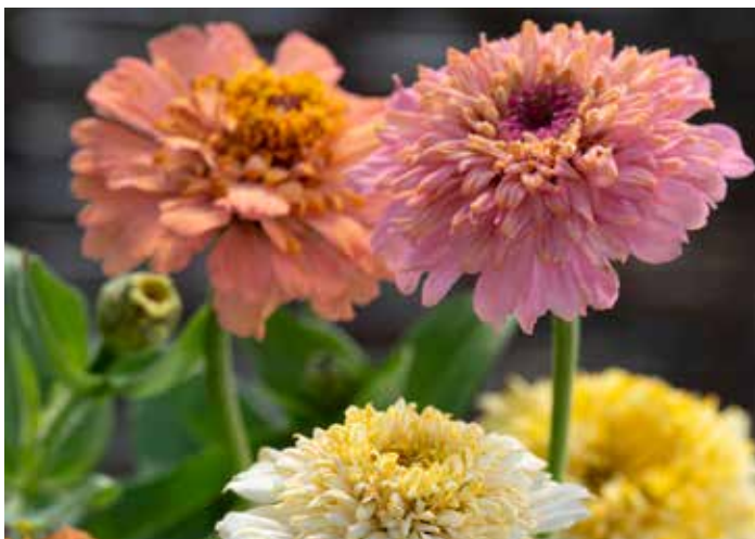
ZI4726 ZINNIA elegans 'Cresto! Peaches & Cream'

(SAHIN 2019) Cresto! represents high percentage of crested flowers, very good selection