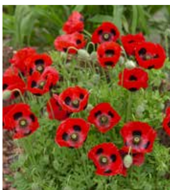
PA1995 PAPAVER commutatum 'Ladybird'

(SAHIN 1991) white daisies with deep purple and blue eyes, glossy green foliage, long flowering