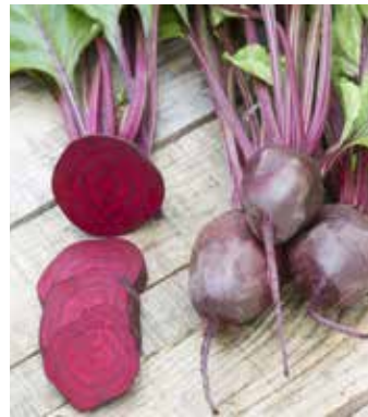
BE9578 BETA vulgaris v. cruenta 'Kornett'

A celery that looks like curly parsley, ornamental and culinary herb