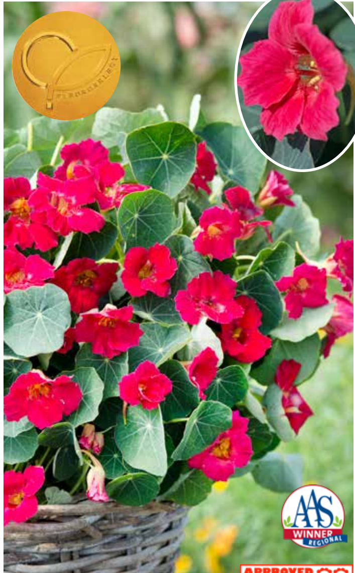
TR8420 TROPAEOLUM minus 'Baby Rose'

(SAHIN 2020) FS-N 2021 compact, small & dark leaves, suitable pot plant production