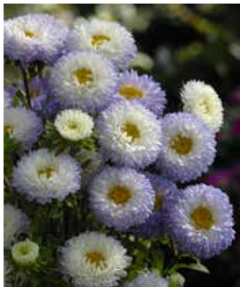
CA2194 CALLISTEPHUS chinensis 'Sahin's Matsumoto White Tipped Blue'

Blue petals tipped white, semi-double flowers, upright habit