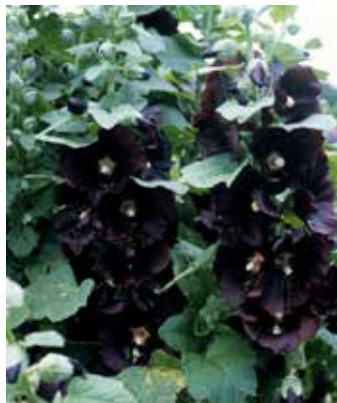
AL8850 ALCEA rosea 'Jet Black'

This is the traditional 'Nigra' with almost black flowers, very ornamental