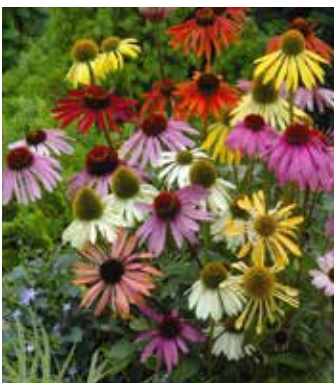
EC6499 ECHINACEA purpurea , 'Paradiso Tall Mix'

(SAHIN 2019) earlier than Paradiso Tall, with many different colours, first year flowering