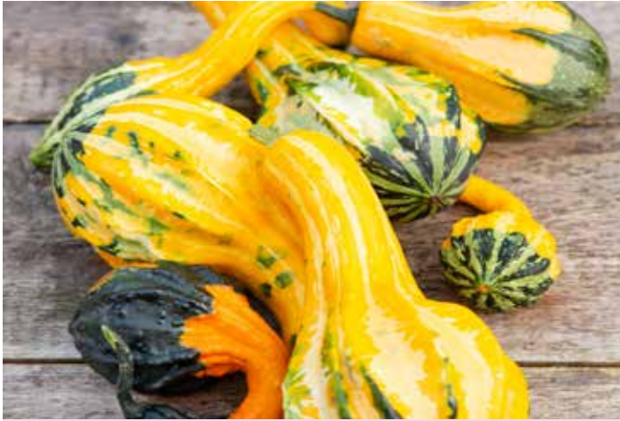
CU2315 CUCURBITA pepo 'Autumn Wings Fieldgrown Mix'

Mixed fruits, different colours, mostly pear shaped, most fruits have wings