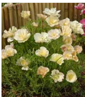
ES4378 ESCHSCHOLZIA californica 'Thai Silk Pink Champagne'

(SAHIN 2010) extra double, beautiful silvery-pink flowers