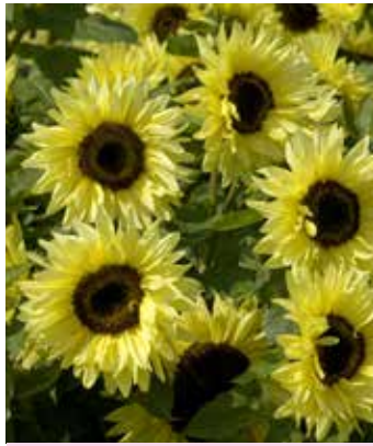
HE1945 HELIANTHUS annuus 'Garden Statement'

(SAHIN 2003) pointed inflated pods, pale green tinged with brown, shrubby plant