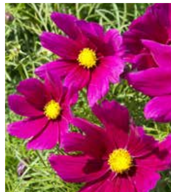
CO9320 COSMOS sulphureus 'Candyfloss Red'

(SAHIN 2017) semi-double to double, upright flowers