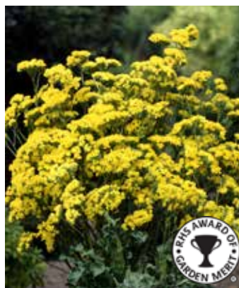
LI3665 LIMONIUM sinuatum 'Forever Gold'

(SAHIN 1993) large flower heads, deepest blue, finest quality