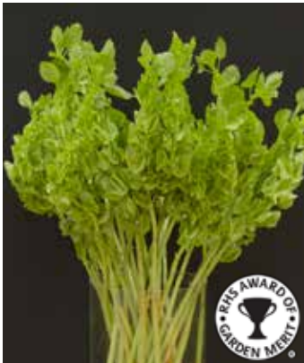
MO2000 MOLUCCELLA laevis 'Pixie Bells'

(SAHIN 2018) stunning mixture of colourful summer flowers, extremely balanced