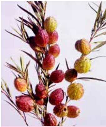
GO2800 GOMPHOCARPUS fruticosus 'Cottonbush'

(SAHIN 2003) pointed inflated pods, pale green tinged with brown, shrubby plant