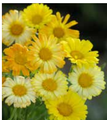
CA0890 CALENDULA officinalis 'Citrus Mixture Daisy'

(SAHIN 2002) of separate colours, single daisy-like flowers