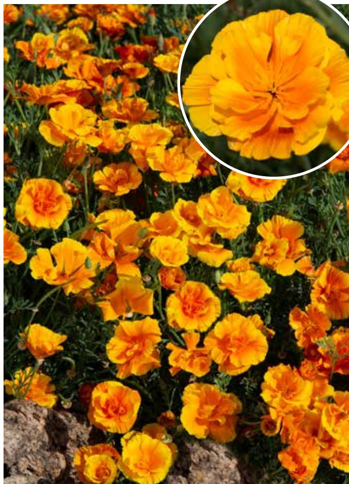
ES4800 ESCHSCHOLZIA californica 'Lady Marmalade' (SAHIN 2021) tall variety with semi-double flowers, resembling a rose, golden yellow with orange centers