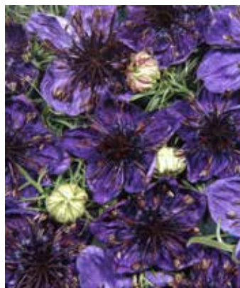
NI7125 NIGELLA papillosa 'Midnight'

(SAHIN 2014) flowers resemble our famous Delft Blue porcelain with the blue splashes all over