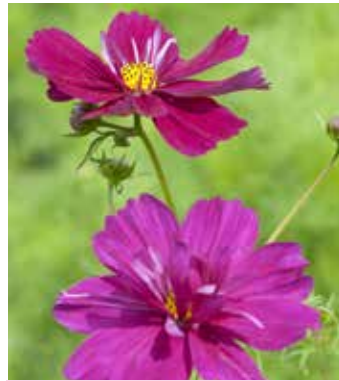
CO9123 COSMOS bipinnatus 'Fizzy Purple'

(SAHIN 2011) semi-double pink flower with attractive dark centre