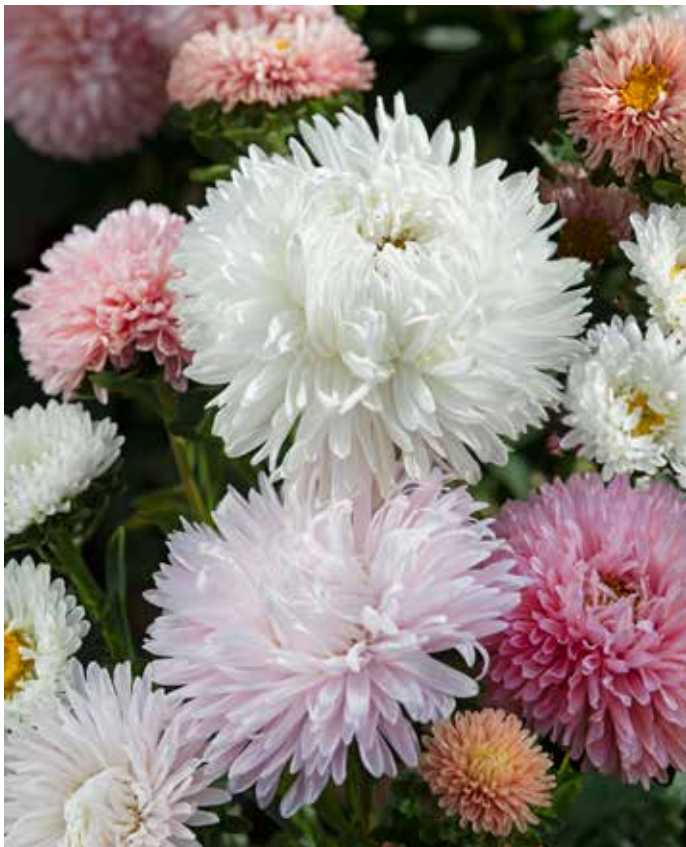
CAMIX01 CALLISTEPHUS chinensis 'The Roses Formula Mix'

(SAHIN 2021) mix of small and large double flowers, roses and white