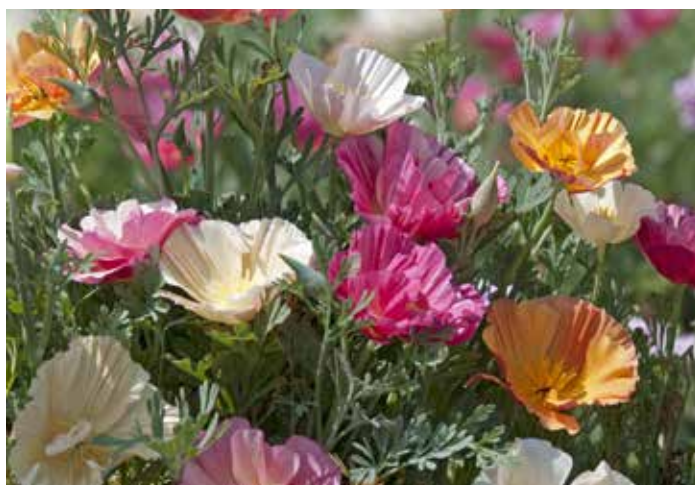
ES4399 ESCHSCHOLZIA californica 'Thai Silk Formula Mixture'

(SAHIN 2003) yellow base with intense red edging