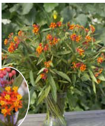
AS1800 ASCLEPIA curassavica 'Apollo Orange'

(SAHIN 1990) green-white flower heads of heavy substance, excellent filler