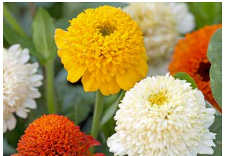
ZI4727 ZINNIA elegans 'Cresto! Citrus Formula Mix'

(SAHIN 2020) Cresto! mixture of pastel colours