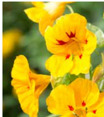
TR8090 TROPAEOLUM majus 'Alaska Ladybird'

(SAHIN 2014) unique antique rose colour, you either love it or hate it!