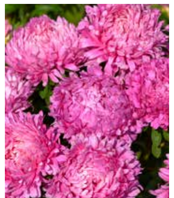
CA2991 CALLISTEPHUS chinensis 'King Size Rose'