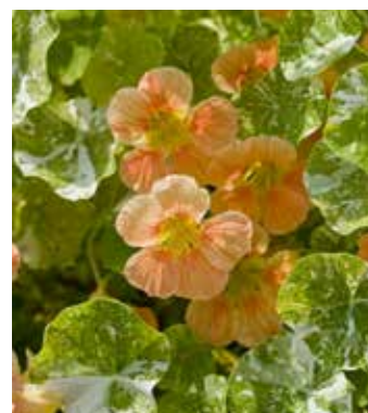
TR8975 TROPAEOLUM minus 'Tip Top Alaska Salmon'

(SAHIN 2014) deep red flowers against marbled foliage, sometimes throws a rose flower