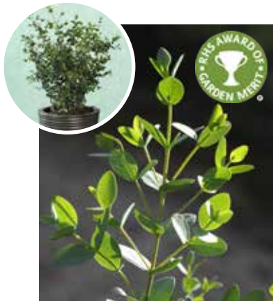
EU0590 EUCALYPTUS parvifolia 'Boxwood'

Standard variety, grows taller than Baby Blue, larger foliage