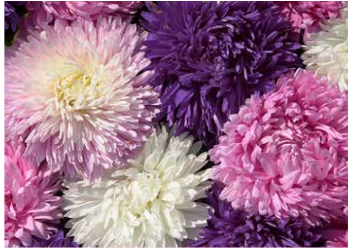
CA2999 CALLISTEPHUS chinensis 'King Size Fieldgrown Mixture'

Mixture of all colours, superb strain, fully double large flowers