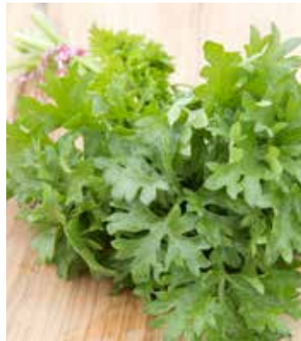
AP3600 APIUM graveolens 'Zwolsche Krul'

Sweet aniseed taste, best eaten as cress, combines well with fish dishes and desserts, harvest 01-12