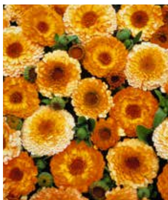
CA0978 CALENDULA officinalis 'Pink Surprise'

(SAHIN 2019) closely set, quilled petals forming spiky flowers, uniform and floriferous, bright yellow flowers