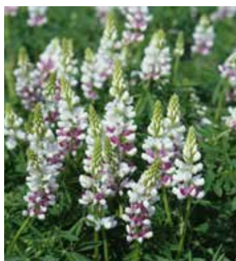
LU4800 LUPINUS elegans 'Pink Fairy'

(SAHIN 2000) erect spikes of fragrant soft pink flowers changing to rose with age