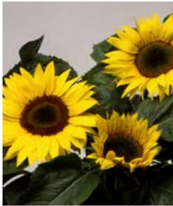
HE2119 HELIANTHUS annuus 'Elite Sun' F1

(SAHIN 2015) golden yellow sprinkled with cinnamon creating an orange appearance