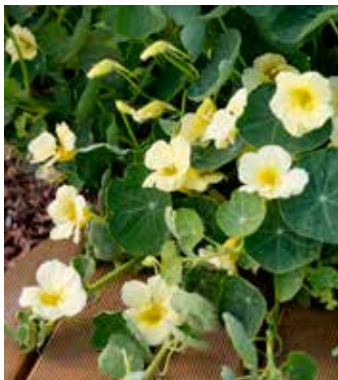
TR7946 TROPAEOLUM majus 'Milkmaid'

(SAHIN 2002) nearest to white, unique within the genus