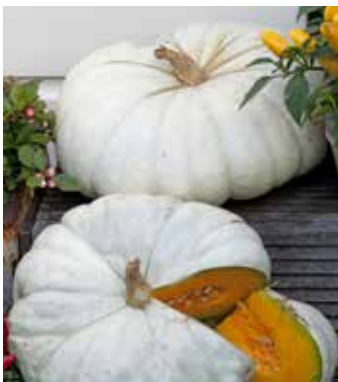
CU4002 CUCURBITA maxima 'Flat White Boer'

Salmon, ribbed fruits with small seed cavity, thick and starchy flesh best for baking or roasting, 4-7 kgs, 90-100 days