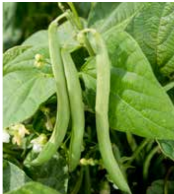
PH1170 PHASEOLUS vulgaris 'Empress'

Yellow bush bean with purple streaks, Dutch heirloom, 55 - 60 days