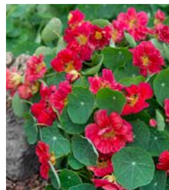
TR8365 TROPAEOLUM minus 'Whirlybird Rose'

Propeller-like, semi-double reddish brown flowers, bushy plants