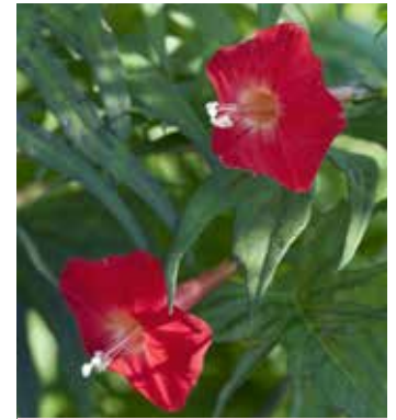
IP4900 IPOMOEA x multifida 'Cardinal Climber'

(SAHIN 1998) sizeable golden flowers on short single stemmed plant, good for landscaping