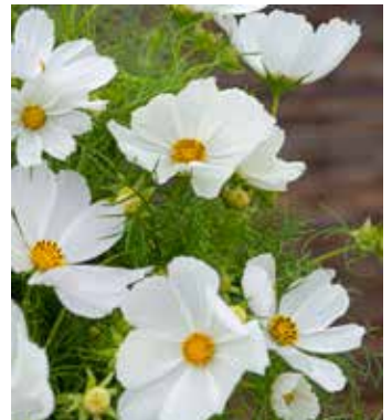
CO9022 COSMOS bipinnatus 'Gazebo White'

(SAHIN 1996) large red flowers on bushy plants of intermediate height