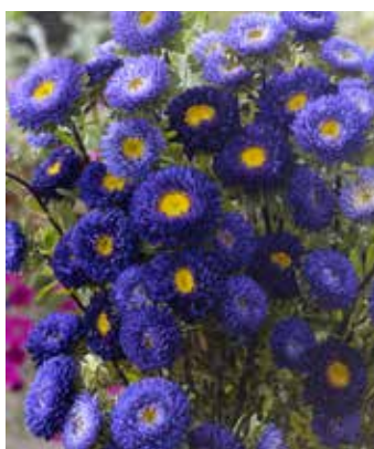
CA2157 CALLISTEPHUS chinensis 'Sahin's Matsumoto Blue'

(SAHIN 2016) FS-N 2015, unique colour break, white double flowers with dark or light centre