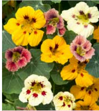
TR8769 TROPAEOLUM minus 'Ladybird Mix'

(SAHIN 2017) unique colour-break: dusky rose with dark ladybird spots