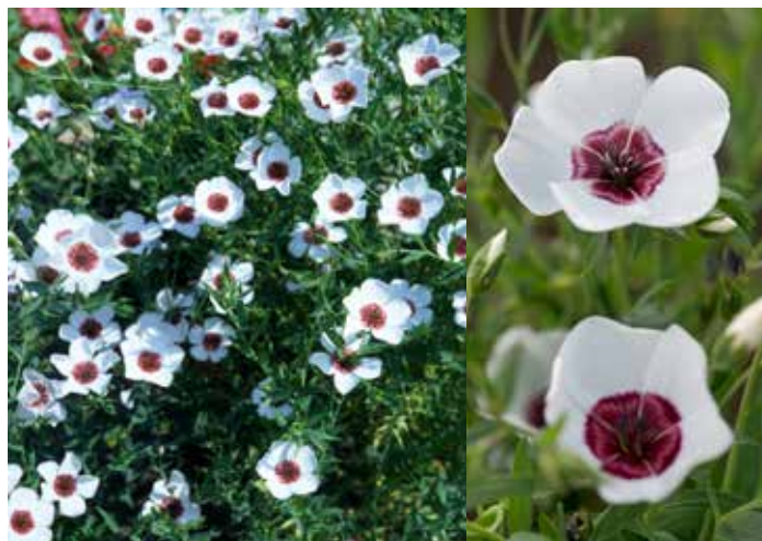
LI5540 LINUM grandiflorum 'Bright Eyes'

(SAHIN 1993) mixture of separate colours, outstanding quality