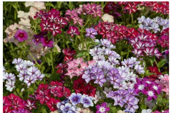
PH3298 PHLOX drummondii 'Grandiflora Starry Eyes'

(SAHIN 1995) FS-Q 1996, unique combination of colours with contrasting, darker eyes