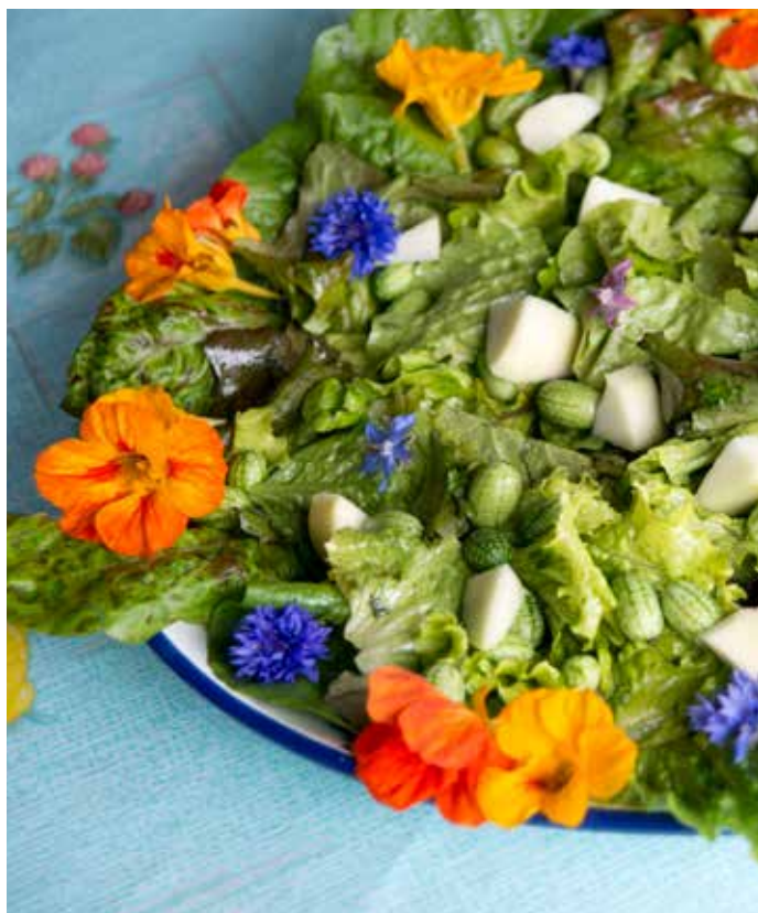
TR8710 TROPAEOLUM minus 'Edible Formula Mix'

Re-selected for white, double carnation-type flowers