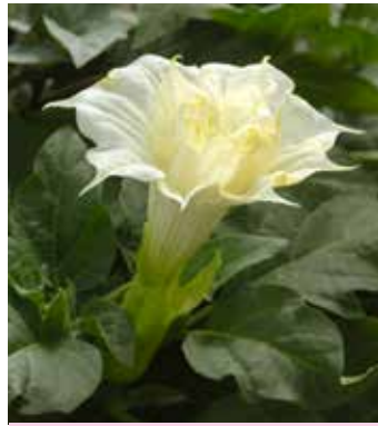
DA7240 DATURA metel 'Ballerina White'

(SAHIN 1998) magnificent double, upfacing, purple trumpets, fragrant, superb pot plant