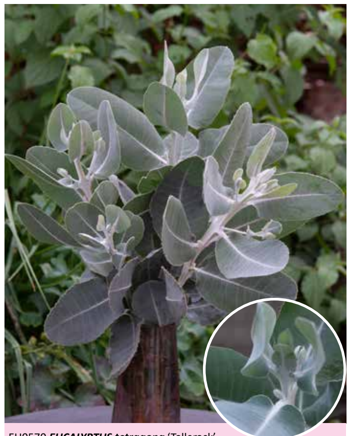
EU0570 EUCALYPTUS tetragona 'Tallerack'

(SAHIN 2021) FS-N 2020 unique white flowers with burgundy eye, tall, bushy floriferous plants, excellent for landscaping