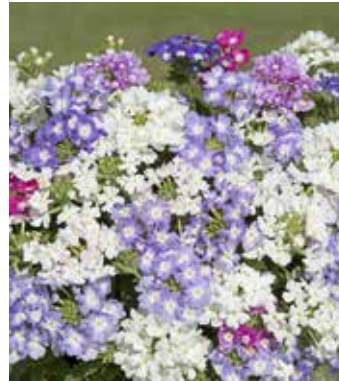
VE5560 VERBENA xhybrida , 'Scentsation Fieldgrown Mix'

(SAHIN 2006) mix of historic pansies with distinct face overlaid with multicoloured stripes