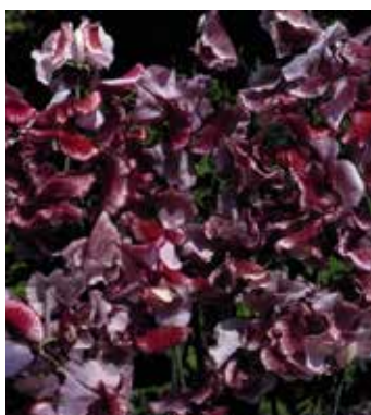
LA7465 LATHYRUS odoratus 'Spencer Wiltshire Ripple'

One of the best whites, creamy yellow buds up to pure white, nicely waved