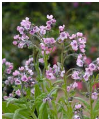
CY7410 CYNOGLOSSUM amabile 'Mystery Rose'

(SAHIN 1983) tall stems with terminal golden spherical flower heads