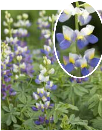
LU4580 LUPINUS mutabilis var. cruckshankii 'Javelin Blue'

(SAHIN 1996) elegant long spikes of blue scented flowers with white and yellow keels