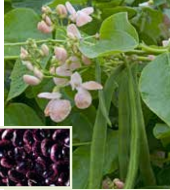
PH1162 PHASEOLUS coccineus 'Sunset'

Less curled than red, good aroma and taste, for salads and cress