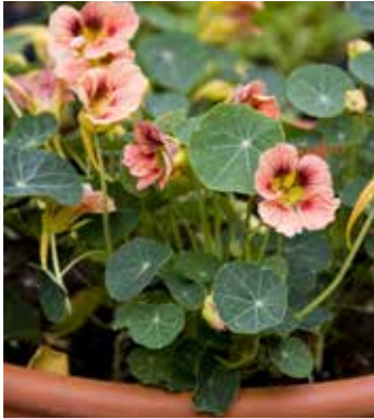
TR8768 TROPAEOLUM minus 'Ladybird Rose'

(SAHIN 2017) unique colour-break: dusky rose with dark ladybird spots