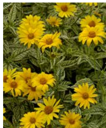
HE5010 HELIOPSIS helianthoides 'Sunburst'

(SAHIN 1989) unique silvery felted leaves, small yellow flowers on branched stems