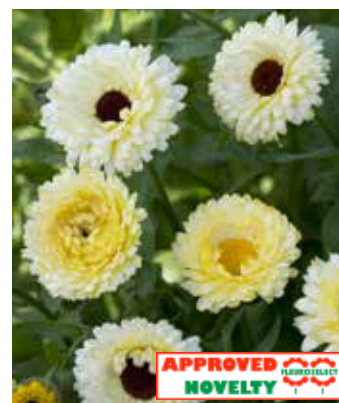
CA0988 CALENDULA officinalis 'Ivory Princess'

Fully double, salmon-pink flowers with a touch of orange, flowers over a long season