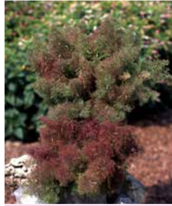
TE5000 TELOXYS aristata 'Seafoam'

A great mixture of soft pinks, shades of rose to dark red, duplex flowers