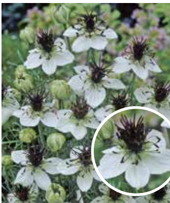
NI7050 NIGELLA papillosa 'African Bride'

(SAHIN 2008) shades of violet, deep and light blue on the same plant