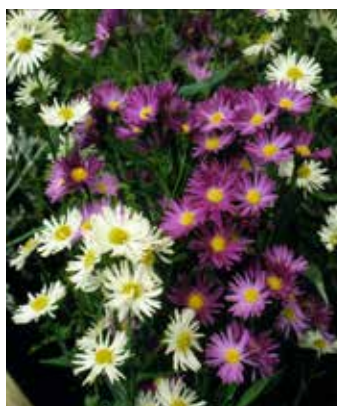
AS6850 ASTER novi-belgii 'New Hybrids'

Bright orange cut flower type, long lasting perennial very adaptable