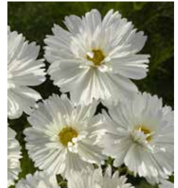
CO9145 COSMOS bipinnatus 'Fizzy White'

(SAHIN 2009) exciting new Cosmos with semi-double, rosy white flowers with ruby edge