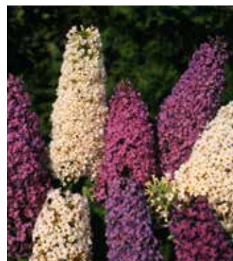
BU1690 BUDDLEJA davidii 'Butterfly Hybrids'

Vibrant yellow daisies with chocolate stamens and a rich chocolate scent