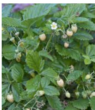
FR0580 FRAGARIA vesca 'Yellow Wonder'

Large elongated red fruits, sweet and aromatic, long season