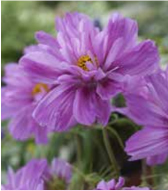
CO9120 COSMOS bipinnatus 'Fizzy Pink Dark Centre'

(SAHIN 2011) semi-double pink flower with attractive dark centre