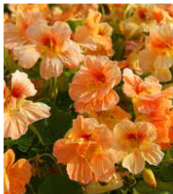
TR8755 TROPAEOLUM minus 'Tip Top Apricot'

Reselected dark-leaved variety with bright salmon-rose flowers, a good contrast