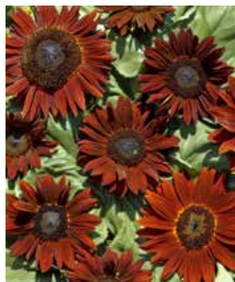
HE2175 HELIANTHUS annuus 'Ruby' F1

(SAHIN 2009) early, single stem, flowers golden-yellow with green discs