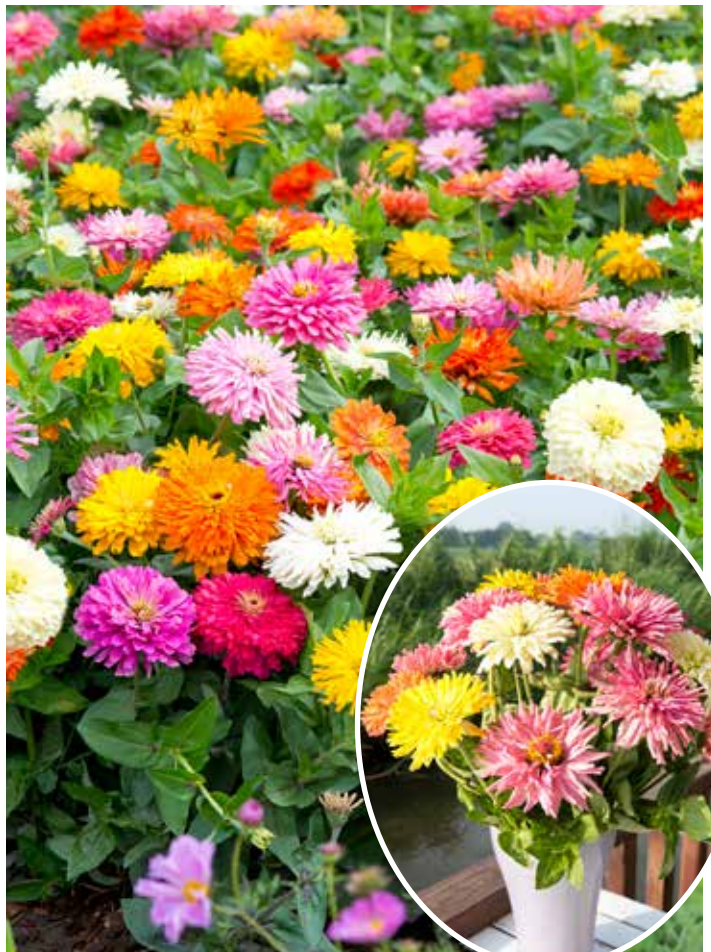
ZI5260 ZINNIA elegans 'Taki's Choice Fieldgrown Mix'

(SAHIN 2020) pastel selection from the original Cut & Come Again mix