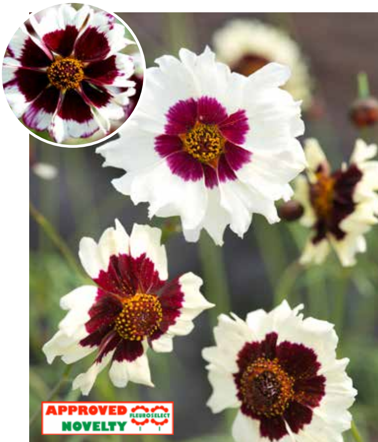
CO5945 COREOPSIS hybrida 'Incredible! Swirl'

(SAHIN 2021) mix of small and large double flowers, blues and white