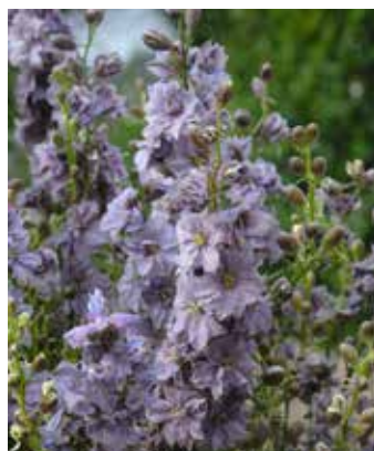
DE4936 DELPHINIUM consolida 'Misty Lavender'

(SAHIN 2003) improved form of FS-Q '93 winner, white with blue flames