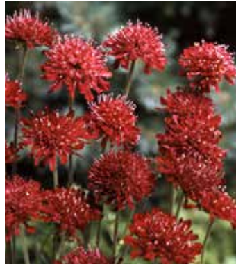
KN2975 KNAUTIA macedonica 'Red Cherries'

(SAHIN 2003) beautiful double ruby-red flowers, strong growth, striking climber