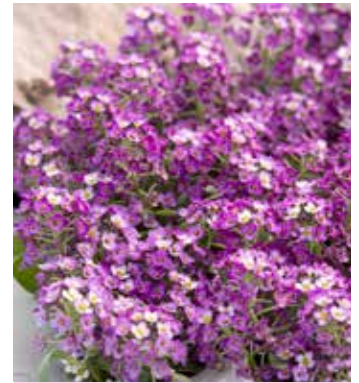
LO2754 LOBULARIA maritima 'Aphrodite Purple'

(SAHIN 1996) FS-Q 1996, AGM, desirable new colour, soft lemon-yellow, the first on the market