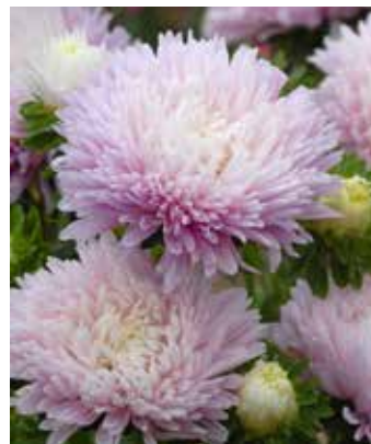
CA2977 CALLISTEPHUS chinensis 'King Size Appleblossom'

A balanced blend of separate colours, semi-double flowers, upright habit