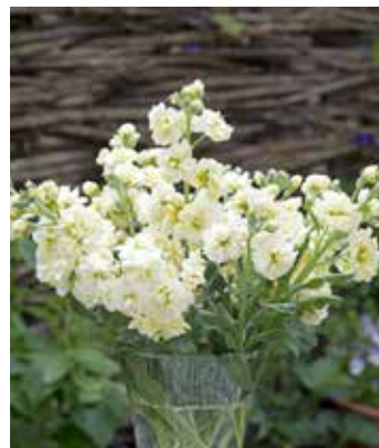
MA8597 MATTHIOLA incana 'Anytime Yellow'

(SAHIN 2017) tall cut flower for summer, 100% selectable for double