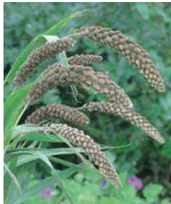
SE9365 SETARIA italica , 'Hylander'

(SAHIN 2008) fruity colours combined into a great mixture