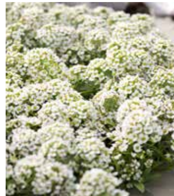
LO2764 LOBULARIA maritima 'Aphrodite Silver'

(SAHIN 1996) deep salmon turning to apricot, unique colour in the genus