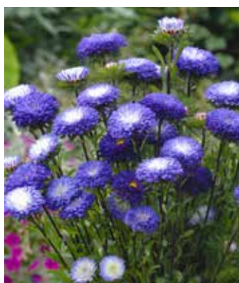
CA2159 CALLISTEPHUS chinensis 'Sahin's Matsumoto Blue Tipped White'

(SAHIN 2003) best blue in the type, semi-double flowers, upright habit