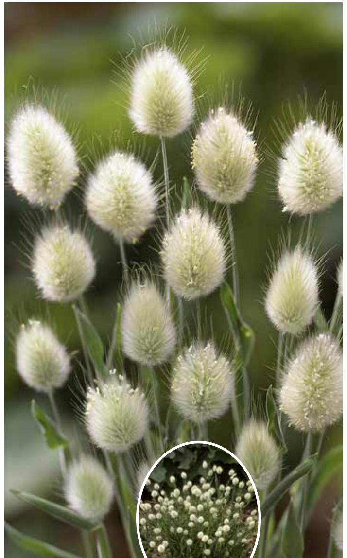
LA2900 LAGURUS ovatus 'Bunny Tails'

(SAHIN 1993) FS-Q 1993, the shortest selection, good for pots, tactile