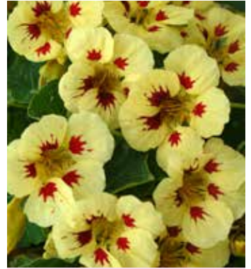
TR8771 TROPAEOLUM minus 'Ladybird Cream Purple Spot'

(SAHIN 1998) eye catching orange-yellow flowers with bright red markings