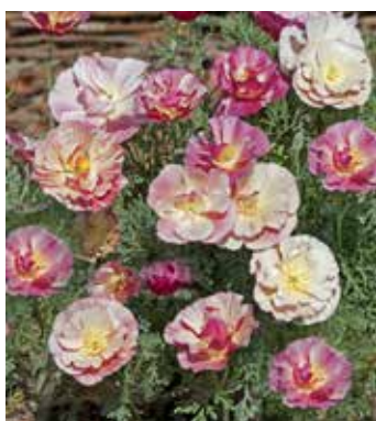
ES4354 ESCHSCHOLZIA californica 'Thai Silk Appleblossom Chiffon Improved'

(SAHIN 2010) extra double, beautiful silvery-pink flowers