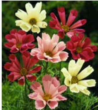
CO9200 COSMOS bipinnatus 'Sea Shells Mixture'

(SAHIN 2008) trumpet-shaped ruby-red rays, floriferous with excellent uniformity