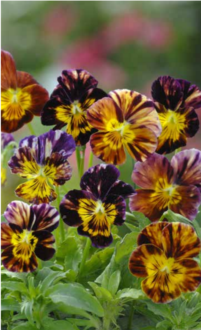
VI2078 VIOLA cornuta 'Brush Strokes'

(SAHIN 2009) eye catching flowers, cream with purple spots, compact plants