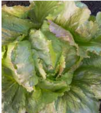
LA1580 LACTUCA sativa 'Red Iceberg'

Oak leaf lettuce, bolt resistant, disease resistant, 50 days