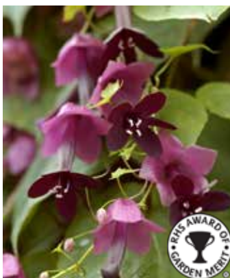
RH5000 RHODOCHITON atrosanguineum 'Purple Bells'

(SAHIN 2000) a rich blend of colours with starry eyes, scented