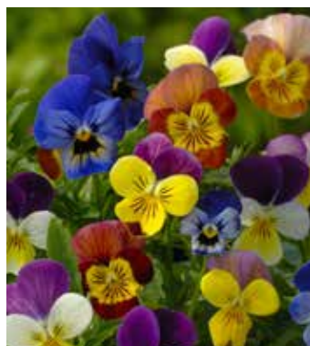
VI8246 VIOLA cornuta 'Chicky Chicks'

(SAHIN 2020) formula mix of large flowered pansies, most colours are blotchless