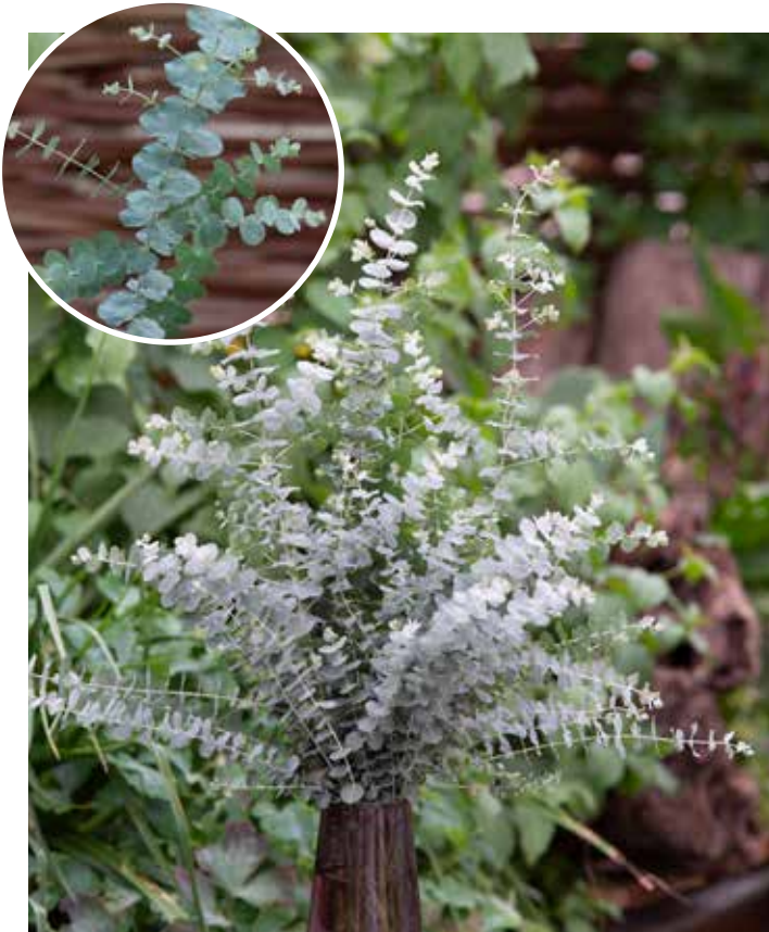
EU0840 EUCALYPTUS kruseana 'Book-leaf Mallee'

New type cut-foliage, grey round leaves with a red edge