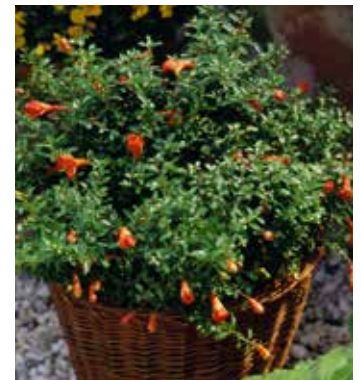
PU7000 PUNICA granatum 'Orange Master'

(SAHIN 2016) excellent field grown mix of 'Giant Exhibition' type