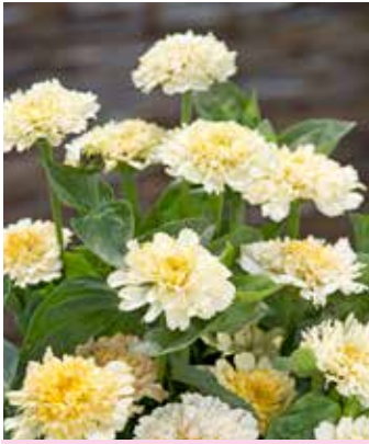
ZI4701 ZINNIA elegans 'Cresto! Cream'

(SAHIN 2019) Cresto! represents high percentage of crested flowers, very good selection