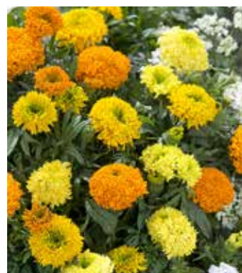
TA2099 TAGETES erecta 'Spinning Wheels'

(SAHIN 2005) coppery orange poppy-like flowers, sweetly scented of lily-of-the-valley