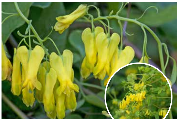
DI5220 DICENTRA scandens

(SAHIN 2007) mat-forming, succulent plants, masses of lilac-purple flowers, white centres