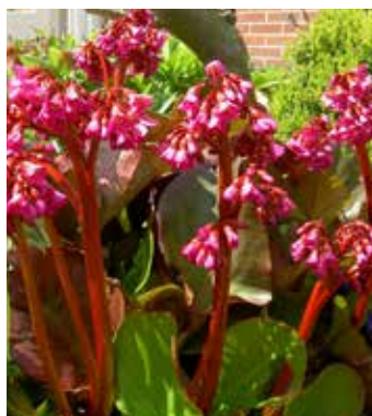
BE9362 BERGENIA cordifolia 'Winterglow'

(SAHIN 1999) impressive large crimson-red flowers on pendulous shoots, superb for baskets