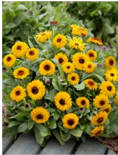
CA0981 CALENDULA officinalis 'Bull's Eye' (SAHIN 2020) FS-N 2019 compact mounding variety, pompon type

(SAHIN 2019) superb quality mix including singles, (semi-)doubles, dark or yellow centres, bright, pastel and buff colours