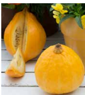
CU4013 CUCURBITA pepo 'Lemon Squash'

Heirloom winter squash of Australian origin, good keeper, blue-green, ribbed fruits, sweet orange flesh, very tasty and versatile in cooking, 4-5 kgs, 100 days