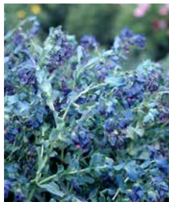
CE9760 CERINTHE major 'Purpurascens Kiwi Blue'

Extra-select stock of deep maroon, double flowers