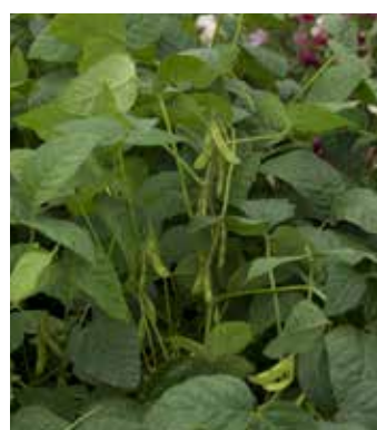
GL7979 GLYCINE max 'Fiskeby V'

Yellow fruits, best taste of all, birds do not touch