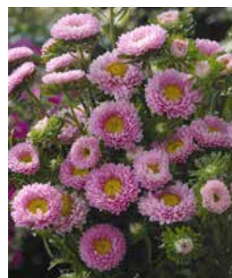
CA2175 CALLISTEPHUS chinensis 'Sahin's Matsumoto Pink'

A lavender-blue colour, semi-double flowers, upright habit