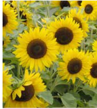
HE2134 HELIANTHUS annuus 'Little Dorrit' F1

(SAHIN 1989) PVP golden yellow single giant flowers, yellow centres, good foliage