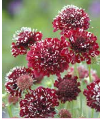
SC0383 SCABIOSA atropurpurea 'Fire King'

(SAHIN 1995) unusual yellowish pink colour