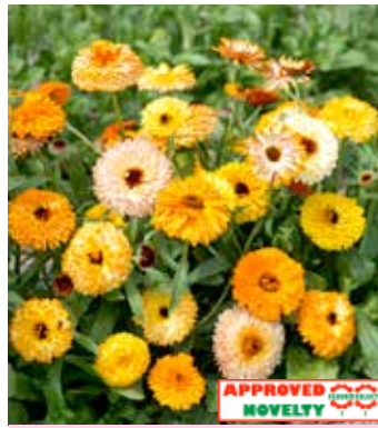
CA0979 CALENDULA officinalis 'Playtime Fieldgrown Mix'

(SAHIN 2017) very large buff flowers, impressive garden performance