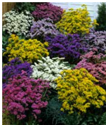
LI3699 LIMONIUM sinuatum 'Forever Formula Mixture'

(SAHIN 1993) FS-Q 1993, AGM, large flower heads, pure white, finest quality