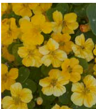
TR9210 TROPAEOLUM minus , 'Banana Cream'

A classic, dark foliage, brilliant crimson-scarlet flowers of outstanding quality, reselected