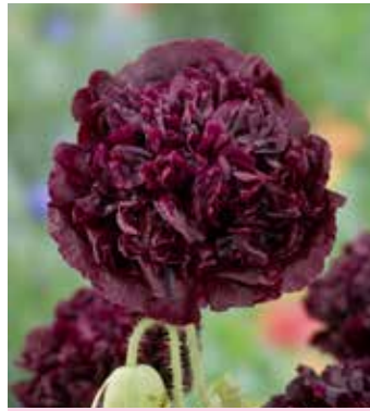
PA2920 PAPAVER somniferum 'Black'

Much sought after poppy, extraordinary plum purple flowers with deep purple spots