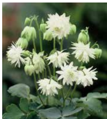
AQ8420 AQUILEGIA vulgaris 'Lime Sorbet'

(SAHIN 1996) long-spurred, orange to coral flowers with yellow corolla tips