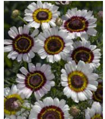
CH6220 CHRYSANTHEMUM carinatum 'Cockade'

(SAHIN 1997) blue tinged stems with pendulous purple flowers