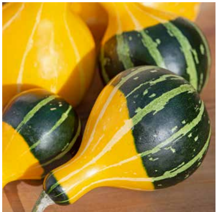
CU2410 CUCURBITA pepo 'Pear Bicolour'

(SAHIN 2021) mix of different varieties from Sahin breeding'