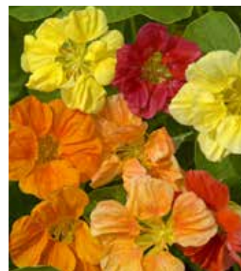
TR8400 TROPAEOLUM minus 'Whirlybird Field Grown Mixture'

Rounded spurless flowers in full range of colours, outstanding