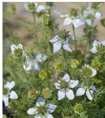
NI7800 NIGELLA sativa 'Black Caraway'

(Sahin 2004) large vines produce an abundance of small, oblong, green striped fruits