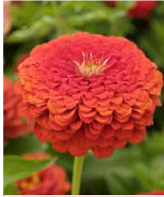
ZI4270 ZINNIA elegans 'Oriole'

Rich deep red, darkest of all reds, vigorous plants with large rounded fully double flowers