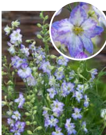
DE4930 DELPHINIUM consolida 'Frosted Skies'

(SAHIN 1990) own selection from 'Volkerfrieden', gentian-blue flowers, does not fade