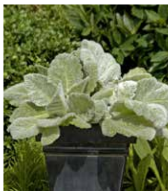
SA1540 SALVIA argentea 'Artemis'

Medium-sized flowers, pointed petals, golden yellow with mahogany base, dark centres