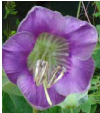
CO0100 COBAEA scandens

(SAHIN 1990) hybrid, lantern-like yellow blooms, flowers early, abundantly and long