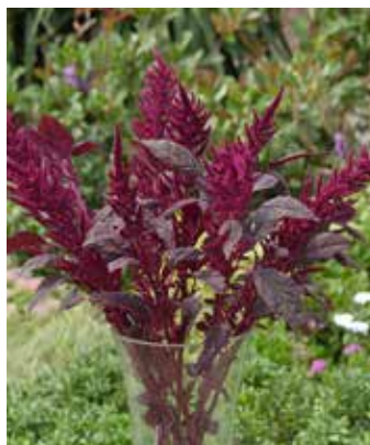
AM1520 AMARANTHUS cruentus 'Velvet Curtains'

(SAHIN 2004) unusual coral-pink flower heads, superb filler