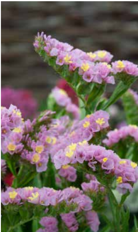
LI3670 LIMONIUM sinuatum 'Forever Happy'

Very small, silver-grey juvenile leaves, beautiful addition to cut-foliage assortment