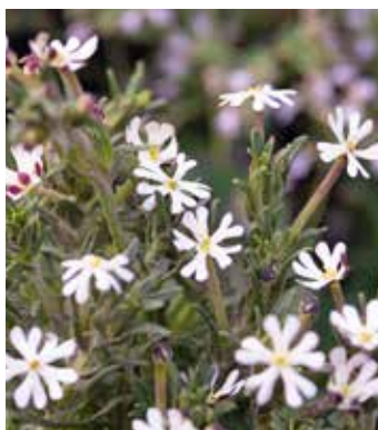
ZA1000 ZALUZIANSKYA capensis 'Midnight Candy'

(SAHIN 2008) early, compact and upright, very floriferous