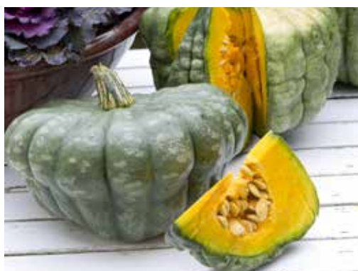
CU4012 CUCURBITA moschata 'Queensland Blue'

Heirloom winter squash of Australian origin, good keeper, blue-green, ribbed fruits, sweet orange flesh, very tasty and versatile in cooking, 4-5 kgs, 100 days