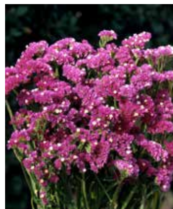
LI3686 LIMONIUM sinuatum 'Forever Rose'