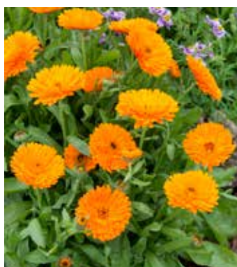
CA0910 CALENDULA officinalis 'Orange Candyman'

(SAHIN 2012) mixture of apricot, orange and lemon.