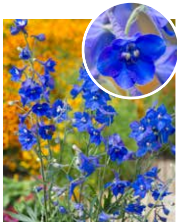
DE4050 DELPHINIUM belladonna 'Oriental Blue'

(SAHIN 1990) own selection from 'Volkerfrieden', gentian-blue flowers, does not fade