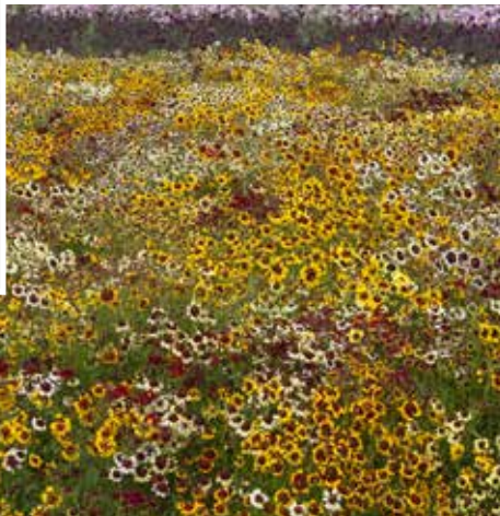
CO5920 COREOPSIS xhybrida 'Incredible! Dwarf Mix'

(SAHIN 2012) dwarfest variety within 'Incredible!' series, contains wide range of colours