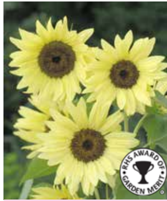
HE2104 HELIANTHUS annuus 'Buttercream' F1

(SAHIN 2008) large, lemon-yellow duplex flowers with dark discs, top branching