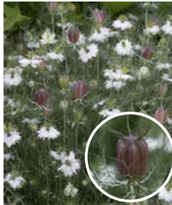
NI6410 NIGELLA damascena 'Albion Black Pod'

AGM, dense spikes of apple-green bell-like calyces, widely used in modern arrangements