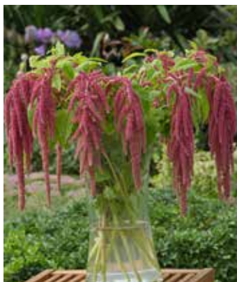
AM1515 AMARANTHUS caudatus 'Coral Fountain'

(SAHIN 1996) FS-Q 1997 warm orange-brown spikes, excellent cut flower