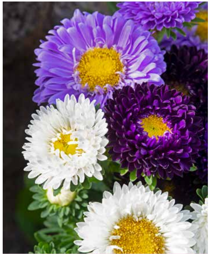
CAMIX02 CALLISTEPHUS chinensis 'The Blues Formula Mix'

(SAHIN 2021) mix of small and large double flowers, roses and white