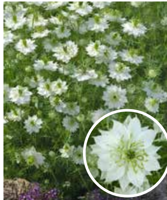
NI6415 NIGELLA damascena 'Albion Green Pod'

(SAHIN 1996) long-stemmed selection for cutting, white flowers, uniform dark pods