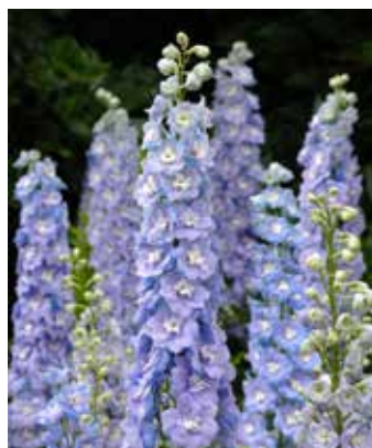
DE7250 DELPHINIUM cultorum 'Raider Blue'

(SAHIN 2016) off-white double flowers with smokey eye in the centre