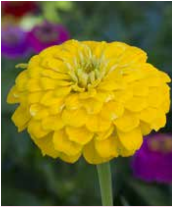
ZI4215 ZINNIA elegans 'Canary Bird'

(SAHIN 1986) improved form with aquamarine flowers, long flowering season