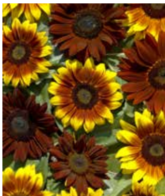
HE2146 HELIANTHUS annuus 'Orange Mahogany Bicolour' F1

(SAHIN 1999) semi-dwarf, single stem, flowers with yellow petals and brown discs