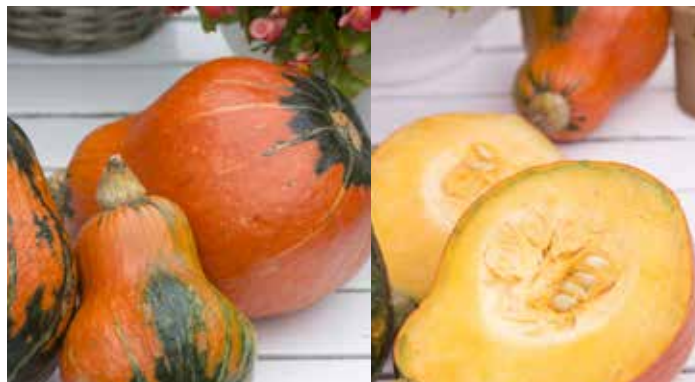
CU4006 CUCURBITA maxima 'Lakota'

South African heirloom, beautiful greyish-white flat fruits for pies and baking, 4-12 KG