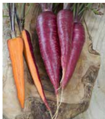
DA7800 DAUCUS carota 'Purple Dragon'

Medium sized artichoke flowers with green tinged purple bracts, spineless