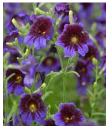
SA1145 SALPIGLOSSIS sinuata 'Kew Blue'

(SAHIN 1983) AGM, maroon flowers hanging from reddish purple calyces, vining pot plant