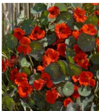
TR9240 TROPAEOLUM minus , 'Princess of India'

(SAHIN 2010) topflowering with golden yellow flowers fading to creamy yellow