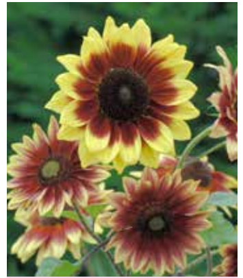
HE2136 HELIANTHUS annuus 'Magic Roundabout' F1

(SAHIN 2015) uniform, branching sunflower with healthy green and small foliage, pollenfree