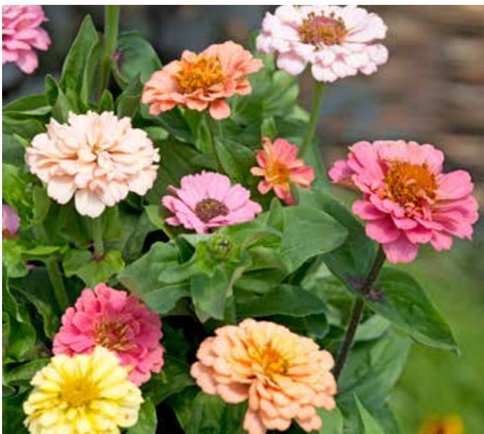
ZI5255 ZINNIA elegans 'Cut & Come Again Pastel Fieldgrown Mix'

A Pumila-type, as usually offered, field grown