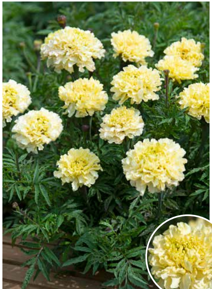
TA2300 TAGETES erecta 'Sugar & Spice White'

(SAHIN 2021) unusual colour for flowers: petals of coffee-colour with deep purple veins, golden yellow centres