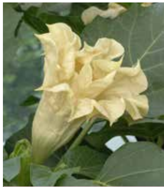
DA7245 DATURA metel 'Ballerina Yellow'

(SAHIN 1998) magnificent double, upfacing, white trumpets, fragrant, superb pot plant