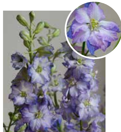
DE5080 DELPHINIUM consolida 'Fancy Purple Picotee'

(SAHIN 2010) slate grey double flowers, closely set on the strong upright stems