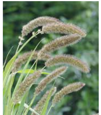
SE9370 SETARIA italica , 'Lowlander'

Tall grass with long flower heads, very popular for cutting and landscaping