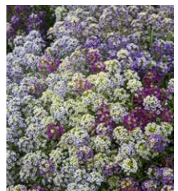
LO2850 LOBULARIA maritima 'Wandering Field Grown Mix'

Widest colour range in this class, matching habits, good in packs