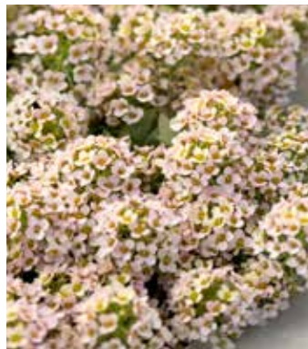
LO2760 LOBULARIA maritima 'Aphrodite Salmon'

(SAHIN 1996) deep salmon turning to apricot, unique colour in the genus