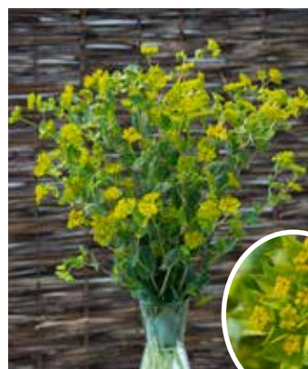
BU5600 BUPLEURUM rotundifolium 'Green Gold'

Complete colour range of modern hybrids, showy and long-flowering