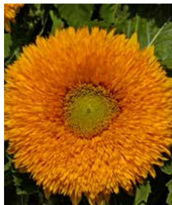
HE2345 HELIANTHUS annuus 'Orange Sun'

(SAHIN 2008) extra tall sunflower for competition growing, longest seed of all