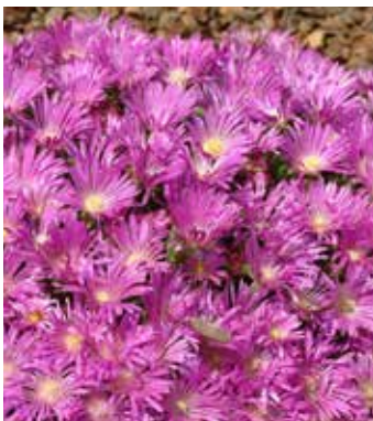
DE3000 DELOSPERMA cooperi 'Table Mountain'

(SAHIN 1998) mixture of the three colours, double, upfacing trumpets, flowers fragrant