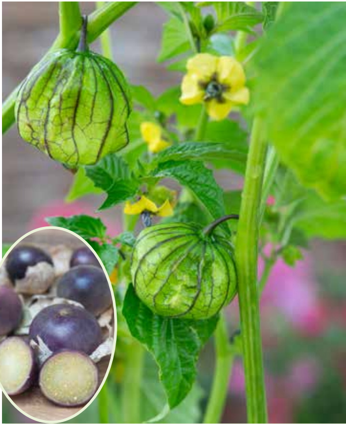
PH8250 PHYSALIS ixocarpa 'Purple de Milpa'

Small purple-tinged fruits, sharp flavour. Harvest 08-09