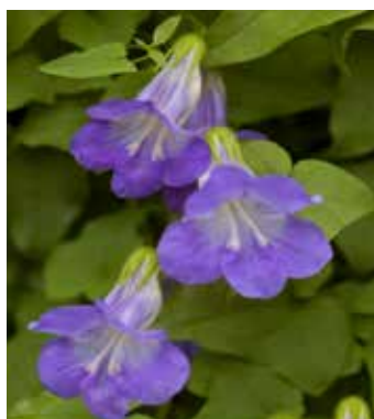
AS0735 ASARINA scandens 'Sky Blue'

(SAHIN 1992) medium sized leaves, large bright rose flowers