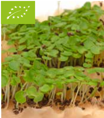
AG2045 AGASTACHE foeniculum 'Anise Hyssop ORG '

Sweet aniseed taste, best eaten as cress, combines well with fish dishes and desserts, harvest 01-12