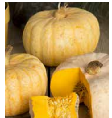
CU3990 CUCURBITA maxima ' Australian Butter'

Uniform variety, pretty dark orange rind with distinct salmon stripes, 1-3 kgs.