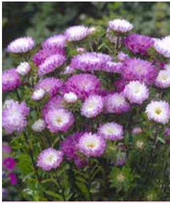
CA2177 CALLISTEPHUS chinensis 'Sahin's Matsumoto Pink Tipped White'

White petals tipped pink, semi-double flowers, upright habit