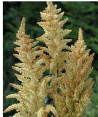
AM1212 AMARANTHUS cruentus 'Autumn's Touch'

This is the traditional 'Nigra' with almost black flowers, very ornamental