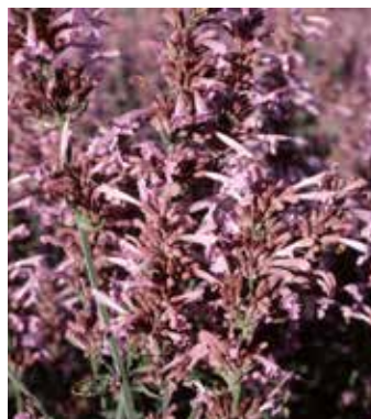
AG2060 AGASTACHE cana 'Heather Queen'

(SAHIN 2000) abundant sprays of orange flowers, leaves scented