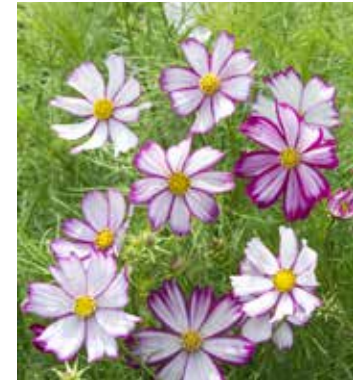
CO9212 COSMOS bipinnatus 'Tip Top Picotee'

(SAHIN 2019) pastel yellow flowers with peachy reverse petals