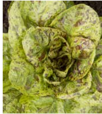
LA1565 LACTUCA sativa 'Forellenschuss'

Romaine type, firm, crispy lettuce with pleasant taste, 60 days