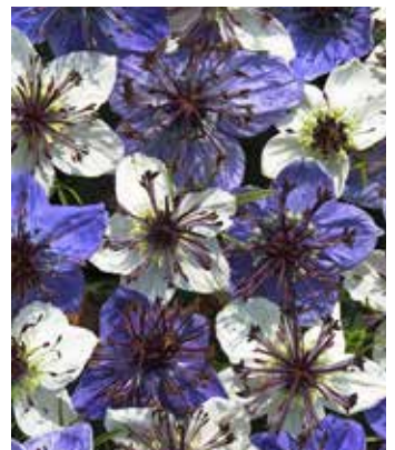
NI7199 NIGELLA papillosa 'Ebony & Ivory'

(SAHIN 2002) velvety dark purple flowers and deep purple pods