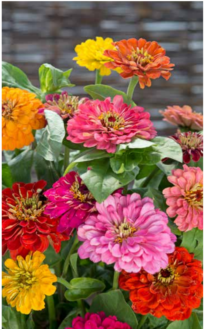
ZI4300 ZINNIA elegans 'Field Grown Mixture'

Bright scarlet, vigorous plants with large rounded fully double flowers