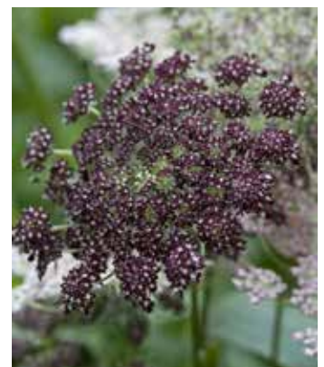
DA7700 DAUCUS carota 'Dara'

(SAHIN 1997) single flowers in rich colours, best seed strain in 2005 BBC Trials