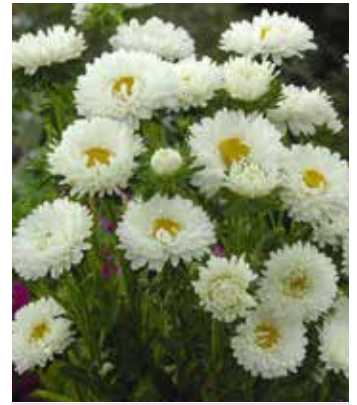
CA2193 CALLISTEPHUS chinensis 'Sahin's Matsumoto White'