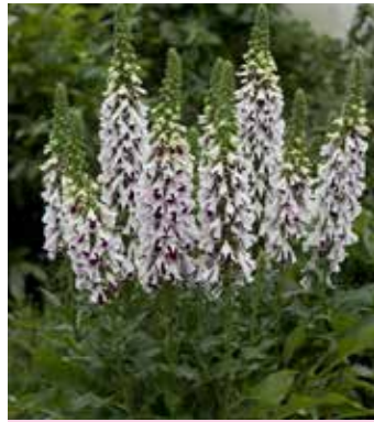
DI7166 DIGITALIS hybrida 'Pam's Split'

White with solid dark red blotch in throat, an impressive stature