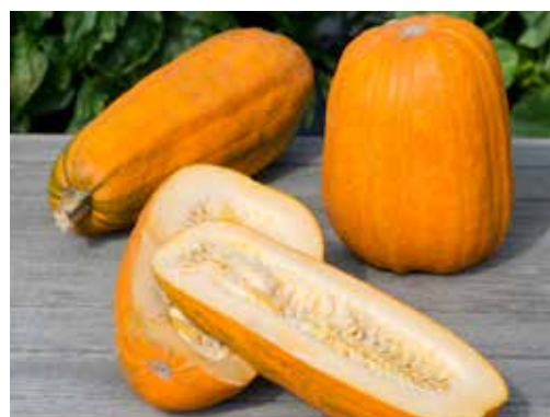
CU4015 CUCURBITA pepo 'Long Pie'

Lemon shaped summer squash, fruitsize 10-15 cms