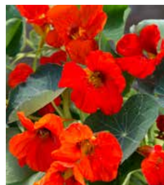
TR9115 TROPAEOLUM minus , 'Empress of India'

(SAHIN 2018) FS-N 2018 unique bloodred to creamy flowers all with 'bleeding' effect