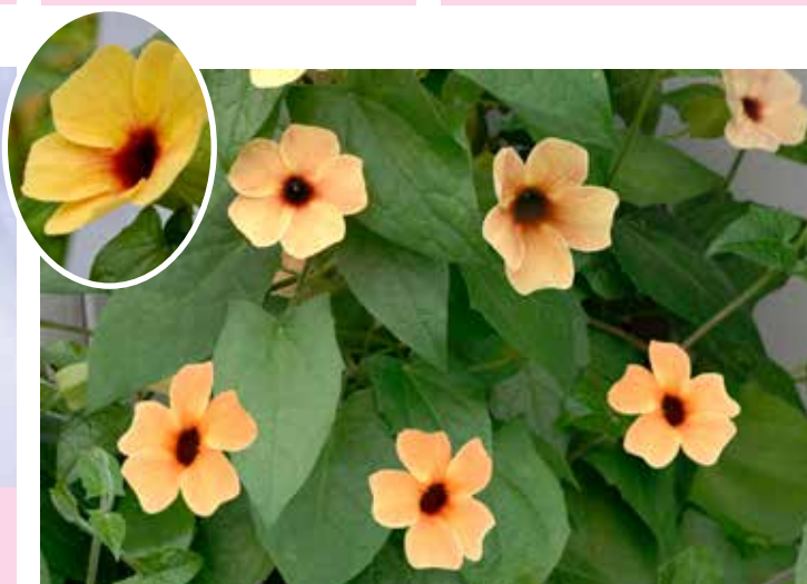
TH7800 THUNBERGIA alata 'African Sunset Mixed'

Golden orange flowers with contrasting black centres, very bright