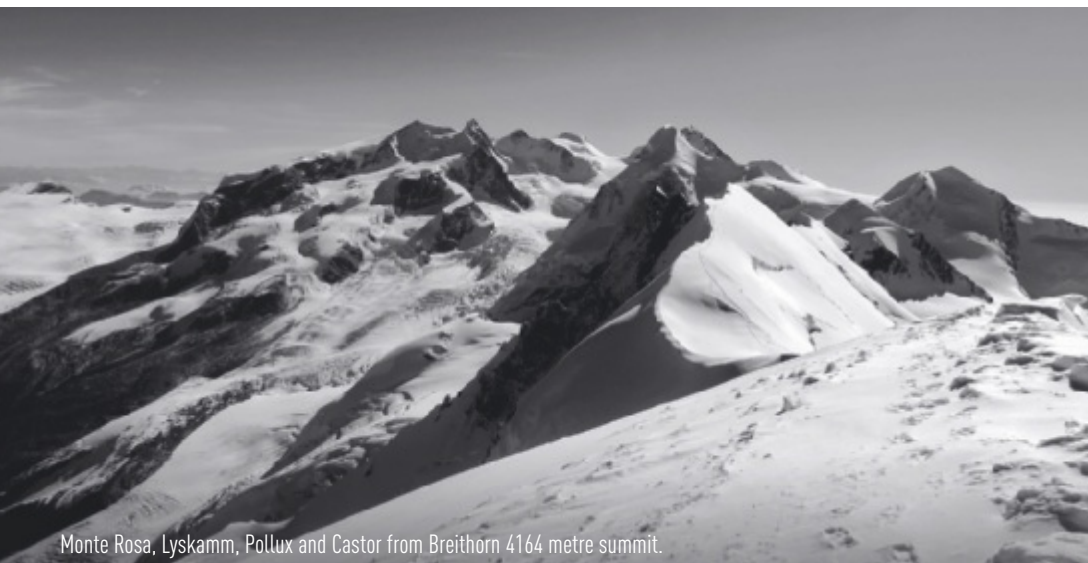
Monte Rosa, Lyskamm, Pollux and Castor from Breithorn 4164 metre summit.

Church & Heritage Centre, Quarry St, Guildford, Surrey from mid-August. If you would like to receive updates on new work or exhibitions, please contact fialpinephotos@gmail.com