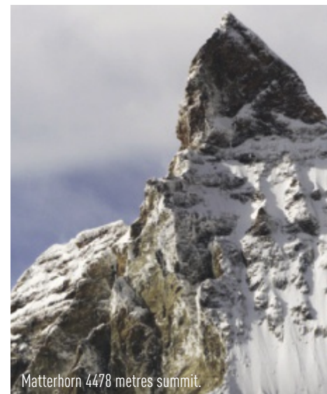
Matterhorn 4478 metres summit.