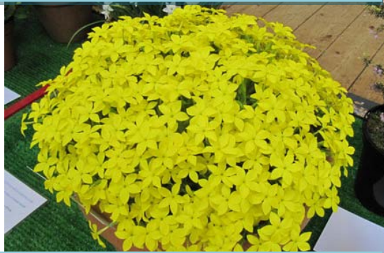
Sebaea tomasii Certificate of Merit for Tom Green