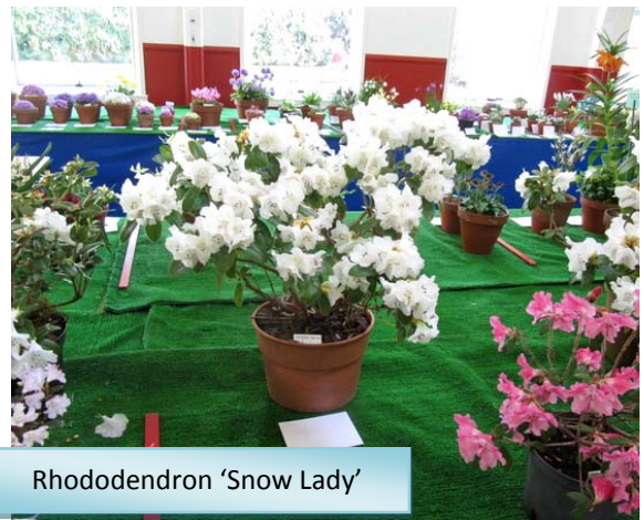
Rhododendron 'Snow Lady'