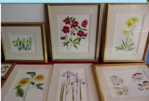
Some of Eileen Goodall's beautiful paintings