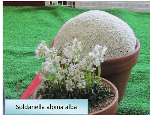
Soldanella alpina alba