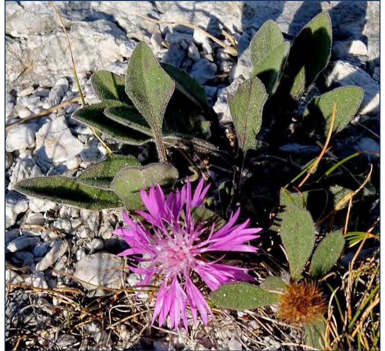
Above: Centaurea montis-barlae Left: Monte Barla

Here we saw the promising endemic Centaurea montis-barlae at the southern slopes above the quarry during our cooler evening trip. All plants were about 5-7 cm high, with decorative lanceolate leaves and pink flowers, 3-4cm in diameter. Some had started to form seeds. It is a saxatile alpine suitable for cooling crevices of sedimentary rock or tufa cultivation. Mt. Barla showed us marble fissures filled with a pretty flat shrub, a small Buckthorn, with small glaucous leaves, Rhamnus glaucophylla (below, left).