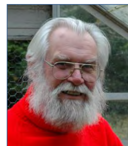
Far left: Saxifraga 'Allendale Charm'