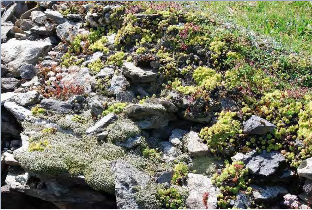
Sempervivum paradise on Gran Paradiso in Northern Italy

“For all that Nature by her Mother Wit could frame in Earth, and form of substance base, was there; and all that Nature did omit, Art (playing second Nature's Part) supplied it.”