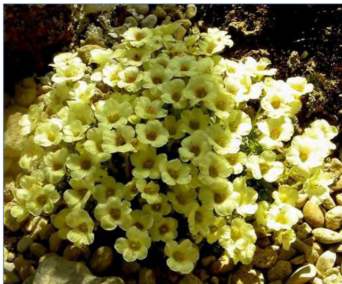
'Allendale Harvest' in a pot and in the ground