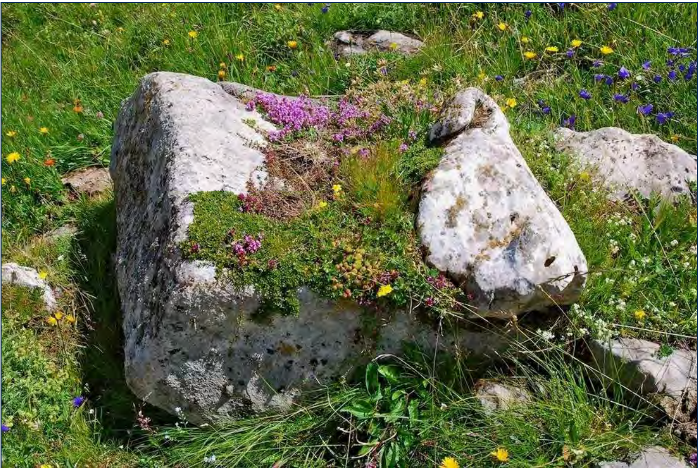
Mixed planting in a natural "trough"