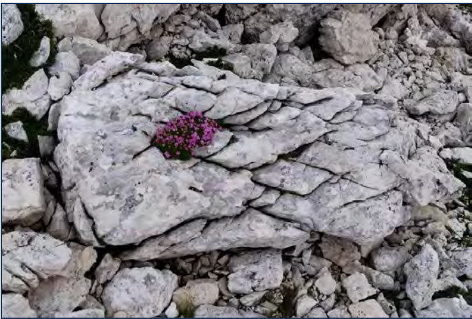
Silene occupying a boulder niche on Piz Boé