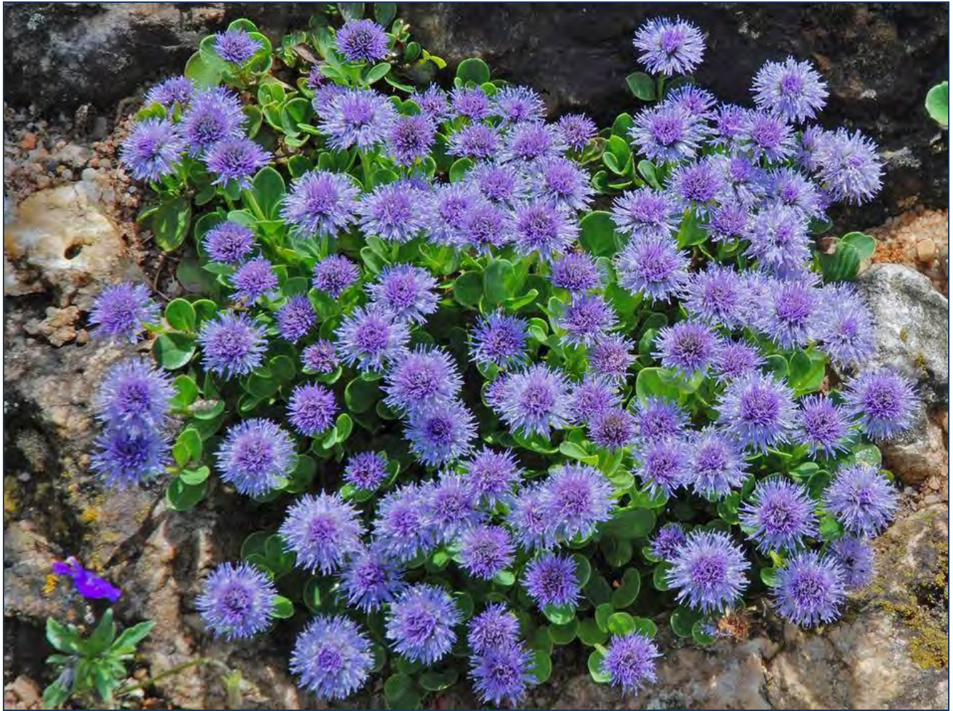
Globularia incanescens in flower (above) and in seed (below)

green spatulate leaves. The best plants in cultivation are grown in tufa holes. I had trouble growing this species in my too dry, open soil. This species occurs towards the elevation of 1700m and plants there are really small treasures.