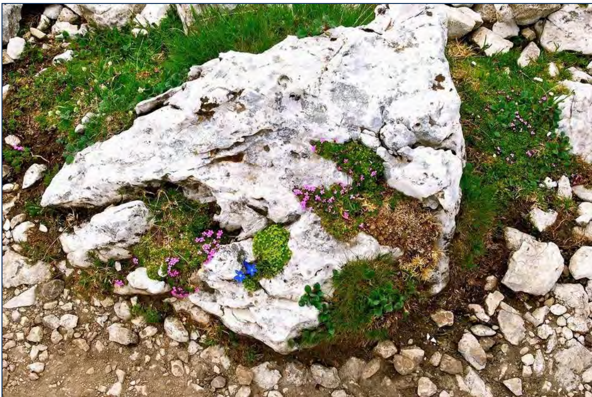
A mini-garden in a boulder in the Dolomites