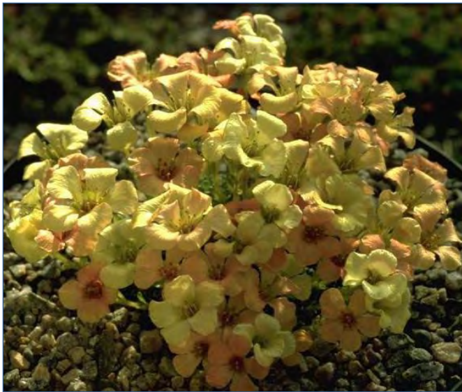
Below: Saxifraga 'Allendale Amber'