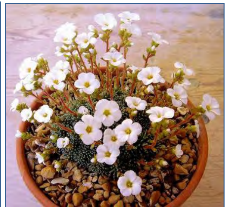
Saxifraga 'Allendale Ina', Saxifraga 'Allendale Enchanter', Saxifraga 'Allendale Citation' - showing their attractiveness for culture in pots or in the open ground.