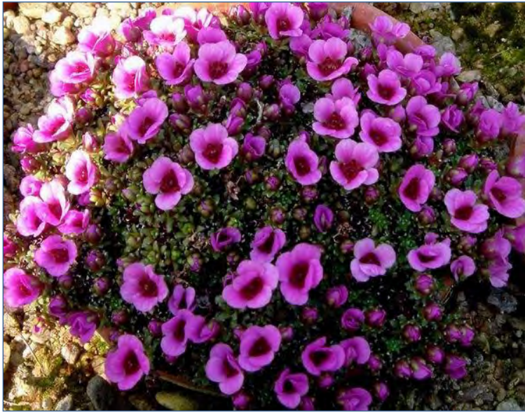
Below: Saxifraga 'Allendale Betty'