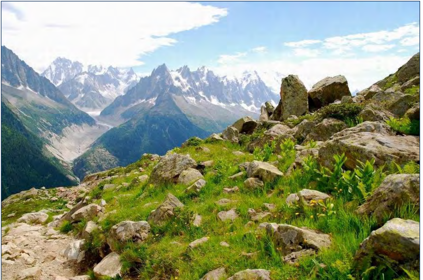
Nature’s rock garden – above Chamonix in the French Alps

Pictures speak louder than words, so I have illustrated this short homage with a number of images captured in the wild places of the world.