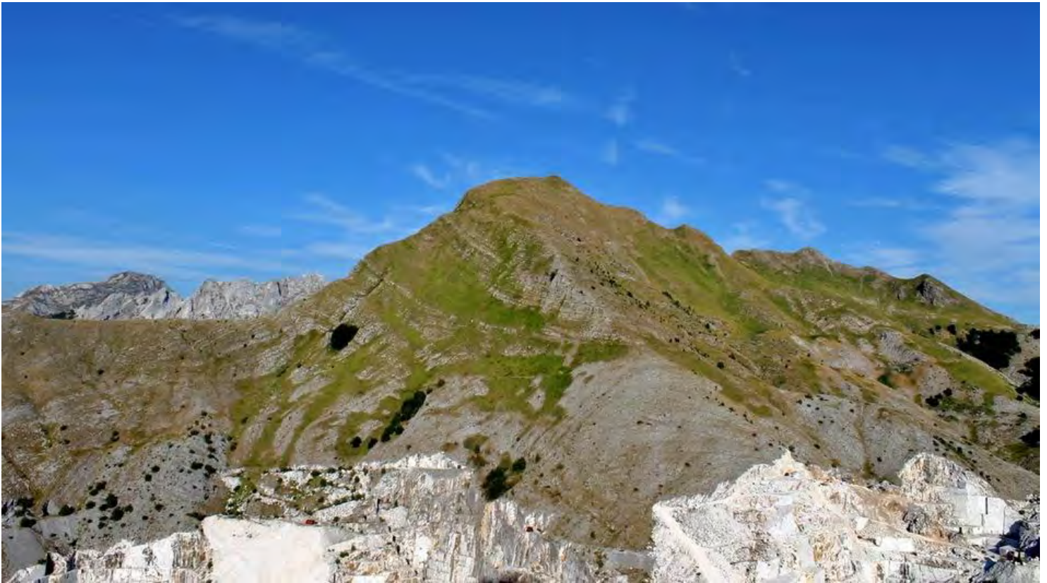
Monte Sagro, Alpi Apuani

The Apuan Alps are a mountain massif distinctly separated from the Tuscan Apennines in Italy. They show an elliptical shape about 55km long and 25km wide; the main axis is oriented NW-SE. The highest peaks (Monte Pisanino, Monte Cavallo, Monte Tambura, Pizzo d'Uccello) reach almost 2000m above sea level. A great variety of rocks and soils is one of the most interesting characters of the Apuan Alps, which are well known also for the marble quarries since Roman times. Marbles from the Carrara region are very fine for carving (In 1504, Michelangelo made his statue of the naked warrior David from a huge block of Carrara marble).