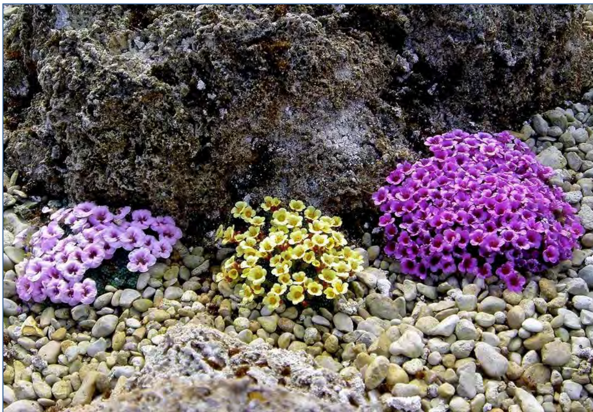
Allendale Saxes - 'Fairy', 'Bonny' and 'Bravo'

I would advise that these lists are seen as guidelines only, Saxifrages are very sensitive to location and growers will have to experiment within their own micro-climate, after all this is part of the fun of gardening.