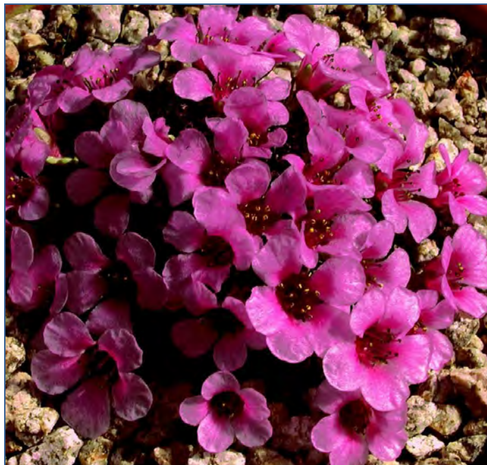
Above : 'Allendale Elegance'