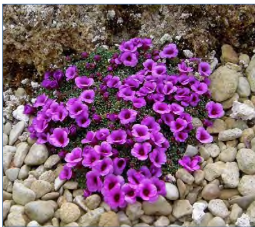
Left: Saxifraga 'Allendale Bravo'