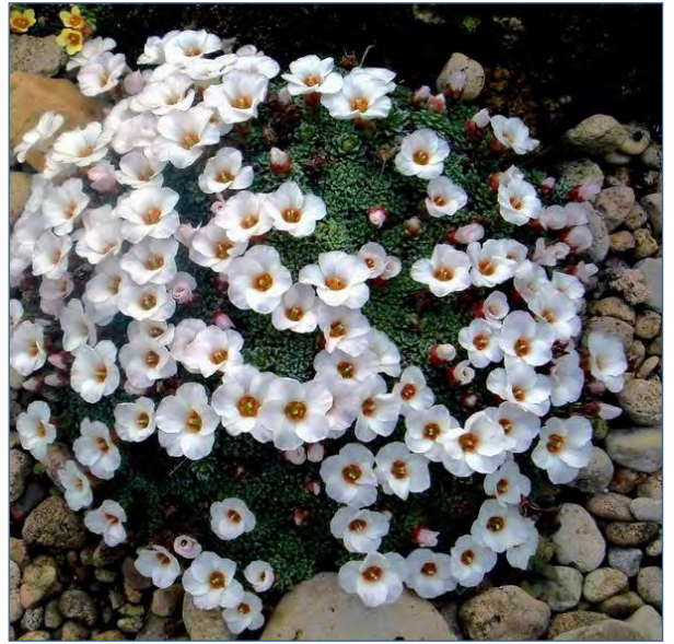
Saxifraga 'Allendale Ghost'