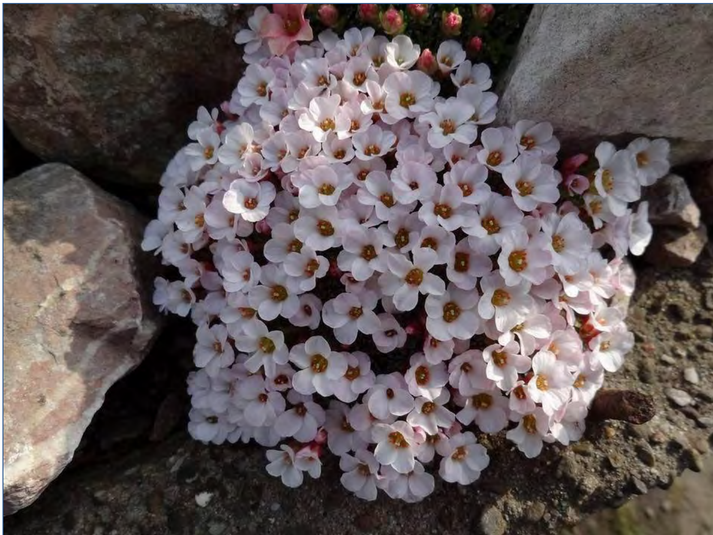
Saxifraga 'Allendale Charm' in the garden of Jan Fouquaert in Belgium