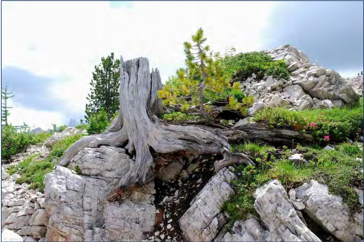
A perfect rock garden in the Cinque Torre, and “designer” plantings in the Dolomites with entire crevice gardens and covetable boulders.