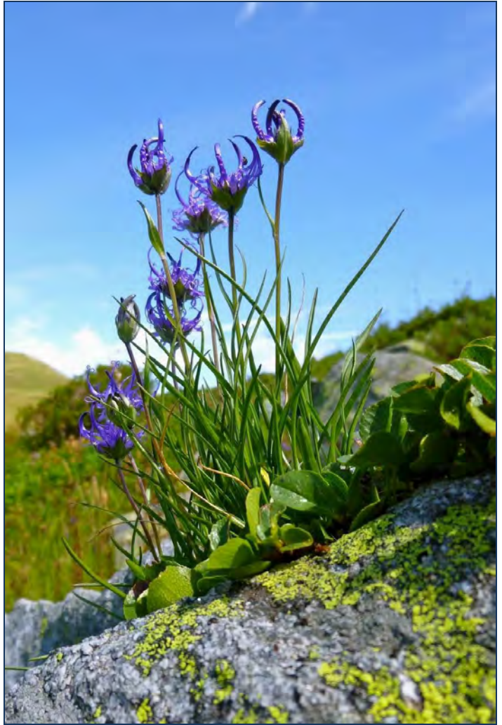
Campanula heaven and splendid Phyteuma species (above) Erinus alpinus (below) - French Alps