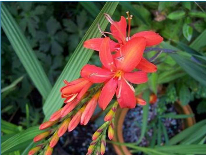
Below: Crocosmia 'Flamenco'

Our selected cultivar of Crococsmia masonorum , 'Flamenco', was the most richly coloured from among several hundred seedlings but I think we needed to have taken the selection process one or two generations further to come up with a truly outstanding deep-coloured clone. We started to select in the opposite direction to produce a good yellow but this project never reached fruition.