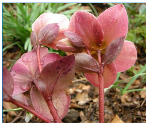
H. x ballardiae 'Pink Frost' [left] and