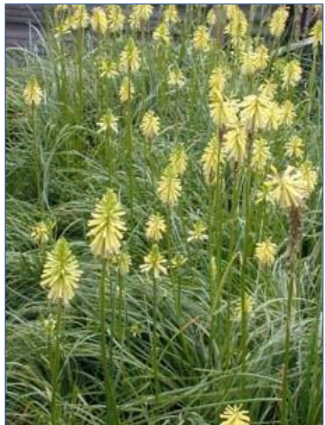
Kniphofia 'Brimstone'

In the days before 'Index Hortensis', 'The Plant Finder' and national collections, it was not always easy to find out if a cultivar name had already been used, especially when there was no registration authority for a genus. We were just in the middle of