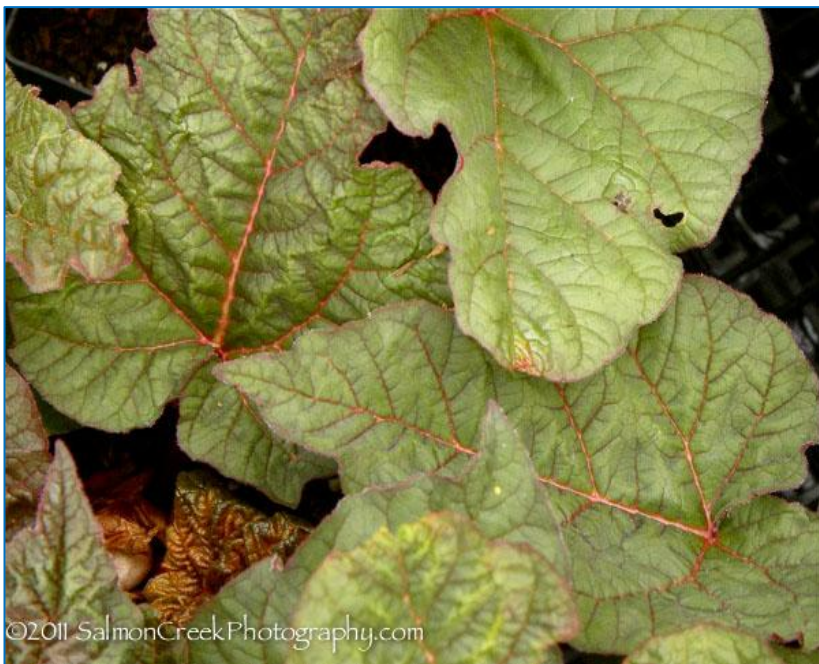
Rheum 'Ace of Hearts' by Jessica Friedland for Digging Dog Nursey

Some of the best plants we selected at Buckshaw were extracted from such extensive hatches of seedlings. Occasionally natural hybrids would occur. Rodgersia ' Parasol ' came out of a bed of R. aesculifolia seedlings. This had obviously resulted from hybridization with R. podophylla and we listed it for some years simply as a R. aesculifolia hybrid. I put the cultivar name ' Parasol ' on it, when we were selling herbaceous plants wholesale after Eric had moved to Hadspen. We have a large patch of it in our garden in Wales and it is as fine a foliage plant as any other Rodgersia , as well as being distinct. Another plant which I named but which we do not have in our garden, although I am always meaning to obtain it again, occurred in the same way. This is Rheum ' Ace of Hearts ', a plant which I see periodically on television, as it seems to have become popular with garden-designers. We had obtained a stock of Rheum kialense from seed from Uppsala Botanic Garden. These had come quite evenly but when we raised a further batch from our own seed, it was obvious that several had crossed with a red-leaved form of Rheum palmatum . ' Ace of Hearts ' was what we thought to be the best of these. It is a fine thing but I am still surprised that it has achieved even the small degree of popularity that it has.