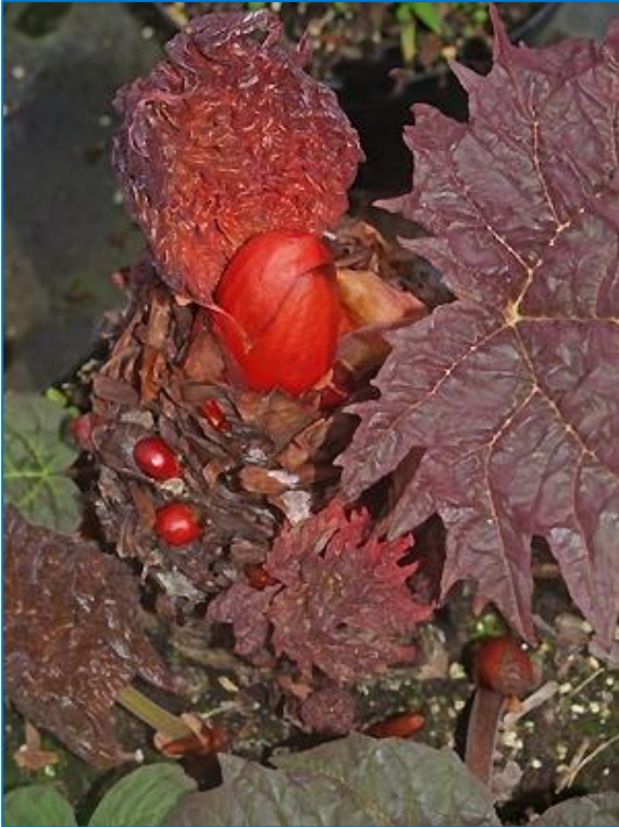
Rheum 'Red Herald'

best, red spring foliage among a large number of seedlings from what is grown as R. p. 'Atrosanguineum' or 'Bowles' Crimson'. I saw a fine group of the genuine clone at The Garden House at Buckland Monachorum last spring and we have a good planting of it in our garden. I think our green-leaved but red-flowered clone 'Green Knight' is the better all round garden-plant here, however.