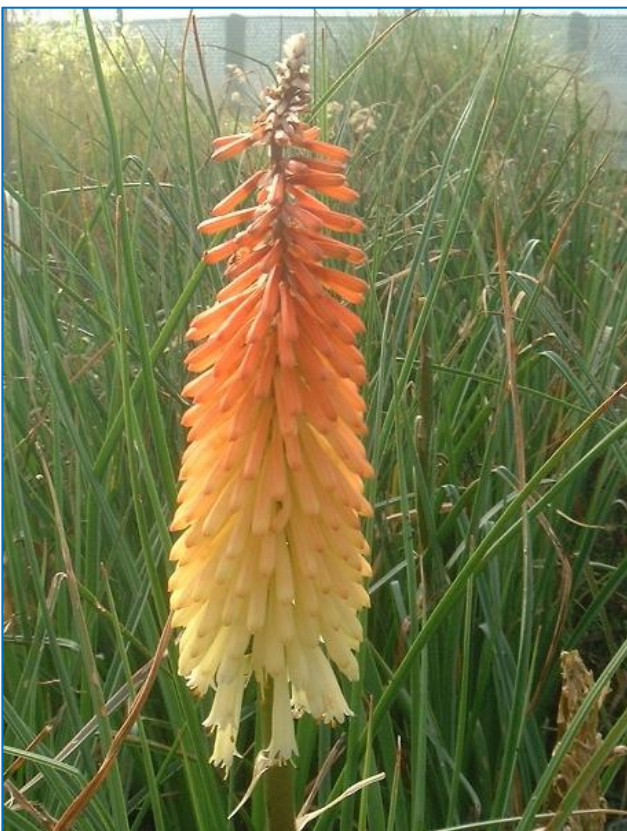
Kniphofia 'Painted Lady' Gavin McNaughton/MacPlants