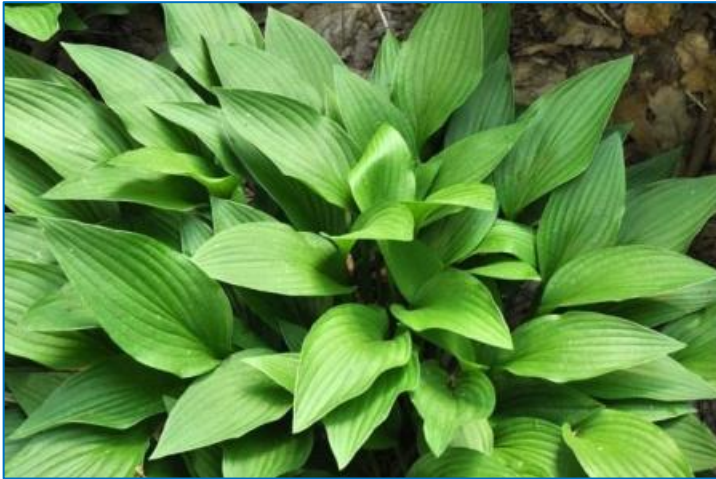
Hosta 'Pastures New'