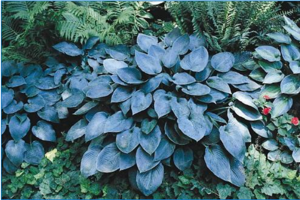
Hosta 'Halcyon'