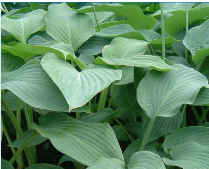
Hosta 'Snowden'