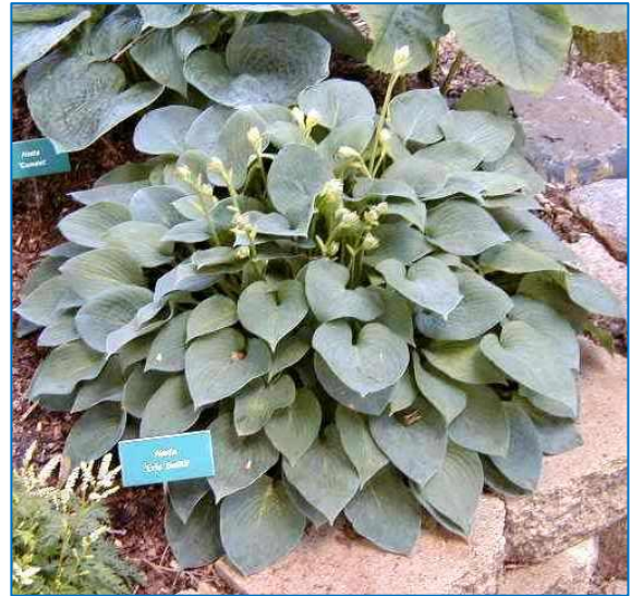
Hosta 'Eric Smith'