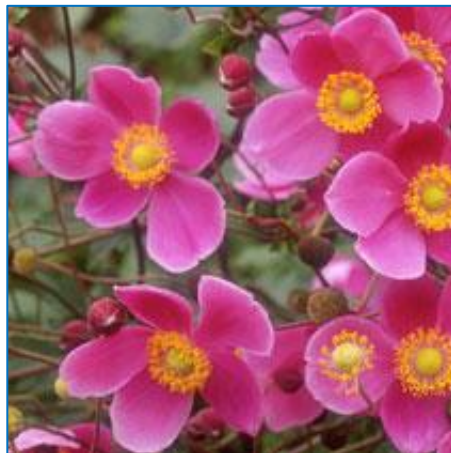
Anemone hupehensis 'Hadspen Abundance'

Eric's eye for a good garden-plant, while not infallible, has often been proved much more reliable than my own.