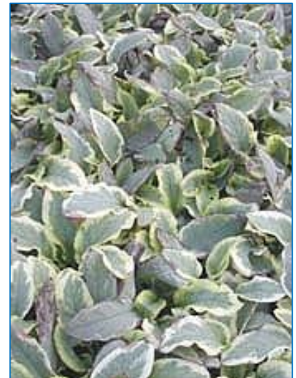
Right: Symphytum 'Goldsmith'