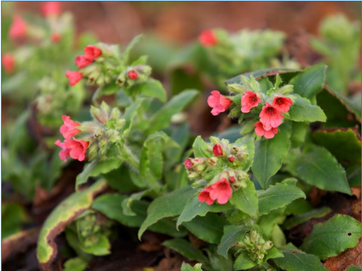
Pulmonaria rubra 'Redstart'