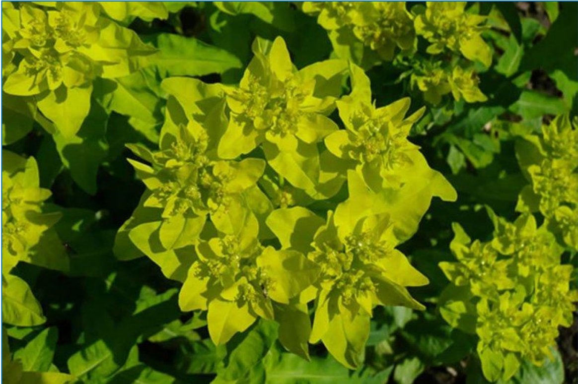
Euphorbia polychroma 'Midas' (above and below right)