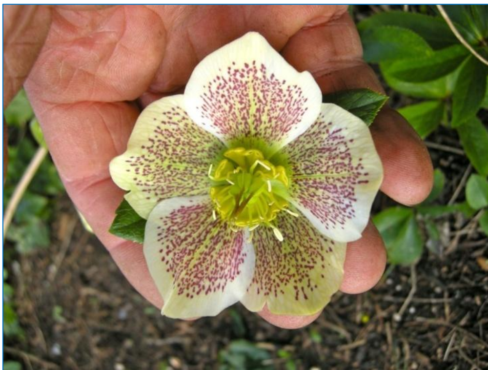
Helleborus seedling from 'Cosmos' grown by/photo Tim Ingram

It is the influence of the selected parent stocks on subsequent generations of seedlings which is really important.