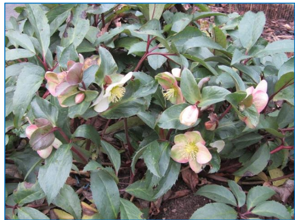
Helleborus x ericsmithii