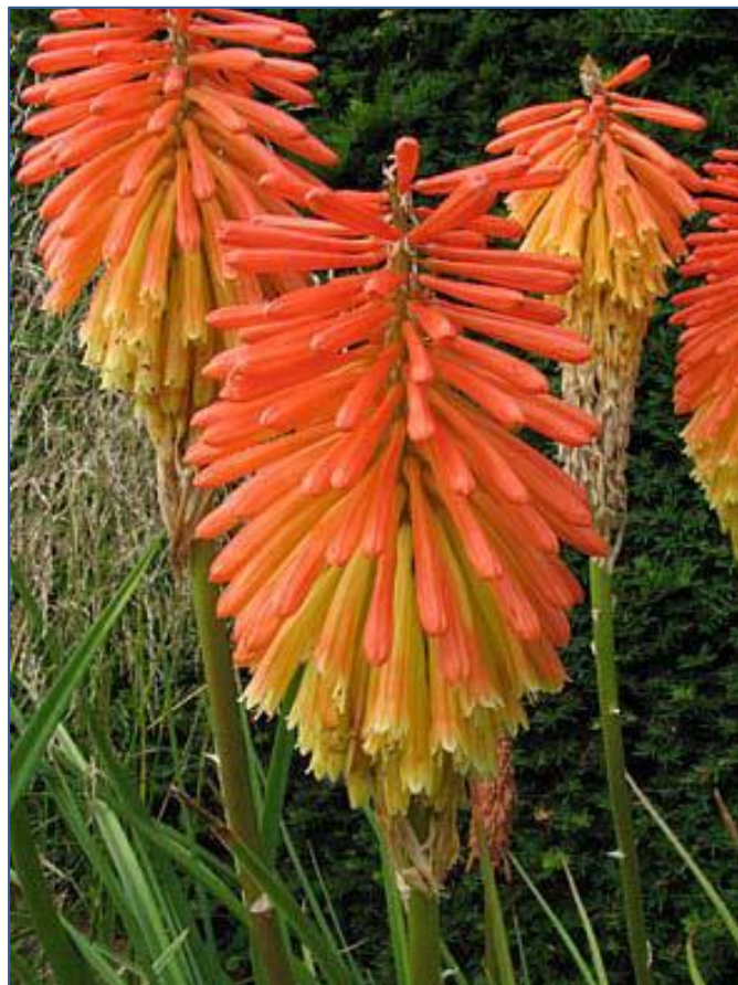
Kniphofia 'Painted Lady' at Wisley, photo Paul Cumbleton