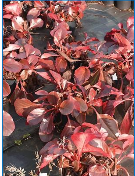
Bergenia 'Bach' and Bergenia 'Eric Smith' AGM