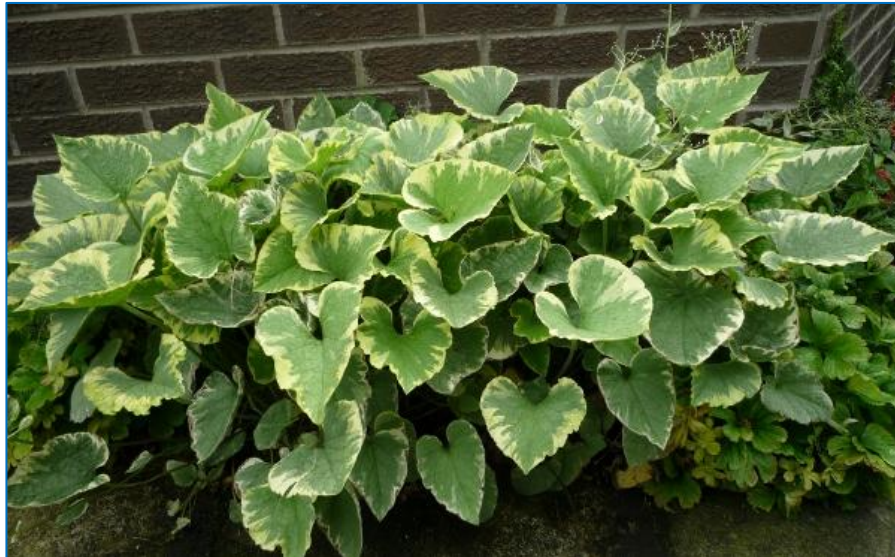
Left: Brunnera macrophylla 'Hadspen Cream'