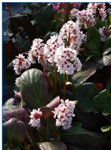
Left: Bergenia 'Beethoven'