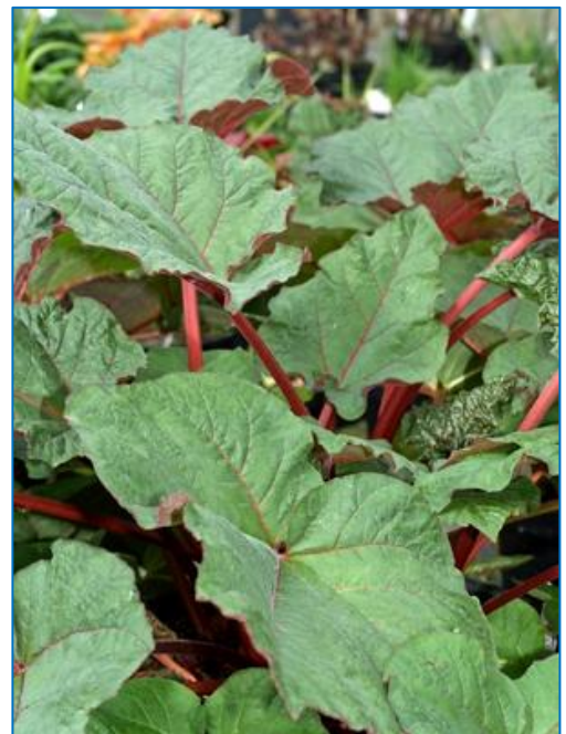
and Bob Brown of CGF

I think our selected clones of Rheum palmatum are much more spectacular but they do need much more space. R. palmatum ' Red Herald ' was selected as having the