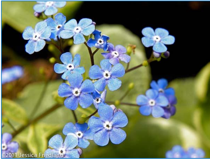
Brunnera macrophylla 'Hadspen Cream'