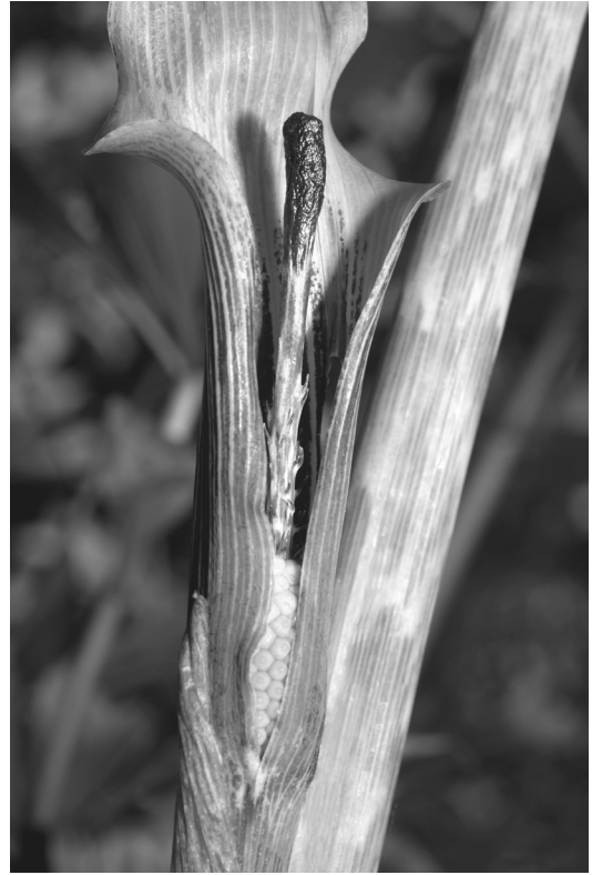
Fig. 3. Arisaema muratae (paratype). Close-up of a female inflorescence.

and yellow-green. Spathe-limb horizontal, lanceolate, shorter than tube, ca. 5 cm long and 4 cm wide, slightly translucent, outside and inside yellow-green with paler veins; apex acuminate, ending in a tail, up to 15 cm long, yellow and turning carmine at end. Spadix either male or female. Male fertile part cylindrical to slightly conical, 4–5.5 cm long, 10–13 mm in diam., stamens densely arranged, each consisting of 2–4 anthers, stalked, thecae purple below and carmine above, dehiscent by elongated pores; pollen blue. Female fertile part slightly conical, 2–3 cm long, 10–15 mm in diam., ovaries bottle-shaped and densely arranged, pale yellow-green, unilocular, each containing ca. 3 basal ovules, fusiform; stigma penicillate, white and sessile. Spadix-appendix sessile, cylindrical and clavate, slightly protruding from spathe-tube, 4–5 cm long in male spadices, 5–6 cm long in female spadices, 4 mm in diam. above fertile part and 7 mm across at apex, whitish with carmine longitudinal stripes, obscure crimson and wrinkled at apex;