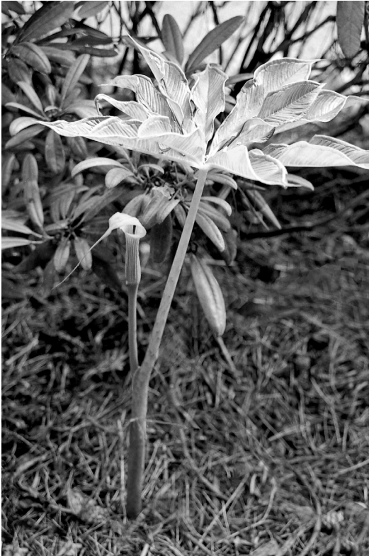
Fig. 2. Arisaema muratae (paratype). A flowering specimen.