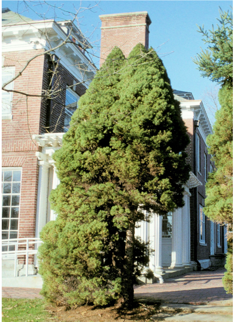
The Picea glauca 'Conica' shown above was planted in a bad spot. Below, left, is a Pinus mugo 'Valley Cushion' and below, right, is the graft done by Eddie Rezek as described in the text..

When searching catalogs to locate dwarf conifers, be sure to have a good reference source handy. Catalog and internet descriptions can be questionable.