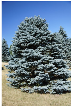
Picea pungens 'Glauca Globosa' top and 'R.H. Montgomery' bottom. Both at the Longnecker Arboretum in Wisconsin.