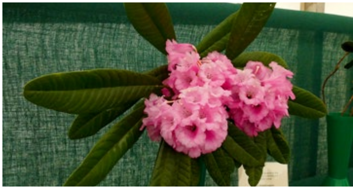
Rhododendron montroseanum from NT Nymans was winner of the Phostrogen Cup for best spray of rhododendron species.