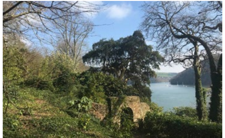
The view of the River Dart from Greenway House. The former home of Agatha Christie.

Magnolia doltsopa was flowering, we looked back at the ancient Cork Oak, framing a stunning view of the River Dart behind.