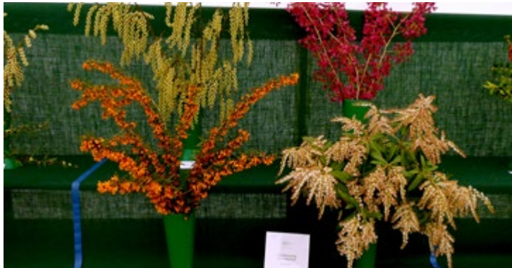
The Crown Estate's winning entry for the Charles Eley Centenary Bowl