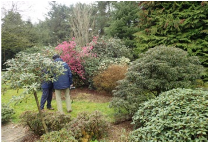
R. 'Boskoop Ostara' in bloom at the back, R. Graziella on the right.

Gault' and 'Jessica.' Unfortunately at the date of the visit (April 13th), it was a month too early for the flowers of hybrids except for a Big Leaf (a falconeri hybrid) and 'Boskoop Ostara', a vivid pink deciduous rhododendron with small azalea-like corollas.