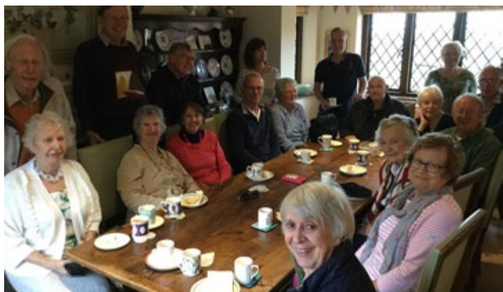
Members of the SE Branch enjoying tea at Legsheath Farm