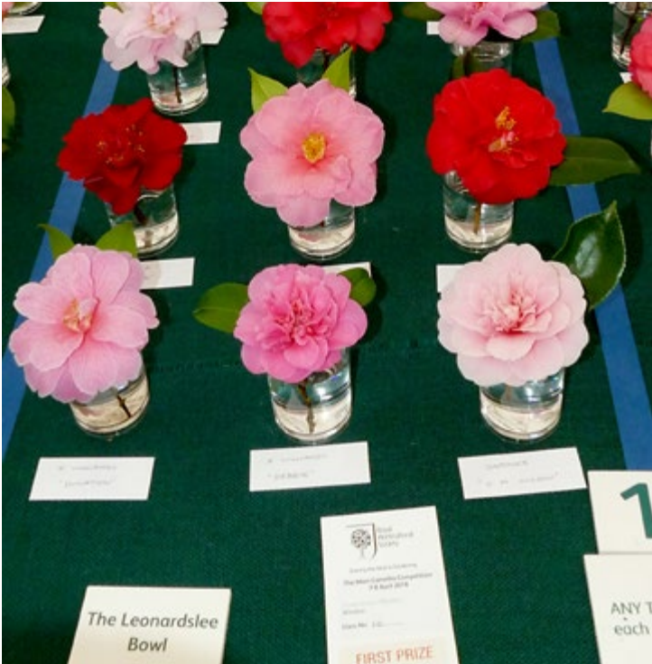
The Crown Estate's winning exhibit for the Leonardslee Bowl