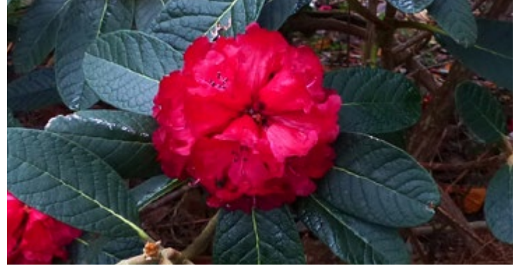
Large flowered Rhododendron mallotum at Rowallane.

Our final destination was the Home Wood, flanking the drive, where, historically, rhododendrons had been well spaced below a sheltering canopy, and where we found further confirmation that many of the plants described in 1948 still existed, including a large flowered R. mallotum .