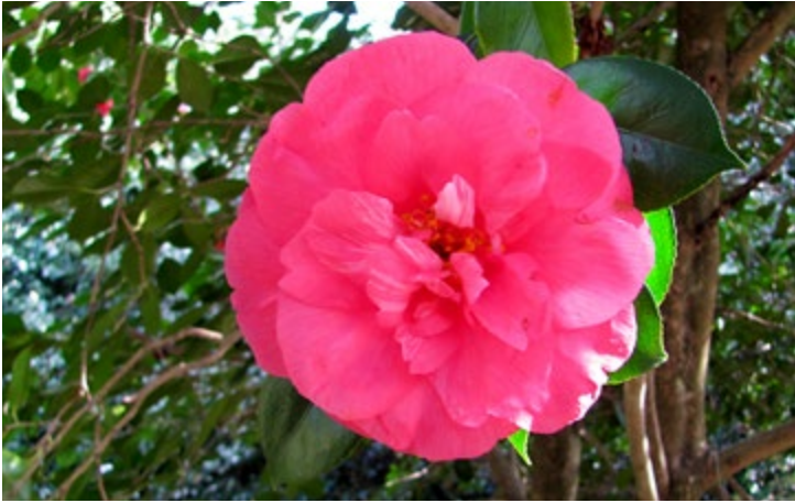
Camellia 'Drama Girl' in the winter garden at Exbury

were driven through an avenue of camellias, amongst them was a lovely 'Drama Girl'.