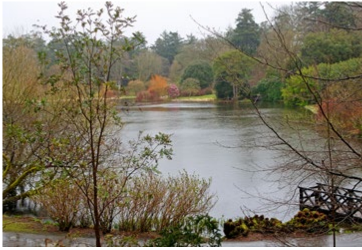
A view of the lake at NT Mount Stewart.

Lady Edith it seems had a soft spot for rhododendrons and she particularly loved lilies and all fragrant plants, indeed she would make potpourri using flowers from the garden. There are examples of Rhododendron 'Nobleanum' in the Shamrock Garden and a planting of Rhododendron Coccineum Speciosum in the Sunken Garden. Her love of our genera is clear throughout Mount Stewart.