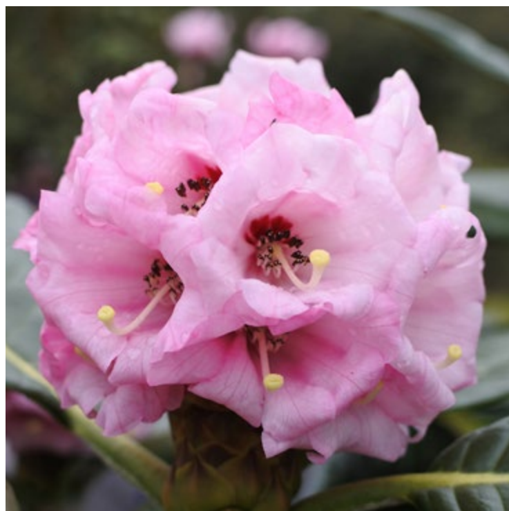
Rhododendron heatheriae at Mahee, N Ireland.

The Forestry Commission and Friends of Westonbirt Arboretum went out of their way to make us welcome at the AGM