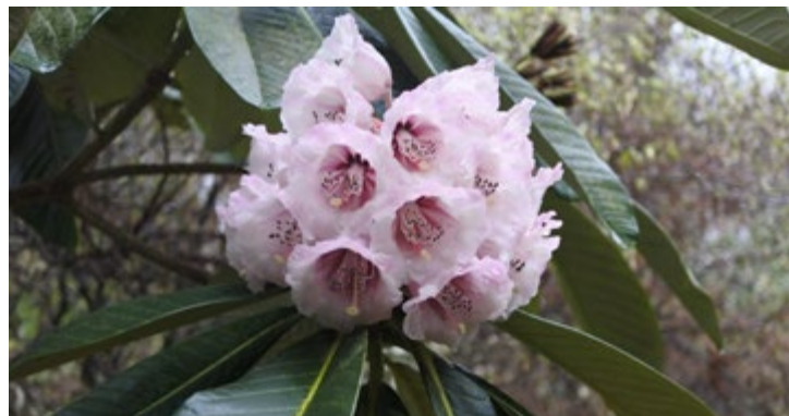
Rhododendron heatheriae at Seaforde.