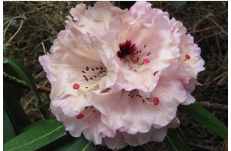
Rhododendron 'Our Kate' at Exbury.