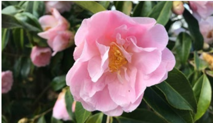
Camellia 'Crinkles' at Greenway.