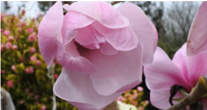
Magnolia campbellii at Mahee.