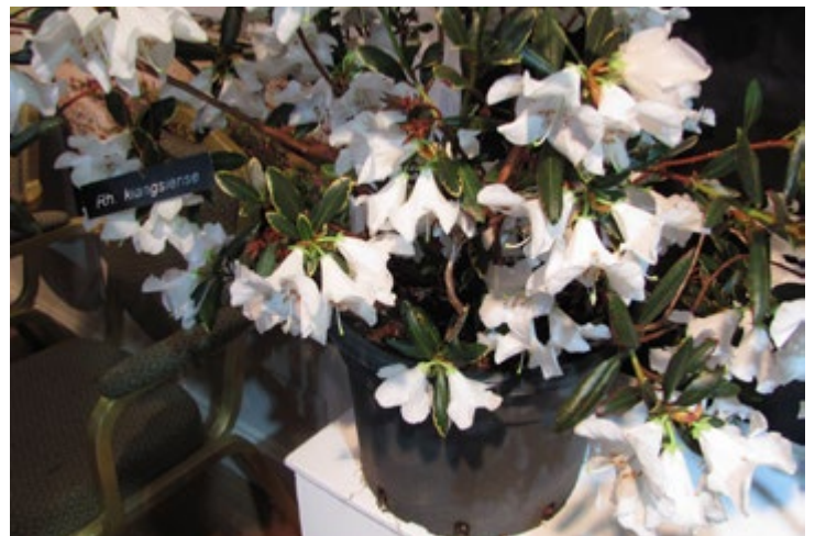
R. kiangsiense in the 5 Arrows Gallery at Exbury.

We were driven to the 5 Arrows Gallery where there was a lovely display of Lachenalia , orchids, Vireya and Maddenia rhododendrons. Amongst the latter was the rare and beautiful R. kiangsiense covered in white flowers.