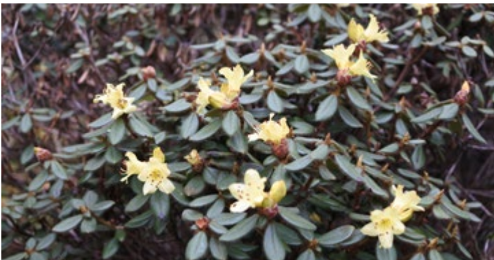
Rhododendron valentinianum in the rock garden at Rowallane.

The 1948 article does not include a description of the Rock Garden Wood, as by then the rockery had run out of control. Now restored, sheets of natural rock rear up and fall down the slope like roofs, at the bottom of which we found R. ciliatum and R. valentinianum shining out of the gloom.