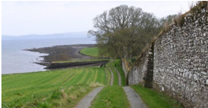
View of Stranford lough (see below)

Like so many other old gardens the walled garden has for many years been turned over to the growing of shrubs, some trees and ornamentals but odd apple trees still remain. Notable at the time was a fine specimen of Corylopsis , possibly C. spicata , with a good yellow colour and largish flowers. Further along the top path a very fine specimen of Rosa roxburghii caught my eye.