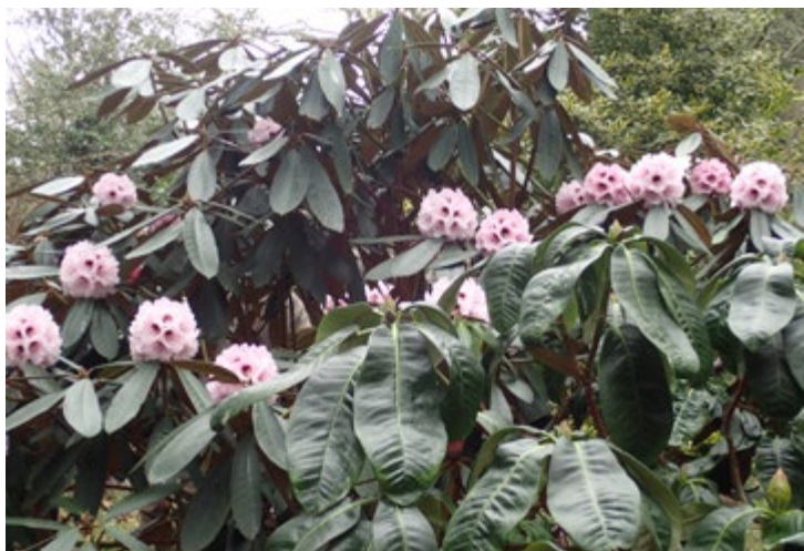
R. fulvum in bloom. Behind: R. macabeanum x 'Argosy'.