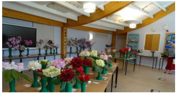
The Rhododendron Show at RHS Harlow Carr. Photo: David Millais