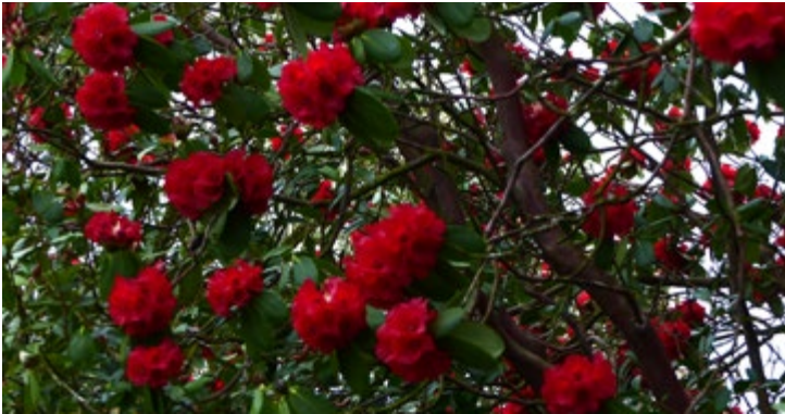
Rhododendron 'Shilsonianii' at Rowallane.

Dominating the walled garden was a large Magnolia acuminata and blazing away in the corner was a multi-stemmed Rhododendron 'Shilsonianii'. From there we walked out to the Spring Garden, a grass fairway between banks of rhododendrons which was exactly as Armytage-Moore had described and photographed: edged by strong groupings of azaleas and Triflora and backed by magnolias (one a tall M. campbellii var. alba ) with screens of beech and Scots Pine on either side.