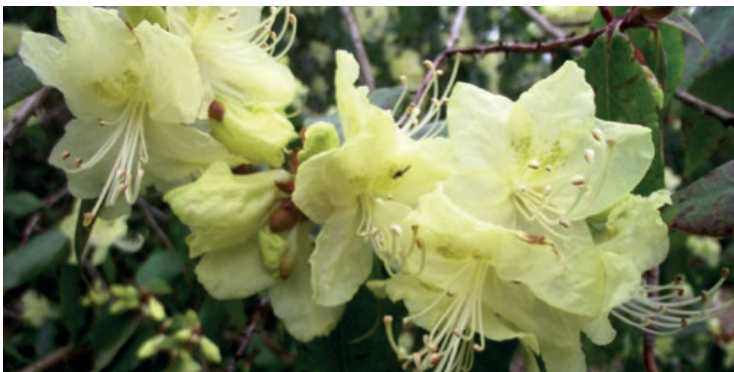
Rhododendron lutescens at Bowood House

Scent is found in R. lutescens , which has somewhat deeper yellow flowers that are borne relatively early in the season. Whilst the first blooms can often be lost in frosty weather, they tend to open in succession over a long period and there are normally some that escape damage. The new growth of this species is most attractive: the young willow-like leaves have a bronze coloration that slowly becomes green as the season advances.