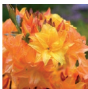
Azalea Sun Star

We grow one of the finest ranges of Rhododendrons and Azaleas in the country. Everything from historic varieties rescued from some of the great plant collections, to the latest introductions from around the world.