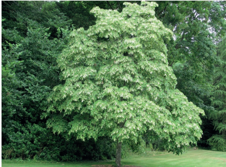
Tilia neglecta above and below at Malshanger.