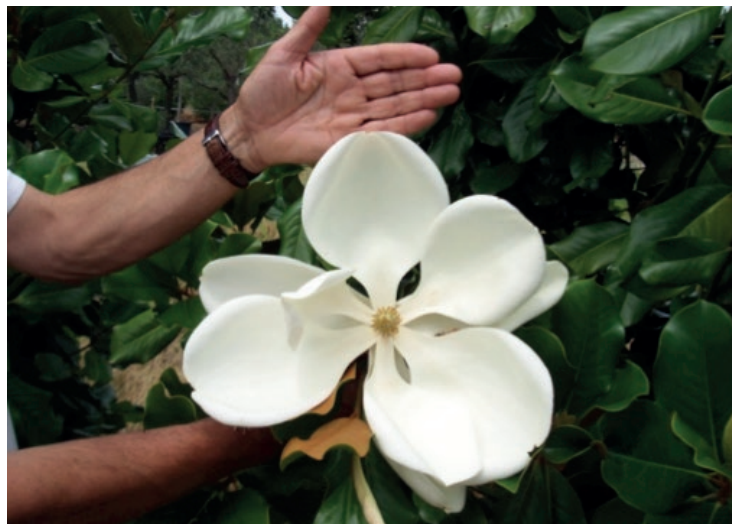
Magnolia grandiflora 'Mont Blanc'