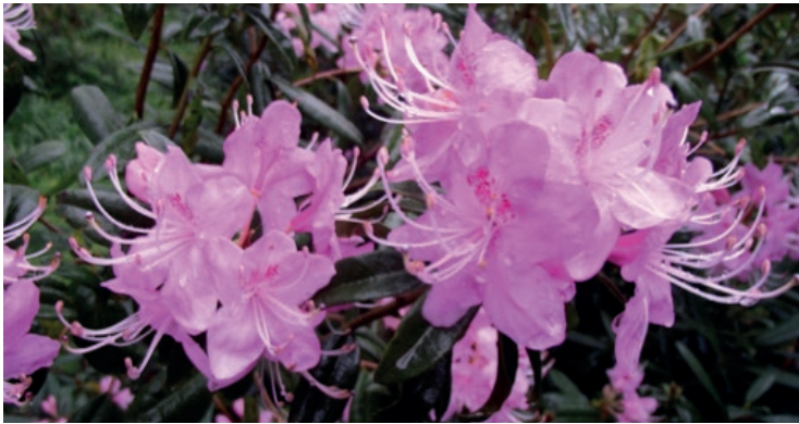
Rhododendron davidsonianum 'Caerhays Pink'

R. davidsonianum has produced several named clones with strong pink flowers that are well worth looking out for. Two of the best are 'Caerhays Pink', selected in 1984 and having a well-marked red flare and 'Ruth Lyons', registered in 1961, a clear pink, no markings within the flower and, frequently, up to seven lobes.