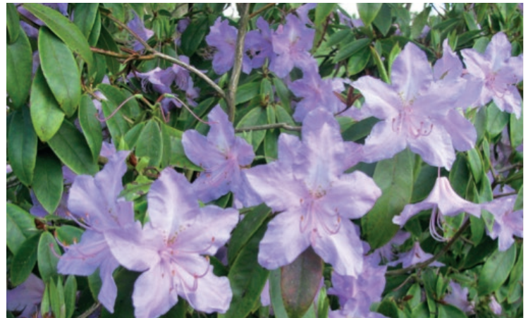
Rhododendron augustinii subsp. augustinii

Although its flowers can embrace a range of colours from lilac through to a pale purple, the best forms of Rhododendron augustinii and its subspecies chasmanthum can fulfil any quest for a blue flowered rhododendron. However, the filaments of its stamens are frequently of a purplish hue and can spoil the effect. The cultivar 'Electra', a cross between these two subspecies, is among the best, having a very pale throat with yellowish markings and white filaments.