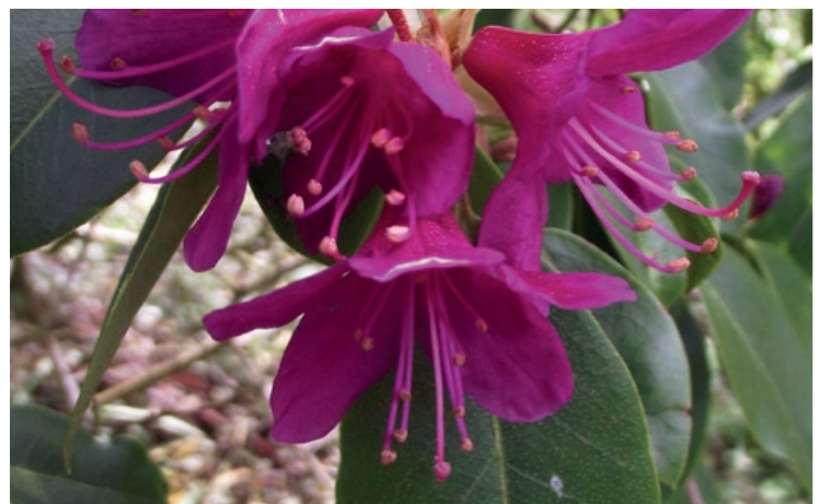
Rhododendron concinnum Tower Court Form

To complete the extremes of the Triflora Subsection's colour spectrum, Rhododendron concinnum needs to be included. This species has a wide range of colours from pale rosy-lilac to a strong reddish-purple, this darker form is probably the most sought after by collectors. Like R. ambiguum , its habit is somewhat dense and compact; out of flower it is often difficult to tell the difference between these two species, as the glaucous under surfaces and shape of their leaves are almost identical.