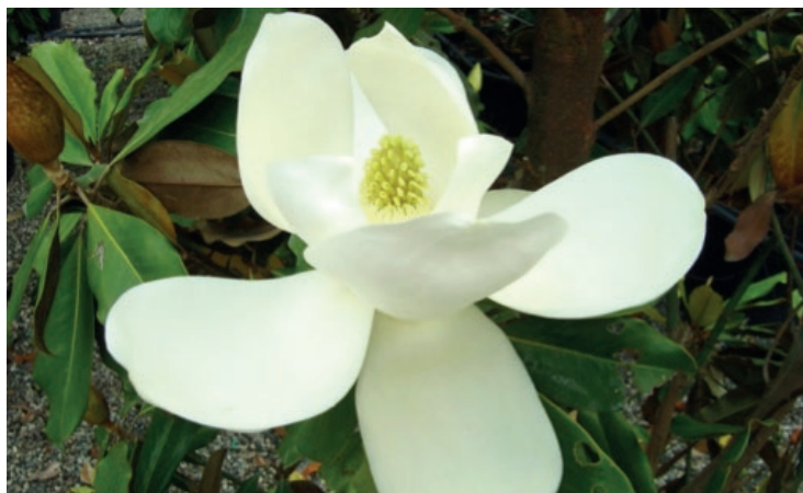
Magnolia grandiflora 'Purpan'

M. grandiflora 'Purpan'® is a vigorous and heavy-blooming evergreen variety with a characteristic upright and narrow form. The white and strongly scented flowers begin in June and continue until early August. It has the advantage of flowering on young plants from 3 years old whereas 'Galissioniensis' flowers only on plants from 6 years old. The leaves are also unique: rather small, very much elongated and with a slightly wavy margin. They are dark green on the upper surface, russet and fuzzy on the lower surface. It grows particularly well in a pot and therefore is highly recommended for urban plantations.