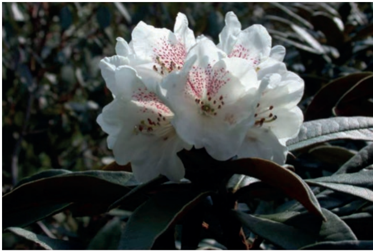
Rhododendron iodes at Woodlands. Photo source unknown.