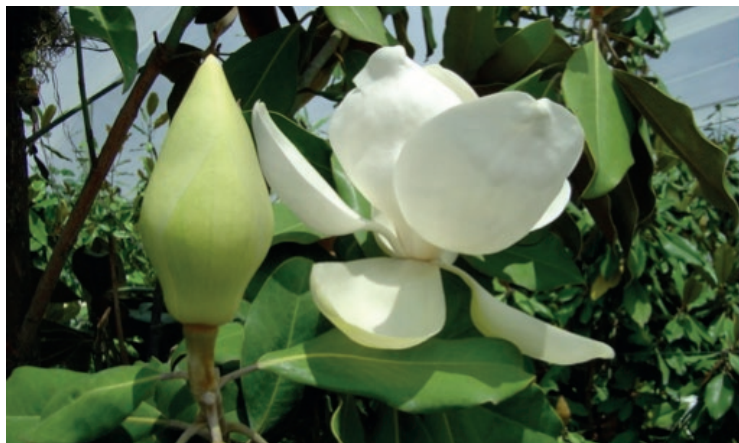
Magnolia grandiflora 'Purpan' flower and bud showing also the wavy leaf margin.

The variety comes from a unique specimen planted between 1735 and 1780 by the religious Sisters Du Barry at the Château de Purpan near Toulouse (this Château is nowadays the location of the Horticultural College of Toulouse). This variety is considered to be one of the most beautiful magnolias in Europe. In the early 1990's this variety was rediscovered by Alain Delevers (see above). He started to do leaf cuttings and spent some years observing the growth of the new young trees. As the results were promising, he decided to increase the production and first sold plants in 1995. In 2015 Engandou nurseries supplied the Sorbonne University which was a great opportunity to promote the many advantages of this plant: an upright form with good development in pots and a good tolerance of intense pruning. An easy plant to grow, we could say.