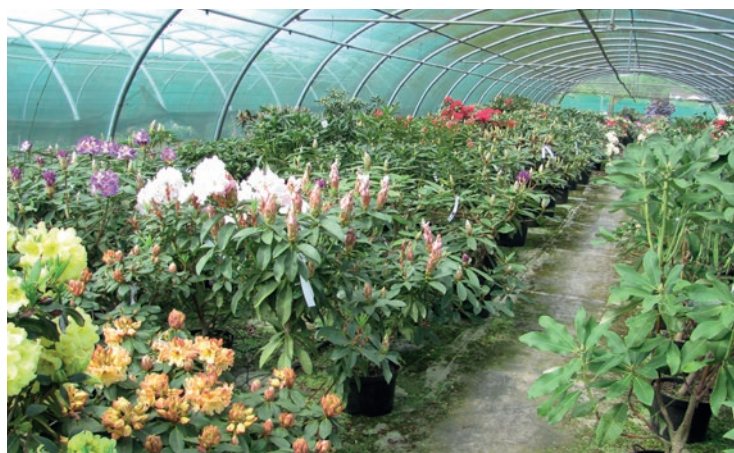
View inside a polytunnel at Koirin Azaleas.

There was a large stock of rhododendrons in the poly tunnels, including Viscy, Polar Bear, and Jean Marie de Montague ranging in size up to 160 litres.