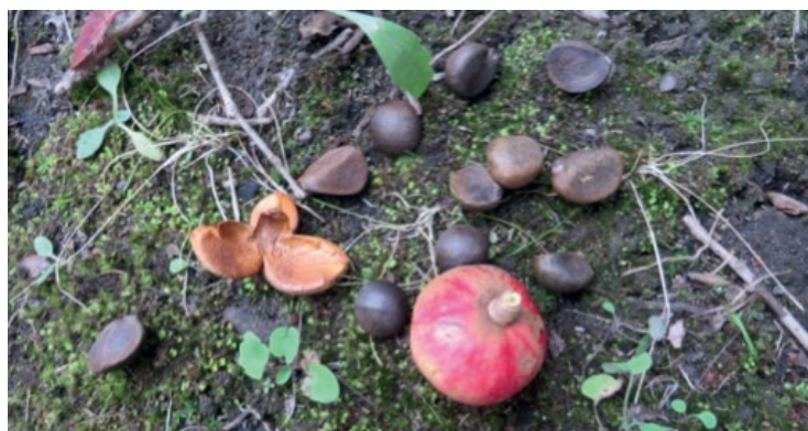
Camellia fruit with seeds on the forest floor

From January through February into March their red flowers can only be appreciated from above or after falling to the forest floor below, and their seeds harvested by scrabbling around in the leaf litter. Traditionally this was how the oil producers always gathered their seeds. Now that camellia oil is more appreciated and sales are buoyant, steps are taken to make harvesting the crop more reliable.