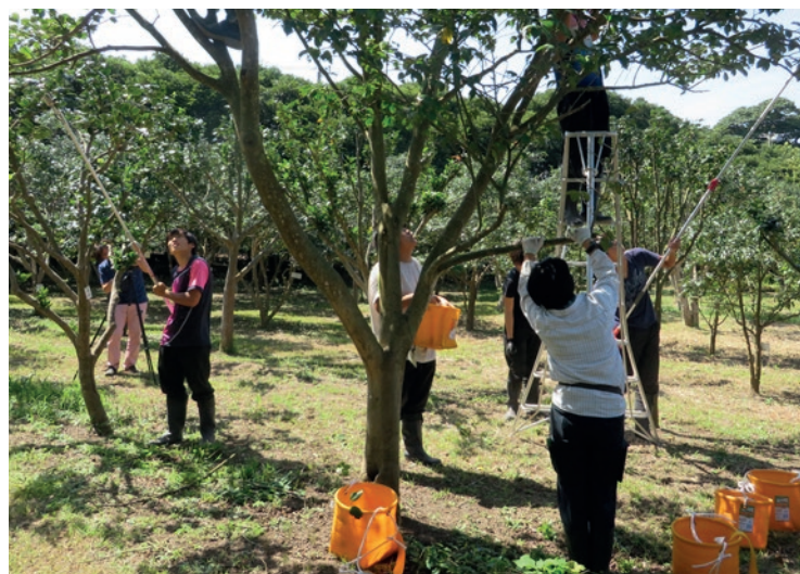
Pupils at Oshima High School harvesting Camellia japonica fruit. See p.5

28th April 2018 AGM at Westonbirt, We are hoping to create a great programme for you!