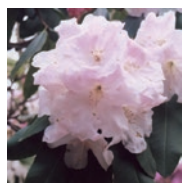
Loderi Pink Diamond