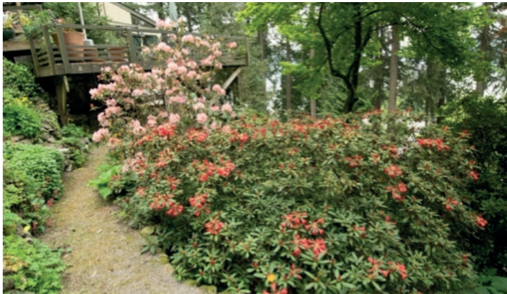
A path near the house.

It was a time too for testing the suitability of the site for supposedly 'difficult' plants for this area. Among these was the Chilean Lantern Tree, Crinodendron hookerianum . It was planted on a very steep slope for good drainage with overhead protection from a 100ft hemlock. Irrigation provides the water it needs during our dry summers. During the forty years it has been in the garden it has frozen to the ground three times. In every case it has sprung back the following year. Our C. patagua is much the same but not as handsome a plant.