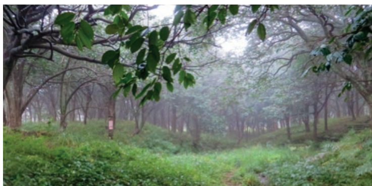
Oshima camellia forest

It has been estimated that the ancestors of Oshima’s current forest of approximately 3 million wild Camellia japonica (Tsubaki) trees date back about 5000 years. Evidence for this is a fossilised camellia leaf in the Information Centre and museum at Oshima Park.