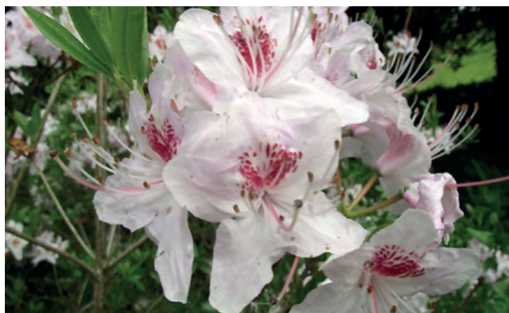
Rhododendron yunnanense KW 4974

Rhododendron yunnanense , in all its forms, is a charming plant and as reliable as any in the wealth and beauty of its flowers. It occurs in every shade between rose-pink and white, while the spotting on its petals can be green, brown, orange or red.