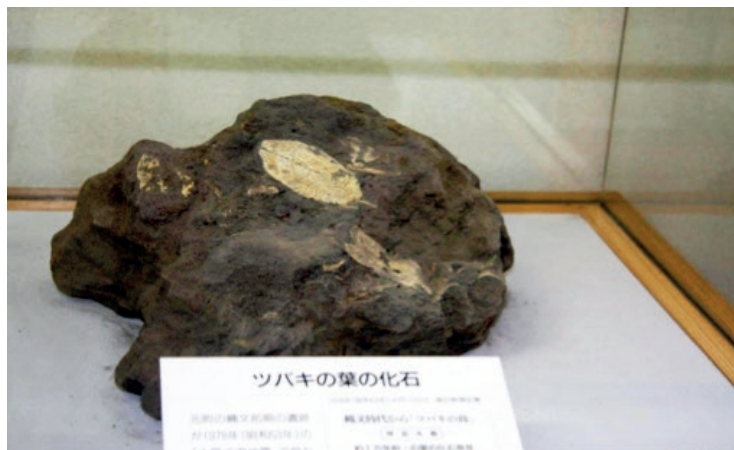
Camellia leaves in lava, Oshima Park Museum

Much of the forest today is protected and has camellia trees towering overhead, many drawn tall by overcrowding, with a continuous canopy high above.