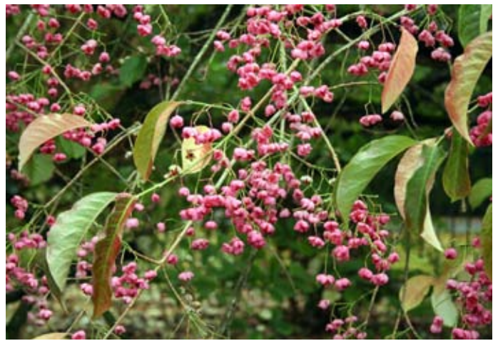
Pretty pink Euonymus