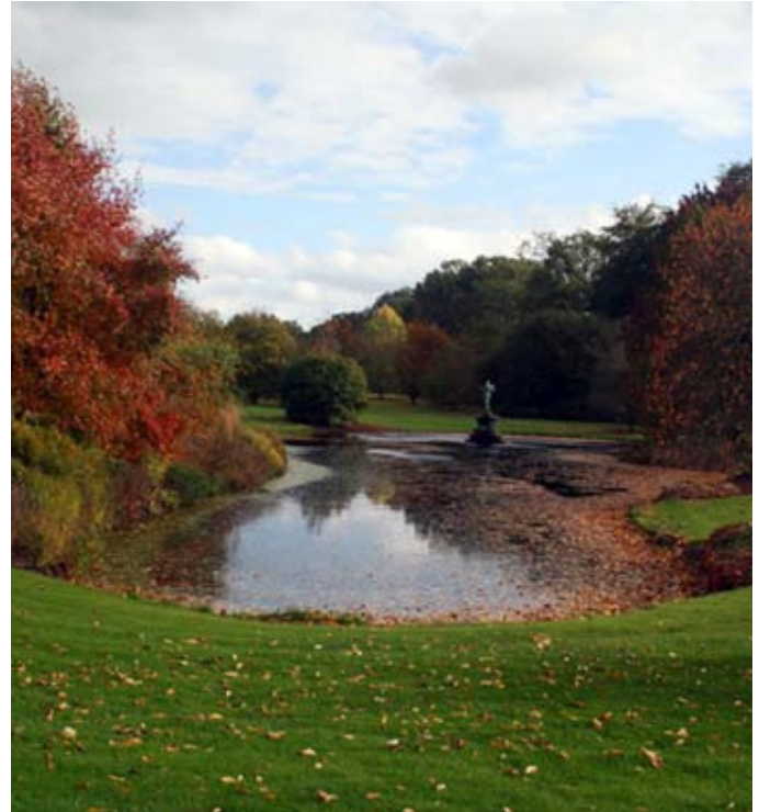
Autumn colour at Wespelaar, Belgium (Just before the storm on the 28th October) See Tour Report on page two.

The Partnership agreement has been under development for the last few months and we remain close to getting to a draft that is suitable for consideration by the committee and membership.