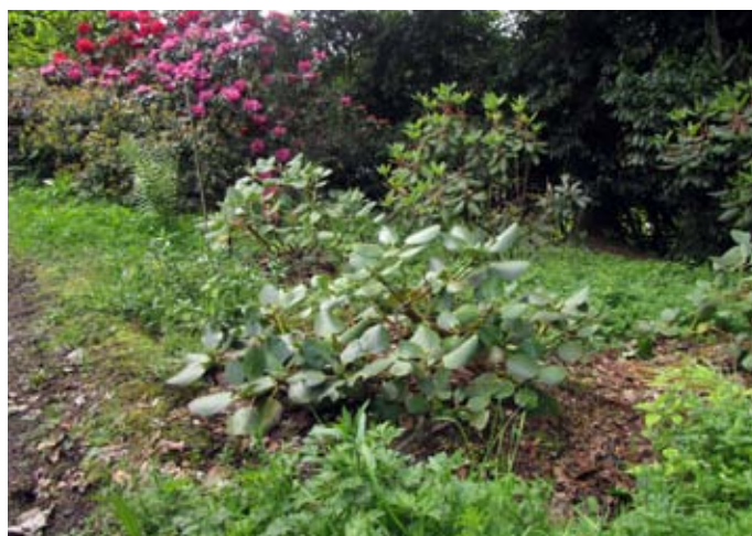
R. yuefengense seedlings at Glendoick

Both are available from Glendoick Gardens www.glendoick.com