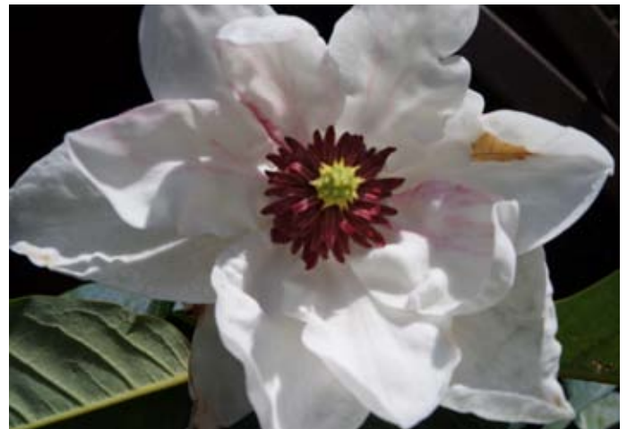
M. wilsonii 'Sandling Park'