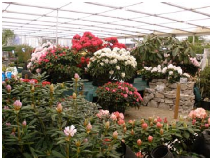
In progress . . .

In desperation we walked around the garden and the nursery looking for 'spare' plants that could be used. As is often the case, we found some plants that hadn't made the grade in December had now turned into Cinderella and looked wonderful, while those we had spent hours trying to time to perfection had failed to shine!