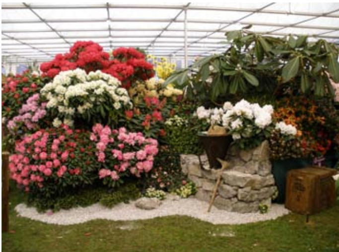
In full flower at the Show

Arriving early on Tuesday morning we were delighted to see our third consecutive Gold Medal. It's an emotional time when all exhibitors visit their neighbours to see what medal was awarded and offer one another congratulations or commiserations for all their long hours of hard work building the exhibit. But of course it doesn't stop there; the 14 hour days continue all Show week, aided by a band of loyal volunteers to help man the exhibit with our nursery staff. It's 'members only' for the first 2 days, when the keenest gardeners visit to see the freshest blooms and it's not quite so crowded. This year we went 'high-tech' with our own wifi hotspot, and 2 ipads taking orders direct via our website. Although slightly slower than writing an order on a form, visitors were able to experience our website, and everything was done in one transaction. It also meant that staff on the nursery were able to pack and despatch the orders straight away. Throughout the week we felt we were one of the most colourful and photographed exhibits in the Pavilions, particularly with Japanese and Chinese visitors! As well as selling, we answered many people's enquiries about Rhododendrons; hot topics included growing them on 'the wrong soil' and what to do with overgrown plants and bud-blast. We had several people ask whether Rhododendrons would take salt!