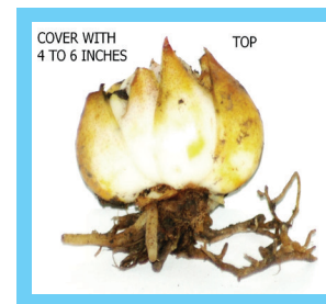
Lilium Shipped As Shown