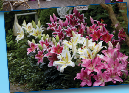
Romantics Oriental Lily (Lilium hybrids)