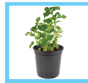
Shipped As Shown