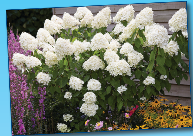
Mega Mindy® Hydrangea (Hydrangea paniculata hybrid)