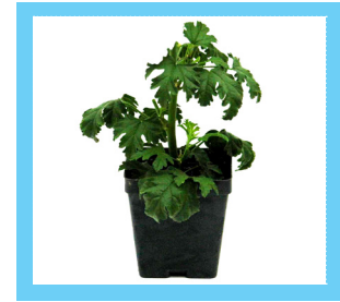
Malvia Shipped As Shown