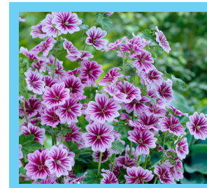
Braveheart in 2nd season