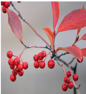
Chokeberry – Aronia arbutifolia ‘Brilliant’ fall color and fruit.

https://www.extension.purdue.edu/extmedia/ID/ID-464-W.pdf