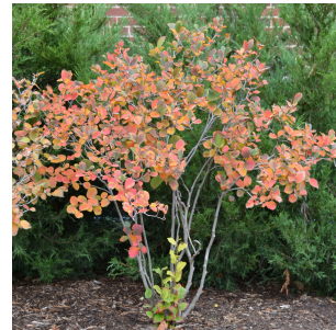
Fothergilla gardenii ‘Jane Platt’ fall color.