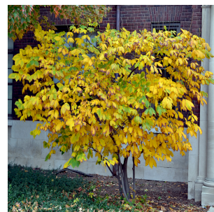
Bottlebrush Buckeye – Aesculus parviflora fall color.