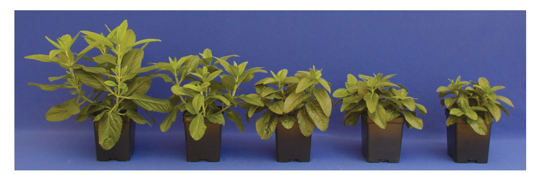
Figure 7. Veronica 'lcicle' treated with drenches of ancymidol, left to right: untreated, 2-, 4-, 6-, and 8-ppm drenches of ancymidol applied as 2 fluid ounces per quart pot. Higher rates caused excessive growth reductions and bronzing of the leaves. Photo was taken at six weeks after treatment.

4-ppm ancymidol (10 fluid ounces per trade gallon pot (appendix; figure 7).