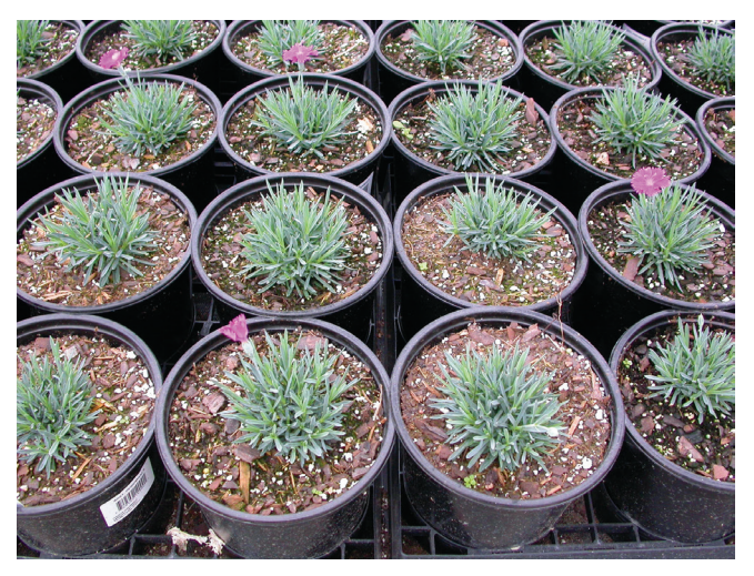
Figure 10. Young dianthus plants treated with ethephon to enhance branching and plant quality.

Ethephon should be applied to actively growing plants prior to flower development (figure 10). If flowers are present at the time of application, they are likely to abort. Ethephon may delay flowering by about one to two weeks, particularly if applied close to the time of flower initiation. Ethephon should not be applied to plants that are heat- or drought-stressed.