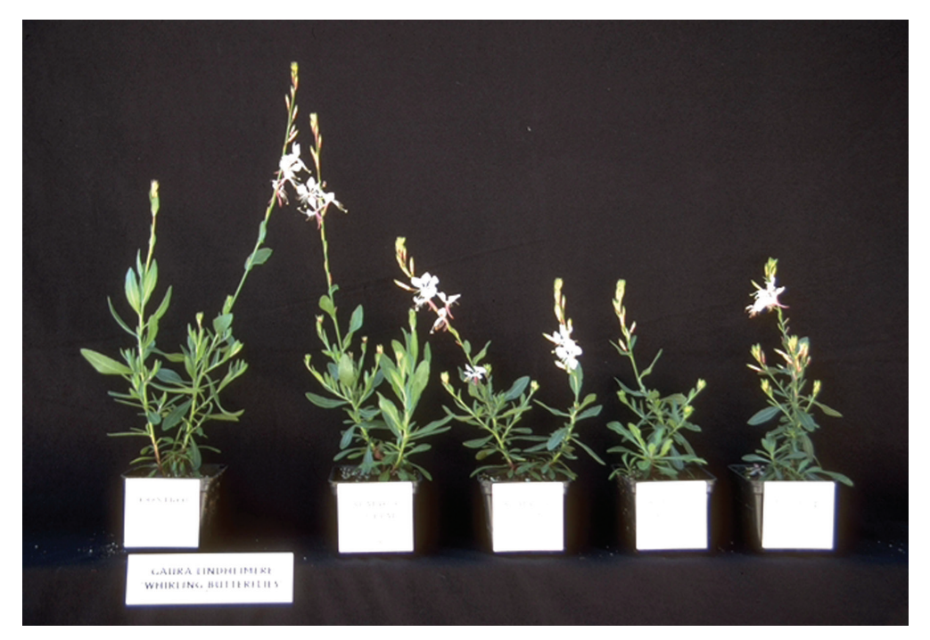
Figure 9. Elongation of flower inflorescence may be more affected by plant growth regulators than elongation of stem tissue is, as seen with white gaura ( Gaura lindheimeri 'Siskiyou Pink') treated with increasing rates of uniconazole, left to right: 0, 15, 30, 45, and 60 ppm. Photo was taken at five weeks after treatment.

NOTE: Ancymidol, flurprimidol, paclobutrazol, and uniconazole are persistent on plastic surfaces and in soil. Do not reuse flats, pots, or soil from treated plants — especially for plug production of sensitive crops.