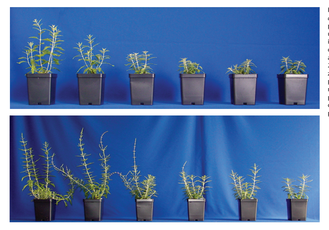
Figure 5. Russian sage (Perovskia atriplicifolia) treated with paclobutrazol liner soaks (10 minutes in solution) at the time of planting. Top photo shows good baseline control of plant height at five weeks after treatment with, left to right: 0-, 2-, 4-, 6-, 8-, and 10-ppm paclobutrazol. Bottom photo shows the same plants at eight weeks after treatment; plants treated with 2-ppm paclobutrazol were comparable to controls, while those treated with 6 ppm were still well-controlled.