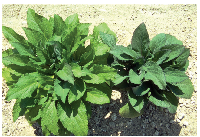
Figure 2. Digitalis 'Foxy' untreated (left) and treated with 15 ppm uniconazole (right). Plant growth regulators "green up" plants by concentrating chlorophyll into smaller leaf cells, improving plant color and appearance.

This is where the art of plant growth regulation is most important. You must learn how your crop grows and when to intervene to obtain the desired results. Remember to note details of crop development in your records of PGR treatments. For example, due to weather conditions, next year you may need to treat at seven days after transplanting instead of at 10 days after transplanting, which you used this year. You must gauge when rapid elongation will likely occur and treat to counter it.