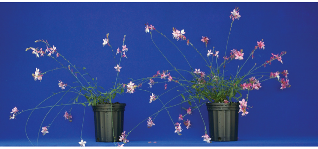
Figure 11. Benzyladenine (Configure) improved branching and flowering of white gaura ( Gaura lindheimeri 'Siskiyou Pink'): untreated (left) and 600 ppm applied at two weeks after transplant (right). Photo taken at four weeks after final treatment.

Initial work on herbaceous perennials focused on Hosta and Echinacea , both of which are very responsive to BA. In our trials, multiple cultivars of Echinacea have developed two to four times the number of basal branches versus untreated plants when treated about two weeks after potting. Other researchers have reported similar results with a number of other Echinacea cultivars. Further screening trials with other herbaceous perennials have identified a large number of crops that showed increased basal or lateral branching in response to a 600-ppm BA spray (see appendix) (figure 11).