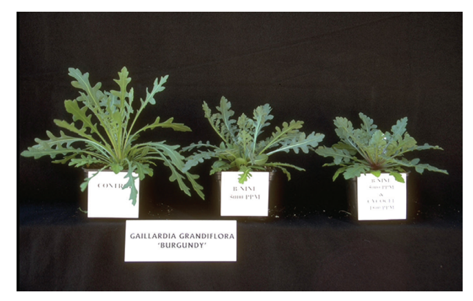
Figure 6. Blanket flower ( Gaillardia x grandiflora 'Burgundy') was responsive to daminozide. Left to right: untreated control, two applications (at a two-week interval) of 5,000-ppm daminozide, and one application of a tank mix of 5,000-ppm daminozide and 1,500-ppm chlormequat chloride. Photo was taken at three weeks after treatment. Multiple applications of the tank mix were required for long-term control.

Ancymidol (Abide or A-Rest; REI = 12 hours) is a more active compound than daminozide or chlormequat chloride. Ancymidol is active as a spray or a drench, so application volume affects plant response. In addition, ancymidol is labeled for chemigation, i.e., distribution through the irrigation system via flood, sprinkler, or drip systems. Follow all label directions. Abide is not labeled for spray applications in shadehouses or nurseries, but drench applications can be made indoors and outdoors. A-Rest is labeled for use as a spray or drench on containerized plants in greenhouses, nurseries, shadehouses, and interiorscapes.