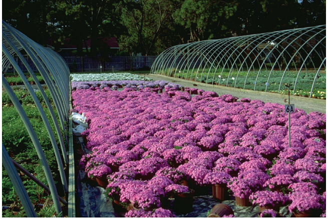
Figure 1. Greenhouse and nursery production of herbaceous perennials encompass hundreds of different crops. Growth management needs vary widely with species and cultivar.

Availability of chemical plant growth regulators for perennials is not a problem. All of the primary floriculture growth retardants are labeled for use on perennials. The issues are (1) lack of knowledge about rates, and (2) the wide disparity of plant responses to these PGRs. Even after years of research, many of the herbaceous perennials in the market have never been evaluated for their response to any of these chemicals (figure 1).