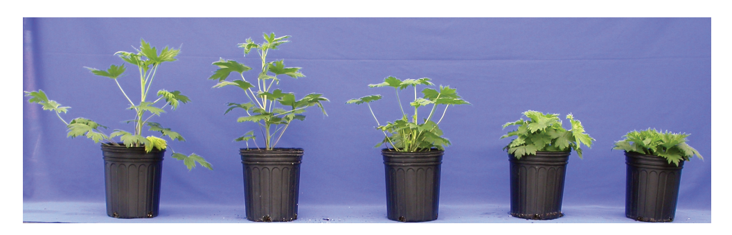
Figure 8. Larkspur ( Delphinium ela tum 'Blue Bird') at four weeks after treatment with paclobutrazol, left to right: untreated control, treated with paclobutrazol as a foliar spray at 30 ppm and at 60 ppm, and treated with paclobutrazol as a drench at 1 ppm and at 2 ppm. Overdose symptoms were evident on the plants treated with the 2-ppm drench. The triazole-type PGRs are actively taken up by the roots and are very effective in growth regulation.

Avoid late applications of the triazoles. They should be applied prior to flower initiation when possible.