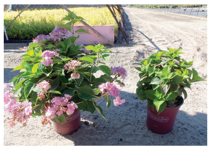
Figure 4. Uniformity of the spray application is critical to the quality of the crop. Both of these 'Forever and Ever' hydrangeas were treated with 10 ppm of uniconazole during the same spray application.

Spray droplet size also affects response, with smaller droplet sizes providing better coverage — but only up to a point. Mist- or fog-type applicators do NOT provide adequate volume for coverage of plant stems and the medium and, therefore, have not been effective when used with compounds like paclobutrazol and uniconazole. PGR applicators should be trained to uniformly apply a given amount of clear water in the greenhouse before they make PGR applications. Uniformity of the application is critical to the uniformity of the crop response (figure 4).