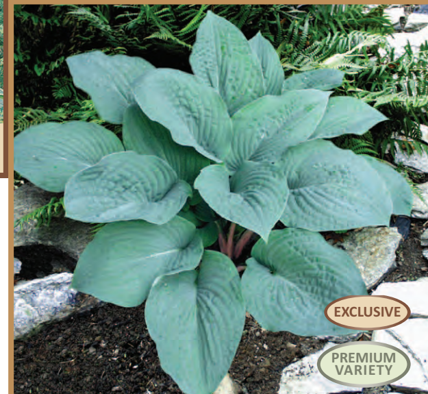
Hosta 'Blueberry Muffin'