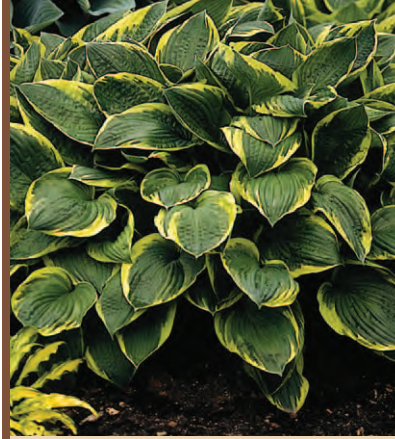
Hosta 'Fortunei Aureomarginata'