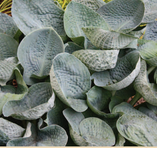
Hosta 'Big Daddy'