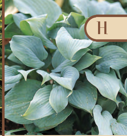
Hosta 'Fragrant Blue'