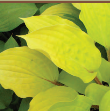
Hosta 'Fire Island'