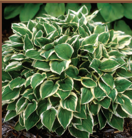
Hosta 'Diamond Tiara'