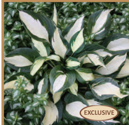
Hosta 'Dancing Queen'