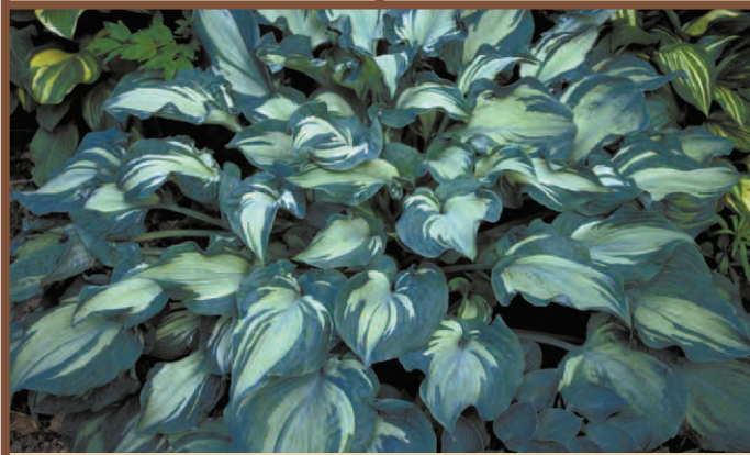
Hosta 'Guardian Angel'