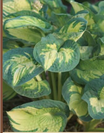
Hosta 'Great Expectations'