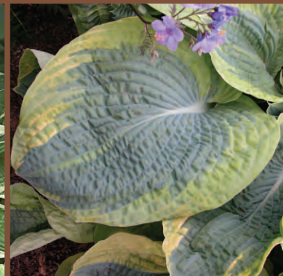
Hosta 'Frances Williams'