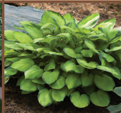
Hosta 'Gold Standard'