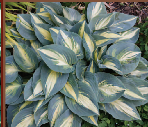
Hosta 'High Society' PP17313