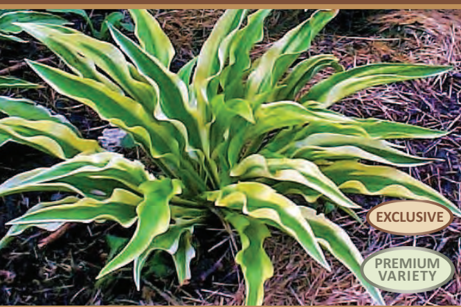
Hosta 'Alakazaam' PP22342