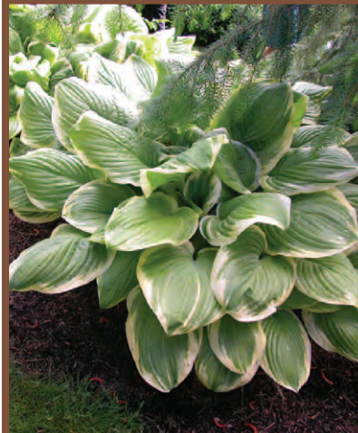
Hosta 'Fragrant Bouquet'