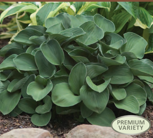
Hosta 'Blue Mouse Ears'