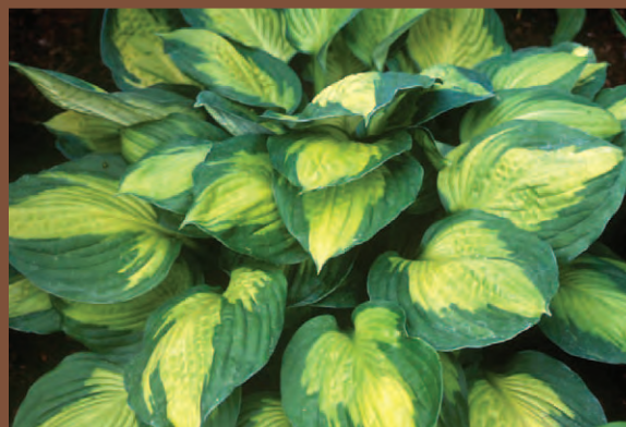
Hosta 'Captain Kirk'

Hosta 'Crowned Imperial' WGI Introduction