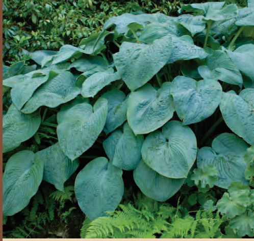
Hosta 'Blue Angel'