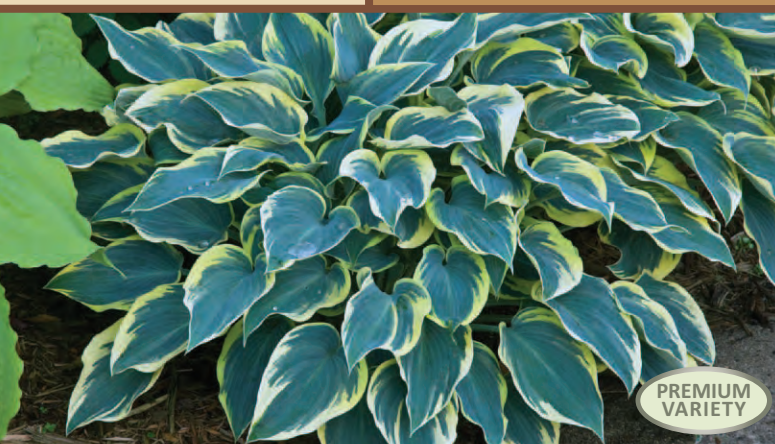
Hosta 'Fireworks' PP16062