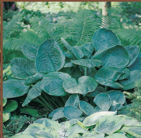
Hosta 'Blue Umbrellas'