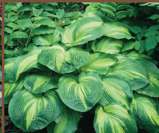
Hosta 'Hollywood Lights' PP17296