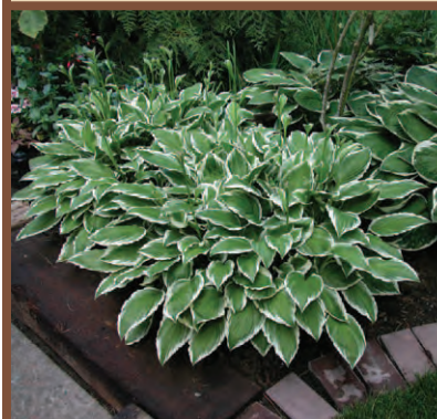
Hosta 'Ginko Craig'