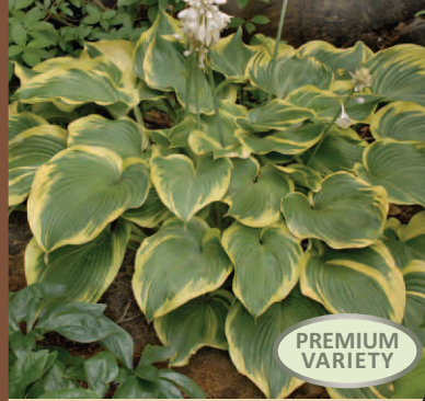
Hosta 'Dream Weaver'