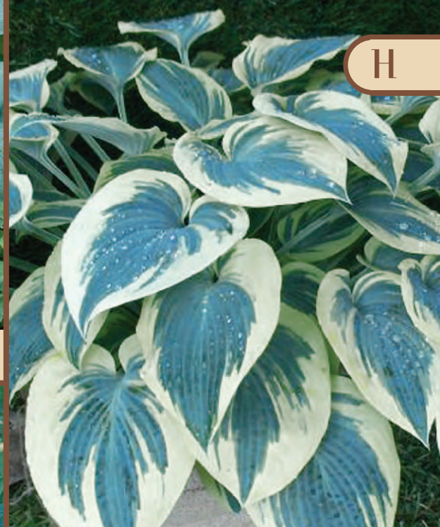
Hosta 'Blue Ivory' PP19623