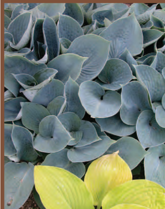
Hosta 'Hadspen Blue'