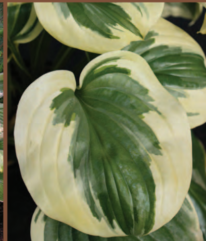
Hosta 'Fragrant Queen' PP19508