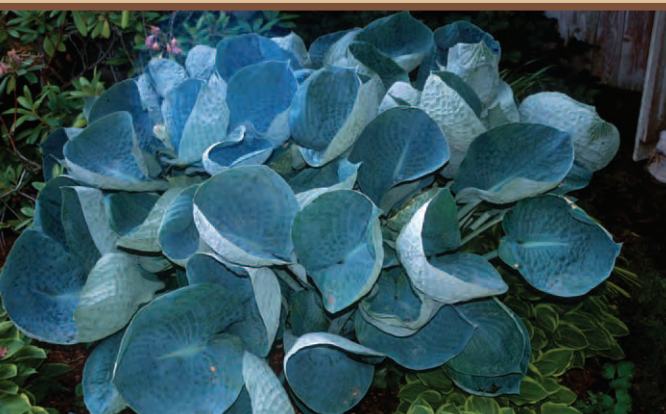
Hosta 'Abiqua Drinking Gourd'

With the launch of the Proven Winners® Perennials program, we have discontinued our Designer Hosta™ Collection. Former Designers and others that have been selected by hosta experts as the top cultivars are now denoted as premium varieties using the symbol shown above. The handy color and size chart on p. 126 also shows all of our premium hosta varieties.