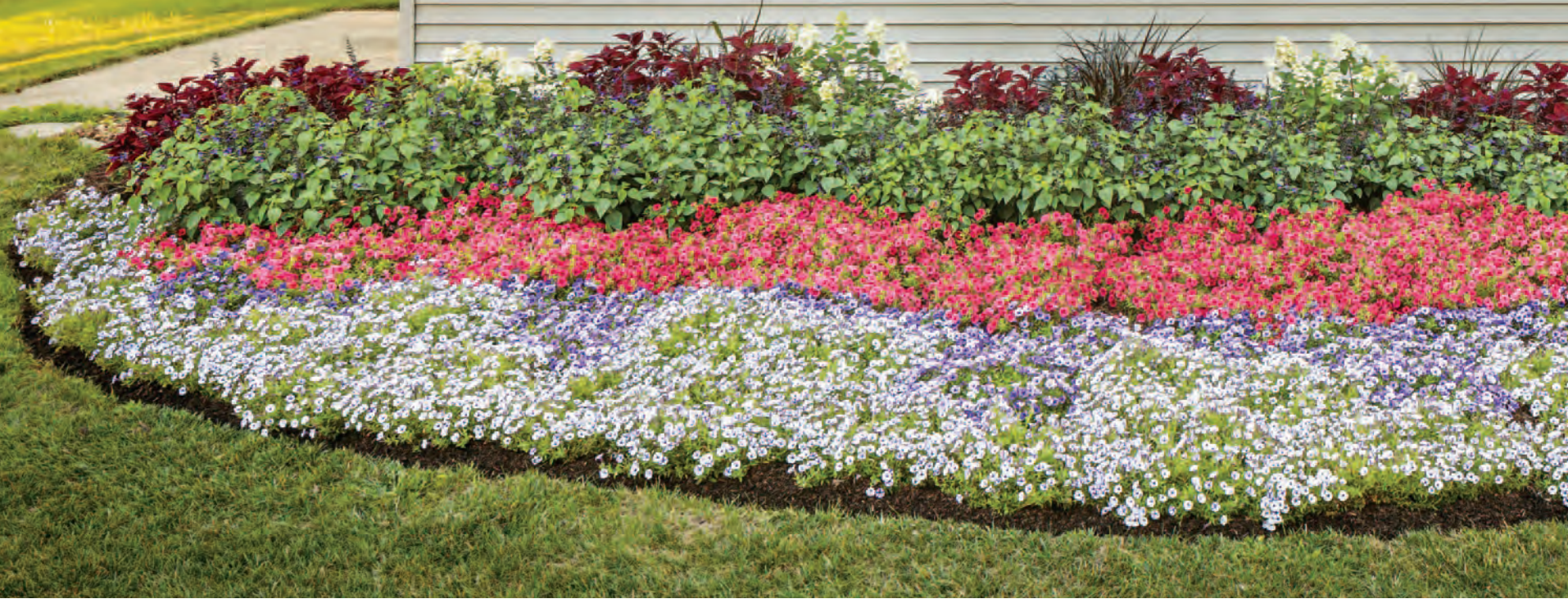
In landscape above: SUPERTUNIA MINI VISTA® Violet Star Petunia, SUPERTUNIA MINI VISTA® Indigo Petunia, SUPERTUNIA MINI VISTA® Scarlet Petunia, COLORBLAZE® REDICULOUS® Plectranthus (Coleus) ROCKIN'® Deep Purple Salvia, GRACEFUL GRASSES® VERTIGO® Pennisetum (Purple Fountain Grass) and FIRE LIGHT® Hydrangea paniculata (Panicle Hydrangea)