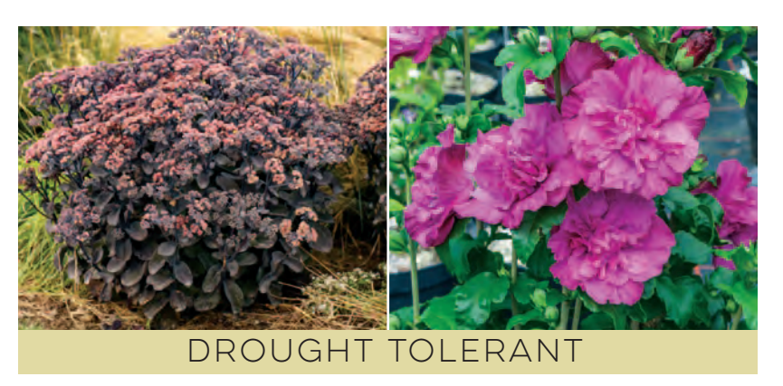
ROCK 'N GROW® 'Back in Black' Sedum (Stonecrop) – Zones: 3-9 Magenta CHIFFON® Hibiscus (Rose of Sharon) – Zones: 5-9 Best in full sun, sandy or loam soils, light to moderate moisture

Best in full sun, sandy or loam soils, light to moderate moisture