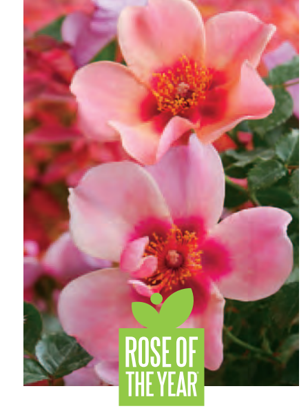
RINGO ALL-STAR™ Rosa (Rose)

Learn how to plant, prune and grow our shrub National Plants of the Year at pwwin.rs/npov.