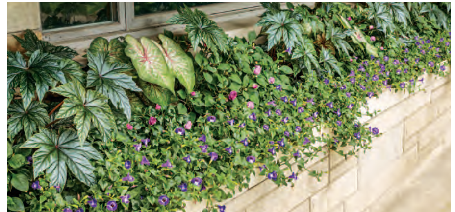
Full shade planter under roof line above: HEART TO HEART® 'Xplosion' Caladium, ROCKAPULCO® Wisteria Impatiens, ROCKAPULCO® Purple Impatiens, SUMMER WAVE® Large Violet Torenia (Wishbone Flower) and PEGASUS® Begonia

Full sun container above at right: Goldilocks Lysimachia (Creeping Jenny), GRACEFUL GRASSES® Purple Fountain Grass Pennisetum, SUPERTUNIA VISTA® Fuchsia Petunia, ROCKIN'® Deep Purple Salvia and METEOR SHOWER® Verbena