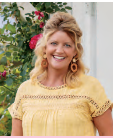
"The garden feels like a new art project to me every spring and all the flowers are like a big box of crayons."