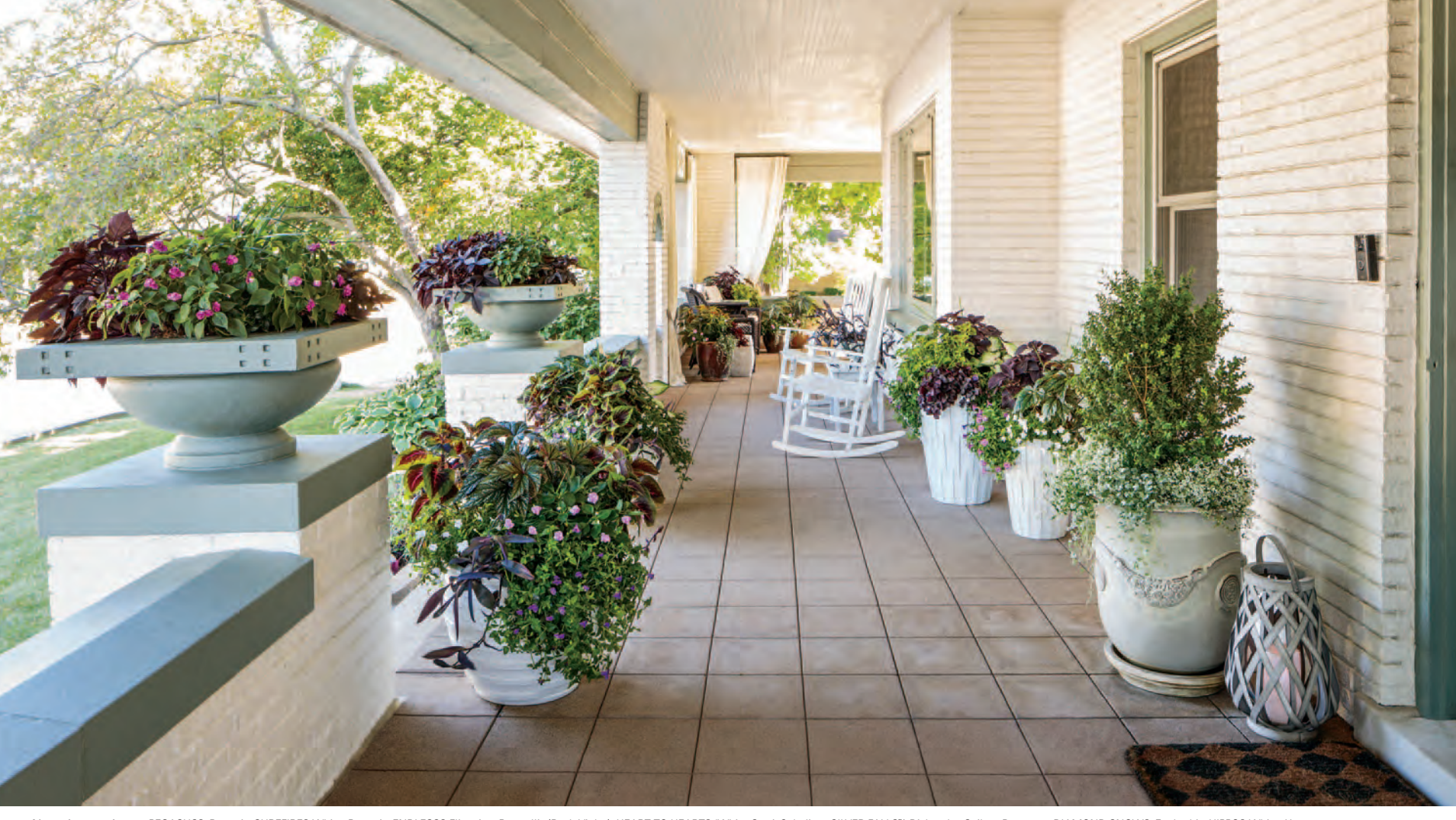
Above in containers: PEGASUS® Begonia, SUREFIRE® White Begonia, ENDLESS® Fliration Browallia (Bush Violet), HEART TO HEART TO HEART TO HEART TO HEART TO HEART S' White Star' Caladium, SILVER FALLS™ Dichondra, Spikes Dracaena, DIAMOND SNOW® Euphorbia, HIPPO® White Hypoestes (Polka Dot Plant), ROCKAPULCO® Purple Impatiens (Double Impatiens), ROCKAPULCO® Wisteria Impatiens), INFINITY® Light Purple New Guinea Impatiens, Sweet Caroline RAVEN™ Ipomoea (Sweet Potato Vine), CHARMED® Wine Oxalis (Shamrock), COLORBLAZE® NEWLY NOIR™ Plectranthus (Coleus), COLORBLAZE® Strawberry Drop Plectranthus (Coleus), COLORBLAZE® TORCHLIGHT® Plectranthus (Coleus), SUMMER WAVE® Large Amethyst Torenia (Wishbone Flower), SUMMER WAVE® Large Blue Torenia (Wishbone Flower), and 'Purple Queen' Tradescantia (Purple Spiderwort)