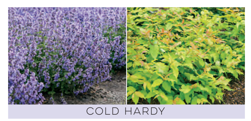
'Cat's Pajamas' Nepeta (Catmint) — Zones: 3-8 KODIAK FRESH® Diervilla — Zones: 3-8

Best in full or part shade, sandy, loam or clay soils, moderate moisture