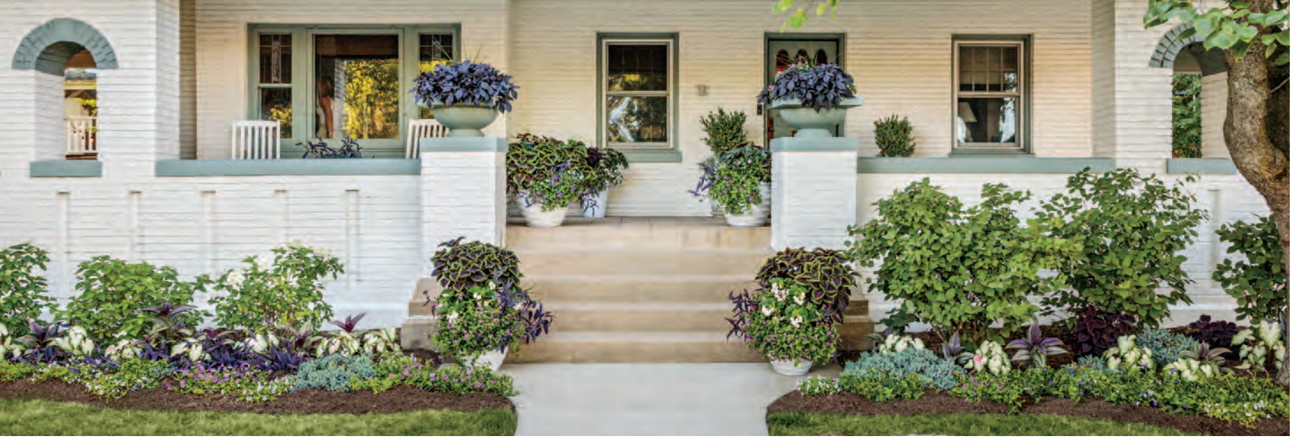
Above in the landscape: HEART TO HEART® 'White Star' Caladium, FIRE LIGHT® Hydrangea paniculata (Panicle Hydrangea), COLORBLAZE® NEWLY NOIR™ Plectranthus (Coleus), Persian Shield Strobilanthes, CATALINA® GRAPE-O-LICIOUS™ Torenia (Wishbone Flower), SUMMER WAVE® Large Amethyst Torenia (Wishbone Flower), SUMMER WAVE® Large Blue Torenia (Wishbone Flower) and 'Purple Queen' Tradescantia (Purple Spiderwort)