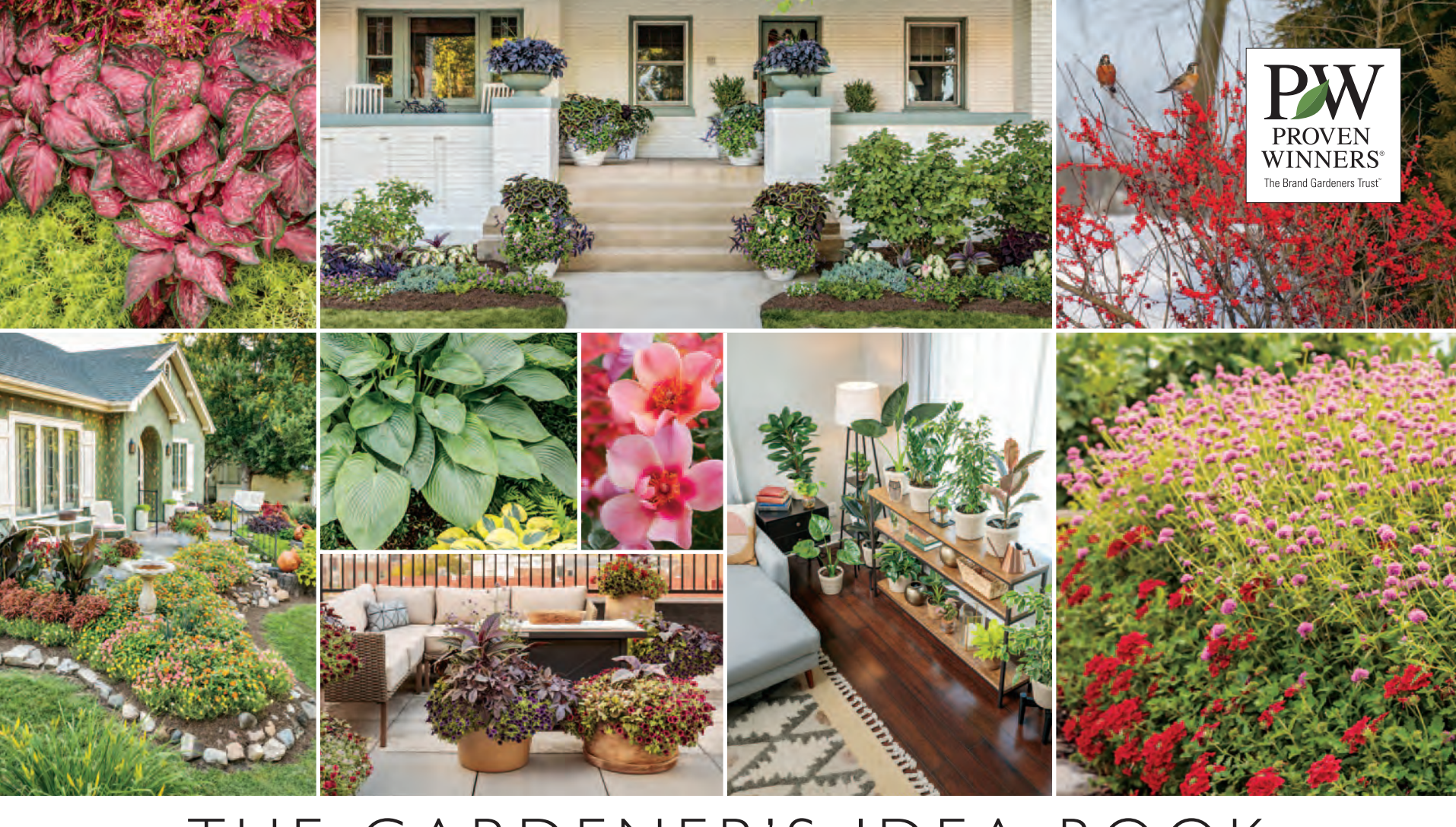
THE GARDENER'S IDEA BOOK