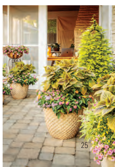
Opposite and above: SUPERBELLS® PRISM™ Pink Lemonade Calibrachoa, SUPERBELLS® Double Yellow Calibrachoa, Yellow Ripple Hedera (Ivy), Sweet Caroline MEDUSA™ Green Ipomoea (Sweet Potato Vine), Sweet Caroline UPSIDE™ Key Lime Ipomoea (Sweet Potato Vine), LUSCIOUS® BERRY BLEND™ Lantana, WAIKIKI SUNSET™ Lysimachia, COLORBLAZE® GOLDEN DREAMS™ Plectranthus (Coleus) and CAKE POPS® Pink Verbena (Tuberous Verbena)