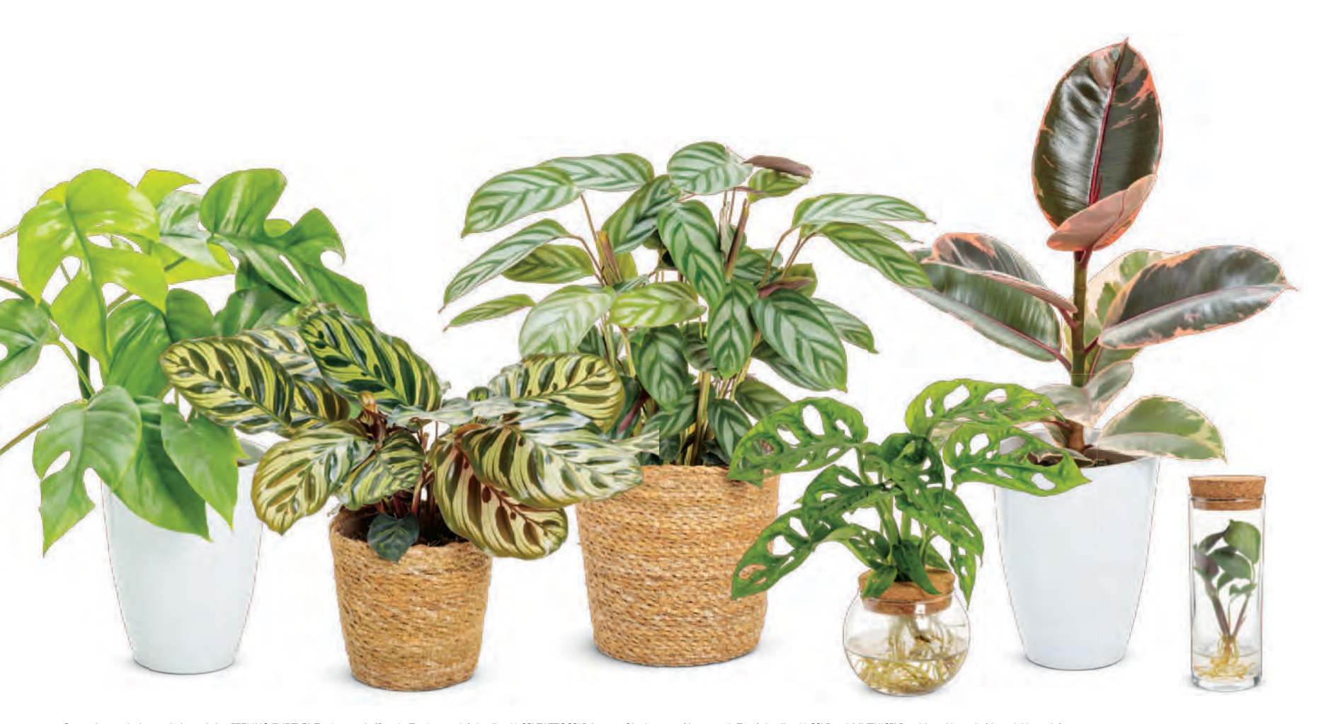
Opposite and above, left to right: FEELING FLIRTY<sup>™</sup> Tradescantia (Purple Tradescantia), leafjoy H_2O^{\mathbb{T}} Princess Clusia rosea (Autograph Tree), leafjoy H_2O^{\mathbb{T}} Bowl MYTHIC<sup>™</sup> Bambino Alocasia (Jewel Alocasia), MONSTER MASH<sup>™</sup> Swiss Cheese Vine Monstera deliciosa , COLOR FULL<sup>™</sup> Peacock Plant Calathea makoyana , SWEET DREAMS<sup>™</sup> Exotica Ctenanthe setosa (Never Never Plant), leafjoy H_2O^{\mathbb{T}} Bowl MONSTER MASH<sup>™</sup> Swiss Cheese Vine Monstera adansonii , CHROMA<sup>™</sup> Belize Ficus (Rubber Plant) and leafjoy H_2O^{\mathbb{T}} SWEET DREAMS<sup>™</sup> Grey Star Ctenanthe setosa (Never Never Plant)