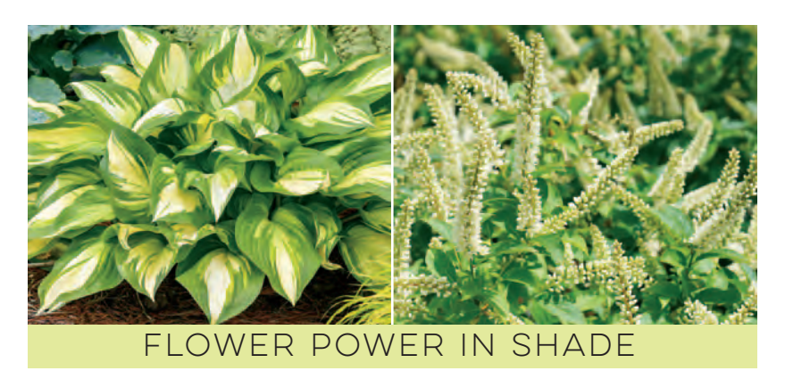
SHADOWLAND® 'Miss America' Hosta – Zones: 3-9 FIZZY MIZZY® Itea (Sweetspire) – Zones: 5-9

Best in full or part shade, any well-drained soil, moderate moisture