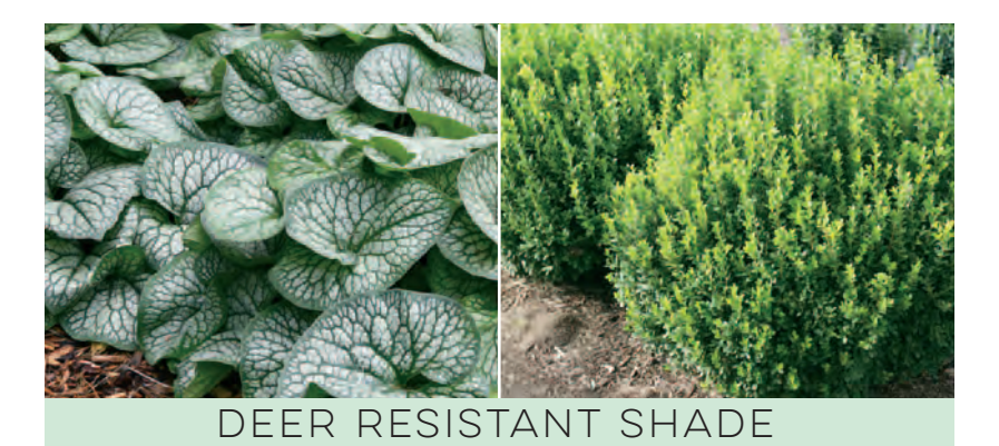
'Jack of Diamonds' Brunnera (Heartleaf Brunnera) — Zones: 3-8 SPRINTER® Buxus (Boxwood) — Zones: 5-9

Best in full or part shade, any well-drained soil, moderate moisture