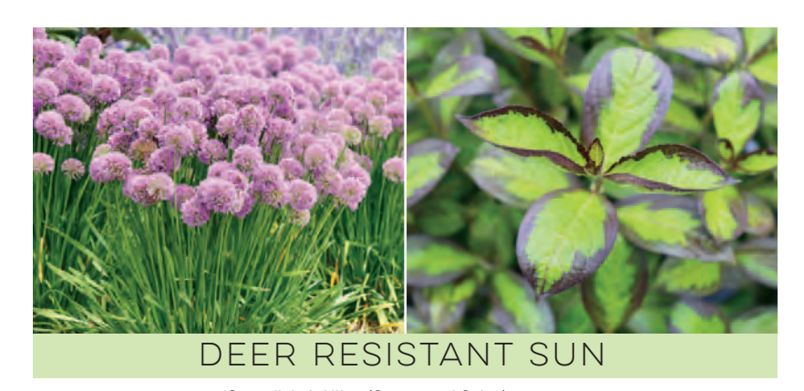
'Serendipity' Allium (Ornamental Onion) – Zones: 4-8 VINHO VERDE™ Weigela – Zones: 5-8

Best in full sun, sandy or loam soils (Echinacea handles clay), light to moderate moisture