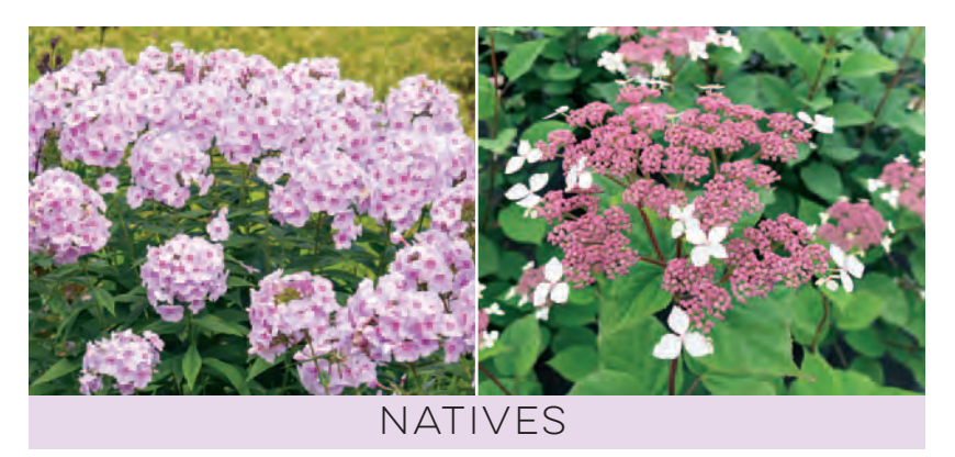
LUMINARY™ 'Opalescence' Phlox (Tall Garden Phlox) – Zones: 3-8 INVINCIBELLE LACE® Hydrangea arborescens subsp. radiata (Smooth Hydrangea) – Zones: 3-8 Best in full sun, tolerates light shade, sandy to clay soils, moderate moisture

Find more plant pairing ideas at pwwin.rs/plant-pairings.