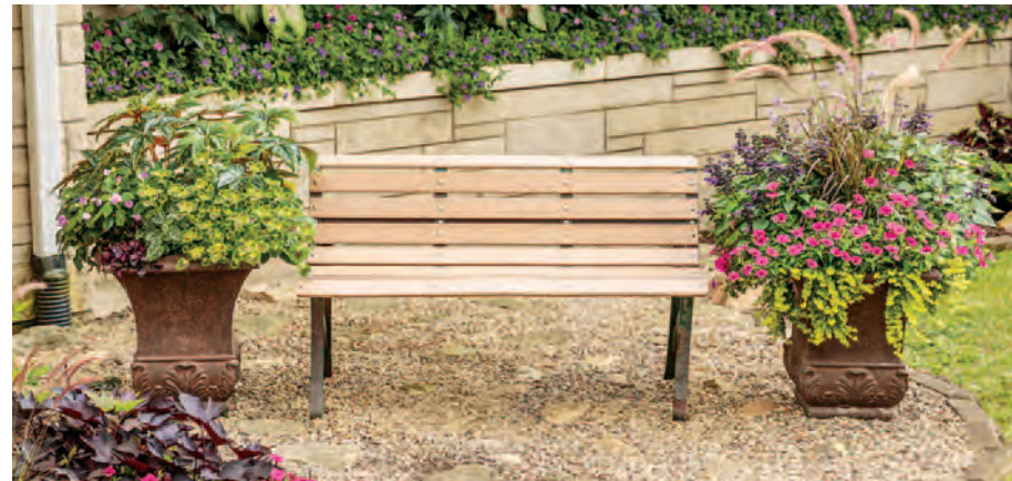
Full shade container, above at left: PEGASUS® Begonia, ROCKAPULCO® Wisteria Impatiens, CHARMED® Wine Oxalis (Shamrock) and COLORBLAZE® Strawberry Drop Plectranthus (Coleus)

Full sun container above at right: Goldilocks Lysimachia (Creeping Jenny), GRACEFUL GRASSES® Purple Fountain Grass Pennisetum, SUPERTUNIA VISTA® Fuchsia Petunia, ROCKIN'® Deep Purple Salvia and METEOR SHOWER® Verbena