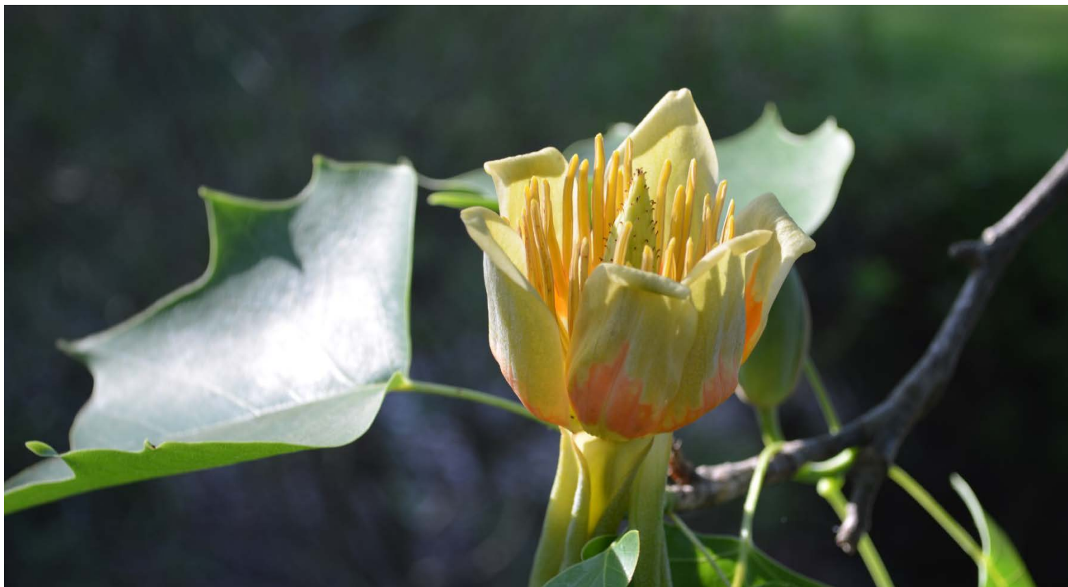
Liriodendron tulipifera – Tulip-tree (PHA acc. #58-003-01A)

Box 561, West Tisbury, MA 02575 508-693-9426 www.pollyhillarboretum.org