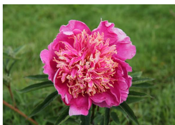
Paeonia 'Knight of the Thistle'