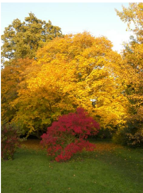
Acer cappadocicum

Now that summer is gone it is time to assess how the borders have worked this season and what to do ready for next. There are still a few things giving a bit of colour at this time including Salvia fulgens , S. curvifolia and S. 'Nachtvlinder' and Aconitum 'Bressingham Spire' amongst others. It is hoped to do a lot of dividing and replanting this winter as some of the clumps of geraniums and others are getting too big, and although they give a good show in early summer they then leave large gaps later in the year, so time now to reduce them. We will lift everything in the herbaceous borders on the lower terrace, double dig them adding plenty of well-rotted manure, and then replant as required (weather permitting of course). We have also taken a lot of cuttings from Penstemons, Diascias, Salvias and Osteospermums which have now rooted and been potted on and these will spend the winter in a tunnel ready to go out in the spring once the last frosts are past.