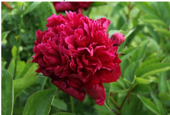
Paeonia 'Knighthood'