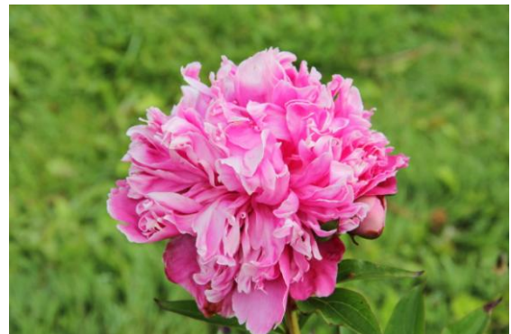
Paeonia 'Kelways Circe'