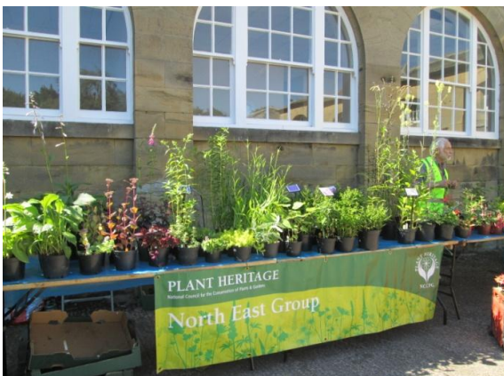
Our stall at the Plant Fair

With the agreement of Blagdon Estate, this year we held our Plant Fair as part of its Garden Open Day on Sunday 7 th July. Numbers were down a bit, but there was the usual interesting variety of doggy visitors. The weather was much better than last year, almost warm. The good number of specialist nurseries complemented the very varied and interesting range of plants on our stall (partly as a result of the unusual weather earlier in the year?). The visitors showed a serious interest in these, and we nearly sold out! We also gained some new members. The Blagdon grounds and gardens were open after we had stopped selling plants, and also food from our excellent Tea Room. A big thank you to all those who helped to make it a success.