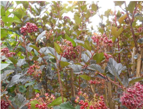
P. opulifolius 'Red Baron'

Our developing National Collection is progressing well. NE Group has identified 23 different Physocarpus grown by members, a mix of species already growing at Howick and cultivars. 13 cultivars are single plants and just seven are grown by more than one member. We need to continue propagation to ensure we have at least two of each cultivar before we can put in a full proposal to the PH Plant Conservation Committee.