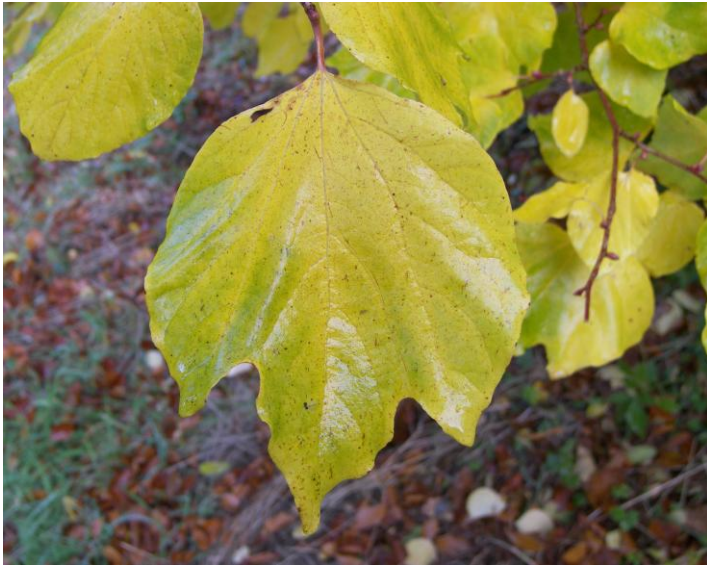
Lindera obtusiloba H&M 2042 NB 101

brilliant red as does Enkianthus deflexus which has lovely red-tinged bell shaped flowers in late spring followed by good autumn colour. Lindera obtusiloba leaves turn a lovely golden-yellow and if you have male and female plants you may get the spherical glossy red-brown berries as well. Decaisnea fargesii is another shrub to give good yellow autumn colour along with its blue bean-like fruits which lead to its delightful common name of dead man's fingers.