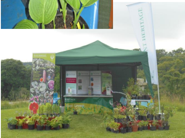
Saturday's stall at Belsay Hall.

The very first Belsay in Bloom took place on Saturday 29 th and Sunday 30 th June and PHNE was invited to have a stall to promote the charity and to sell some of our more unusual plants. Some of the committee agreed to organise and staff this event which resulted in significant sales and some interest in PHNE. Sadly on a sunny Sunday morning we found that our gazebo, display boards and materials had been scattered across Belsay's grounds as there was a violent storm overnight. We set up the tables and plants in a new location and had a pleasant and financially productive session. It was good to be involved with an English Heritage property but we'll have to wait and see if Belsay wishes to repeat the event next year.