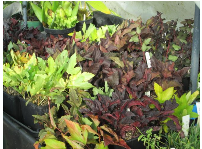
Softwood Physocarpus cuttings in the mist unit

These sessions are open to all members (who can hopefully bring stock for division and take it home again), and are very sociable as well as being a good learning opportunity - we always discover something new. If you are interested in joining a future session, please contact any committee member with your details.