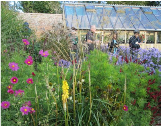
NCH Coordinators in Warden's garden.