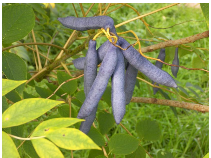
Decaisnea fargesii SICH 1756 AJW 165B

It has been a mixed year for autumn colour with some of the early leaves just shrivelling up in the dry weather, but the ever-reliable Cercidiphyllum japonicum continue to give a good show with their heart shaped leaves which turn a lovely yellow or orange accompanied by the sweet smell of candy floss as they change colour. These need to be planted in a sheltered spot this far north to get the best show from them. Yellows continue with Acer cappadocicum a large member of the maple family which is found from the Caucasus Mountains through the Himalayas and into south west China; some large specimens can be seen here at Howick. Reliable red autumn colour trees with us include Zelkova serrata and Sorbus commixta a Japanese rowan which is also covered in masses of bright red berries until we get the annual migration of birds such as redwings and fieldfares which seem to find the berries very attractive and tend to head for them first. Shrubs that give good autumn colour for us include the spindles, Euonymus alatus which turns a