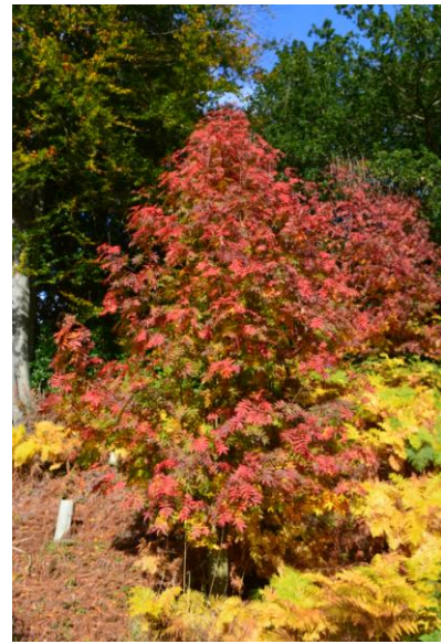
Sorbus commixta EHOK "NB 241

It has been a good year for fruit and many of the thorns, viburnums and cotoneasters are covered in berries which should make it a good autumn for all the visiting birds, who don't seem to mind if we are growing native plants or Chinese species - all seem to be eaten with equal vigour.