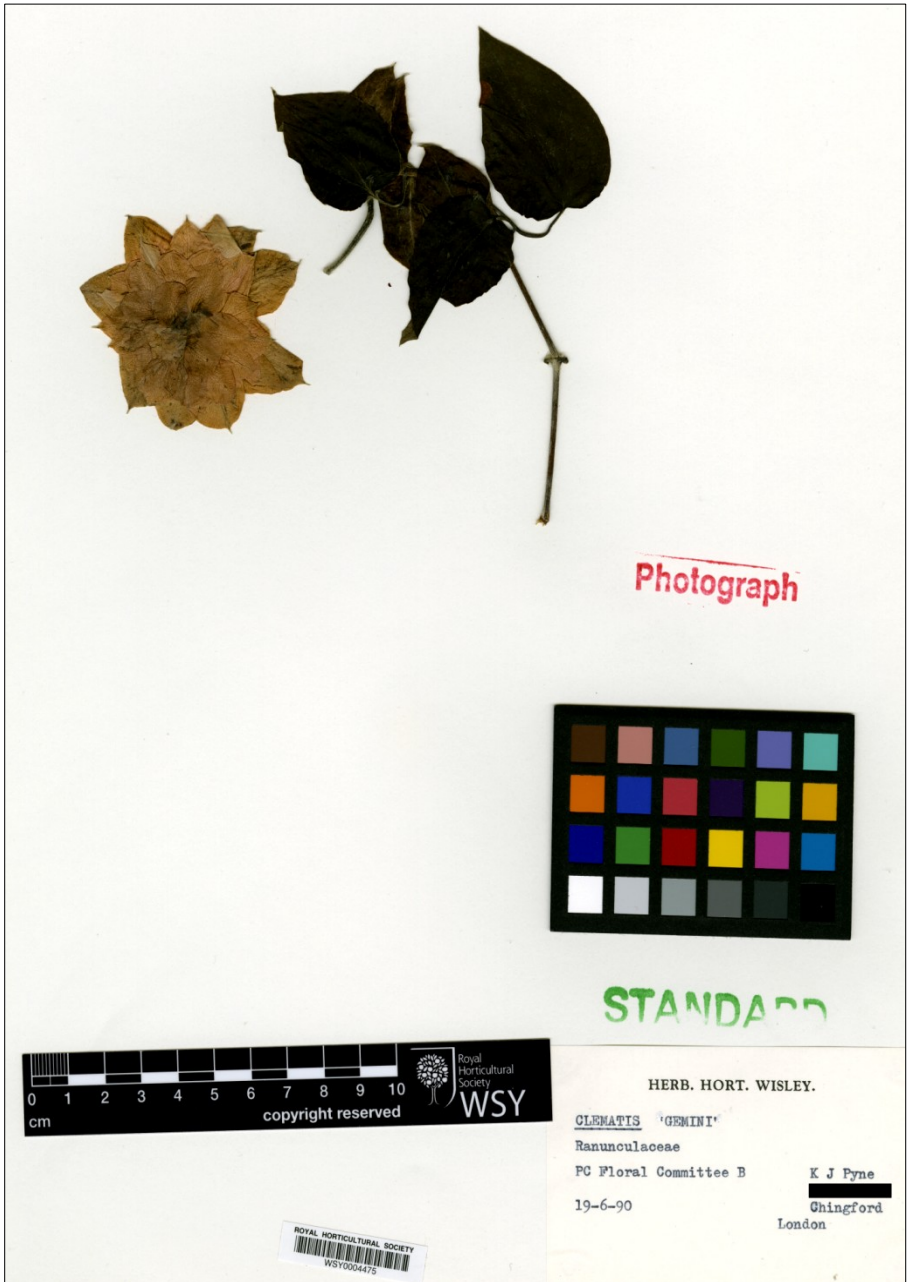
Wisley Herbarium Sheet C. 'Gemini'