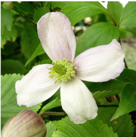
C. × vedrariensis 'Highdown'