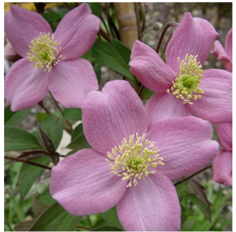
Clematis montana var. rubens 'Veitch'