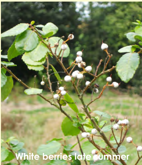
White berries late summer

Endemic to Chile. An evergreen shrub with shiny oval serrate leaves Ht. 2.5m x 2.5m. Dense spherical clusters of very fragrant yellow flowers appear over summer and autumn. Requires a sheltered site in full sun or light shade. Any well drained moist soil. A good border and wall shrub.