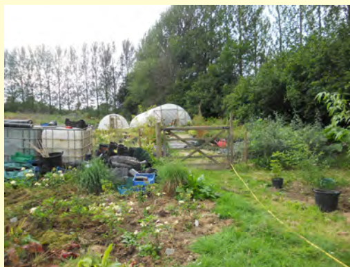
Paviour & Davies Plants