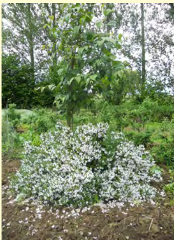
Prostanthera cuneata in flower

Telephone 07966 580812 or email info@paviouranddaviesplants.co.uk