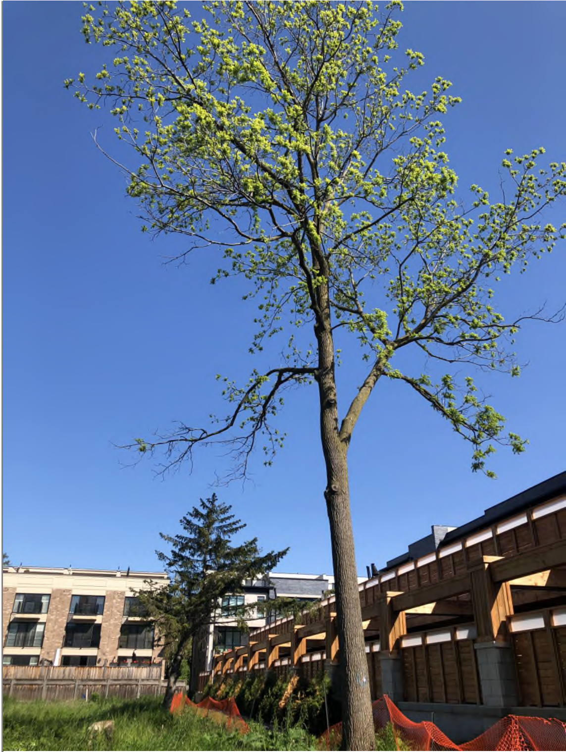
Photo #1: Tree no. 3 and 4 with non-regulated trees looking north.