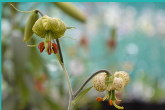
Lilium fragesi (Left) and Lilium majoense (Right)