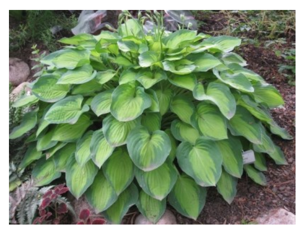
Hosta Sweet Home Chicago

Below is her list, in no particular order. The majority of the follow-