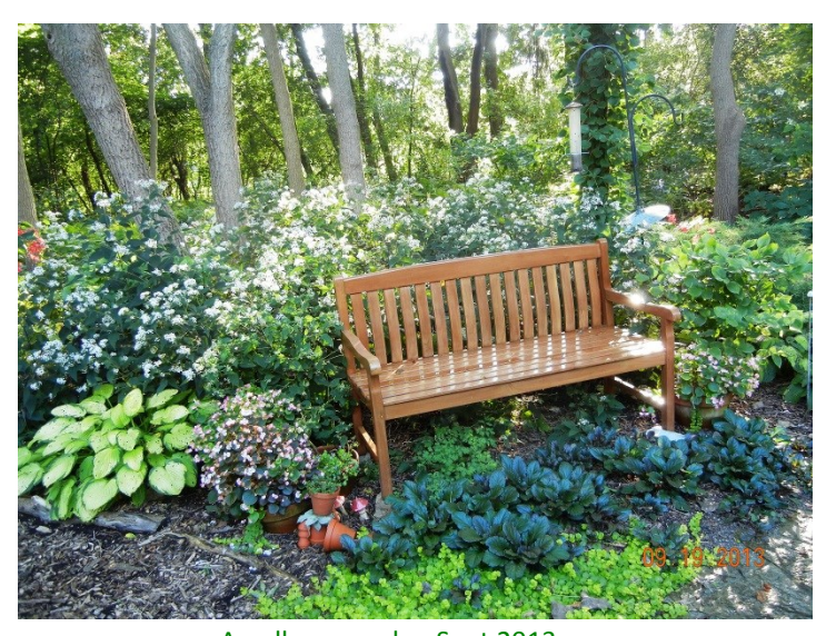
Asselborn garden Sept 2013.

The gathering will be from 1 till 4 pm at Judi & Ron Asselborn's in Campton Hills (just west of St Charles).