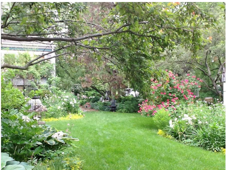
One of Tanner Musso's garden vistas.

Tanner spends winters searching for and making interesting garden accessories. She finds gardening is a never ending process; she frequently adds or edits features.