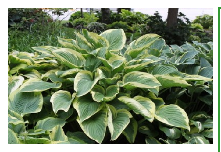
Hosta Victory, 2015 AHGA Hosta of the Year