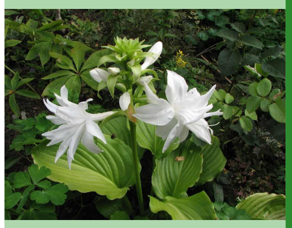
Hosta plantaginea Venus has sweetly scented, "twice-double" flowers.