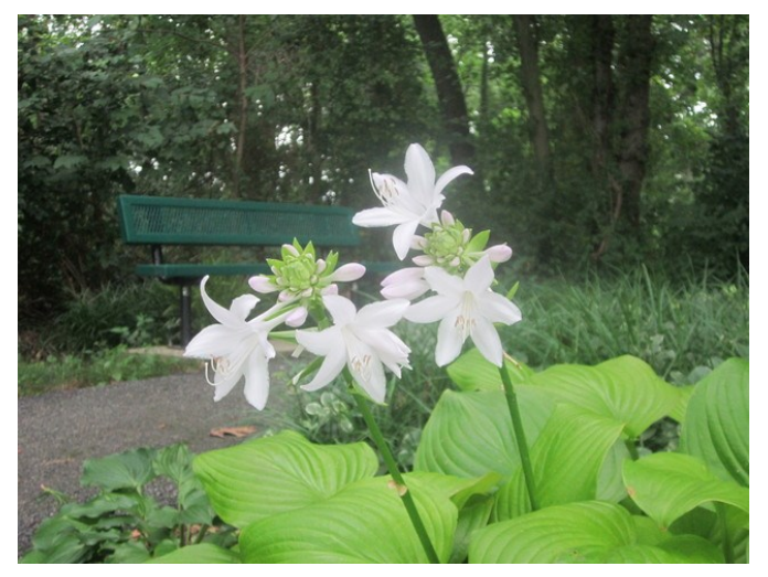
Hosta Fried Bananas in bloom

Protection: Watch for petiole rot. This fungus attacks the base of hosta petioles, secreting a substance that eats through the plant tissue causing the leaves to fall on the ground. This usually occurs in the first hot dry weather of the summer. Pull back mulch. Treat with 10% bleach solution immediately and retreat if necessary. There are also fungicides (e.g. Terrachlor) that can be applied. Oth-