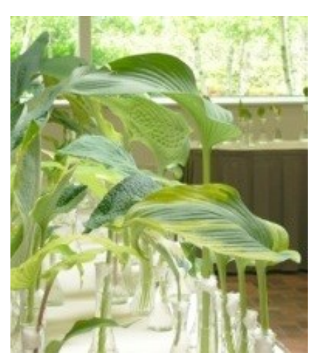
Some of the hostas leaves on display.