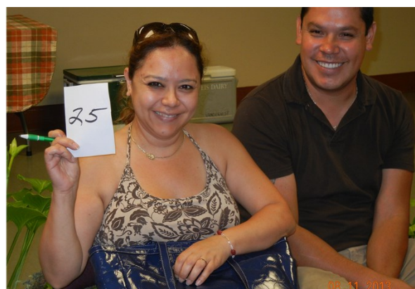
Happy winning bidders at the August 2013 Auction.