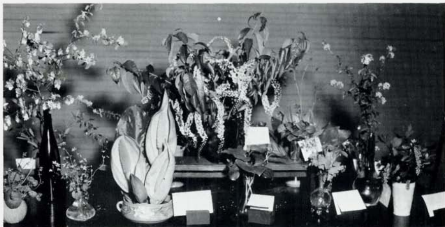
Displays are not crowded