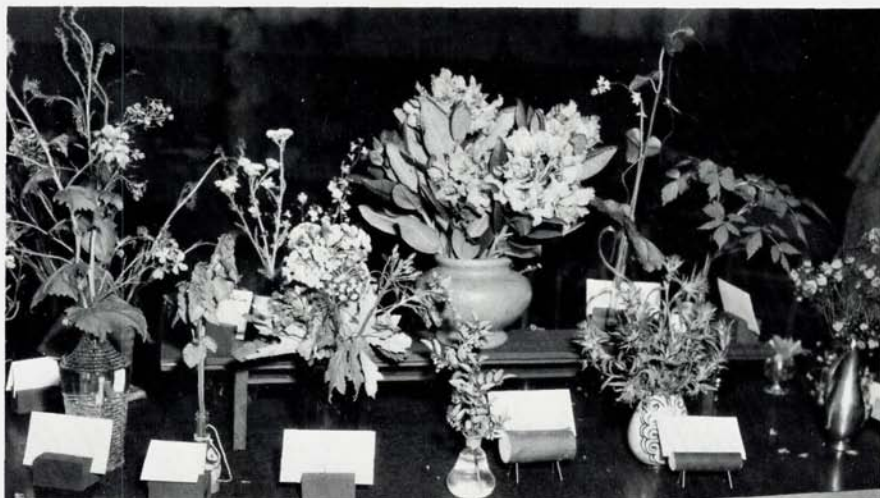
Displayed plants well labeled