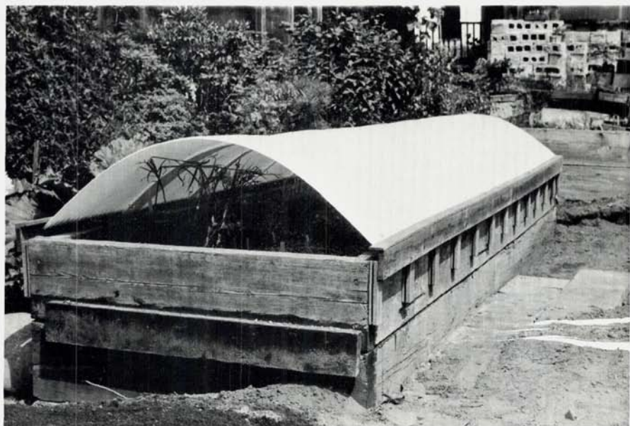
Bulb frame with panels in place

The frame itself is merely a big wooden box made of heavy planks nailed together. It can be made any length, in our case 14 ft., which happened to be the length of the available planks. The PVC panels are sold in a width of 26 inches and in varying lengths. We chose ten foot lengths and cut them in two (easy with scissors) to provide panels five feet long. The use of five foot panels requires that the overall width of the frame be about 54 inches in order to provide a suitable curvature when the panels are in place.