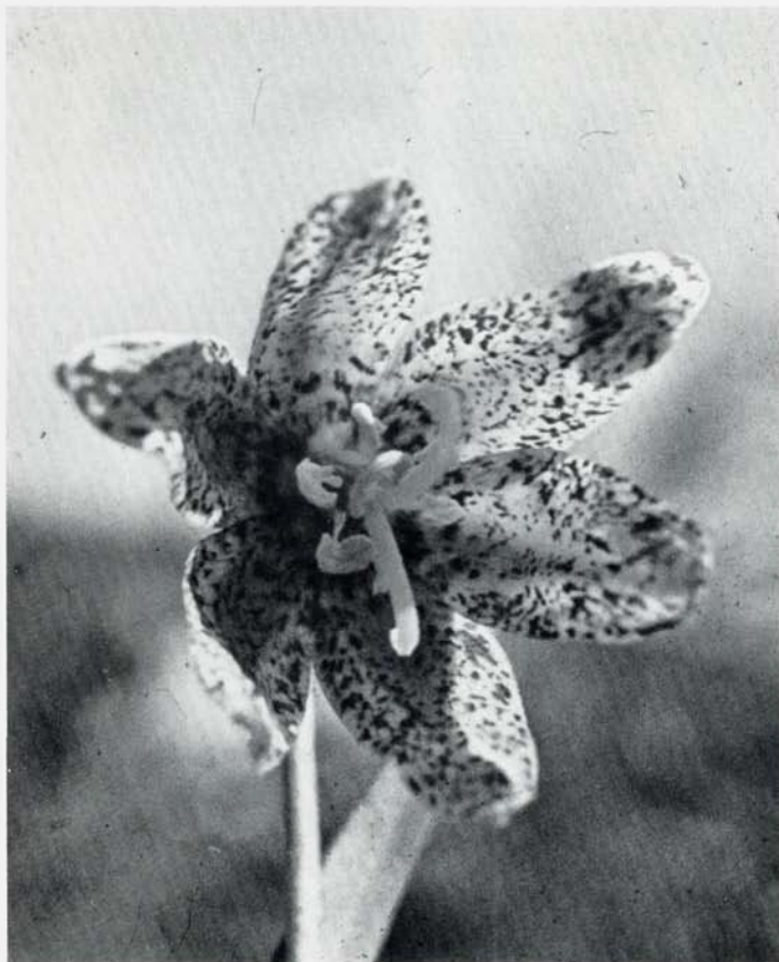
Fritillaria lanceolata from areas adjacent to Rough and Ready Botanical Wayside. Richard Boyd

Most years, the spring display of successively blooming species extends through April and May into June. Visitors should not expect the lavish masses of color to be encountered in the Southwest deserts; there are no cacti here, nor poppies; modesty characterizes most individual blooms. But even a casual car stop in the open flat, and examination of the terrain close by, is almost certain to amaze because of the great number of species and individuals growing in any square yard of what seems little more than a flattened rock pile.