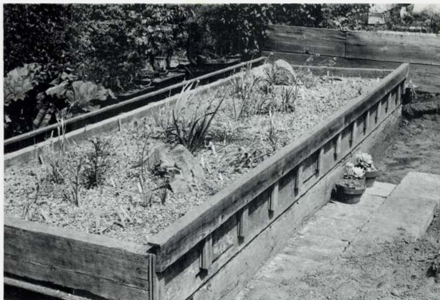
Bulb frame with plastic panels removed