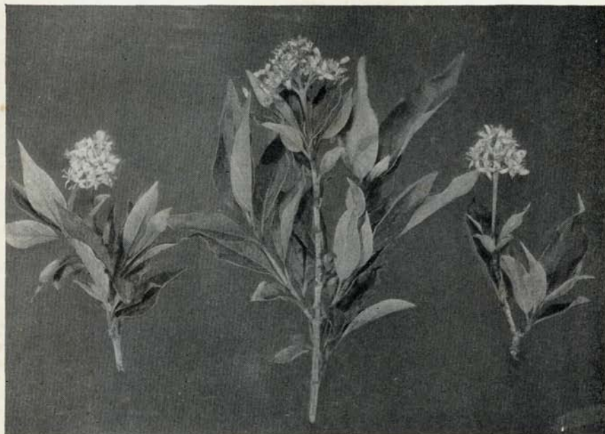
Cornus racemosa 'Slavin's Dwarf', a miniature form of what used to be known as Cornus paniculata .

an antibiotic medium for germination would seem desirable. In my own experience, however, rubbed sphagnum proved unsatisfactory, not preventing the damping off, and failing to provide the seedlings with nutriment for vigorous growth. At the season when the small seedlings demanded transplanting, I had no time to handle them.