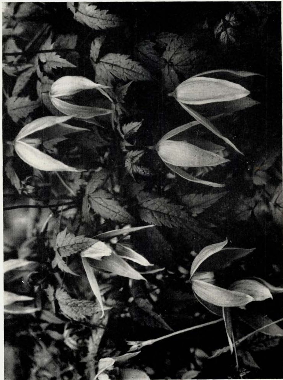
Clematis (Atragene) alpina var. sibirica