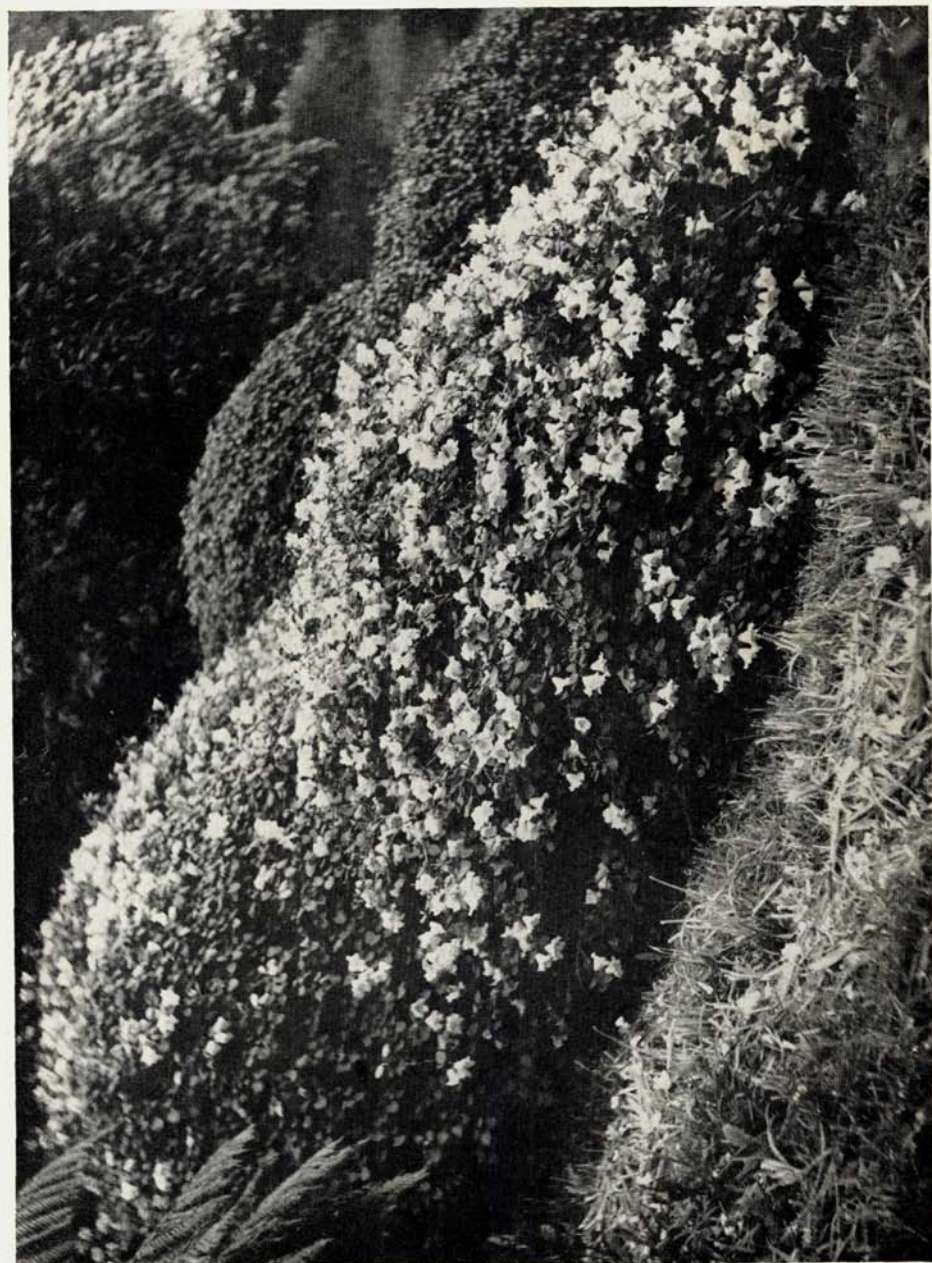
Rhododendron Williamstanum at its best in the south of England, Caerhays, Cornwall.