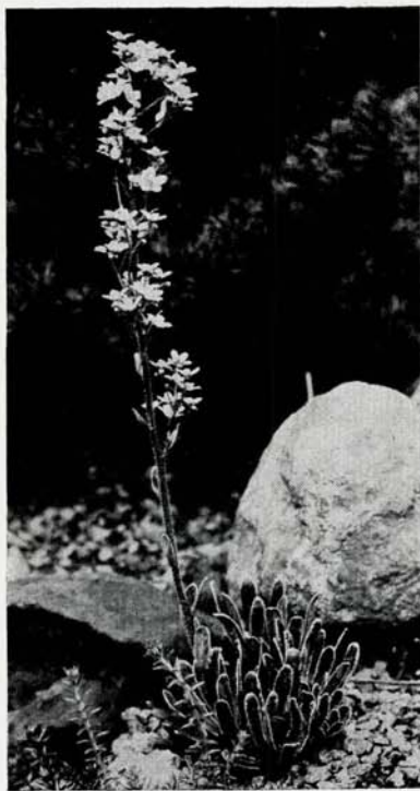
Saxifraga macnabiana

cordifolia ( Bergenia cordifolia ), the blue of Pulmonaria angustifolia and the blue and white of Omphalodes verna . The latter part of April, the parade of the Primulas begins and then my excitement grows, for the Primulas are among my favorite flowers. If one lives in these colder regions, he can enjoy a succession of them throughout the season. One of the first to bloom is Primula heleniae . Its velvety, burgundy-red is a welcomed addition to the color scheme, appearing while the blues of Scilla and Chionodoxa are still in effect. P. heleniae is followed very shortly by P. denticulata and later by P. sieboldii , which is one of the loveliest of them all. Along with the Primulas comes Anemone pulsatilla , which sends up its delicate lilac-lavender flower out of a downy mat, before the leaves have made any growth. Then, the green cushions of Draba turn bright yellow and very soon Iris pumila blossoms.