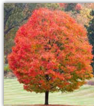
SUGAR MAPLE (FALL COLOR) (PAGE 10)