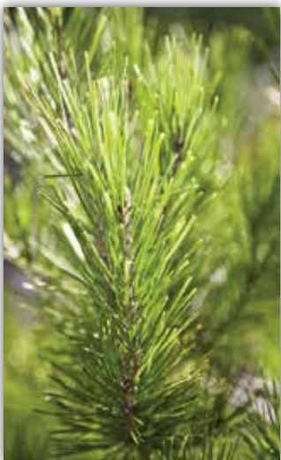
SPANISH SCOTCH PINE