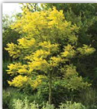
HONEYLOCUST (PAGE 9)