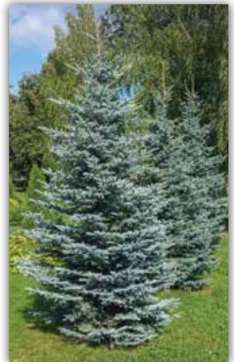
COLORADO BLUE SPRUCE