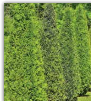
EMERALD GREEN PYRAMIDAL ARBORVITAE