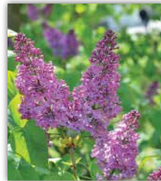
OLD FASHIONED LILAC