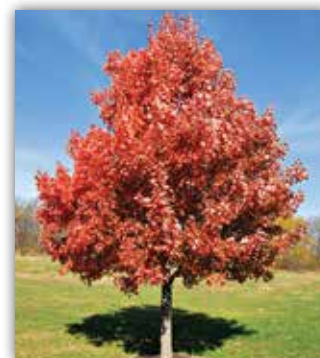
RED MAPLE (FALL COLOR)