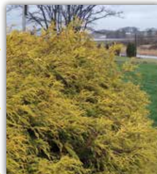
GOLD THREAD CYPRESS