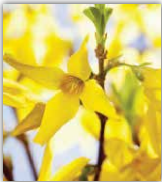
LYNWOOD GOLD FORSYTHIA

SWEET CRABAPPLE ☀️🌑 Malus coronaria • Zone 4-7 • Sometimes called Wild Sweet Crabapple. A deciduous tree with a short trunk and a wide spreading head of grayish branches. Height 20 to 30 feet with a spread of 15 to 25 feet. Quite adaptable to varying soil conditions. Prefers moist, well drained acidic soil. Well suited ornamental in the landscape, highway plantings, parks and public building areas. No shipments to CA, Canada.