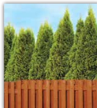
GREEN GIANT PYRAMIDAL ARBORVITAE