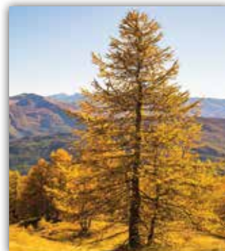
EASTERN LARCH (FALL COLOR)