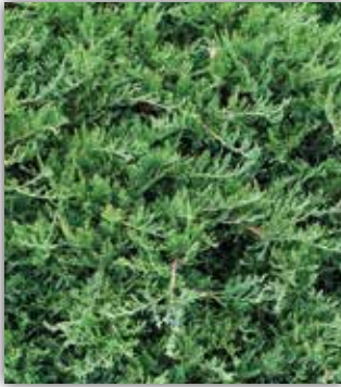
BLUE RUG JUNIPER

*BLUE RUG JUNIPER ☀️ Juniperus horizontalis 'Wiltonii' 'Blue Rug' • Zone 3-8 • This beautiful blue, creeping plant will grow to a spread of 6 to 8 feet or more and 4 to 6 inches in height. Rapid growing, extremely low juniper. Intense silvery-blue foliage assumes light purplish tinge in winter. Excellent as a ground cover.