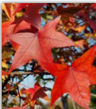
AMERICAN SWEETGUM (FALL COLOR)