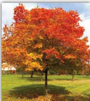
RED OAK (FALL COLOR) (PAGE 11)