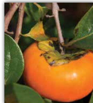
AMERICAN COMMON PERSIMMON