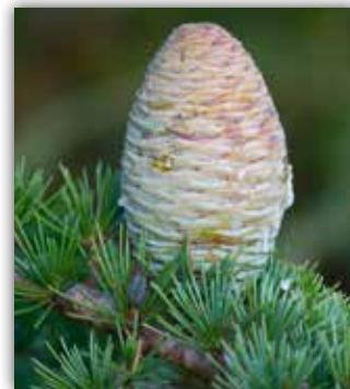
CEDAR OF LEBANON