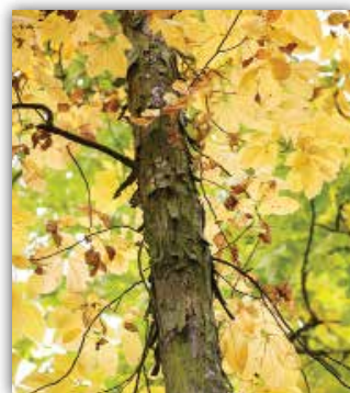
SHAGBARK HICKORY (FALL COLOR)(PAGE 9)