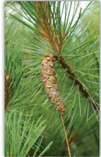
EASTERN WHITE PINE