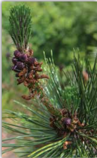
JAPANESE BLACK PINE

Each year we produce a variety of native conifer and hardwood seedlings and transplants along with ground covers, landscaping shrubs, perennials and ornamental grasses. We offer the broadest selection of plant material available from one nursery. Musser Forests grown plants are shipped throughout the entire United States.