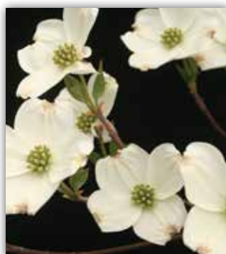
WHITE FLOWERING DOGWOOD (PAGE 8)

FOR ADDITIONAL PLANT INFORMATION VISIT OUR WEBSITE: