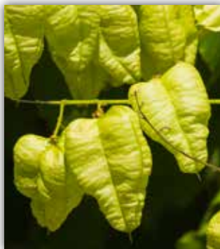
GOLDEN RAIN TREE

HYBRID POPLAR FOR FAST SHADE TREE ☀️ Imperial Carolina Populus deltoides x populus nigra • Zone 3-7 VERY FAST GROWING • Extremely fast growth to 80 feet. Crown spreads to 30 feet. Should grow 4 to 8 feet per year. Does not compete well with weeds and grasses. Planting site should be kept mowed and weed free. Plant 50 feet away from drains and sewers. This clone is disease and insect resistant.