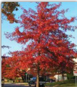
PIN OAK (FALL COLOR)