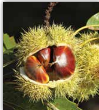
AMERICAN CHESTNUT (FALL)