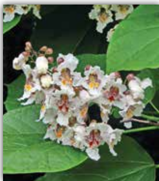
CATALPA (PAGE 7)

FOR ADDITIONAL PLANT INFORMATION VISIT OUR WEBSITE: