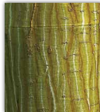
STRIPED MAPLE (PAGE 10)