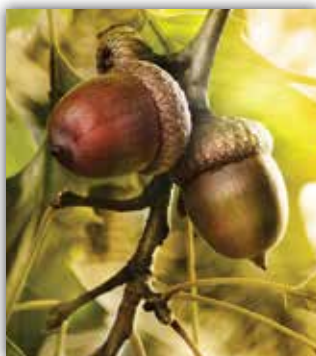
RED OAK ACORNS (FALL) (PAGE 11)