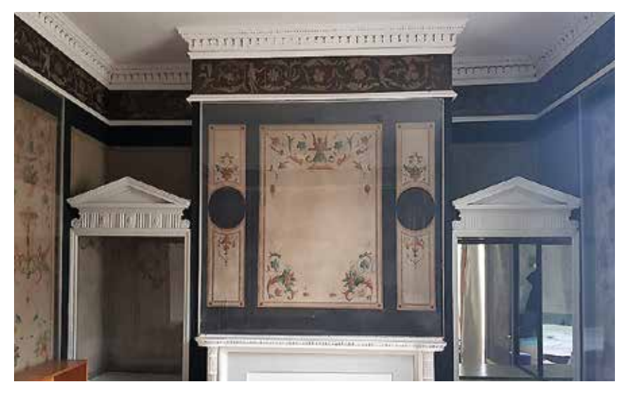
The Tapestry Room