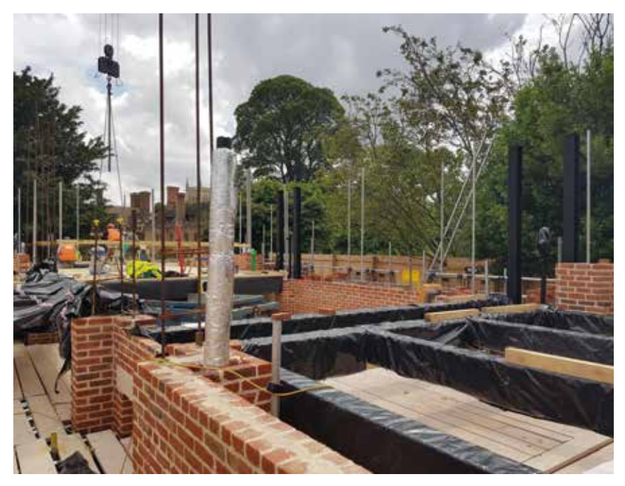
The New Library Building in July 2019