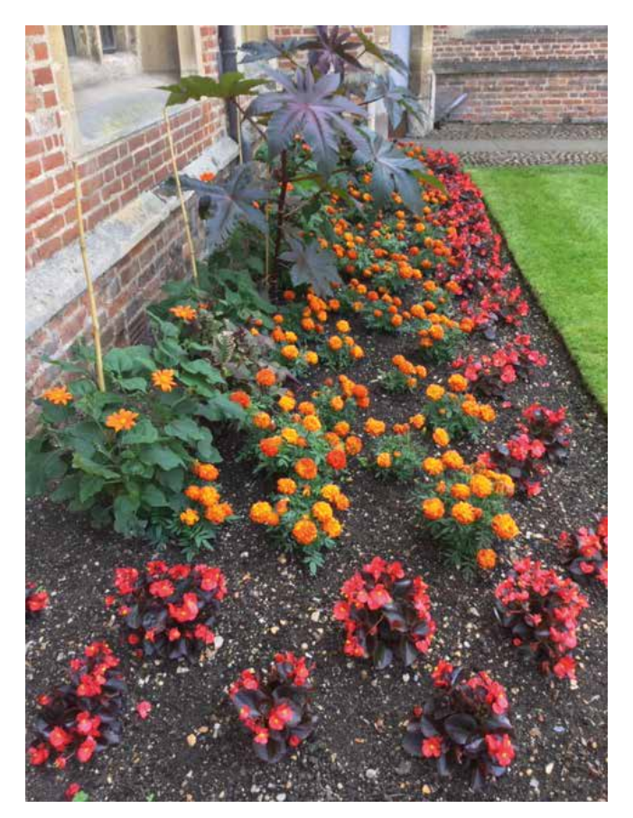
Summer display in First Court