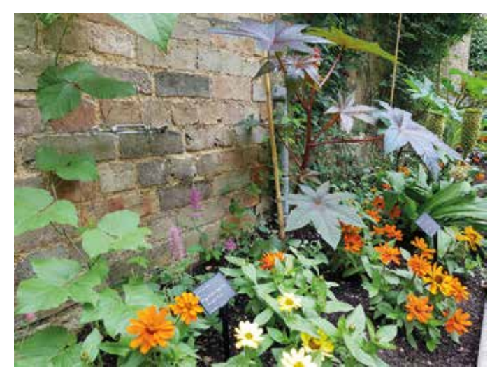
Outside Benson Hall