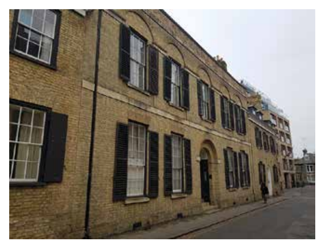
30 Thompson's Lane with the annexe at No 31 on left

This rather grand College house has many fine architectural mouldings and decorative features. On the first floor, Room 13 is impressive, with its richly decorated fireplacesurround, niches and friezes. Opposite, Room 14, which also looks out onto Thompson's Lane, is even more remarkable. It is a bed-sitting room, not particularly large, having been intended as a bedroom, but of spectacular, though often mysterious, interest to its occupants, on account of the beautifully painted panels all round it, frescoes of tapestry designs, protected by huge sheets of perspex. Distorted reflections are complemented by mirrored alcoves beneath carved wooden canopies. How does the College come to have such an extraordinary room available to students?