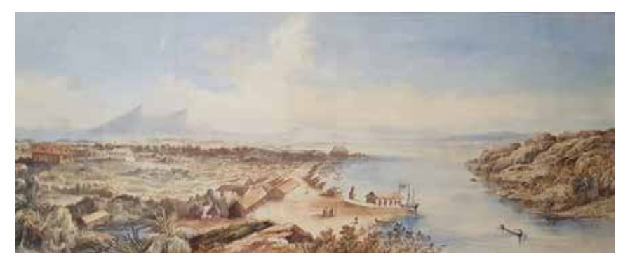
Kuching, Sarawak This painting hangs in the Brooke Gallery in the College Library.