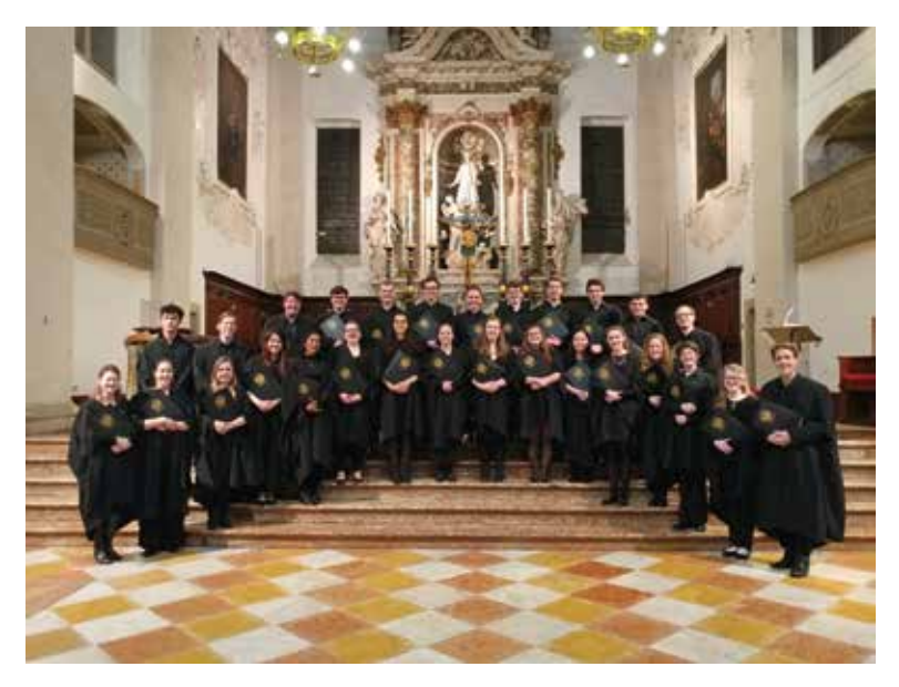
The Choir in the Church of Santa Maria Assunta, Arco, Trentino, Italy

Our work in Chapel and beyond brings joy to the lives of our singers and audiences, and is a very visible sign of the College's place in the world.