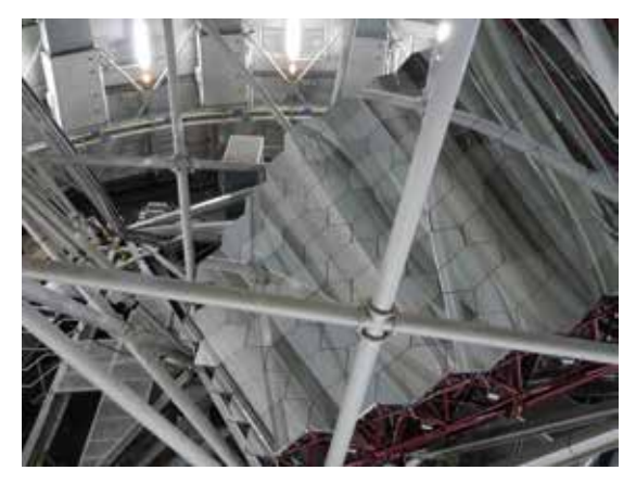
Interior of Southern Large Telescope with section of 11m lattice mirror

Then, in an interesting leap of the imagination, Mbeki proceeded to draw a direct connection between the cosmic potential of SALT and a new visitor centre at Maropeng – Setswana for'the place where we once lived'. Maropeng sits at the centre of a 'vast paleontogical storehouse' west of Johannesburg which has been proclaimed a Unesco World Heritage site on account of its extraordinary collection of hominid fossils. For Mbeki, this repository was living proof that 'our country is the Cradle of Humanity': for South Africans, as human beings, it was therefore appropriate 'to continue the search for the origins of the infinite beginnings of the universe ... in the very geographic space that gave birth to homo sapiens'.<sup>4</sup>