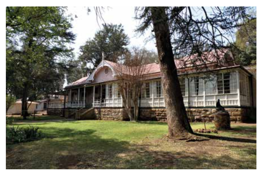
Doornkloof farm, Irene, nr Pretoria. Jan Smuts built his home from a prefabricated Boer War British officer's mess used by Lord Kitchener, and originally used in India. The Royal Family visited Doornkloof in 1947.

In respect of human palaeontology, Smuts was highly receptive to the significance of Australopithecus . He hastened to congratulate Dart on an 'epoch-making discovery', assuring him that it 'reflects lustre on all South Africa'.<sup>10</sup> Without giving unequivocal support to Dart in his formal address, Smuts cited Darwin to suggest that Africa might turn out to be the `cradle of mankind'. Considered together with other recent fossil finds there was accumulating evidence that South Africa might `become the Mecca of Human Palaeontology'.<sup>11</sup>