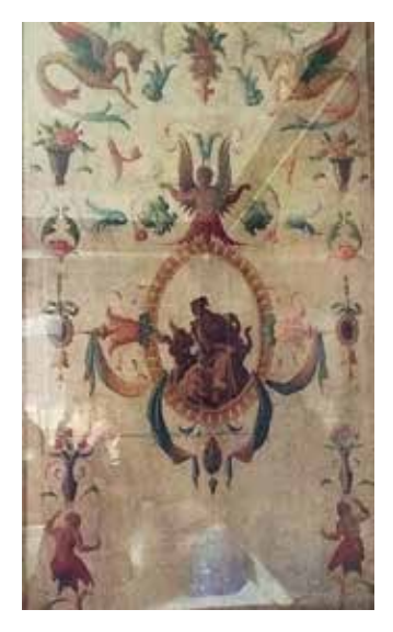
Panel to right of window, 6'6" x 3'0