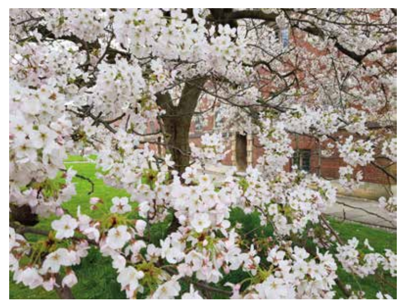
Prunus avium 'Plena' in Benson Court

pendulous masses of the purest white blossom, buzzing with bees. Its beauty – together with the cherries along River Court – wowed large numbers of visitors from the Far East.