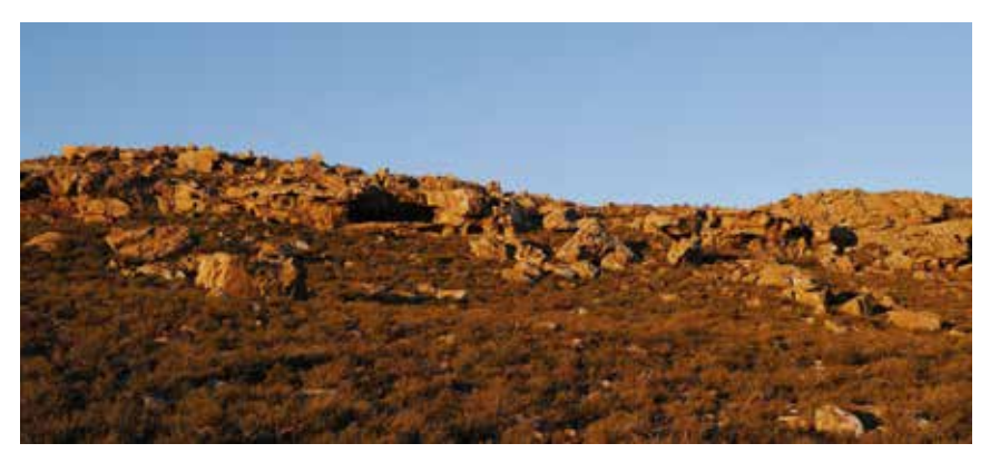
Sutherland, Karoo, home of astronomy and repository of ancient therapsid fossils

Whether in fact the developmental promises transpire into reality is moot. The Karoo, where the SKA is sited, is not a pristine area of semi-desert, as proponents as many accounts claim. It has been populated from the beginnings of human time and it has long been a site of contestation over land. Locals seem to have been led to believe that Square Kilometre Array meant an area of around 1sq km. In fact, the core site, extending over 130,000 square kilometres, threatens to impose heavy restrictions on human activity and agricultural use. Mobile phones and other devices emitting radio waves may interfere with the telescope's operation. A battle of resources based on bandwidth frequency thus threatens to pit the needs of global science against the interests of local communities.