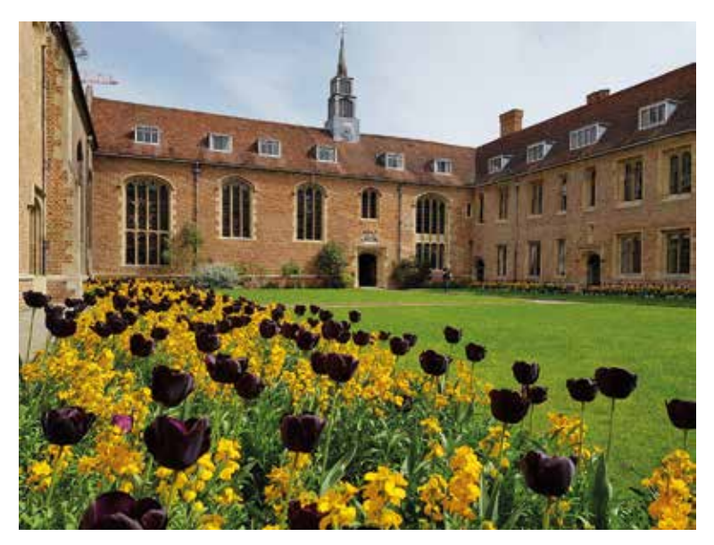
First Court in April

College was particularly colourful in late spring this year. First Court smelt and looked wonderful, planted with primrose wallflowers with the magnificent dark velvet tulip 'Paul Scherer' pushing through in late April.