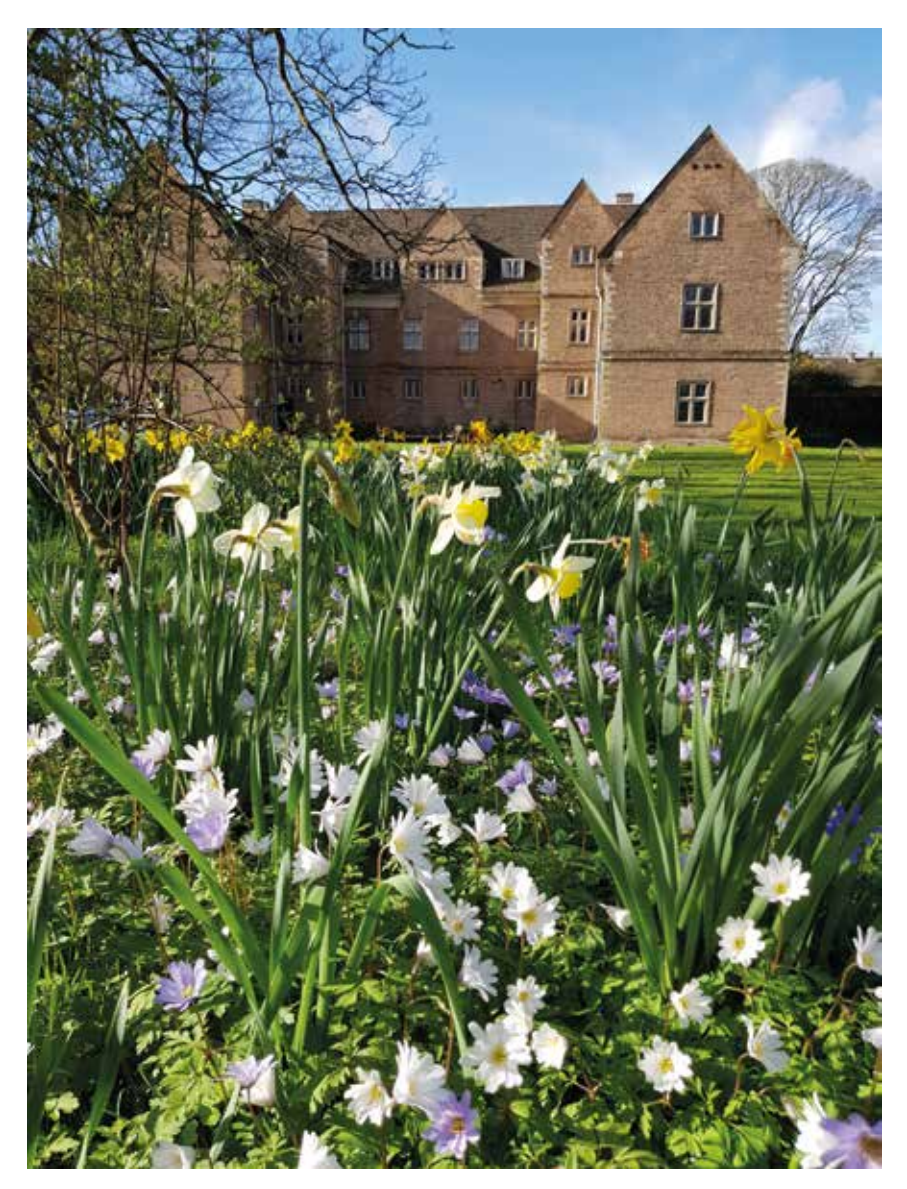
Spring in the Fellows' Garden