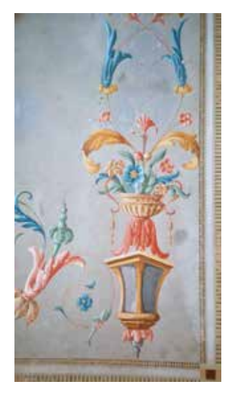
Bottom right of main panel (west wall)