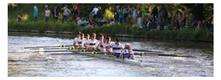
Grassy Corner on the River Cam

The chilly Lent Term racing culminated in five exciting days of Bumps with brave performances from all four of our boats. We were disappointed by missing near bumps, elated by avoiding a near bump and exhausted by some daring row-overs. All teams grew in strength and character and in May were joined by returning university trialists and the few 'fair weather' rowers.