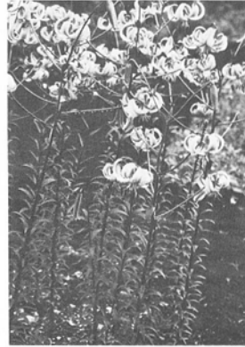
'Southern Belles', L. lankongense × an upright pink and white Asiatic.

with virus. Some of the clones are more tolerant than others; virus symptoms include leaf mottle, reduced stature, smaller flowers, and narrow tepals. With medium-sized out- to down-facing dusty mauvish rose flowers, delicately scented, the Southern Belles are like a more robust form of the species. Some of them show odd chromosome numbers, but even the diploids show low fertility. Occasionally they will set normal seed; more seeds can be produced by embryo-culturing. In 1982 and 1983, the first of many second-generation seedlings flowered; and these have retained the grace, the delicate coloring (some in deeper intensity), and the unusual marbled spotting of L. lankongense . We hope that they will show greater virus tolerance. We are in the process of assaying and testing L. lankongense hybrids for tolerance to specific viruses, since the "Southern Belles" seem to be highly tolerant of some viruses but not of others.