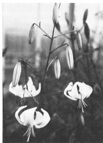
'Albipayne' × L218 hybrid — as fragrant and early as L. pumilum with truly white flowers.