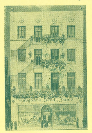
Chicago loop store at 10 W. Randolph street near State.

C INCE its foundation this firm has specialized in flower seeds, flowering bulbs, and plants, for amateur gardeners, florists, and professional gardeners; lawn seeds of the best quality for parks, golf clubs, and home lawns; and vegetable seeds of the finest strains for market and home gardens.