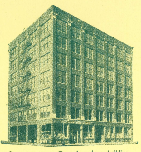
Seven story store, office and warehouse building at Jackson Boulevard and Jefferson street, containing 60,000 square feet.

This house is the largest producer of gladiolus bulbs in the United States, operating extensive farms for this purpose at Ovid, Mich. and Anna, Ill. Visitors are welcomed during the flowering season from July 15 to October 1 at our Michigan farms, on Michigan