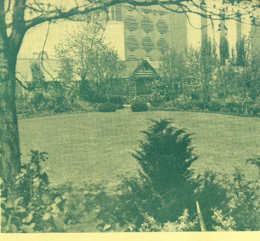
Looking across the open lawn from a seat under the pergola in the late afternoon, when the shadows are long. Details of the interesting planting are found in the alphabetical list of all plant material used.

Jean Treadway, Large light pink, dark pink centers. 3 for $1.00. Gold Lace, Deep yellow single. 3 for $1.00. COREOPSIS, Mayfield Giant, Taller, larger flowers. Pkt. 25c.