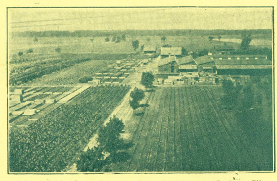
View of Vaughan's Nursery Grounds, Western Springs, Ill.

Maple Leaf Giant and Swiss Giant Pansies, Dwarf California Giant Petunias, Ceylon Court Snapdragon, Midget Zinnias, Sunshine Asters. Bush Balsam. Gladiolus Cadillac, Rosa Raisa, Tawny, Dear-born, Rhapsody in Blue. Cucumber Mandarin and The Vaughan Mil-waukee Market Melon. PeTsai Chinese Cab-bages, Disease Resistant Cabbages, Tomatoes and Sweet Corn. King Egg Plant.