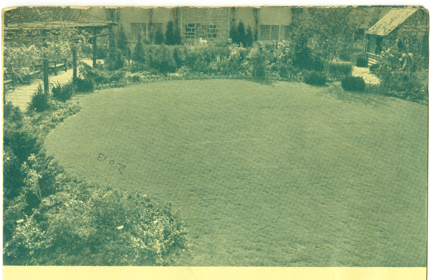
View of Vaughan's Seed Store's Home Garden, demonstrating a simple design and planting suitable for the usual rectangular back yard. The area covered is approximately 85 feet square.