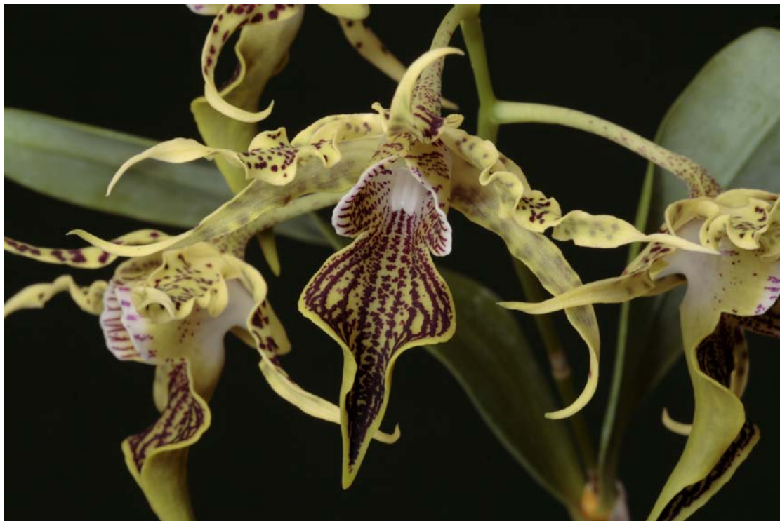
Dendrobium alexandrae Schltr.