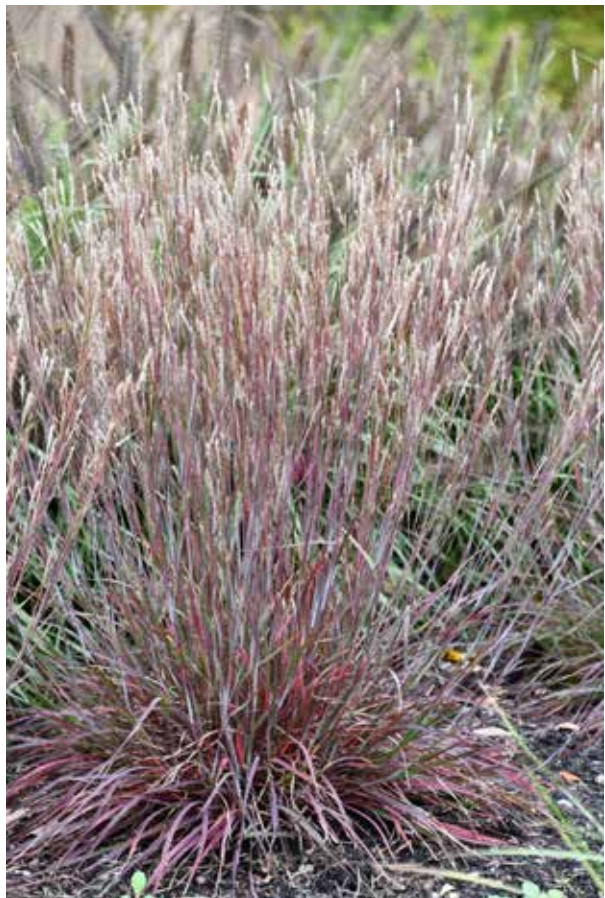
Schizachyrium scoparium 'Red Fox' PPAF (2023 Sneak Peak)