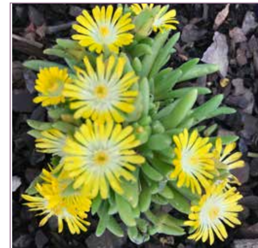
Delosperma x Mountain Dew PP#31,543