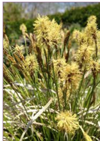
Carex pensylvanica Straw Hat PP#29,432