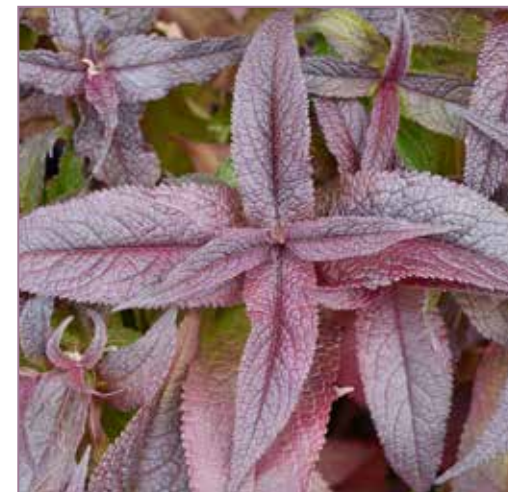
Echinacea x Blind Date PPAF