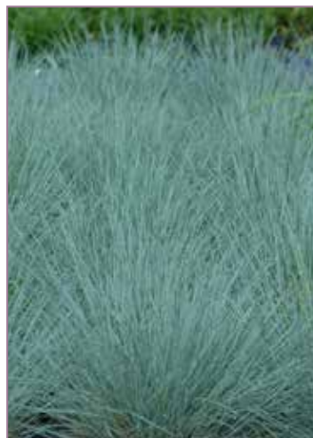
Festuca x Cool as Ice PP#27,651