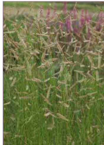
Bouteloua gracilis Honeycomb PP#33,101