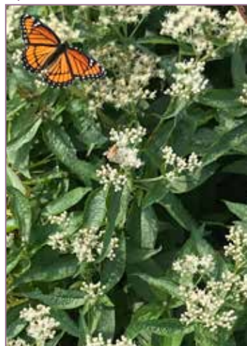
Eupatorium x Polished Brass