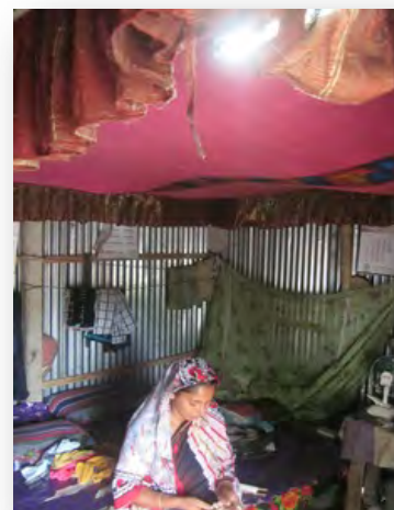
Fig 5.1.3 Rupali sewing in solar-powered light at night

The village Khowamuri is now well along the path of sustainable and environment friendly development.