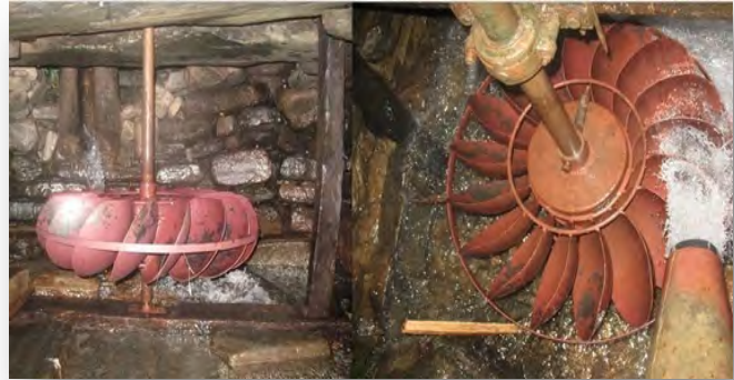
Fig 5.4.4 Improved water mill

The Improved Water Mill technology complements the essence of the eco-village development concept. Not only is it a source of clean energy, it also has cobenefits that can enhance rural livelihoods. It is ideal for the hilly terrain of Nepal, which has plenty of water resources and enough height for the system to work. Over the last few decades, many changes have been made to the technology, making it more efficient, time-saving, and versatile in use. The Center for Rural Technology, Nepal (CRT/N) has implemented an enhanced version of the technology, known as the Improved Water Mill Electrification (IWME) system. This is being used for rural community electrification and to integrate micro-enterprises that use electricity generated from IWM. Importantly, much training on income-generation solutions is also integrated into the programme.