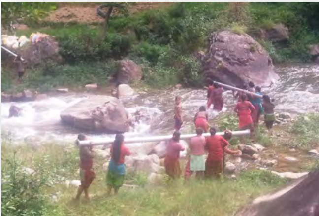
Fig 5.4.2 Women's contribution towards the implementation of the hydram project

The collective impact of this development has been felt the most in the status of women in the Nepalese community at Sanigaun-5, Balthali. Not only has the project improved women's communication skills, it also has given them greater confidence, leadership, and decision-making capacities.