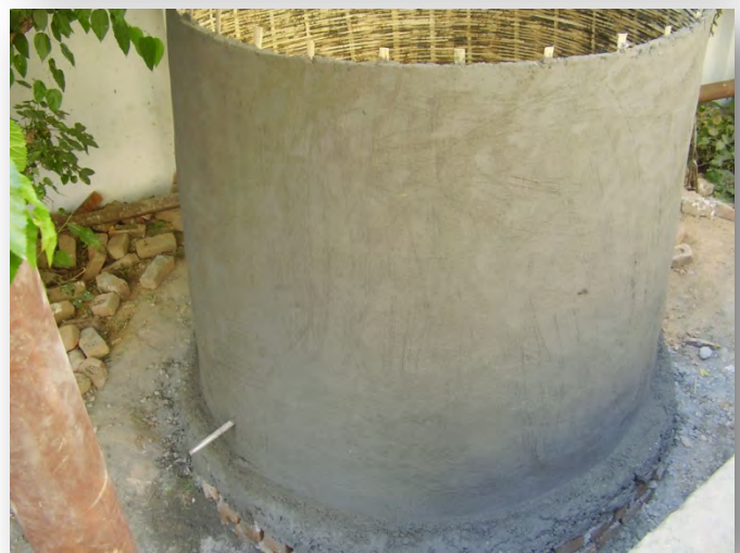
Fig 5.2.6.1 and Fig. 5.2.6.2 Bamboo-cement based rain water storage tank under construction