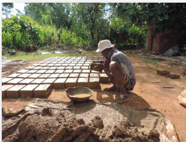
Fig 5.3.1 Dharmaratne making bricks with rice husk brick mixture

IDEA trained Mr. Dharmaratne in making a brick mixture using rice husk. They also shared with him a technique for better brick-kiln stacking, leading to a more efficient production process, and taught him brick-firing processes using rice husk. They first collected and analyzed clay samples from the area where Dharmaratne collected brick-making clay. After determining the mix of clay, sawdust, and/or paddy husk in the clay, IDEA experimented with various mixtures of clay and rice husk to compare them for quality and feel. They then trained him on the ideal mixture to use. IDEA helped Dharmaratne to upgrade his kiln from the inefficient, fuel-intensive, and wasteful temporary kiln that he was using to a permanent brick kiln. This new kiln has permanently constructed walls at three sides, a roof, and three firewood openings. Importantly, both firewood and rice husk can be used as firing fuels. This kiln also has additional firing channels. With the upgraded procedures, the stacking of bricks inside the kiln is done systematically with interlayer gaps to be filled with paddy husk to improve the heat circulation and to get the maximum heat benefit. The improvements in the brick kilns has reduced the consumption of firewood substantially, creating additional economic benefits for brickmakers such as Dharmaratne while also reducing tree-felling for firewood. This, in turn, has eliminated