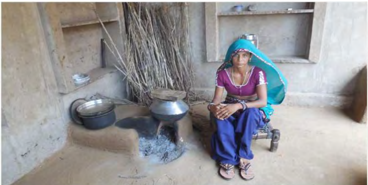
Fig 1.1 Traditional wood-fired cookstove in rural India

1.56 billion people in South Asia struggle for access to energy, sanitation, safe drinking water, nutrition, and health services (UNDP, 2014). Climate change makes the situation grimmer, since by the 2050s it could decrease the cultivation area of high-yielding wheat by 50% due to heat stress in the Indo-Gangetic plains. This can have severe effects on food-crop productivity by affecting the rice-growing regions of India and Bangladesh, which are also affected by inundation from rising sea-levels. The yields of maize and sorghum, grains commonly consumed by the poor, also could decrease by 16% and 11%, respectively. This could spell trouble for South Asian countries, which have a massive responsibility to eradicate multi-dimensional poverty and to safeguard extremely vulnerable populations from the catastrophic effects of climate change.