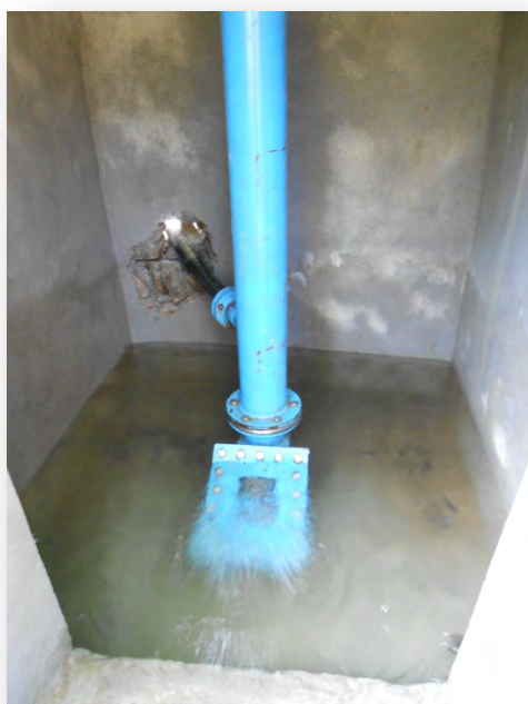
Fig 5.4.1 Hydrum