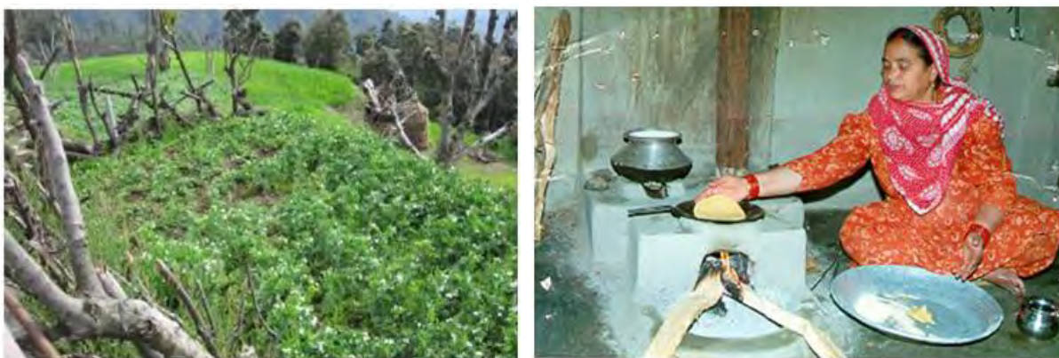
Fig 2.1 Smokeless Stoves and Organic Gardening are part of the Eco-Village Development Concept

The Eco-Village Development concept involves the implementation at village-level of appropriate, inexpensive renewable-energy technology (RET) and capacity-building activities for climate-change adaptation and mitigation. It takes a collaborative approach by involving community members deeply in planning and implementation, while also giving them the tools to be resilient while facing climate change. EVD is an integrated approach of creating development-focused, low-carbon communities of practice in existing villages. The bundle of practices includes mitigation technologies like small, household-sized biogas plants, smokeless stoves, solar-energy technology, improved water mills to generate electric power, stand-alone systems like pico-/micro-hydro power for rural electrification, and solar-powered drying units. It also includes adaptation technologies such as organic farming, roof-water harvesting, water-lifting technologies like hydraulic ram pumps, and other solutions.