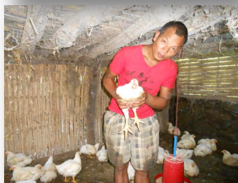
Fig 5.4.5 and 5.4.6 IWMEChicken houses and Chicken Man