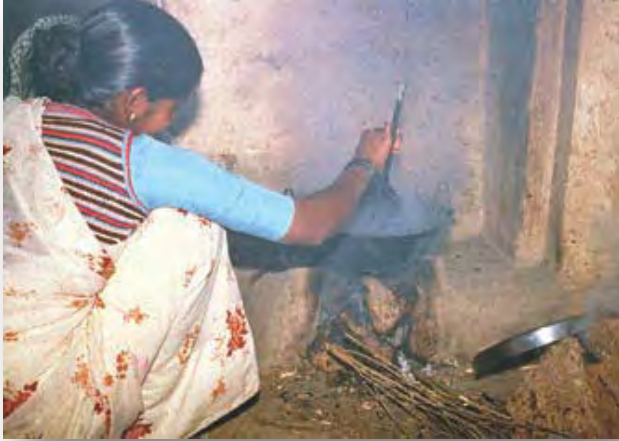
Fig 4.5. Cooking on 3-stone

Women cooking in the smoky kitchen said: