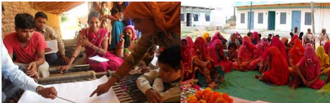
Fig 2.3 Active participation of villagers in project development in India

The key to success for any development project is the active participation of local communities, sub-communities, and rural households.