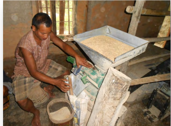
Fig 5.4.7 Paddy processing in rice huller

The processing speed of IWME is similar to that of a diesel mill, which is two Muri of paddy/hour. The presence of an IWME system in the community has led to reduction of the use of fossil fuel to process agro-products, which means the emissions associated with the agro-sector have also been reduced through use of the improved water mill. From the mill owner's perspective, he will no longer need to travel to the city center to buy diesel at a cost of 115 Rs/liter. Not having to fetch diesel fuel has been a relief to the owner, as it has enabled him to save the time and energy spent on