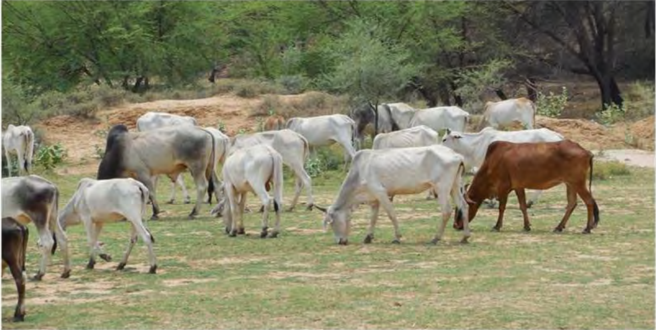
Fig 1.2 Potential for Biogas Energy

On the basis of Purchasing Power Parity (PPP), South Asia energy intensity is lower than the world average, including the United States and China. Energy intensity is based on commercial fuels. These low numbers also reflect a high proportion of non-commercial energy, e.g., traditional biomass, etc.