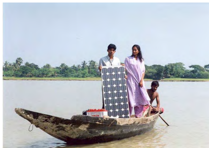
Fig 1.3 Solar Technology for Island Dwellers in Bangladesh

These challenges can be met by increasing energy efficiency through innovations in technology and processes, as well as by increased use of renewable energy, resulting in lower emission increases and eventually, in emission reductions.