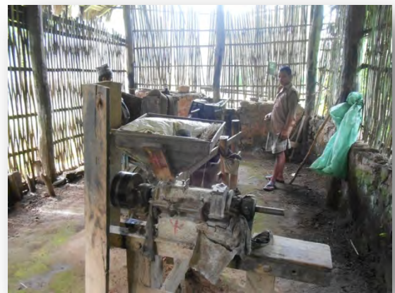
Fig 5.4.8 Rice huller integrated with IWME