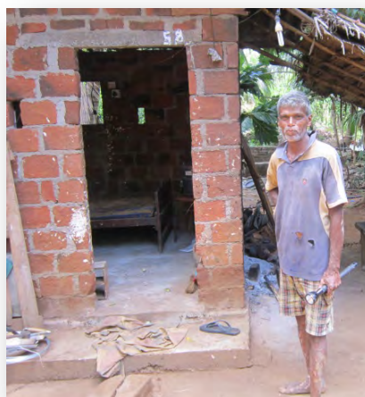
Fig 4.4.2 Dharmaratne

There is immense potential for replacing conventional materials with bio-waste for many small and medium-scale industries in Sri Lanka.