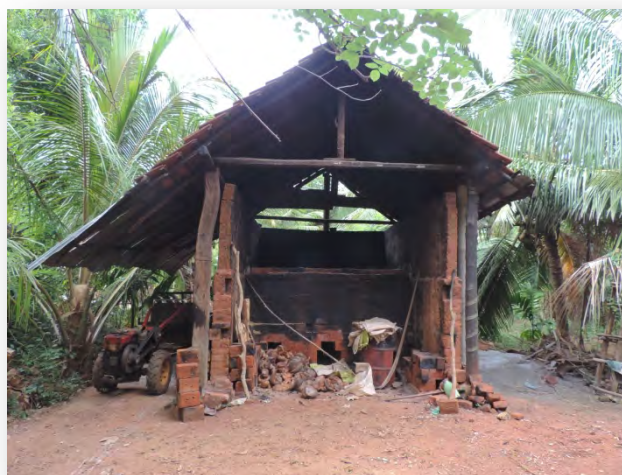
Fig 5.3.2 Dharmaratne's improved and permanent brick kiln