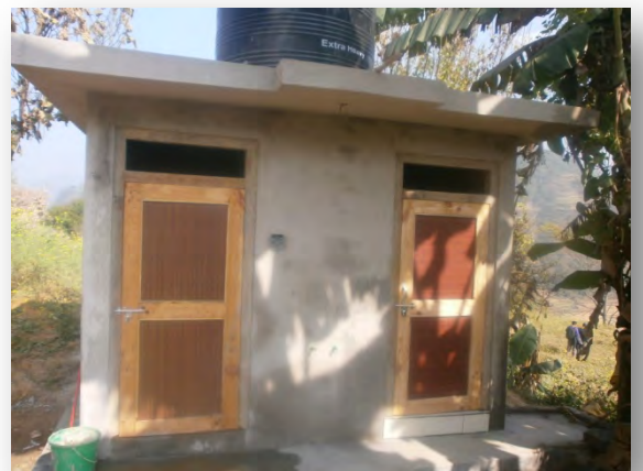
Fig 5.4.3 Toilet and water tank built after Hydram installation