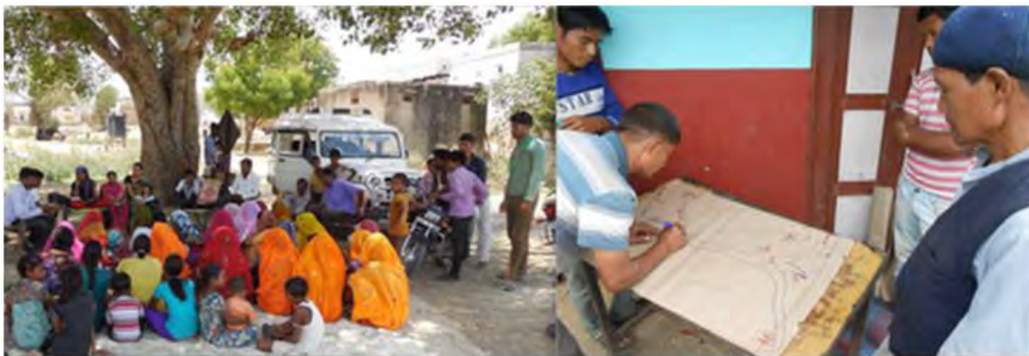
Fig 3.1 Villagers meeting and roadmap planning for policy makers