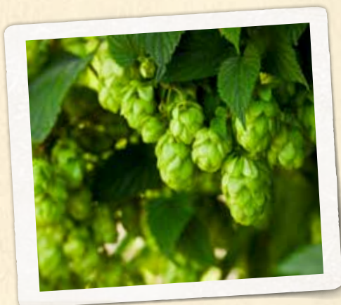
HOPS ~ Humulus Lupulus