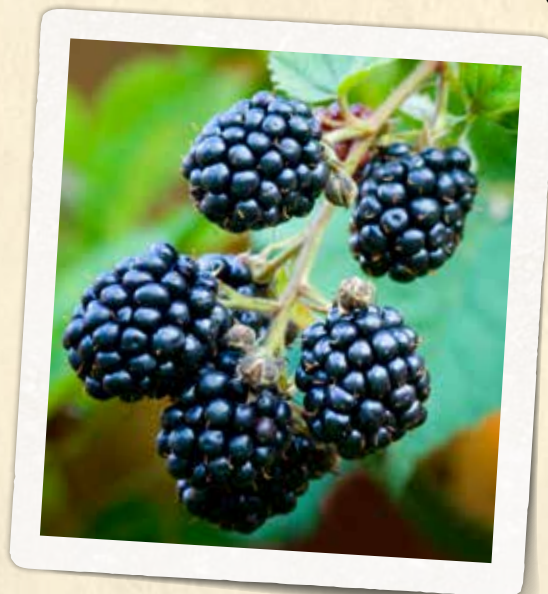
BLACKBERRY ~ Triple Crown