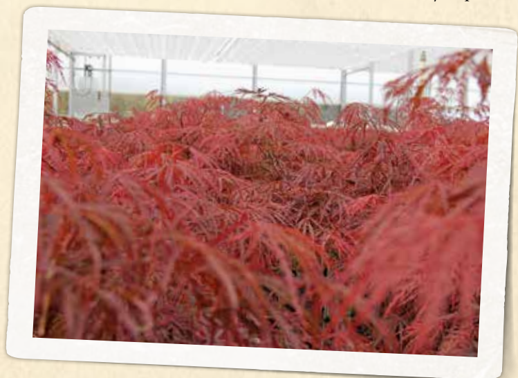
ACER PALMATUM ~ Crimson Queen