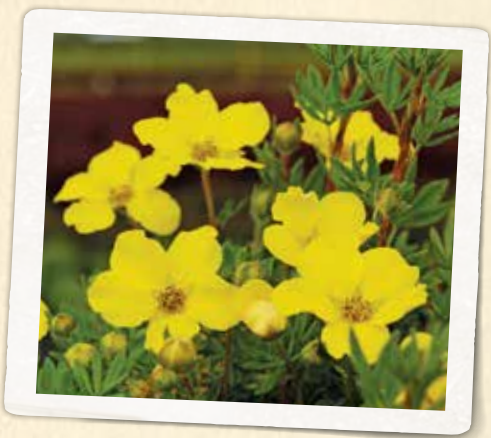
POTENTILLA ~ Gold Finger