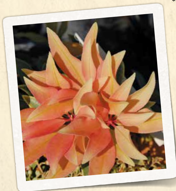
PIERIS JAPONICA ~ Mountain Fire