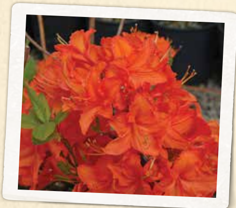
RHODODENDRON ~ Aglo Weston