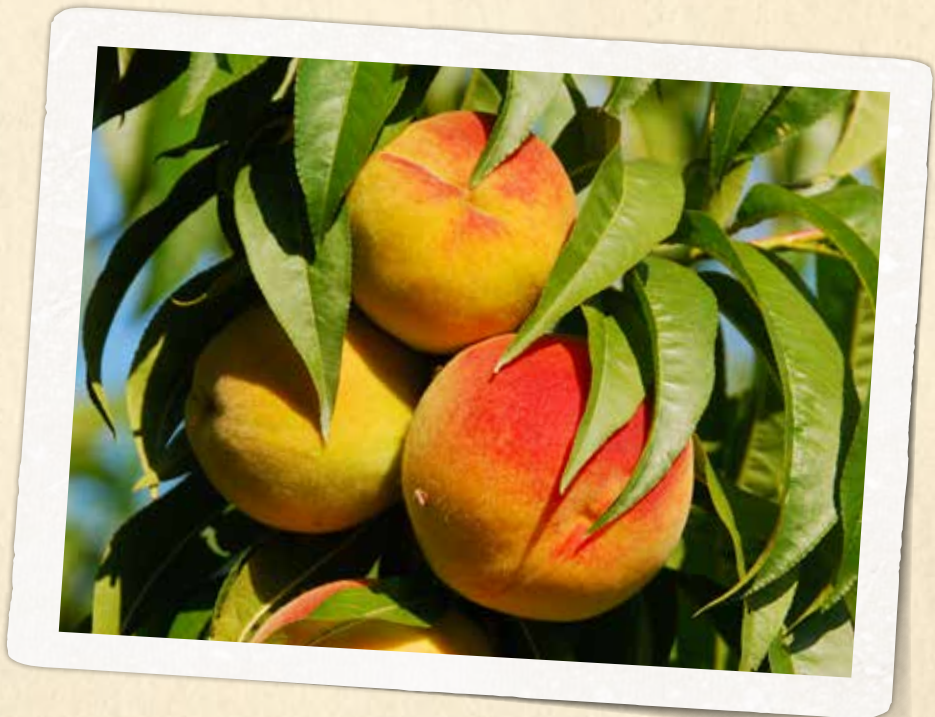
PEACH ~ Elberta