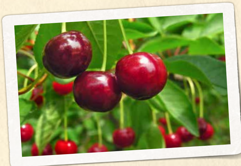
CHERRY ~ Bing