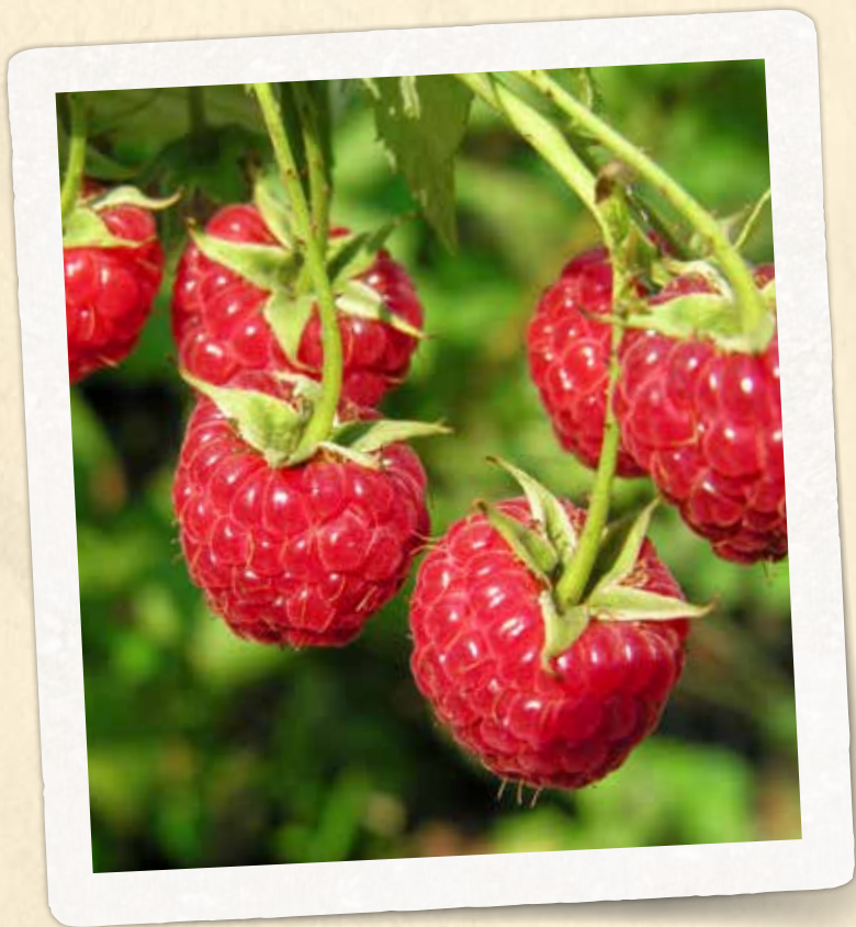
RASPBERRY ~ Heritage