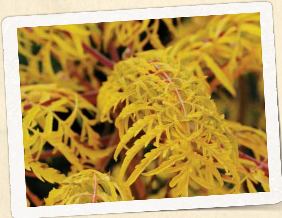
RHUS TYPHINA ~ Bailtiger (Tiger Eyes®)