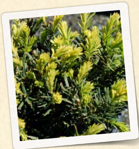
TAXUS MEDIA ~ Dark Green Spreader