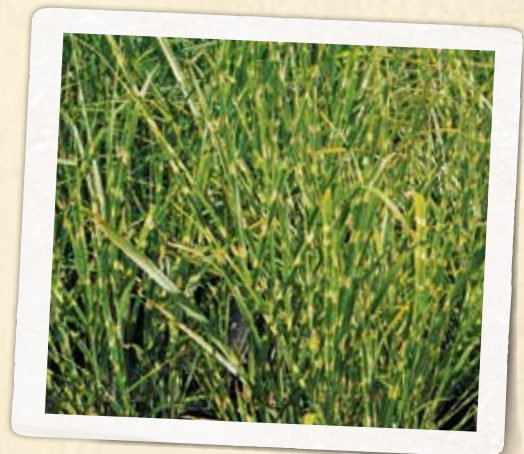
MISCANTHUS SINESIS ~ Strictus