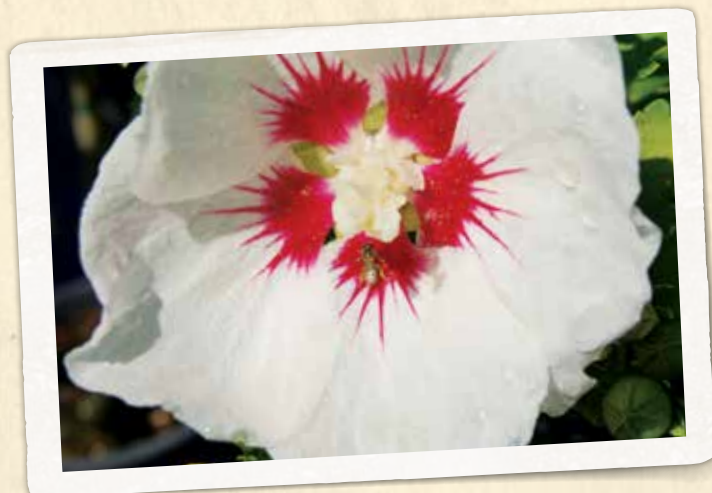
HIBISCUS SYRIACUS ~ Red Heart