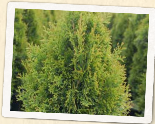
THUJA OCCIDENTALIS ~ Smaragd