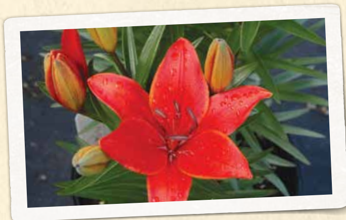
LILIUM ASIATIC ~ Tiny Ghost