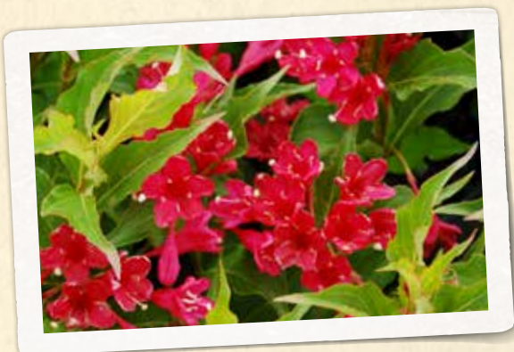
WEIGELA FLORIDA ~ Red Prince