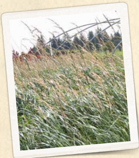
CALAMAGROSTIS ACUTIFLORA ~ Karl Foerster