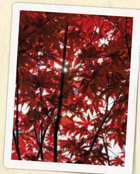
ACER PALMATUM ~ Bloodgood