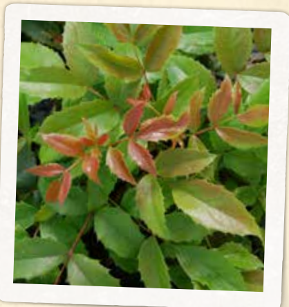
MAHONIA AQUIFOLIUM ~ Compacta