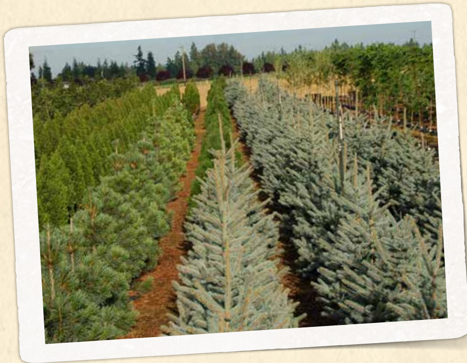
GRAFTED CONIFERS IN POT-N-POT